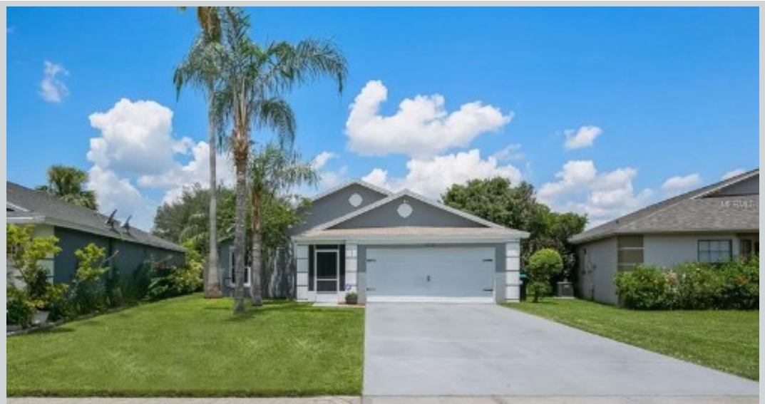
Sold Comp 2 3019 Woolridge Dr