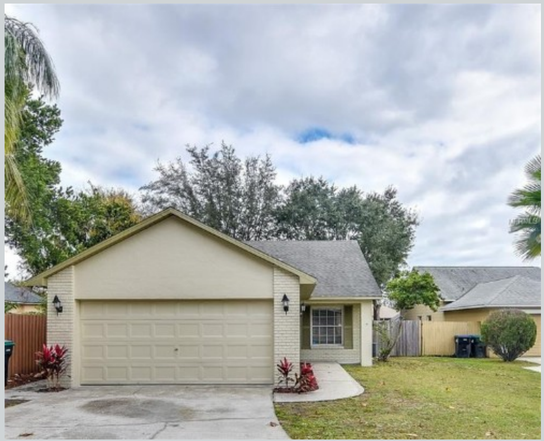
Listing Comp 3 11701 Cuxham Dr