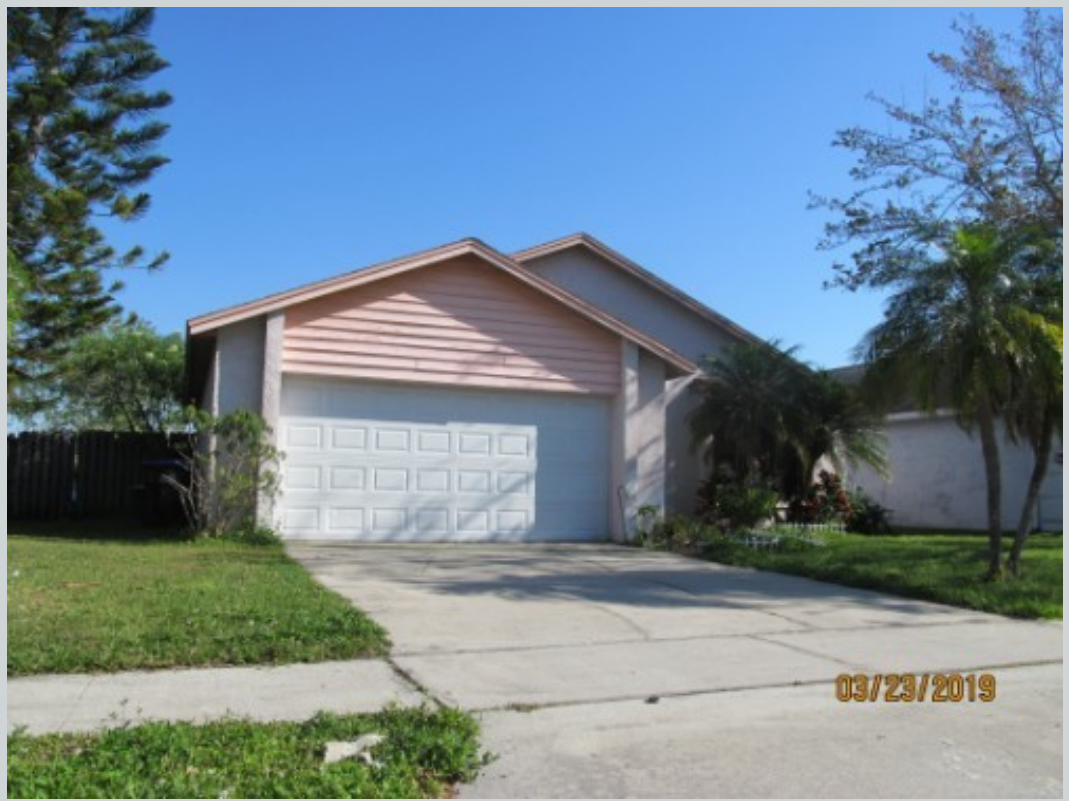
Subject 3145 Woodruff Dr