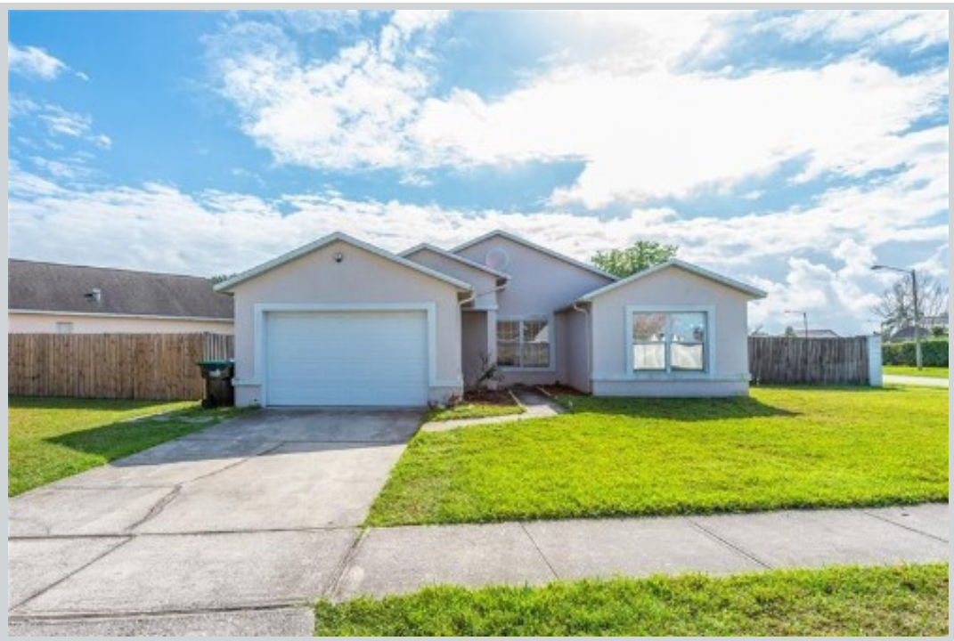
Listing Comp 1 2703 Woodruff Dr