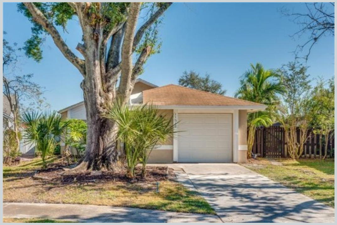
Sold Comp 1 11517 Benbow Ct