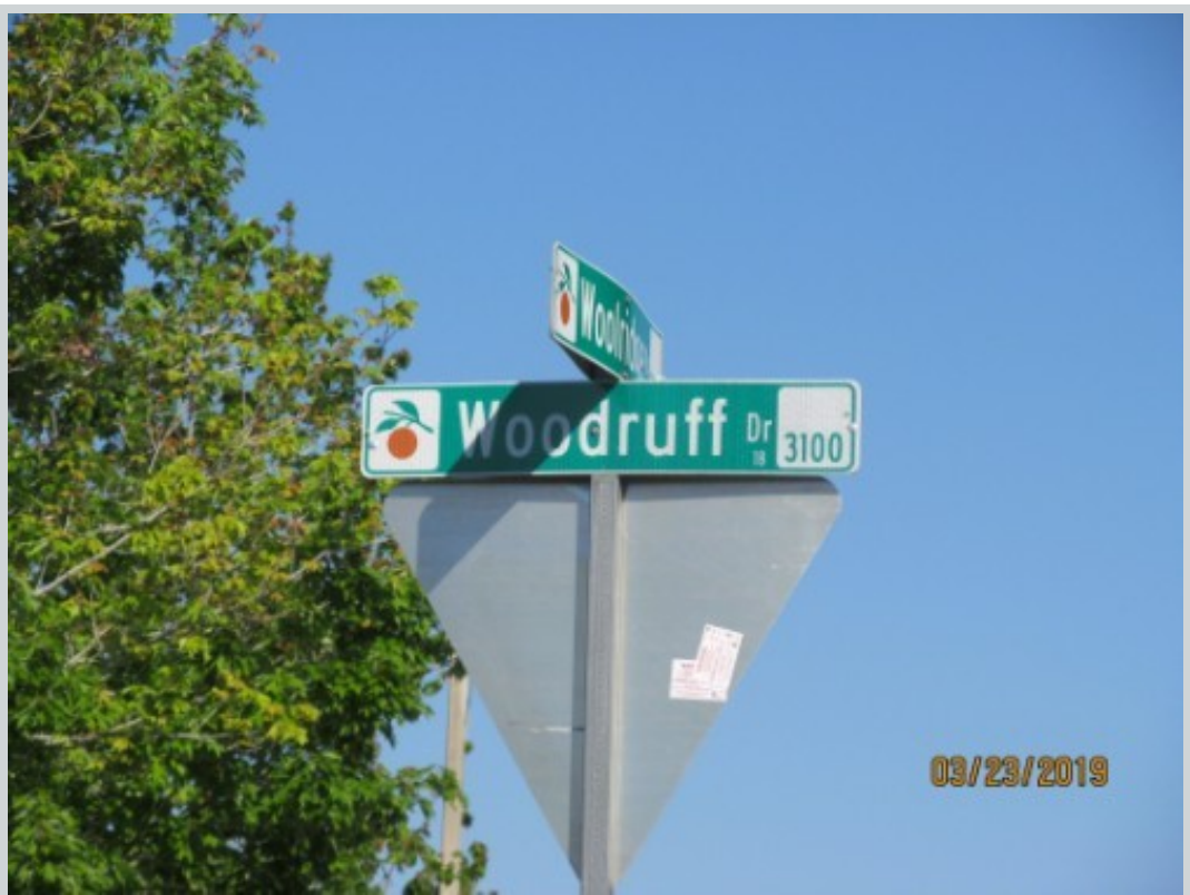
Subject 3145 Woodruff Dr