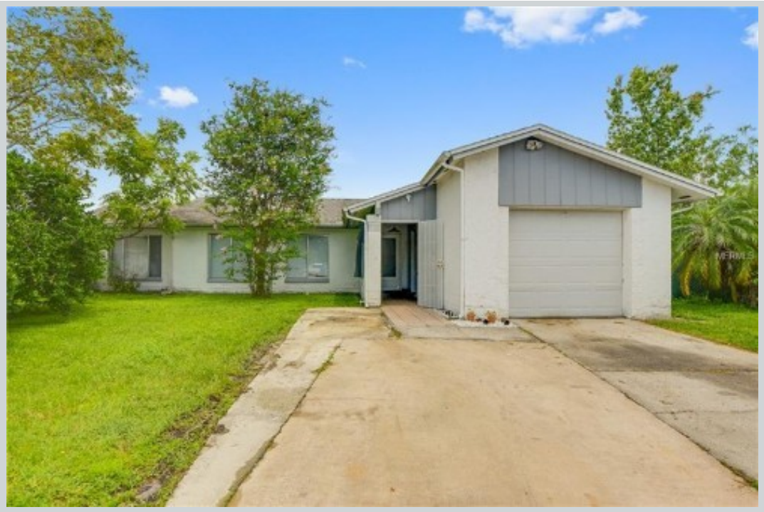
Sold Comp 3 11301 Cardiff Dr