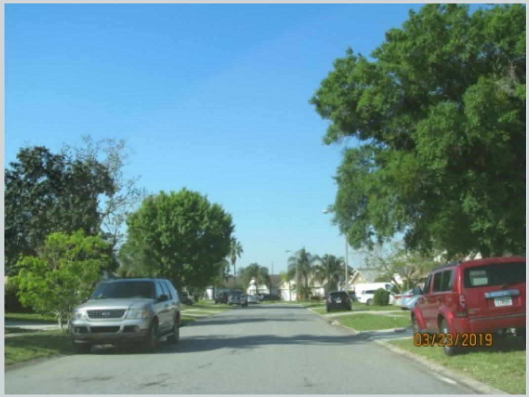
Subject 3145 Woodruff Dr