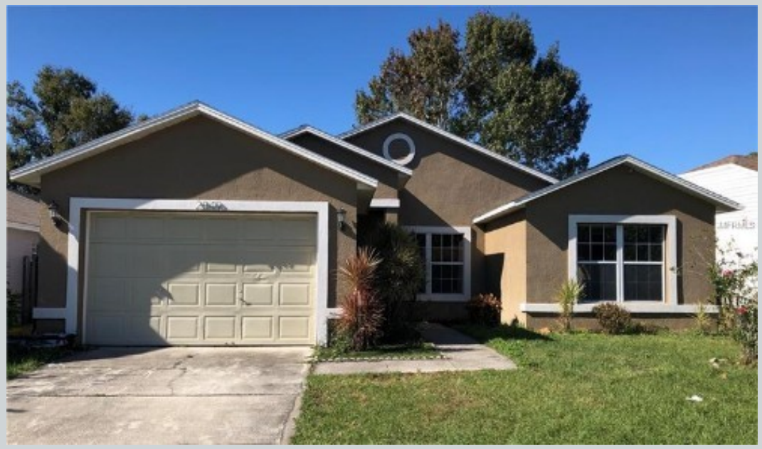
Listing Comp 2 2849 Woodruff Dr