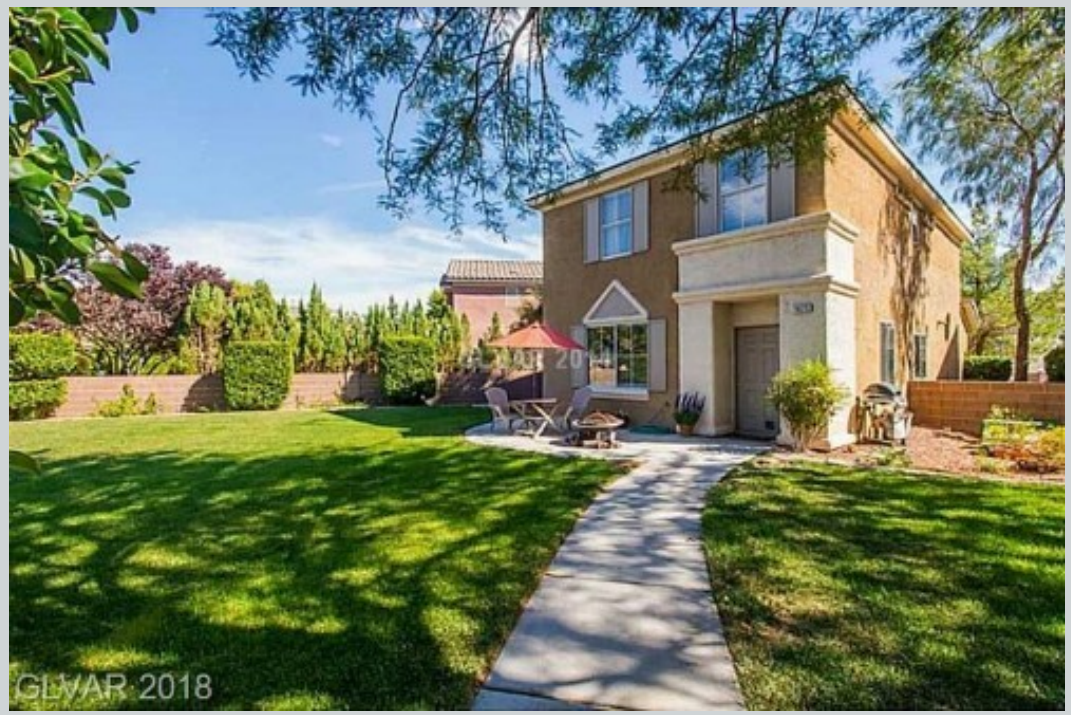
Sold Comp 3 1425 Muinos St