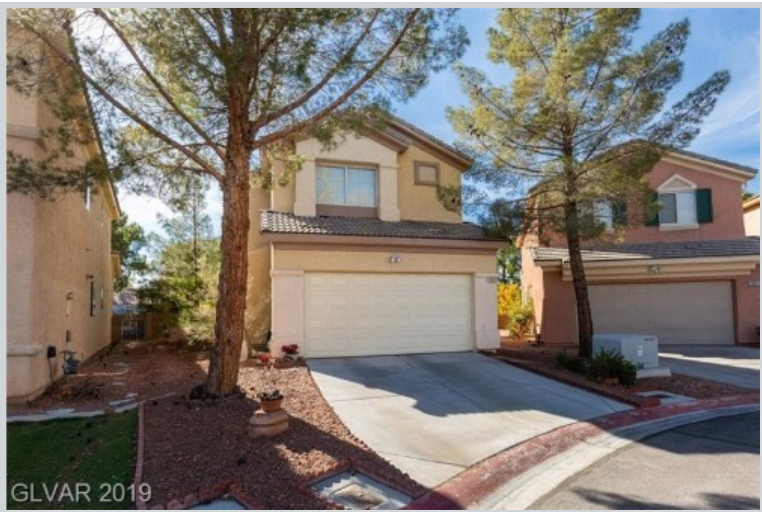
Listing Comp 1 10029 La Paca Av