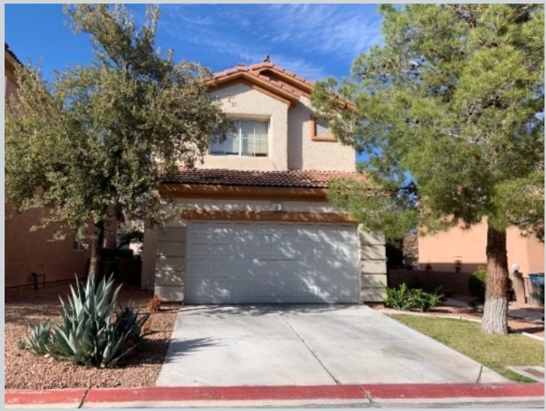
Subject 10000 Via Delores Ave