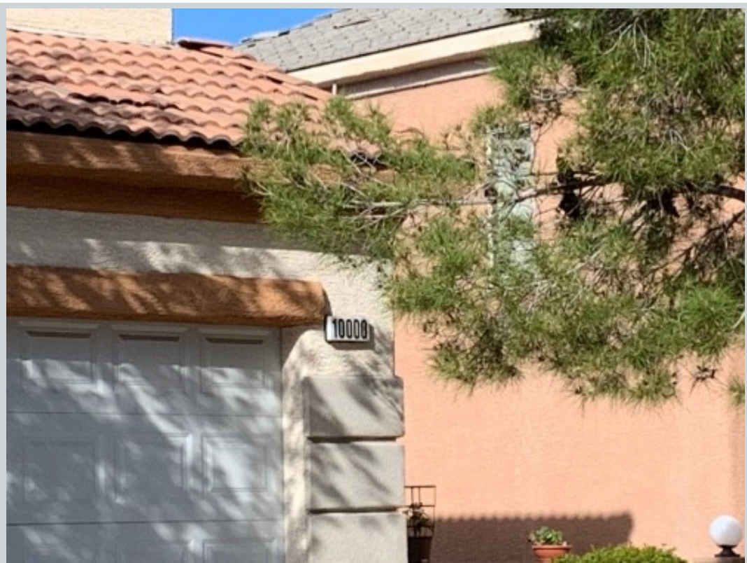
Subject 10000 Via Delores Ave