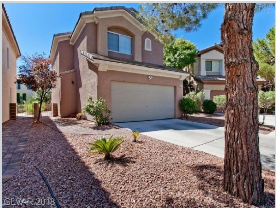
Sold Comp 2 10025 Calabasas Av