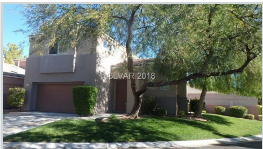
Listing Comp 3 632 Blue Yucca St