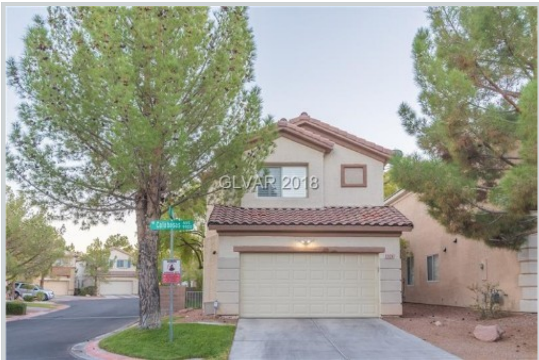
Listing Comp 2 9909 Calabasas Av