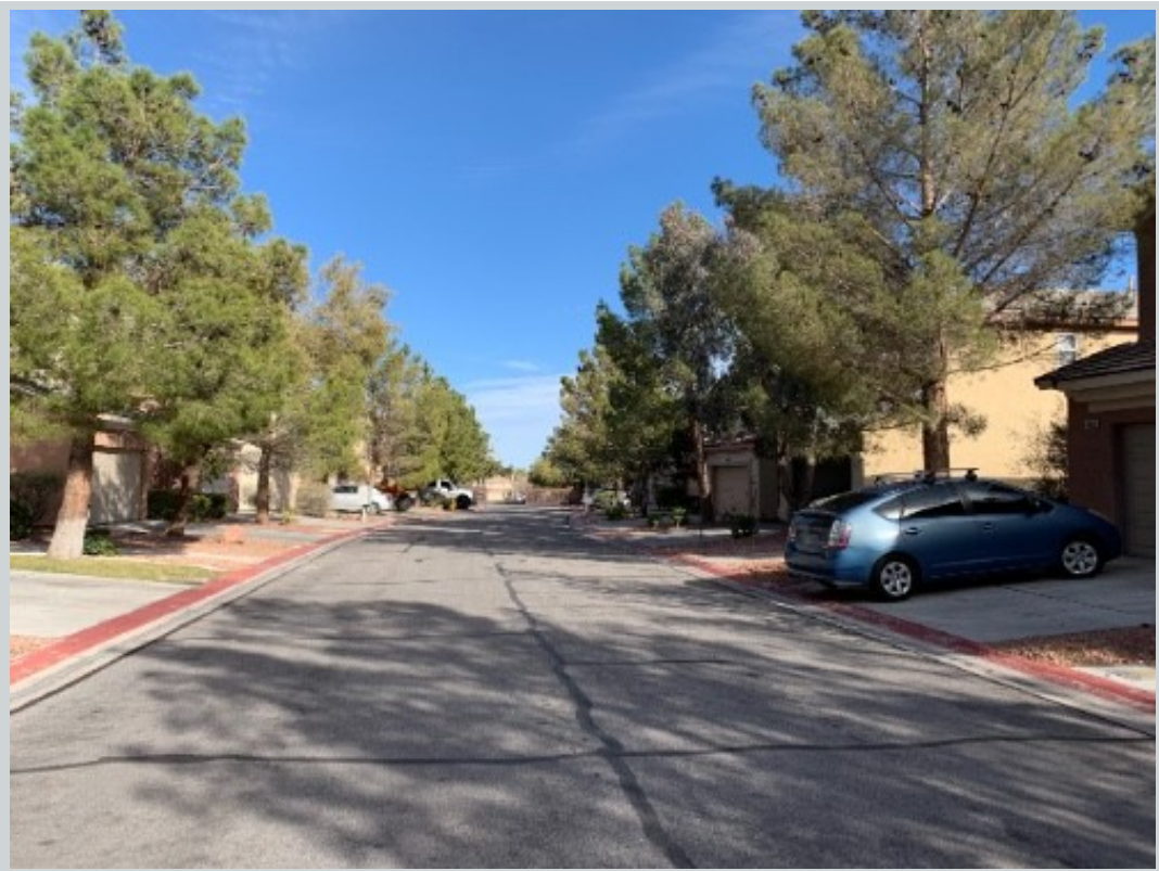
Subject 10000 Via Delores Ave