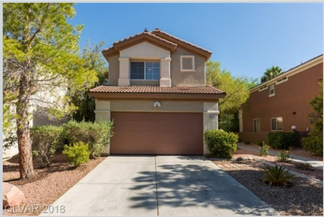
Sold Comp 1 9917 Via Toro Av