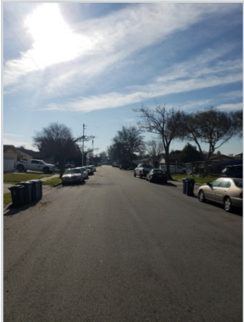
Subject 35966 Burning Tree Dr