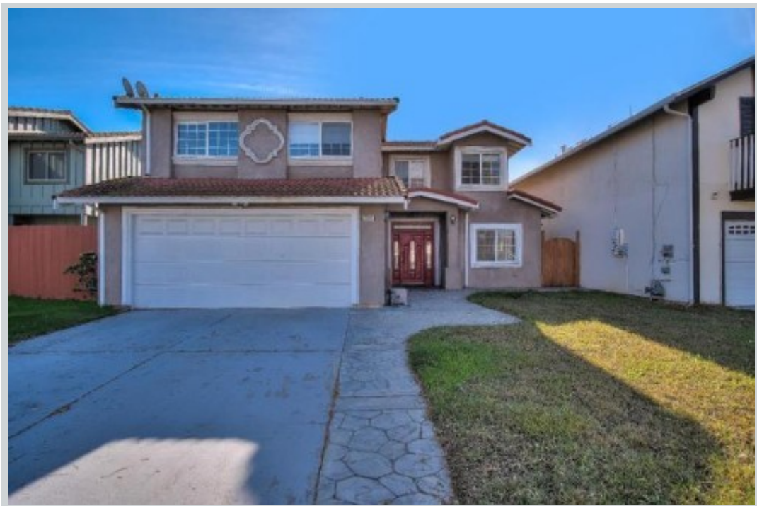
Listing Comp 1 7109 Arbeau Dr

Address 35966 Burning Tree Drive, Newark, CA 94560 Loan Number 29178 Suggested List $1,099,888 Suggested Repaired $1,099,888 Sale $1,099,888