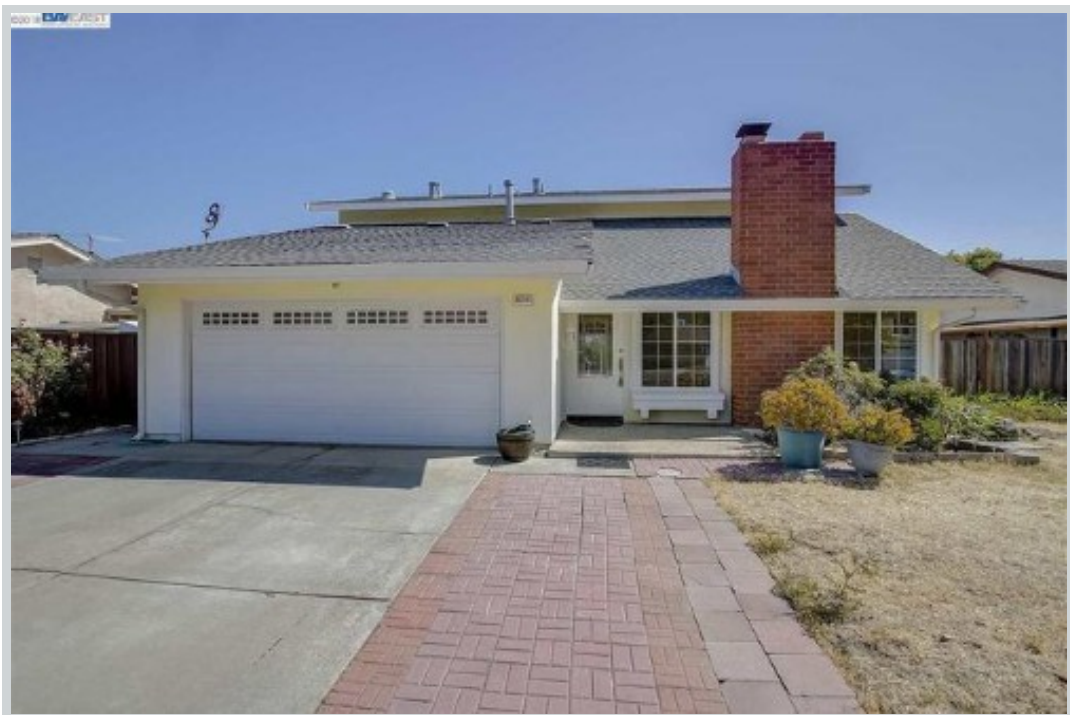
Sold Comp 1 36114 Spruce St