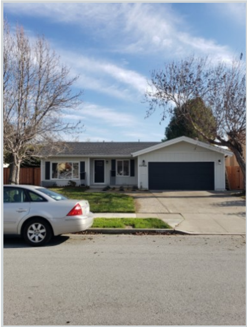
Subject 35966 Burning Tree Dr