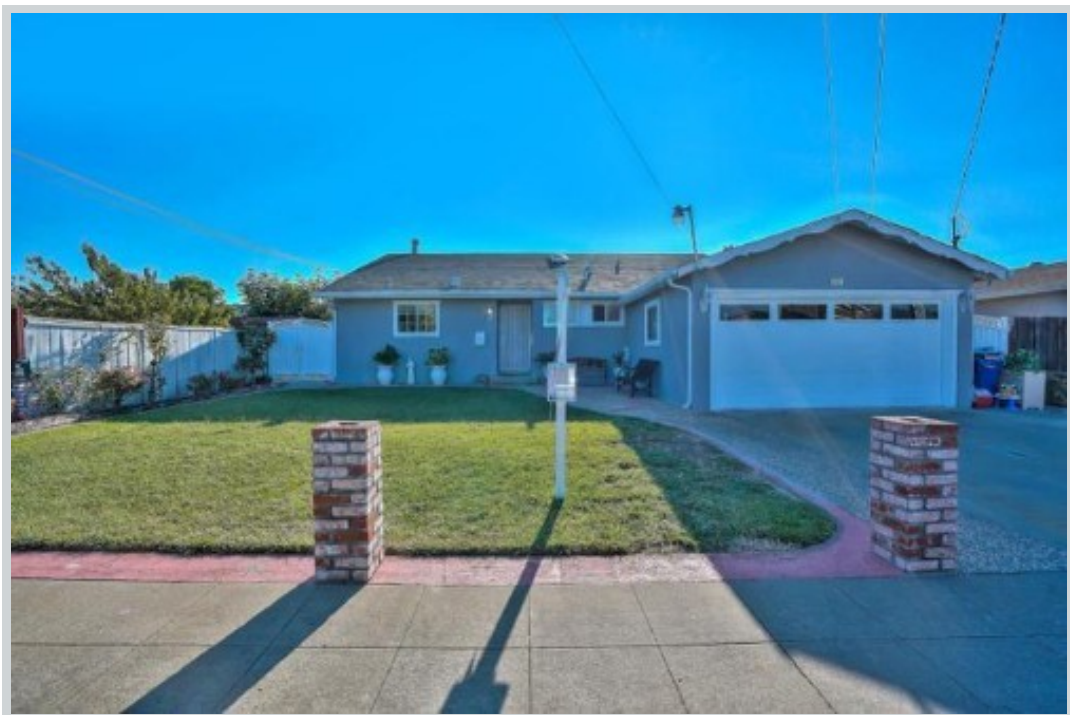
Sold Comp 3 37073 Laurel St