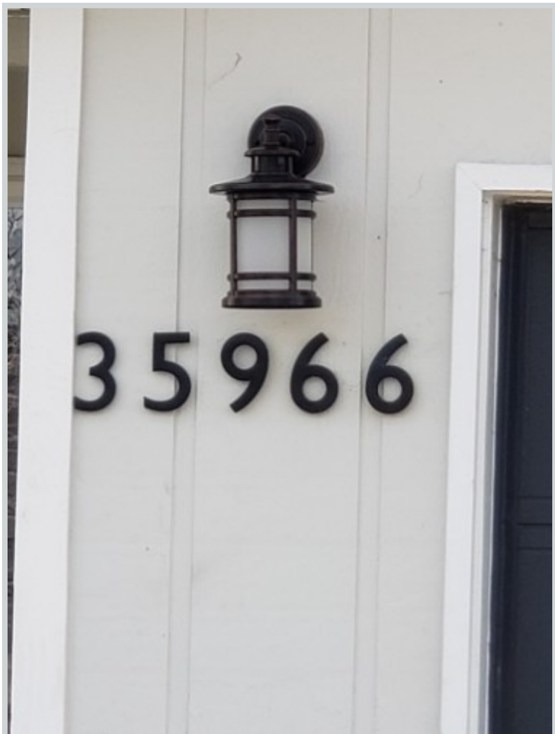
Subject 35966 Burning Tree Dr