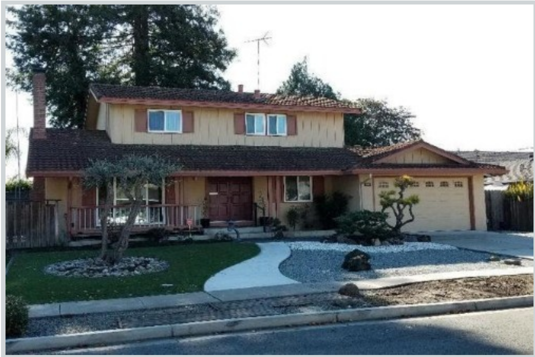
Listing Comp 3 35557 Reymouth Dr