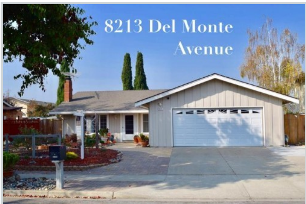
Listing Comp 2 8213 Del Monte Ave