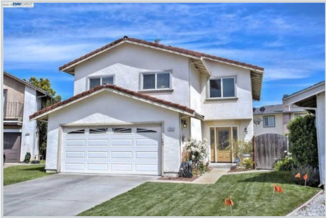
Sold Comp 2 7172 Arbeau Dr