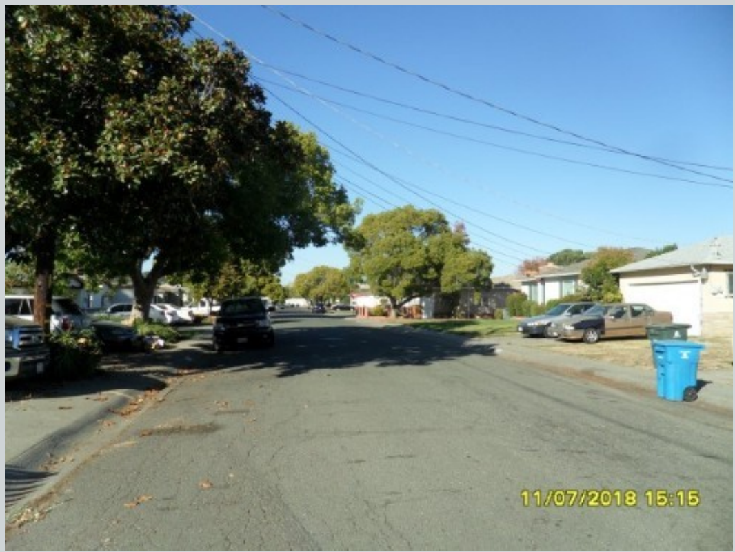
Subject 268 Lofas Pl

Address 268 Lofas Place, Vallejo, CA 94589 Loan Number 30155 Suggested List $430,000 Suggested Repaired $430,000 Sale $430,000