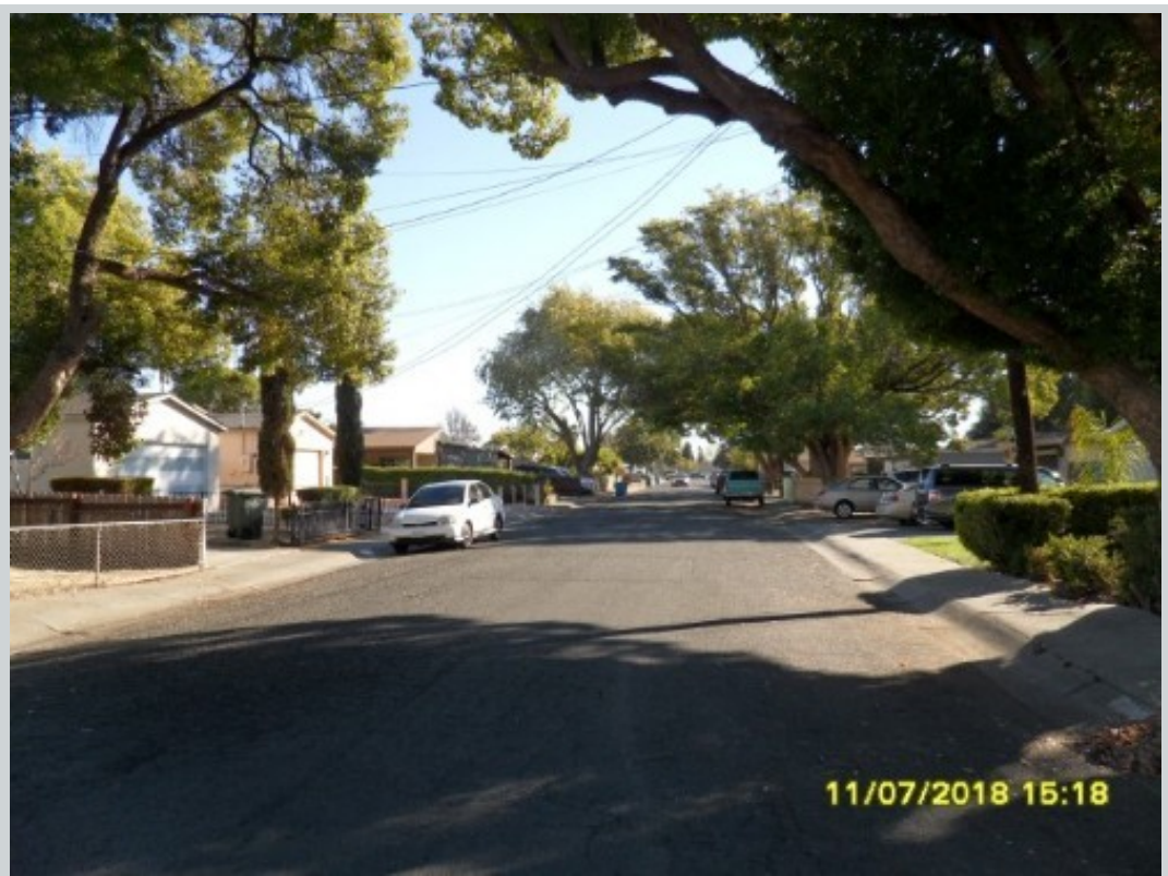
Subject 268 Lofas Pl