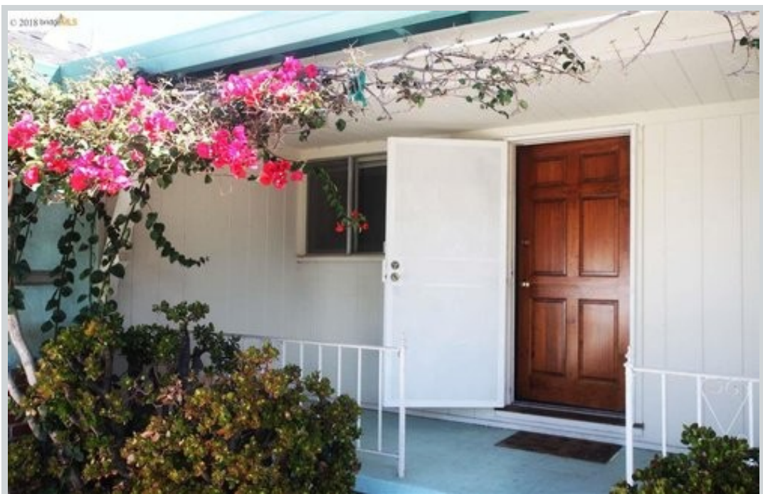
Listing Comp 2 10 Marshall Way View Front

Address 268 Lofas Place, Vallejo, CA 94589 Loan Number 30155 Suggested List $430,000 Suggested Repaired $430,000 Sale $430,000