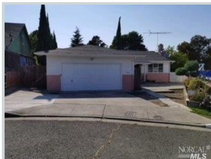
Listing Comp 3 181 Florence Ct View Front