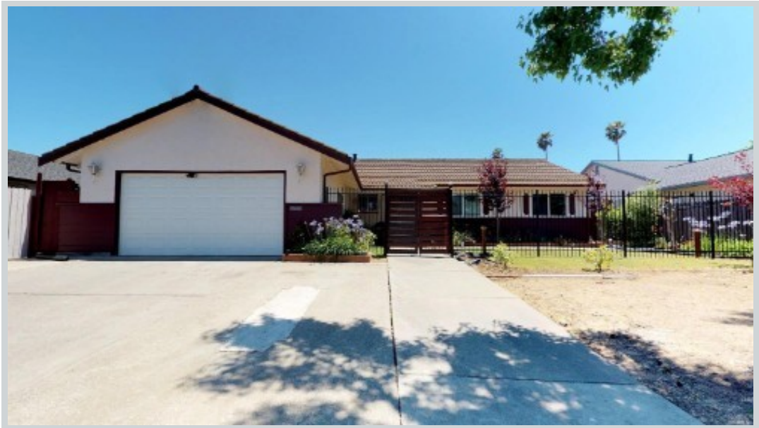
Sold Comp 1 856 Tobin Dr

Address 268 Lofas Place, Vallejo, CA 94589 Loan Number 30155 Suggested List $430,000 Suggested Repaired $430,000 Sale $430,000