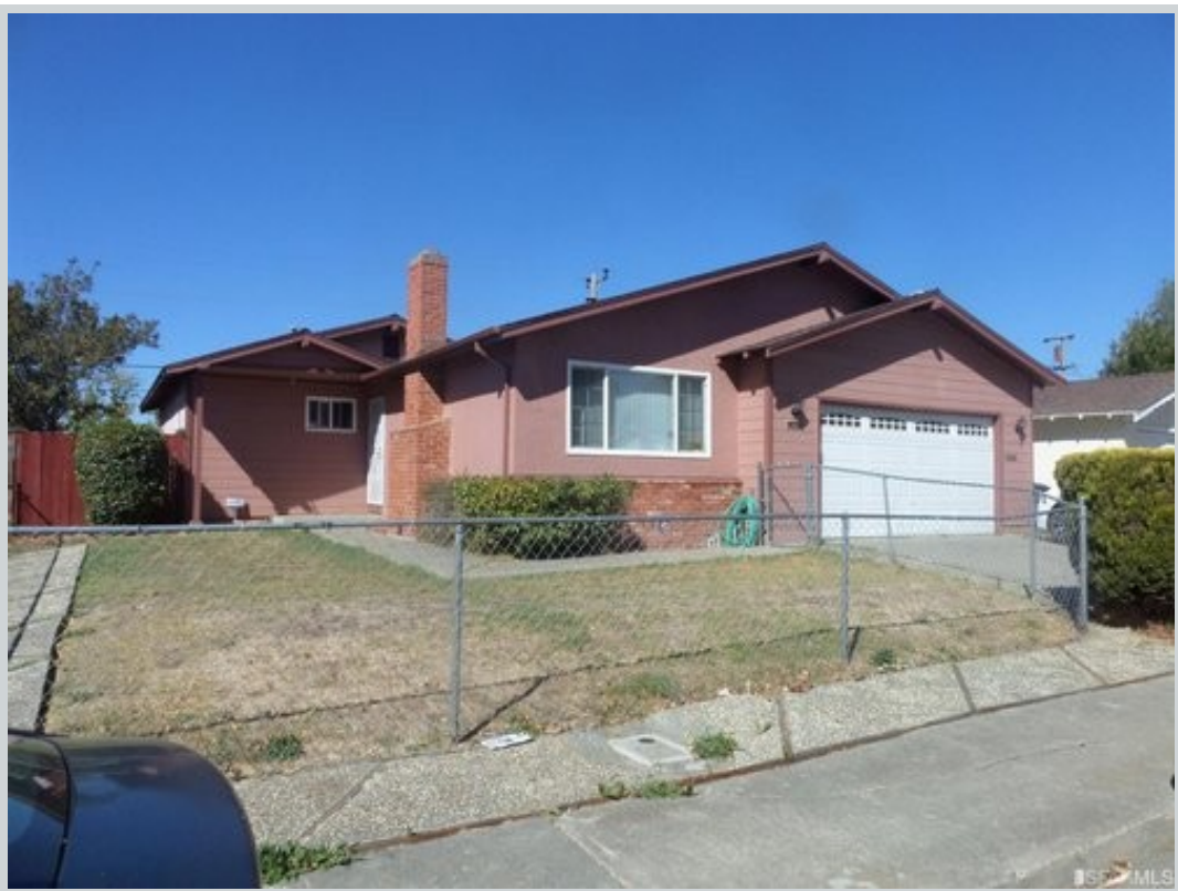
Listing Comp 1 419 Pomona Ave