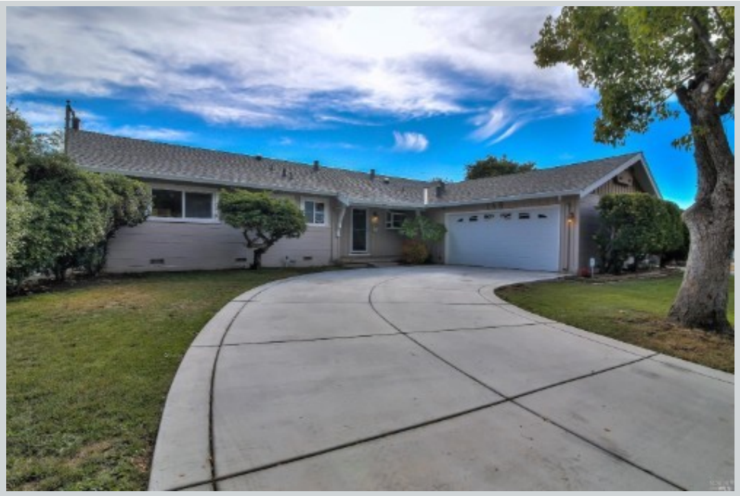
Sold Comp 3 156 Kit Carson Way