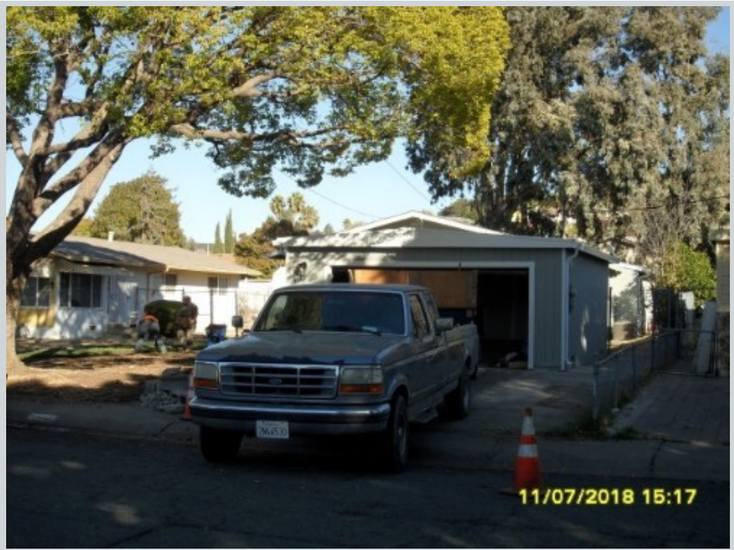
Subject 268 Lofas Pl

Address 268 Lofas Place, Vallejo, CA 94589 Loan Number 30155 Suggested List $430,000 Suggested Repaired $430,000 Sale $430,000