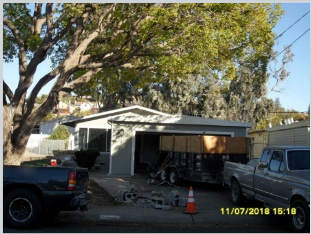
Subject 268 Lofas Pl

Address 268 Lofas Place, Vallejo, CA 94589 Loan Number 30155 Suggested List $430,000 Suggested Repaired $430,000 Sale $430,000