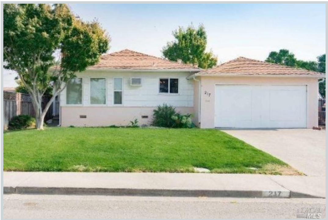
Sold Comp 2 217 Mesa Verde St.