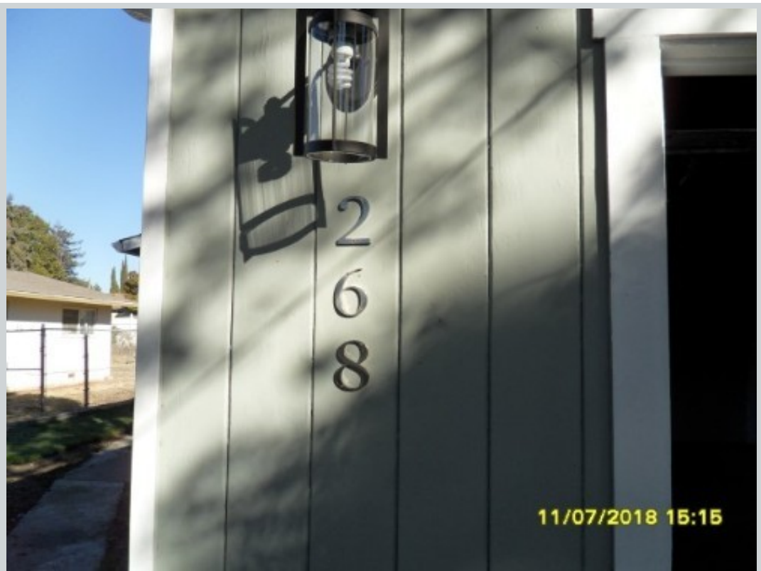
Subject 268 Lofas Pl