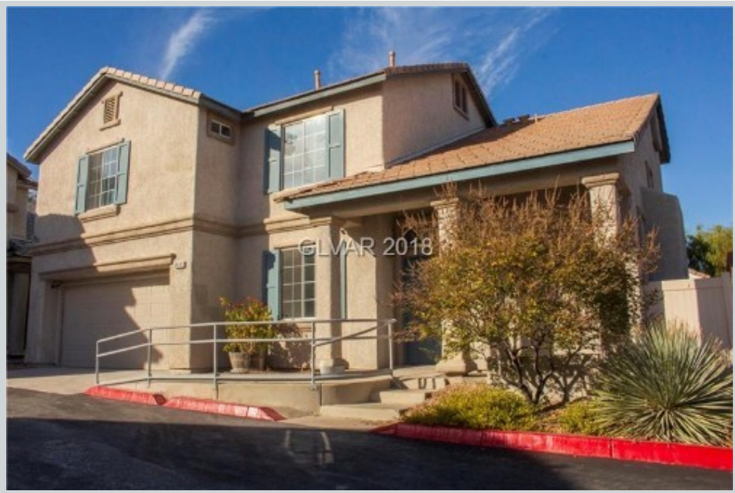
Listing Comp 2