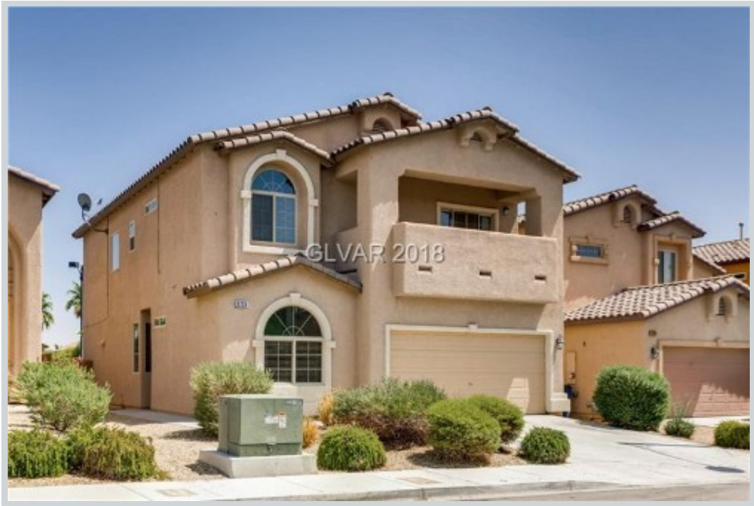
Sold Comp 3