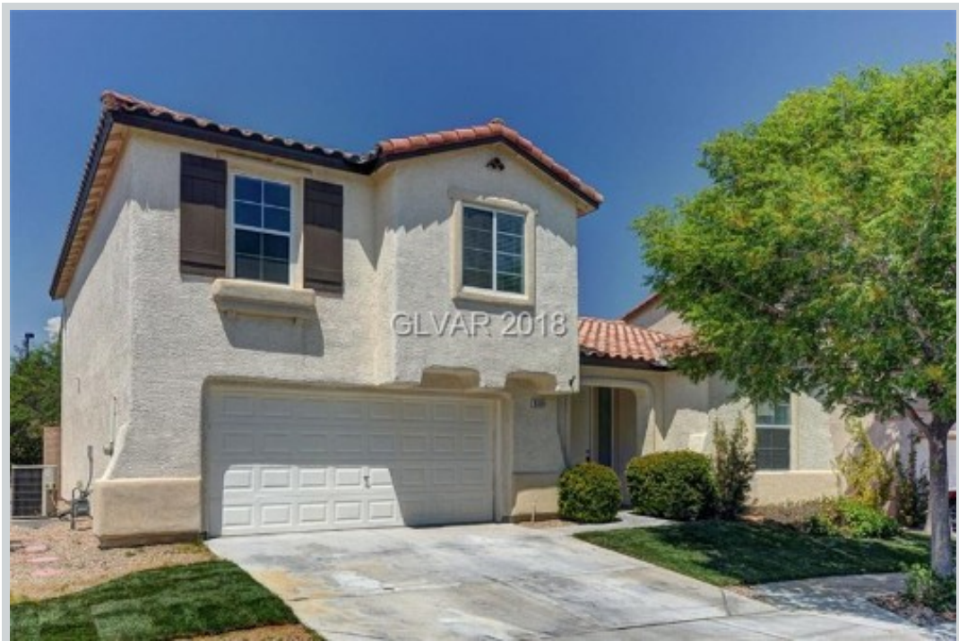
Sold Comp 2