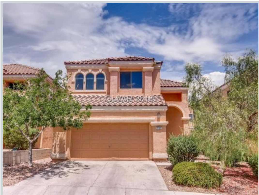
Sold Comp 1

Address 9323 Horseshoe Basin Avenue, Las Vegas, NV 89149 Loan Number 30469 Suggested List $314,000 Suggested Repaired $314,000 Sale $308,000