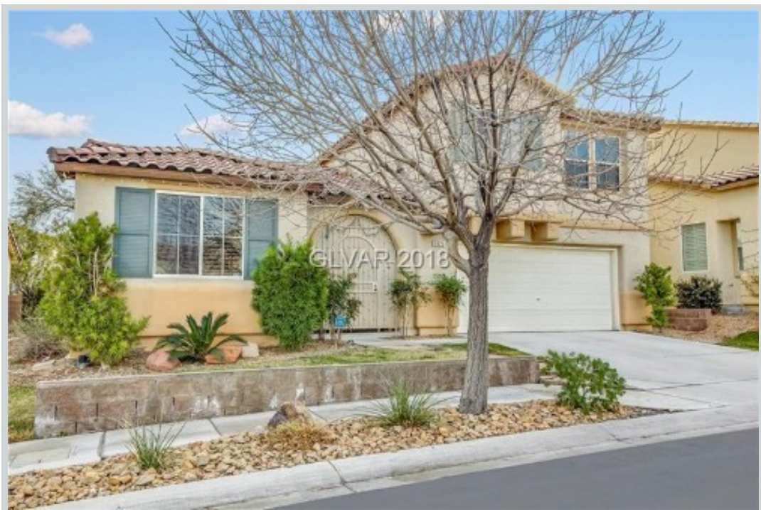
Listing Comp 1