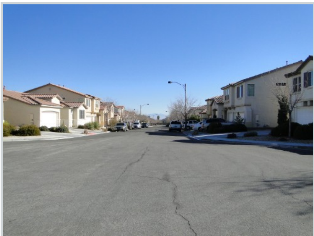
Subject 9323 Horseshoe Basin Ave

Address 9323 Horseshoe Basin Avenue, Las Vegas, NV 89149 Loan Number 30469 Suggested List $314,000 Suggested Repaired $314,000 Sale $308,000