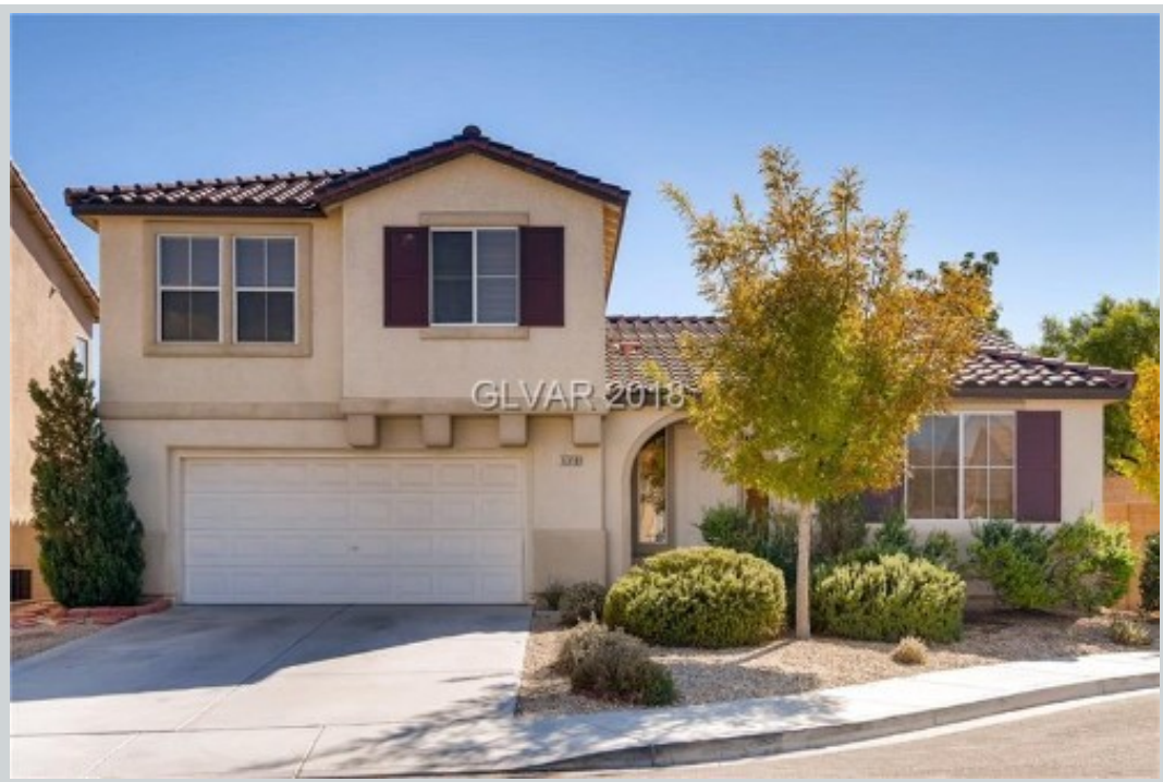
Listing Comp 3