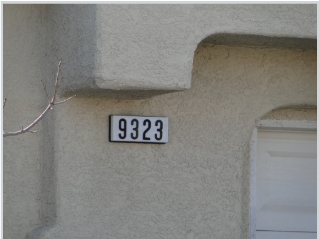
Subject 9323 Horseshoe Basin Ave