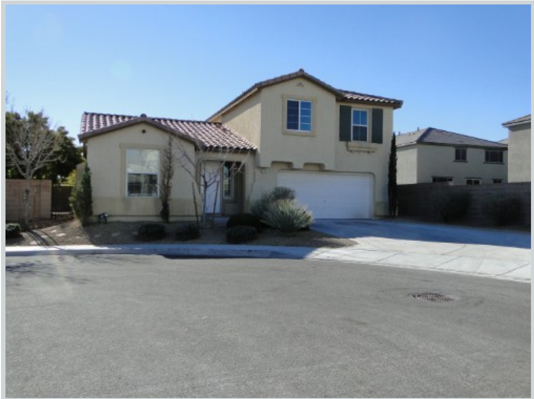
Subject 9323 Horseshoe Basin Ave