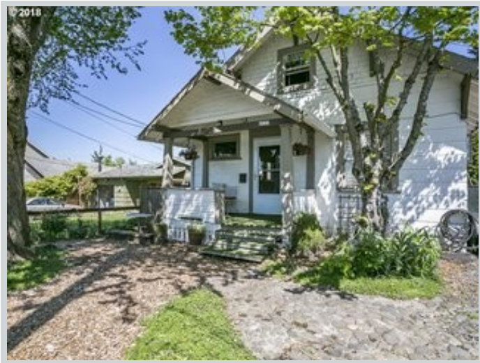
Sold Comp 1 4137 Se Tibbetts St