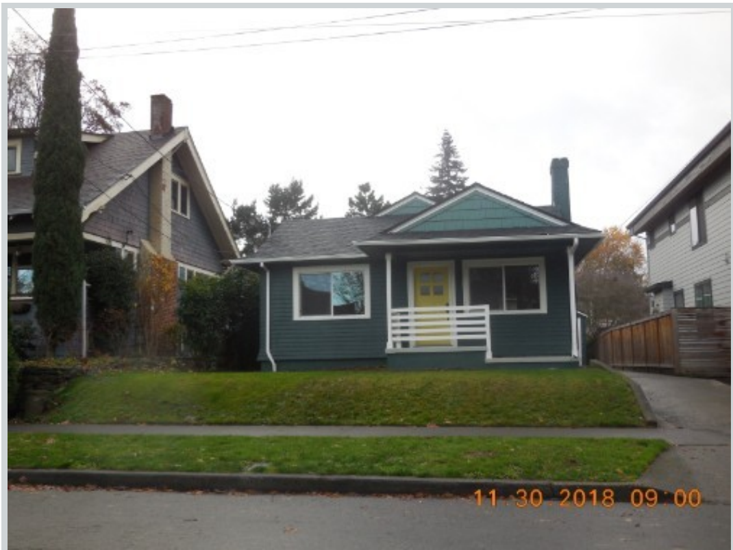
Subject 3124 Se Woodward St