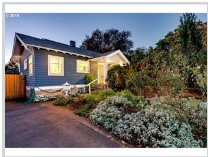
Listing Comp 1 3857 Se 41st Ave