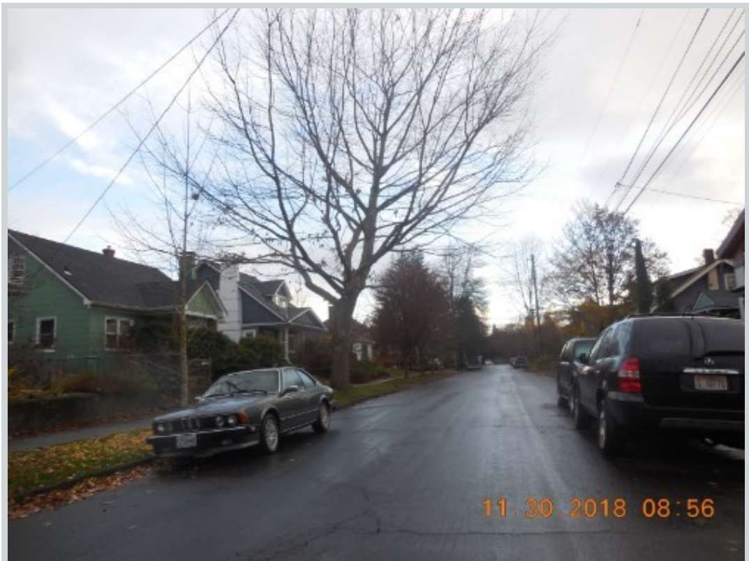
Subject 3124 Se Woodward St