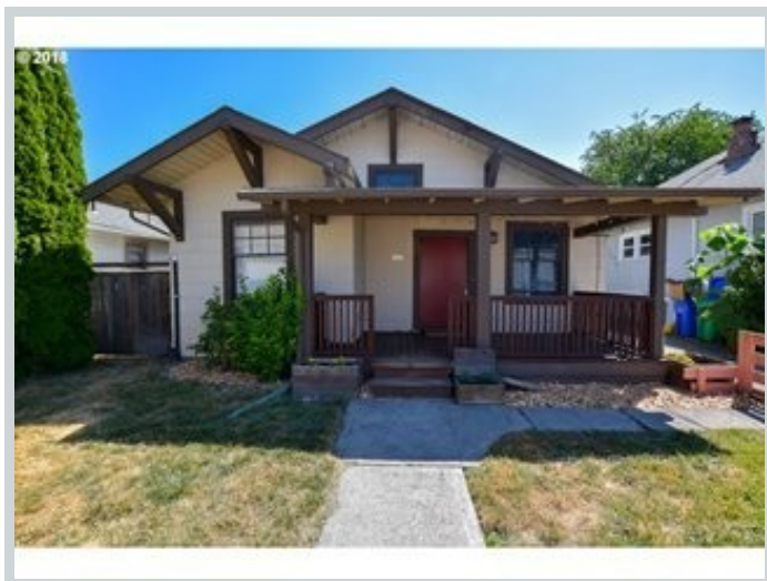
Listing Comp 3 4120 Se 24th Ave View Front