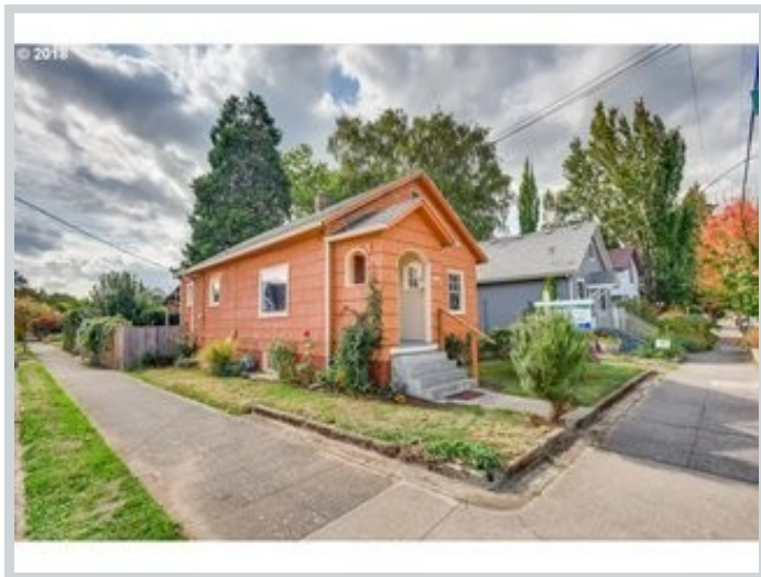
Listing Comp 2 3946 Se Sherman St View Front