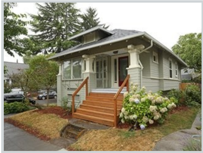
Sold Comp 3 1535 Se 42nd Ave