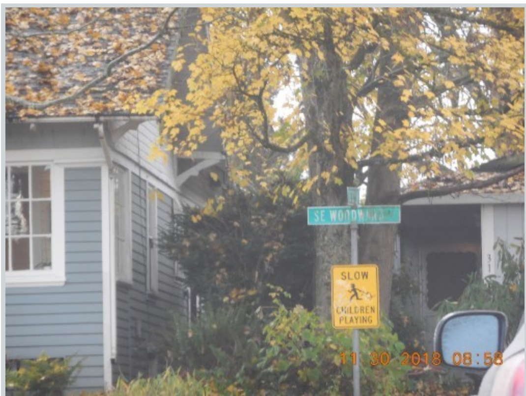
Subject 3124 Se Woodward St