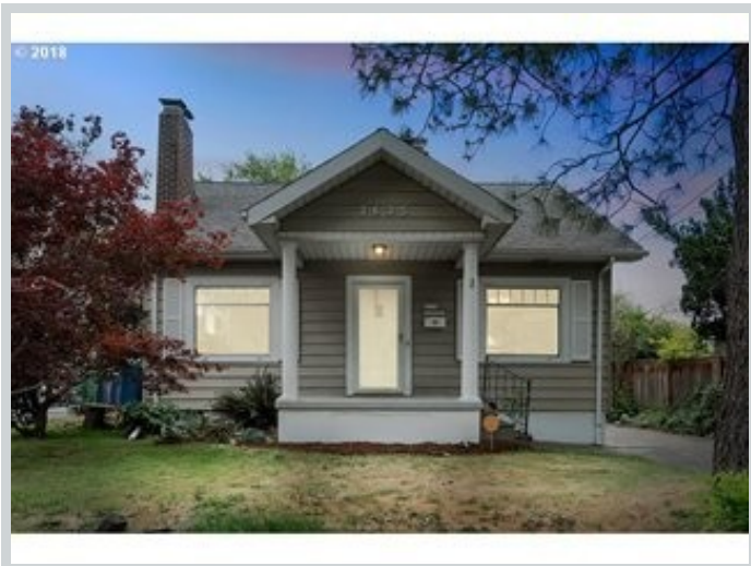
Sold Comp 2 3635 Se 38th Ave