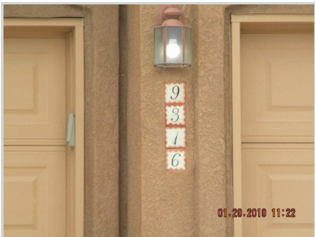
Subject 9316 Silica Ave Nw