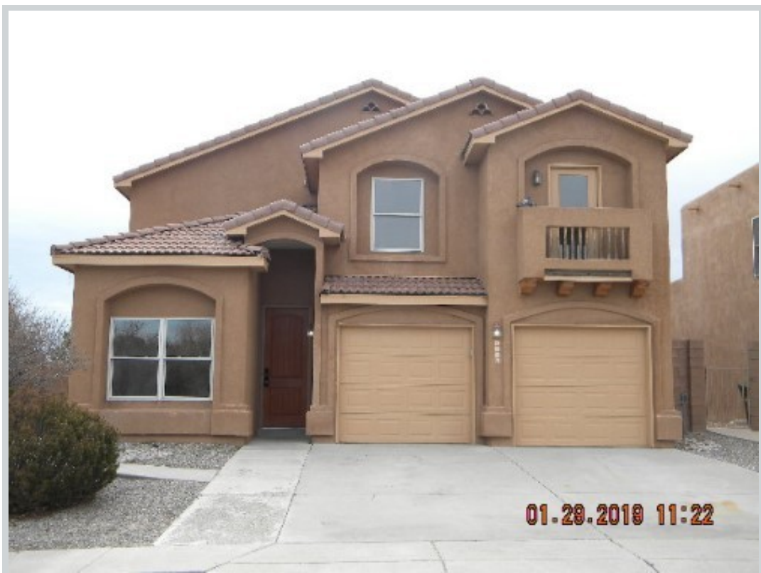
Subject 9316 Silica Ave Nw