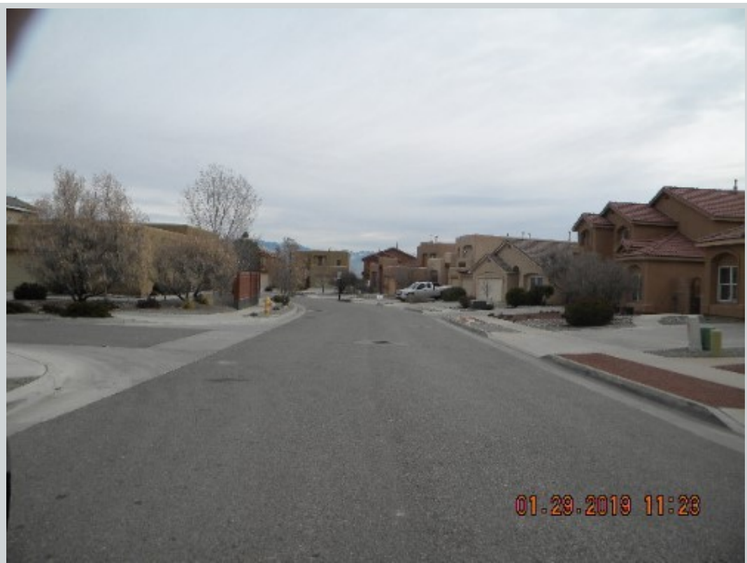
Subject 9316 Silica Ave Nw Comment "Street - West"

Address 9316 Silica Avenue Nw, Albuquerque, NM 87120 Loan Number 31536 Suggested List $225,000 Suggested Repaired $225,000 Sale $220,000