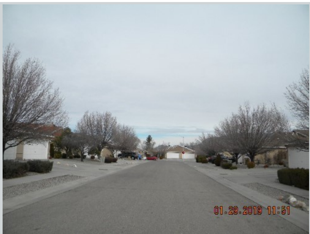
Subject 9316 Silica Ave Nw Comment "Street - East"