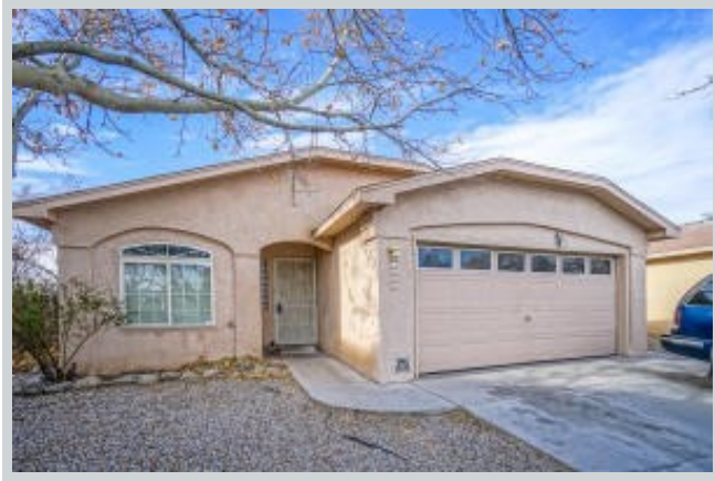
Listing Comp 3 9224 Eiffel Ave Sw View Front