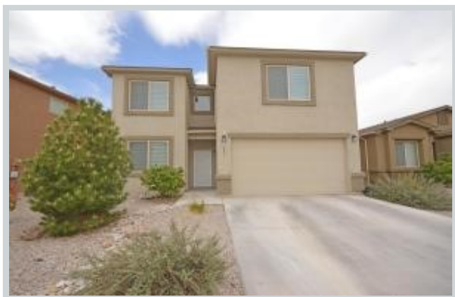
Sold Comp 2 843 Molten Pl Nw View Front