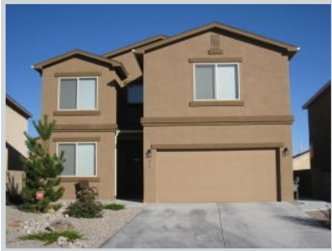
Sold Comp 1 836 Kipuka Dr Nw View Front