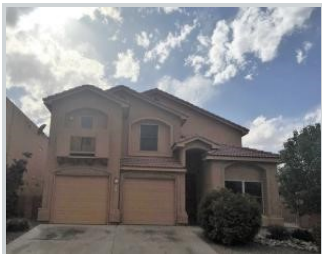
Listing Comp 1 835 Tumulus Dr Nw View Front