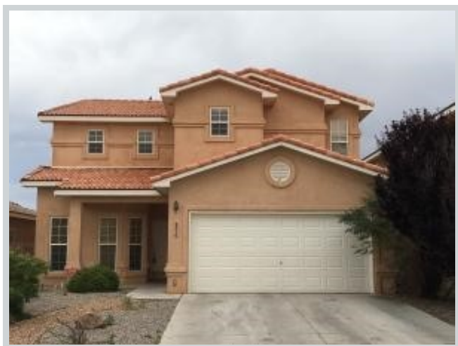
Sold Comp 3 9316 Ashfall Pl Nw View Front