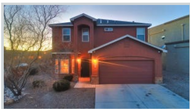
Listing Comp 2 835 Kipuka Dr Nw View Front