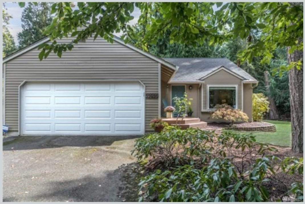
Listing Comp 2 22929 Ne 24th Place