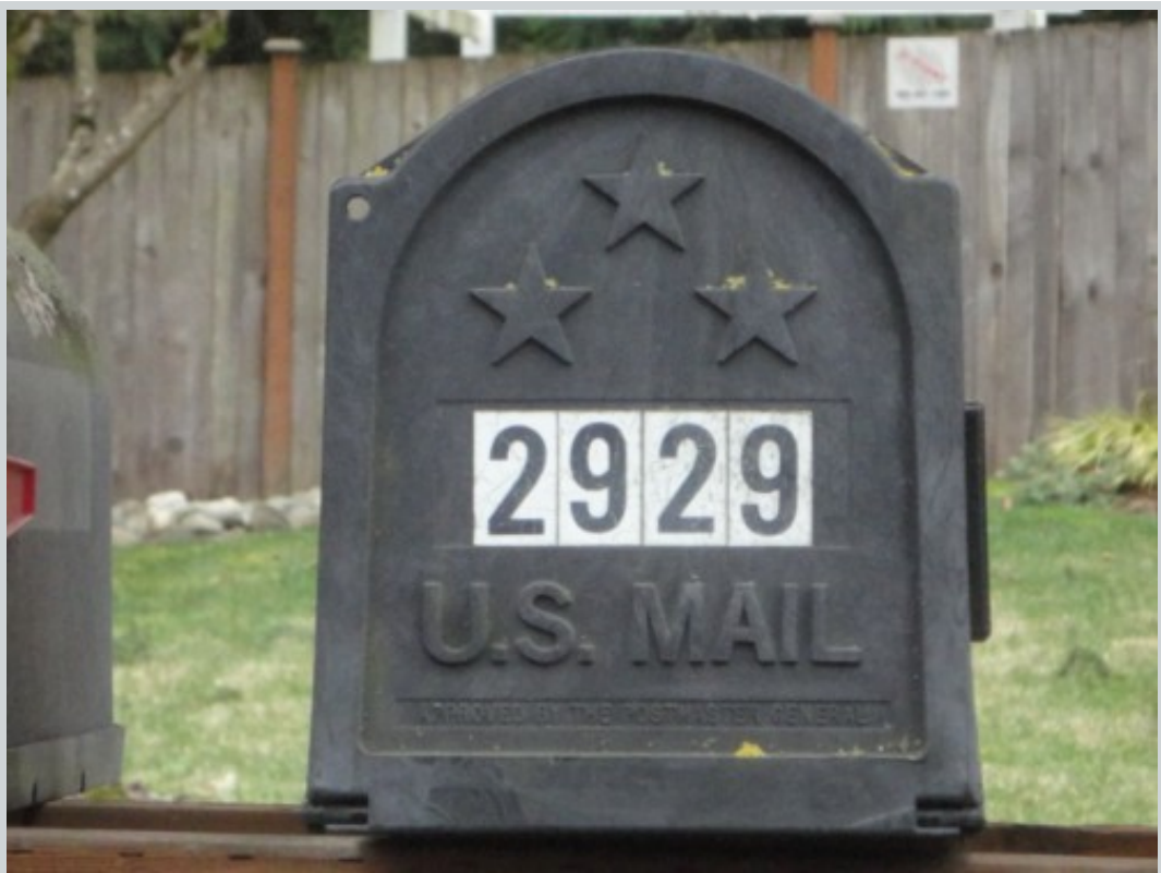
Subject 2929 229th Pl Ne