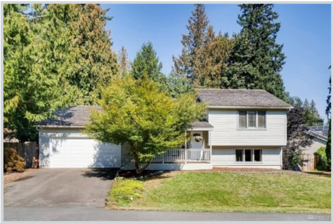
Sold Comp 2 2434 229th Ave Ne