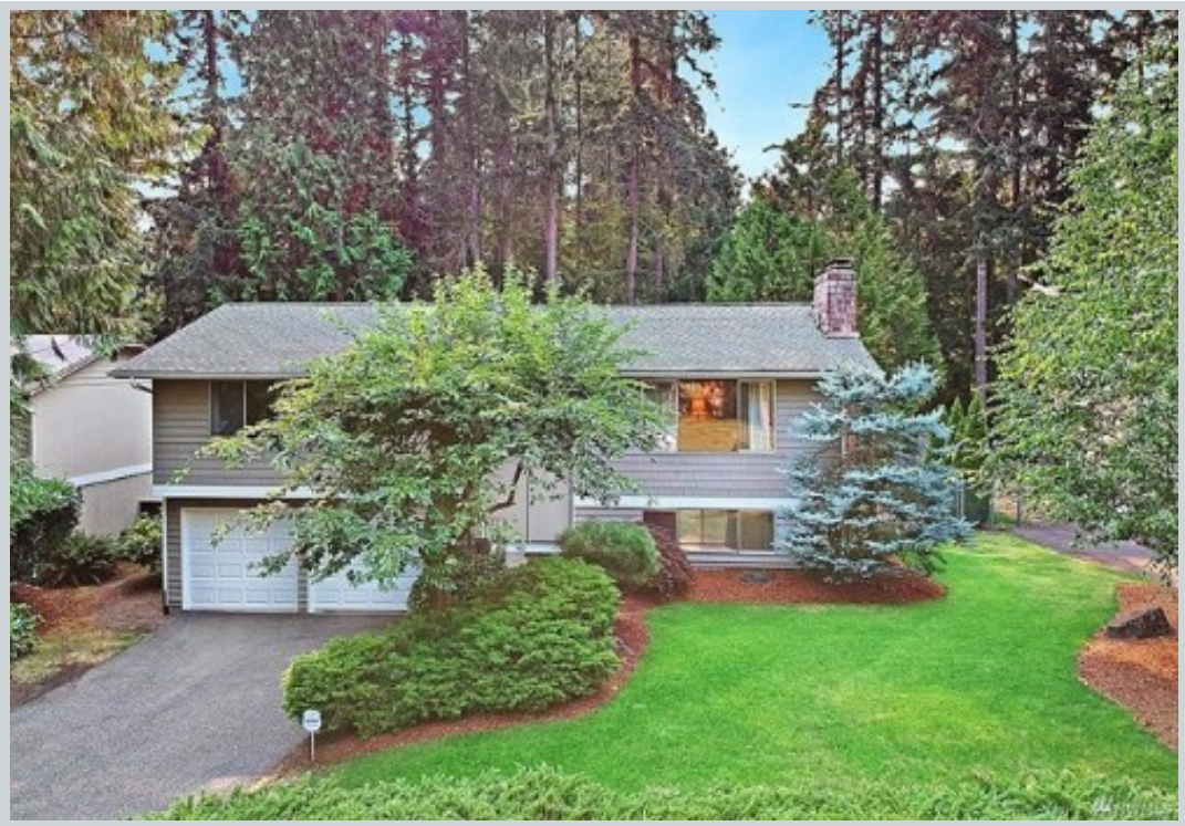
Listing Comp 3 733 218th Ave Ne