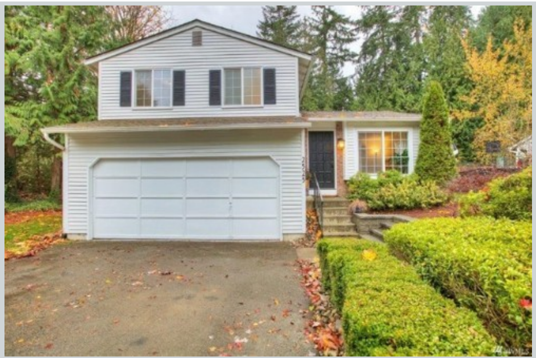
Listing Comp 1 2525 231st Ave Ne