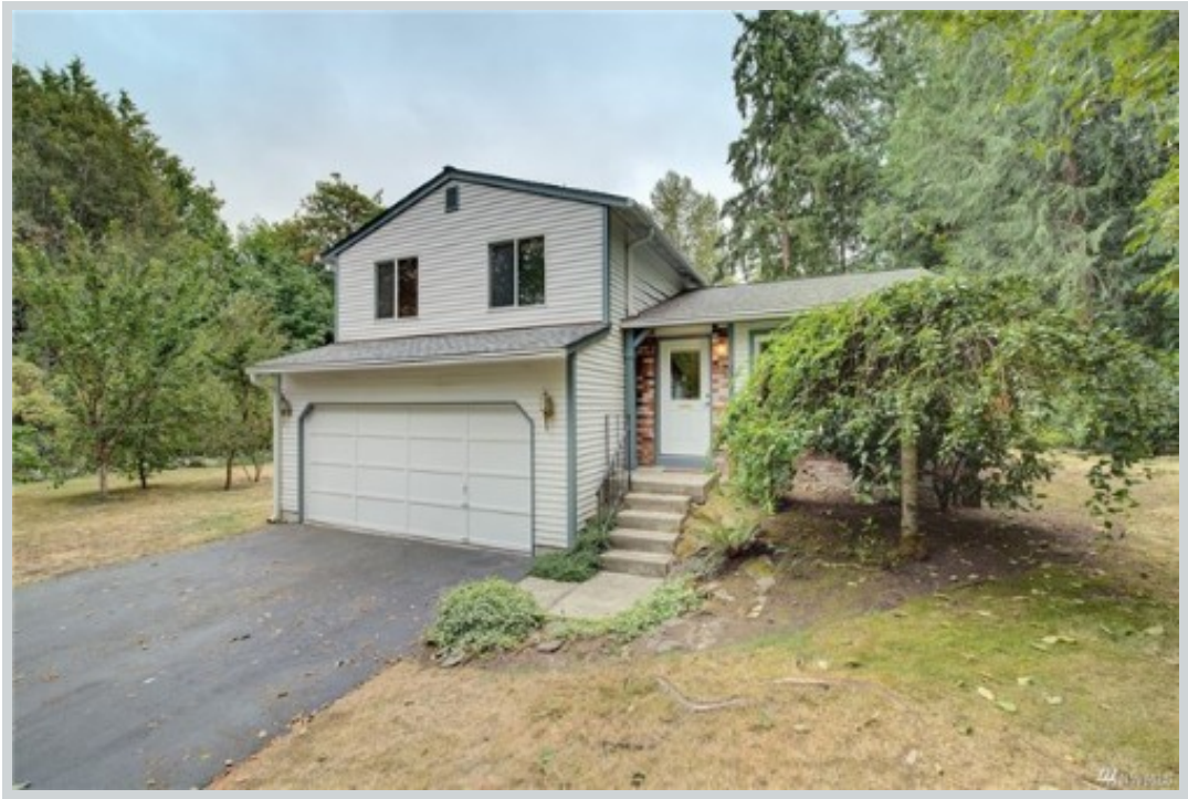
Sold Comp 3 23037 Ne 27th St