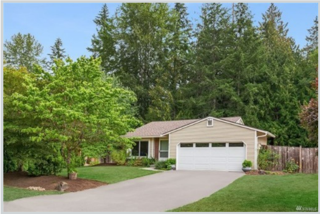
Sold Comp 1 2518 231st Ave Ne