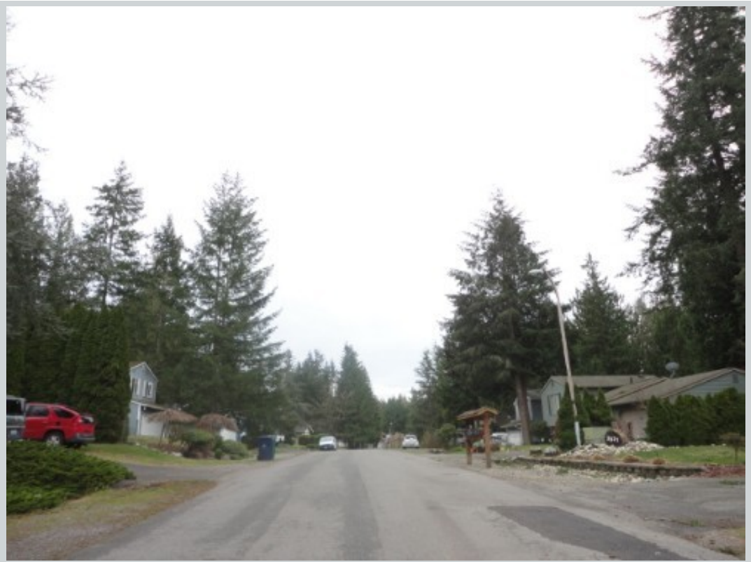
Subject 2929 229th Pl Ne