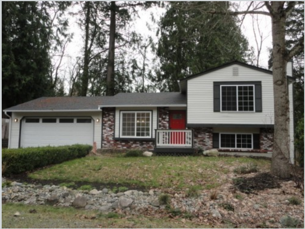
Subject 2929 229th Pl Ne