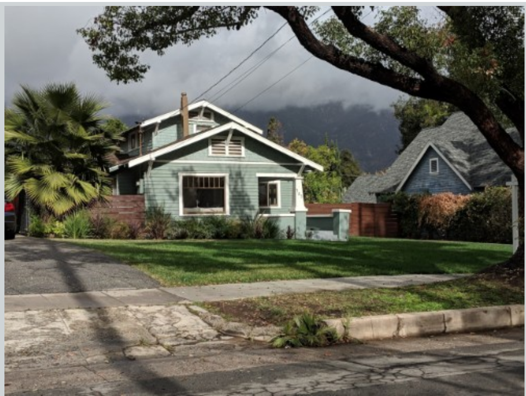
Subject 485 E Elizabeth St