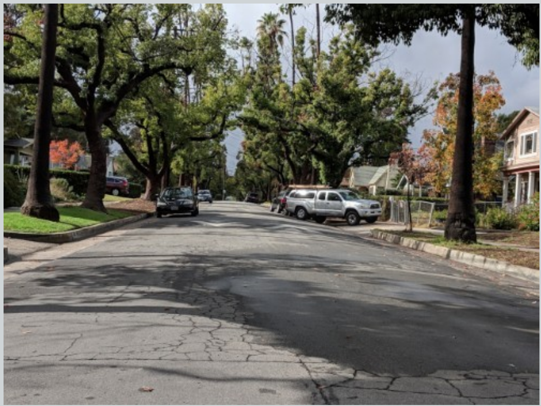
Subject 485 E Elizabeth St