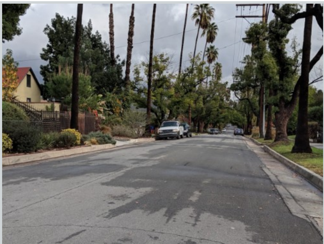
Subject 485 E Elizabeth St