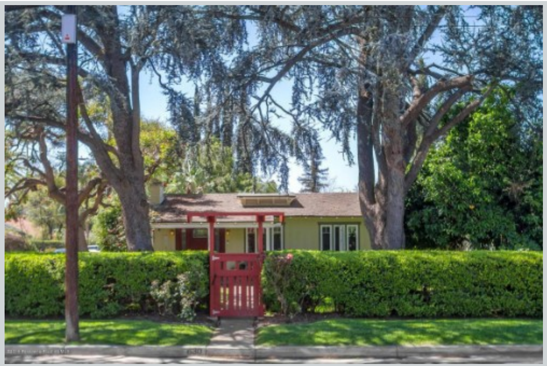
Sold Comp 1 630 E Sacramento St