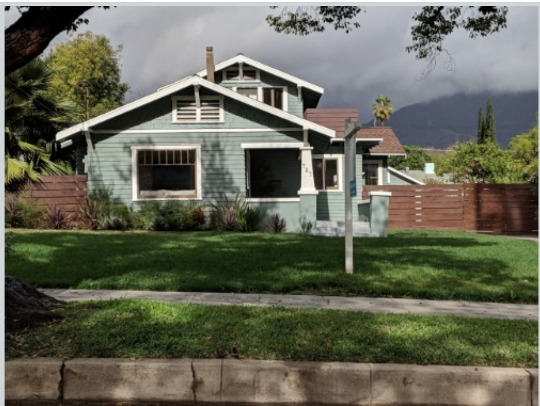
Subject 485 E Elizabeth St

Address 485 E Elizabeth Street, Pasadena, CA 91104 Loan Number 31580 Suggested List $770,000 Suggested Repaired $770,000 Sale $760,000