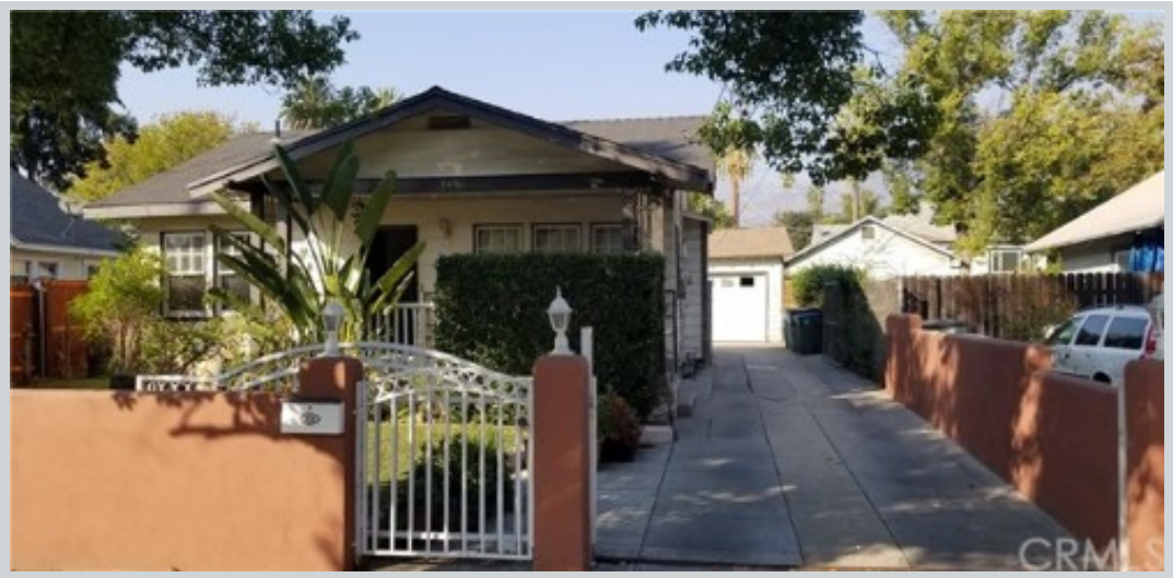
Listing Comp 3 745 E Ladera St