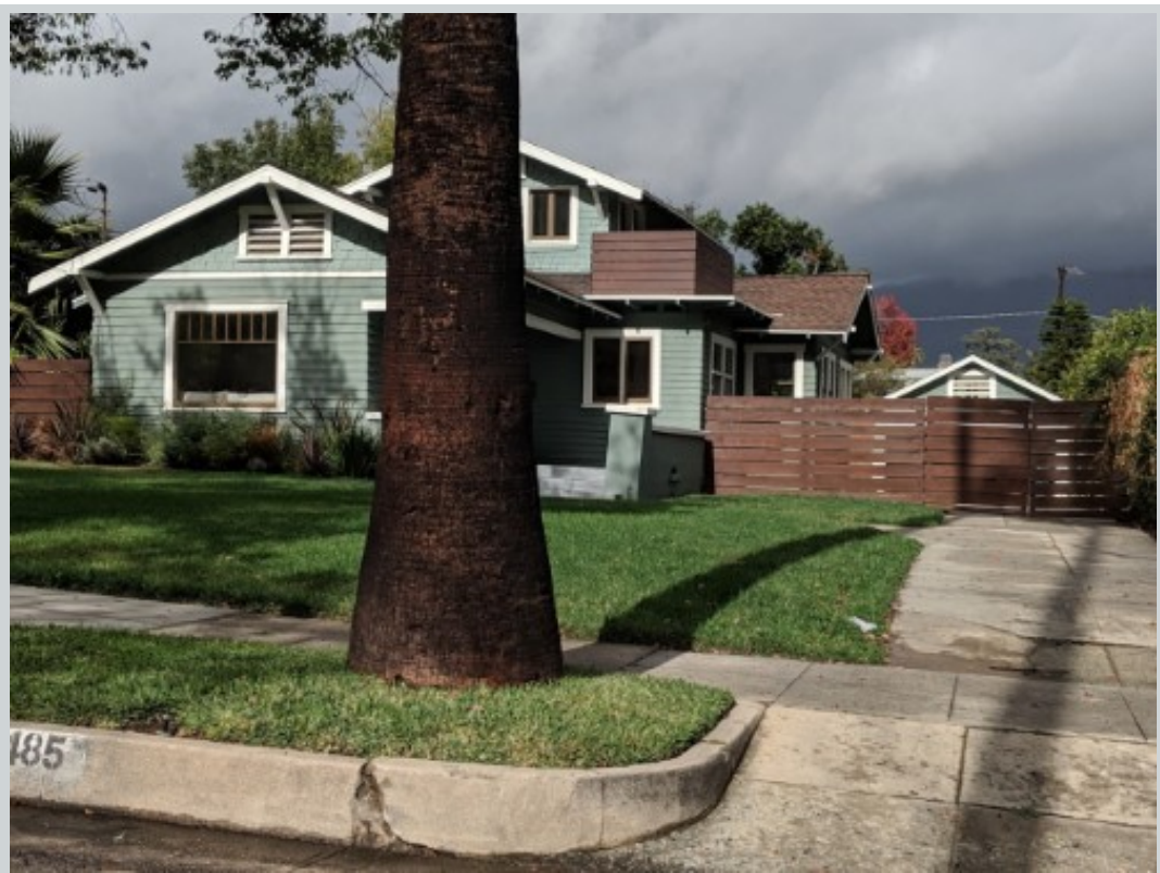
Subject 485 E Elizabeth St