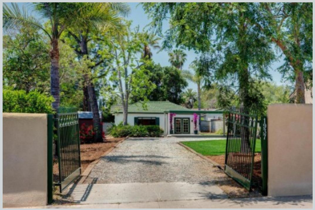
Sold Comp 3 1937 Mar Vista Ave