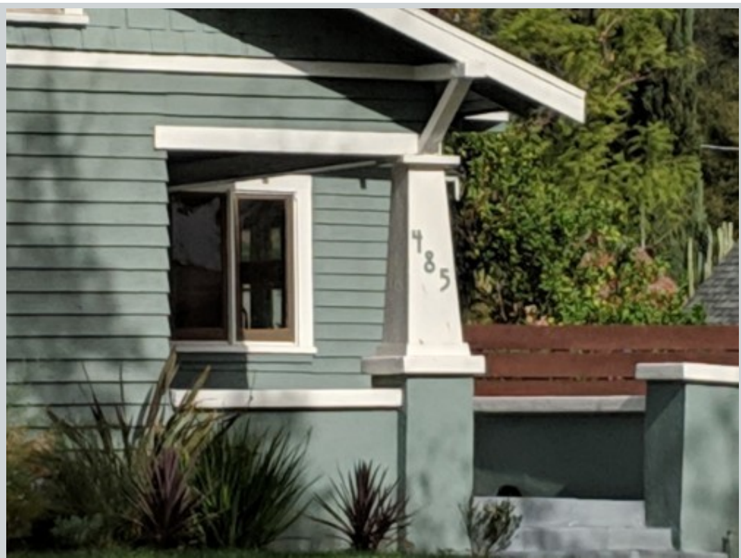
Subject 485 E Elizabeth St