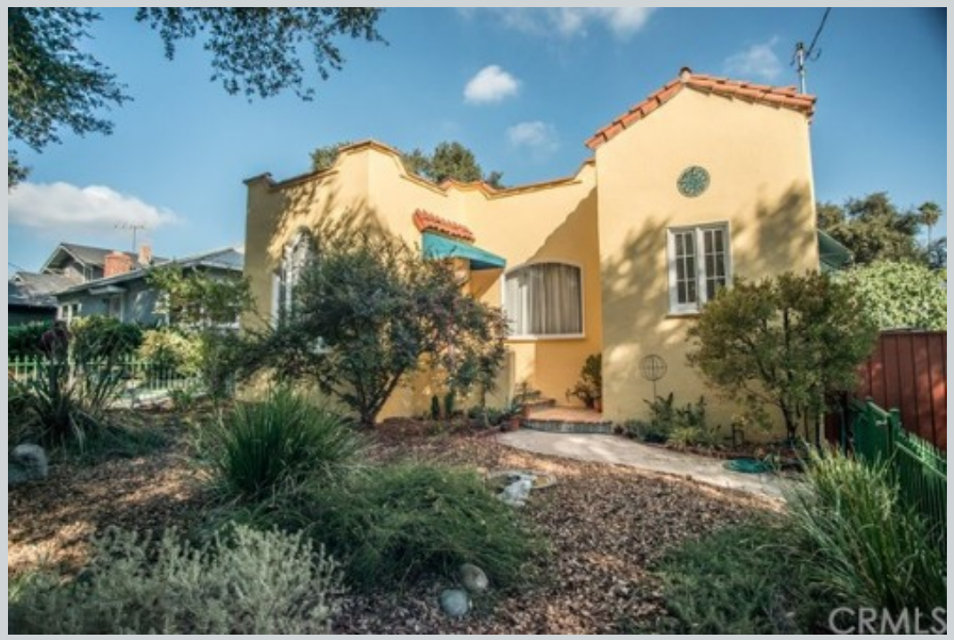
Listing Comp 2 295 E Howard St