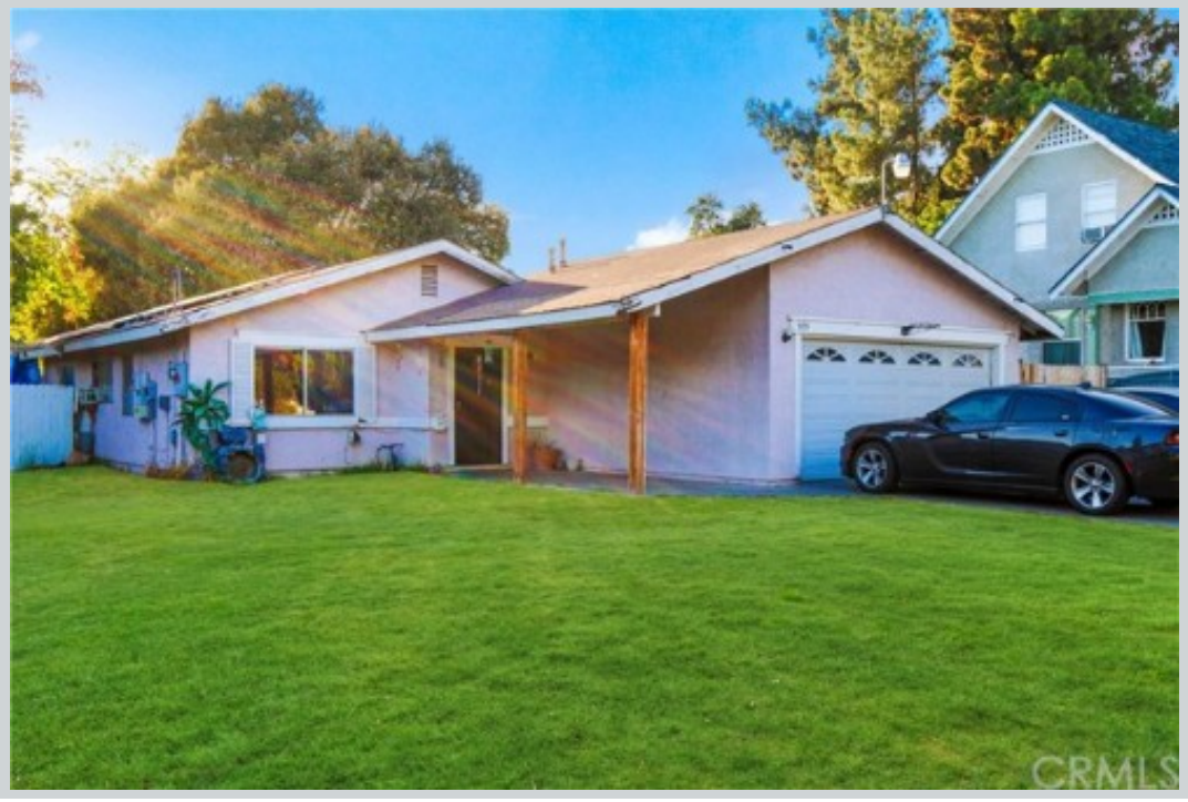
Listing Comp 1 979 N Marengo Ave