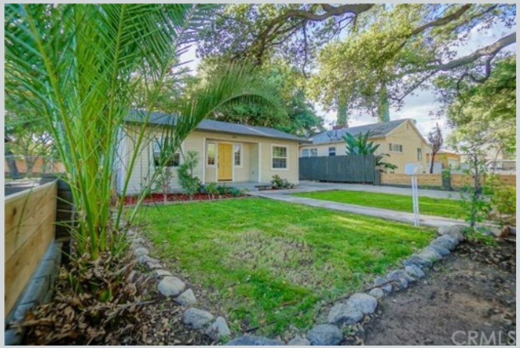
Sold Comp 2 1719 N Summit Ave