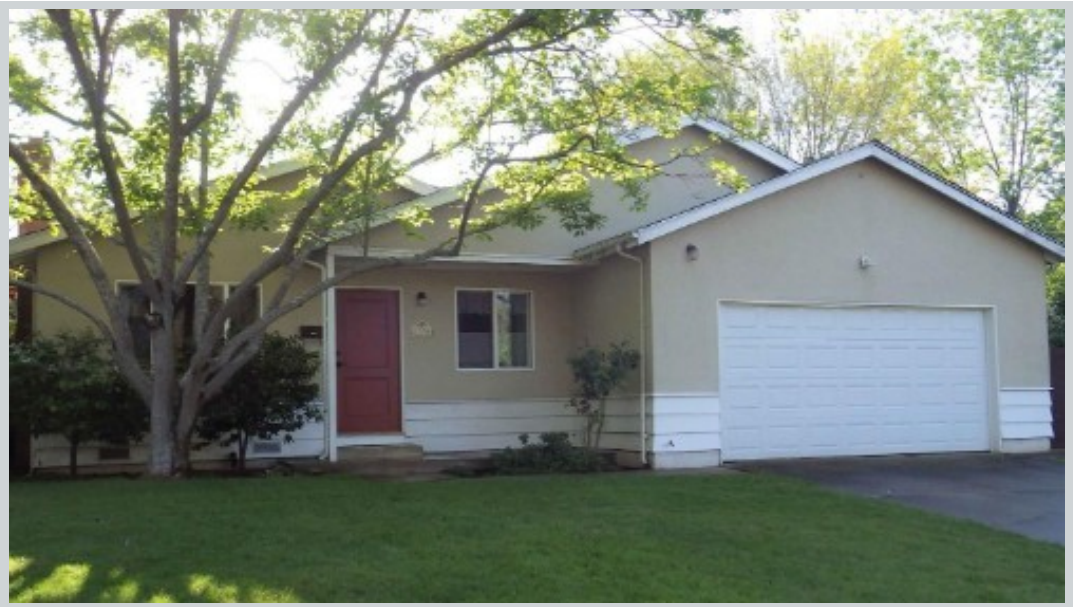
Sold Comp 1 7556 Circuit Dr