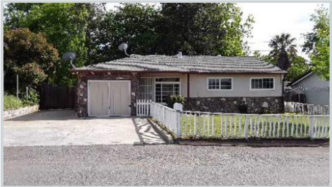
Sold Comp 3 7608 Prince St