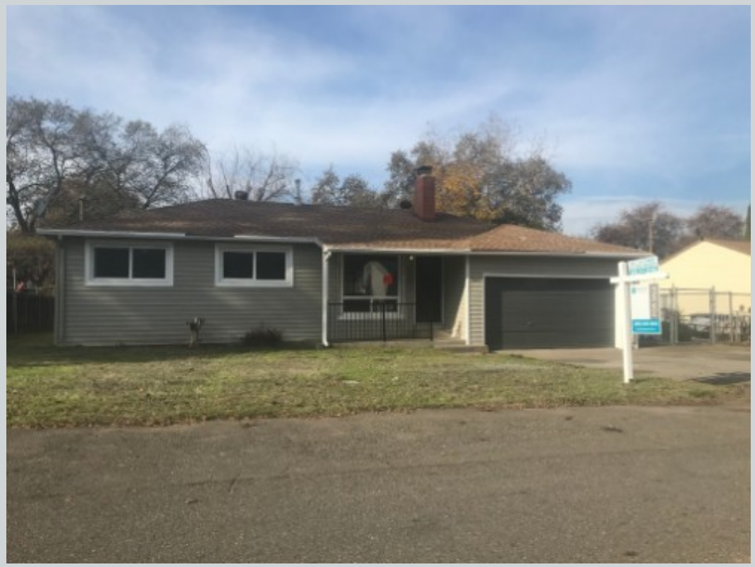
Subject 7508 Prince St