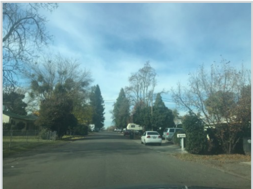
Subject 7508 Prince St