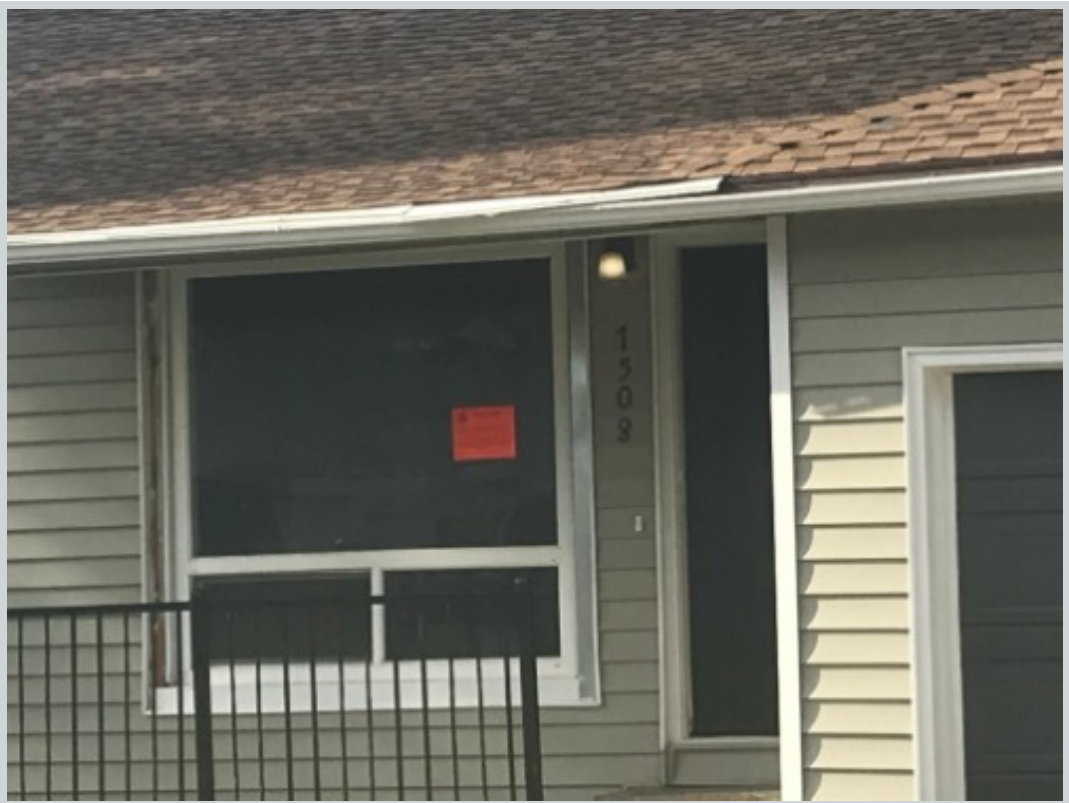
Subject 7508 Prince St