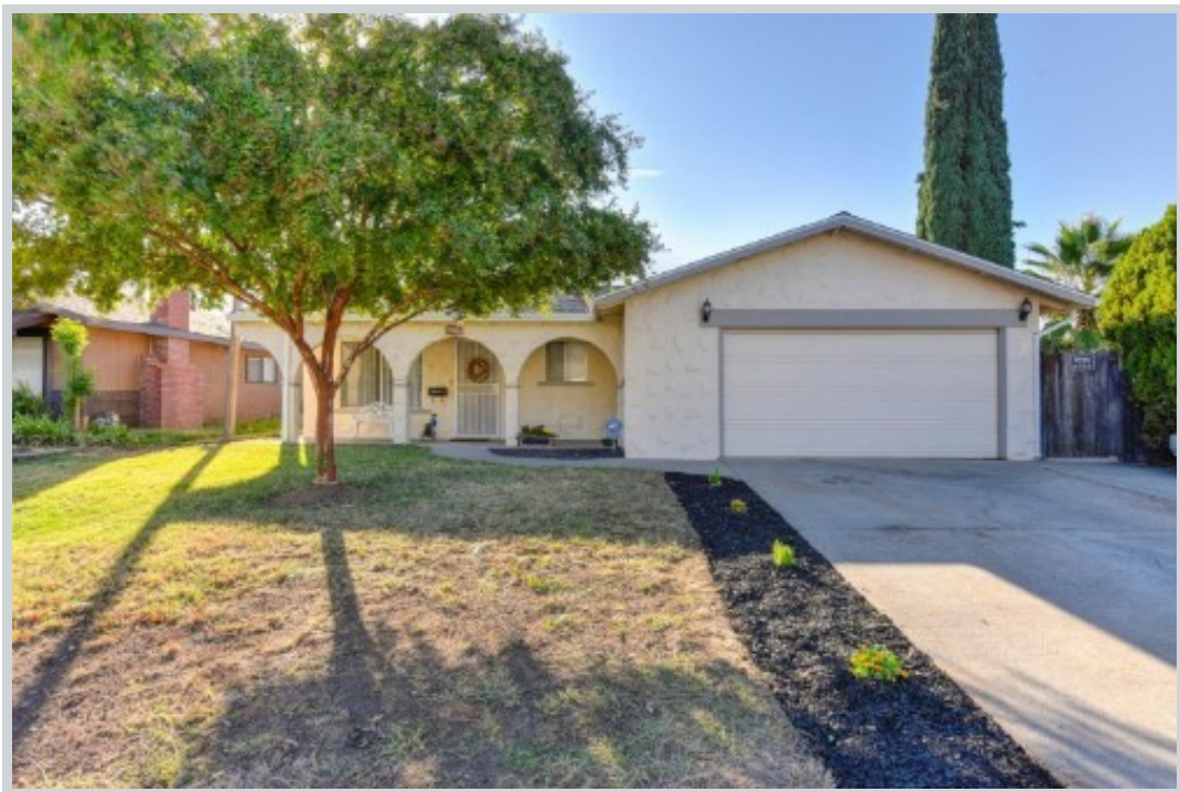
Listing Comp 3 7041 Cobalt Way