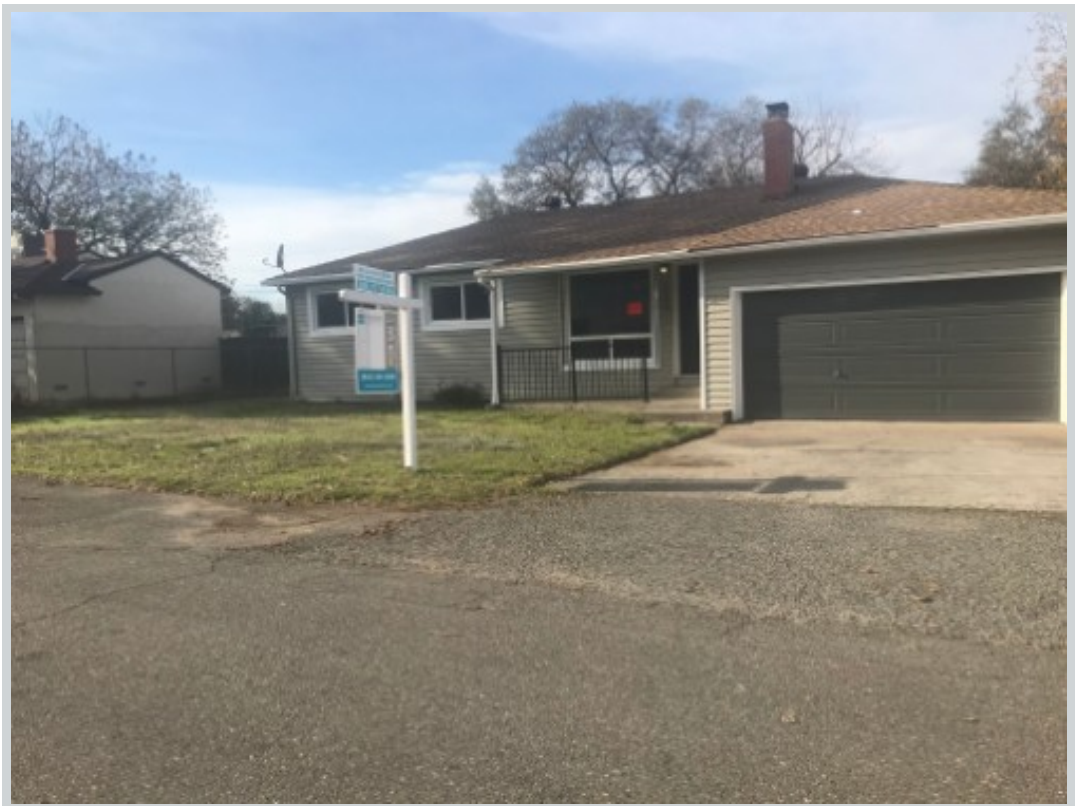
Subject 7508 Prince St