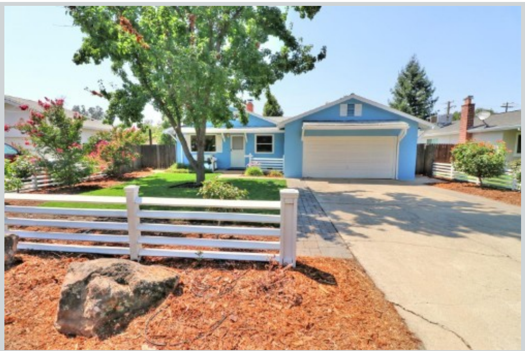
Sold Comp 2 7572 Circuit Dr