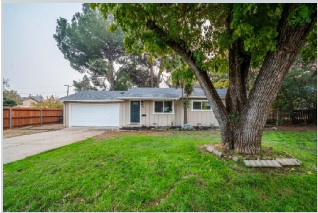
Listing Comp 2 7600 Community Dr