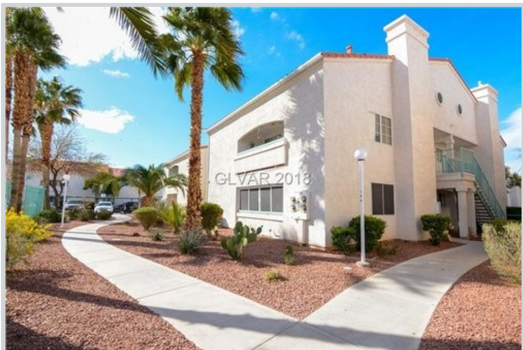
Sold Comp 3 2725 S Nellis Blvd Unit 2070 View Front