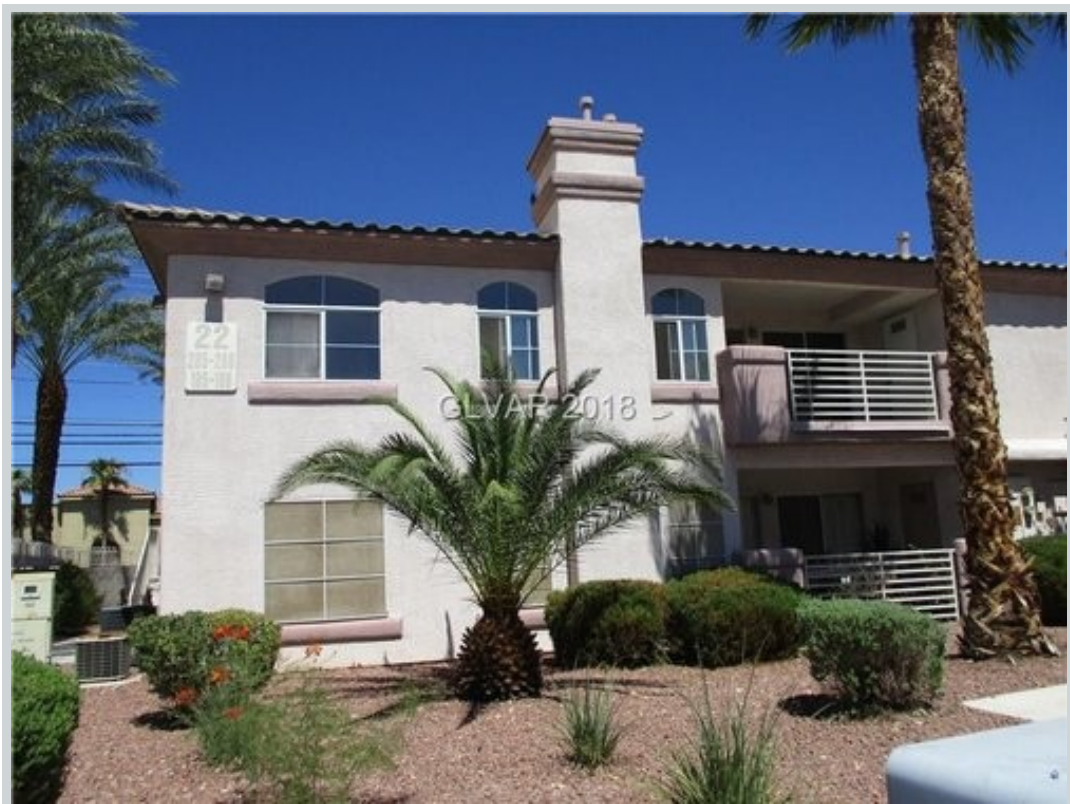
Listing Comp 3 4555 E Sahara Ave Unit 185