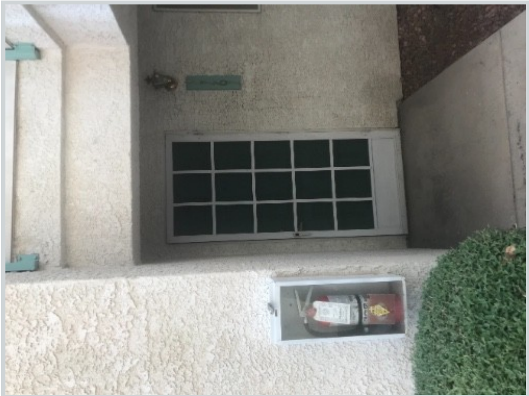
Subject 2725 S Nellis Blvd Unit 1161