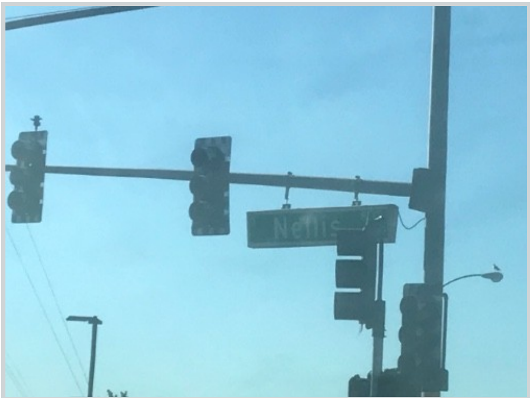
Subject 2725 S Nellis Blvd Unit 1161