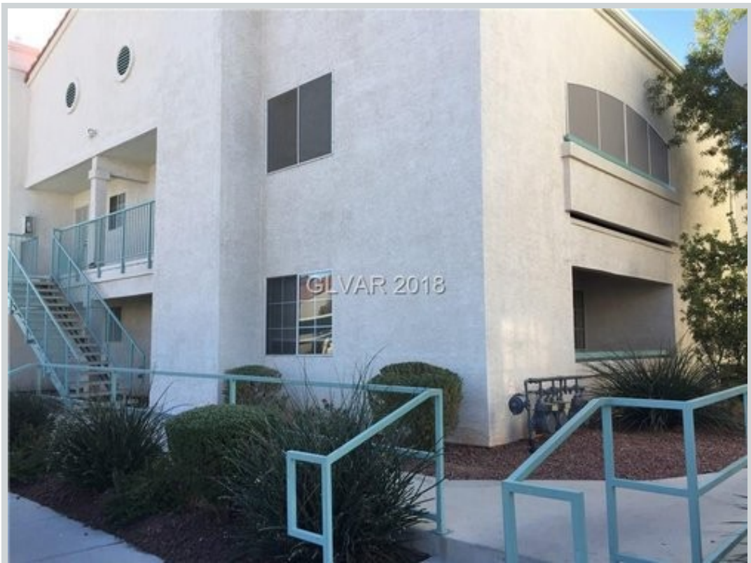
Listing Comp 1 2725 S Nellis Blvd Unit 1166