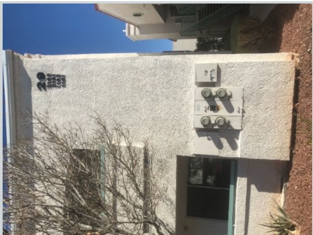
Subject 2725 S Nellis Blvd Unit 1161