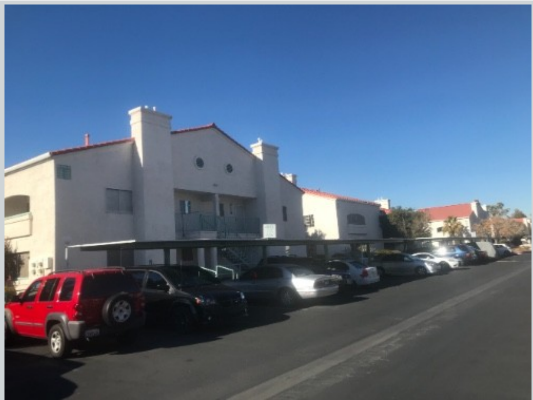
Subject 2725 S Nellis Blvd Unit 1161