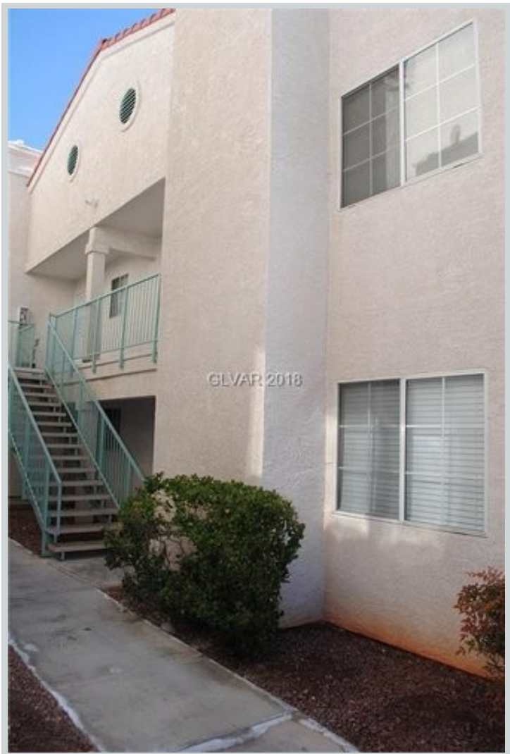
Sold Comp 2 2725 S Nellis Blvd Unit 1180 View Front