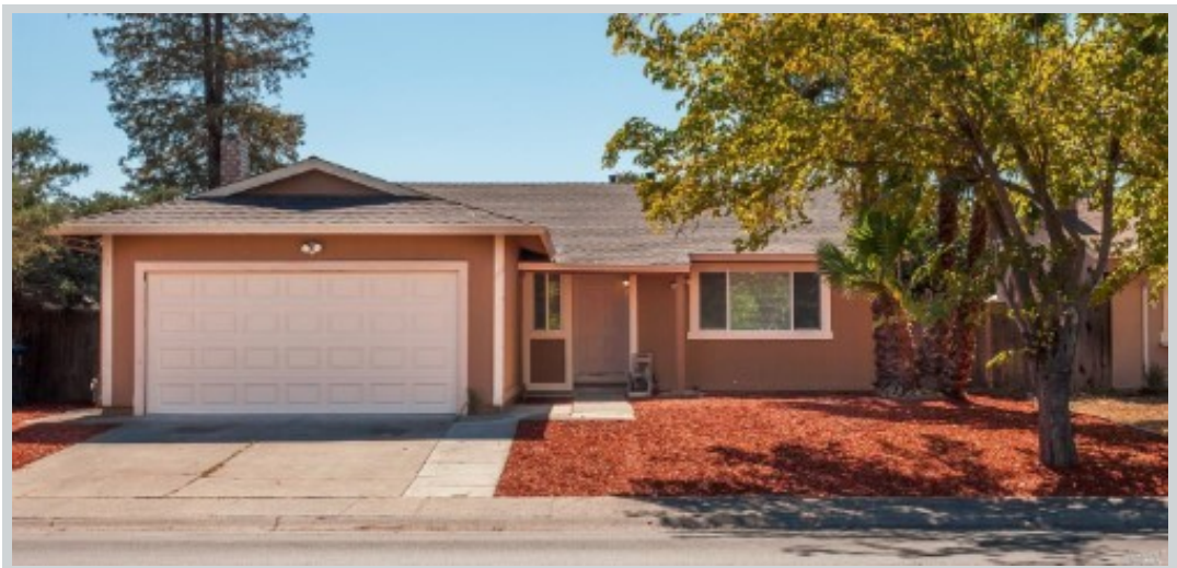
Sold Comp 1 341 Pintail