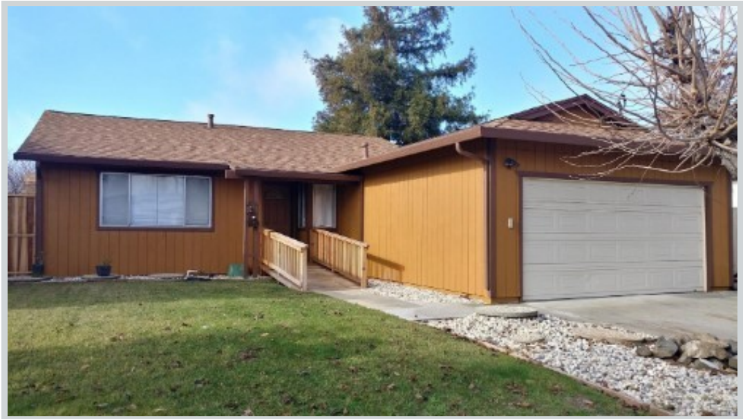
Listing Comp 3 810 Tree Duck