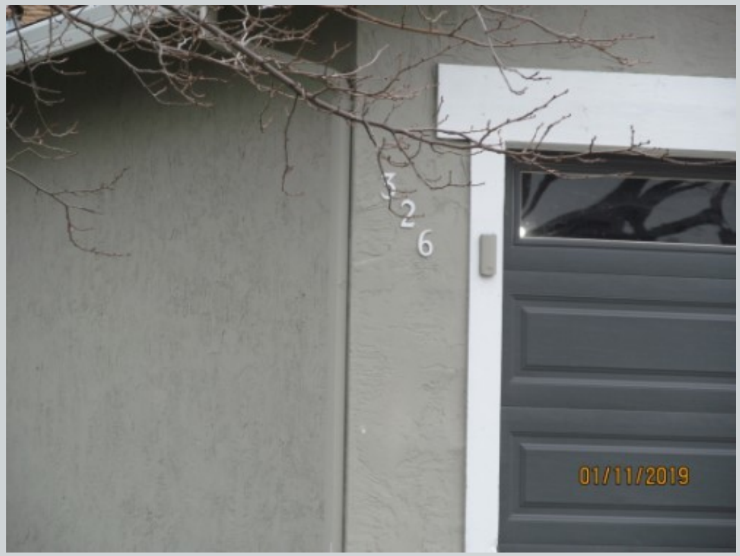
Subject 326 Spoonbill Ln