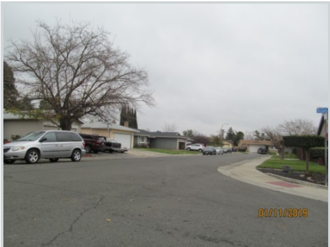
Subject 326 Spoonbill Ln