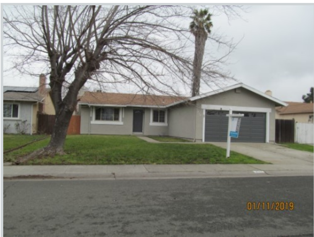
Subject 326 Spoonbill Ln