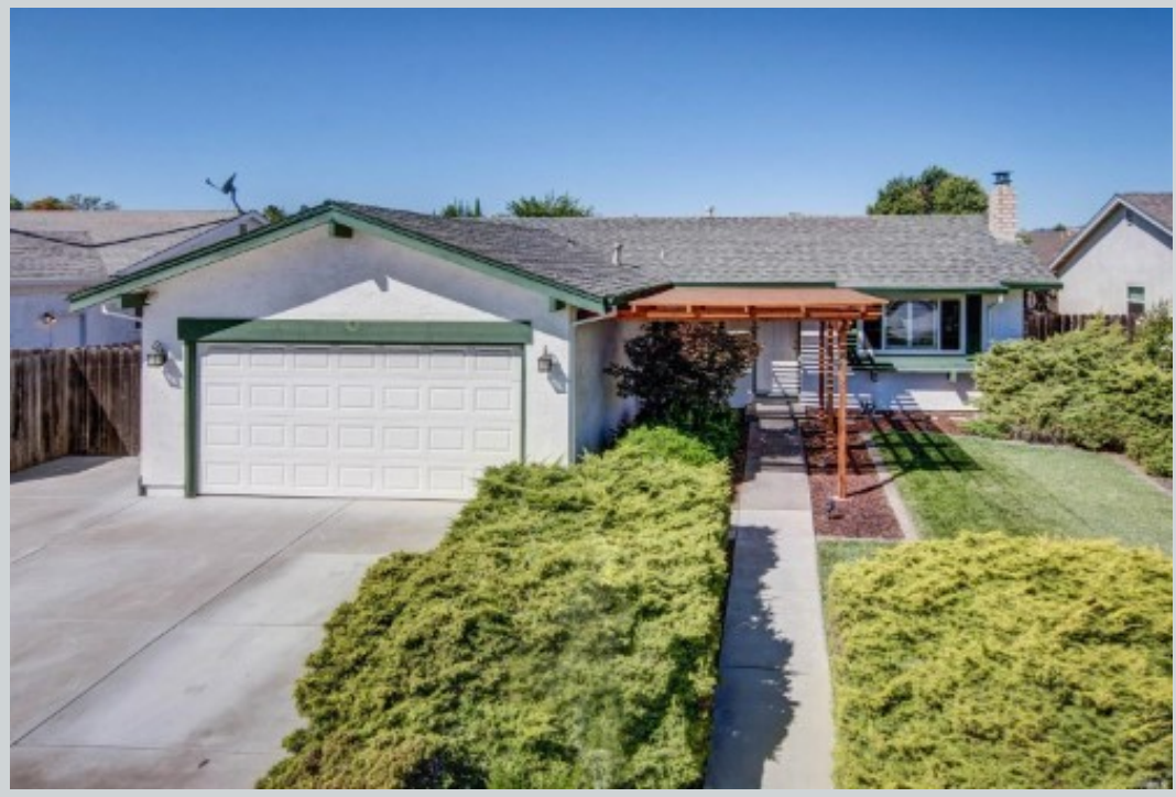
Sold Comp 2 812 Spoonbill