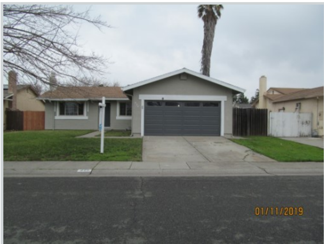
Subject 326 Spoonbill Ln