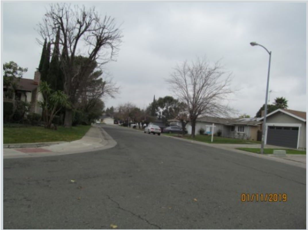
Subject 326 Spoonbill Ln