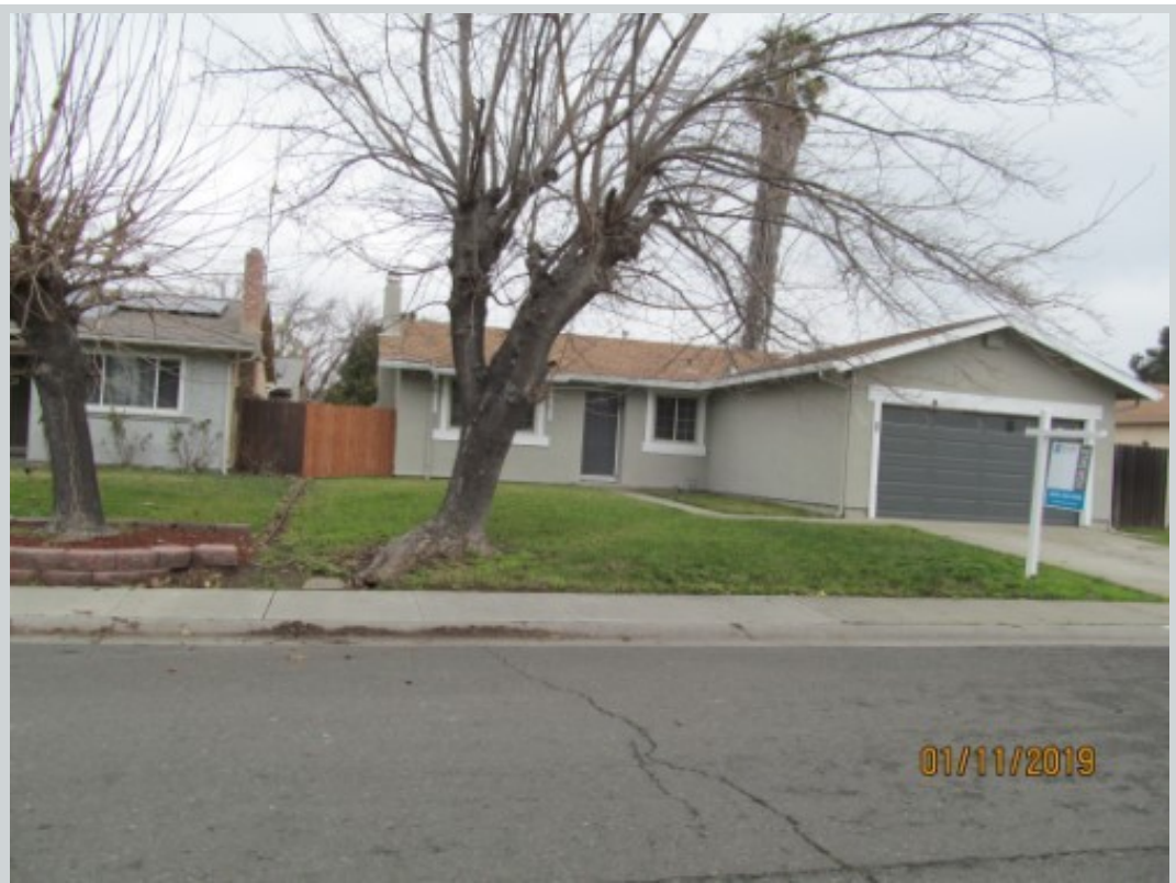
Subject 326 Spoonbill Ln