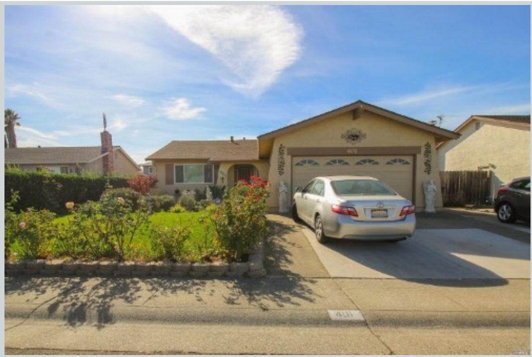
Sold Comp 3 401 Ring Neck