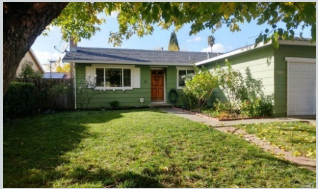
Listing Comp 1 806 Blossom