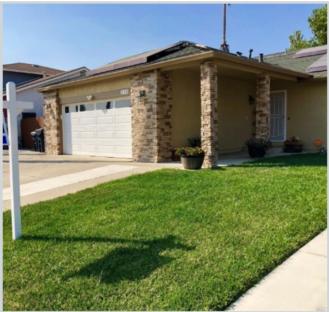
Listing Comp 2 610 Canvasback