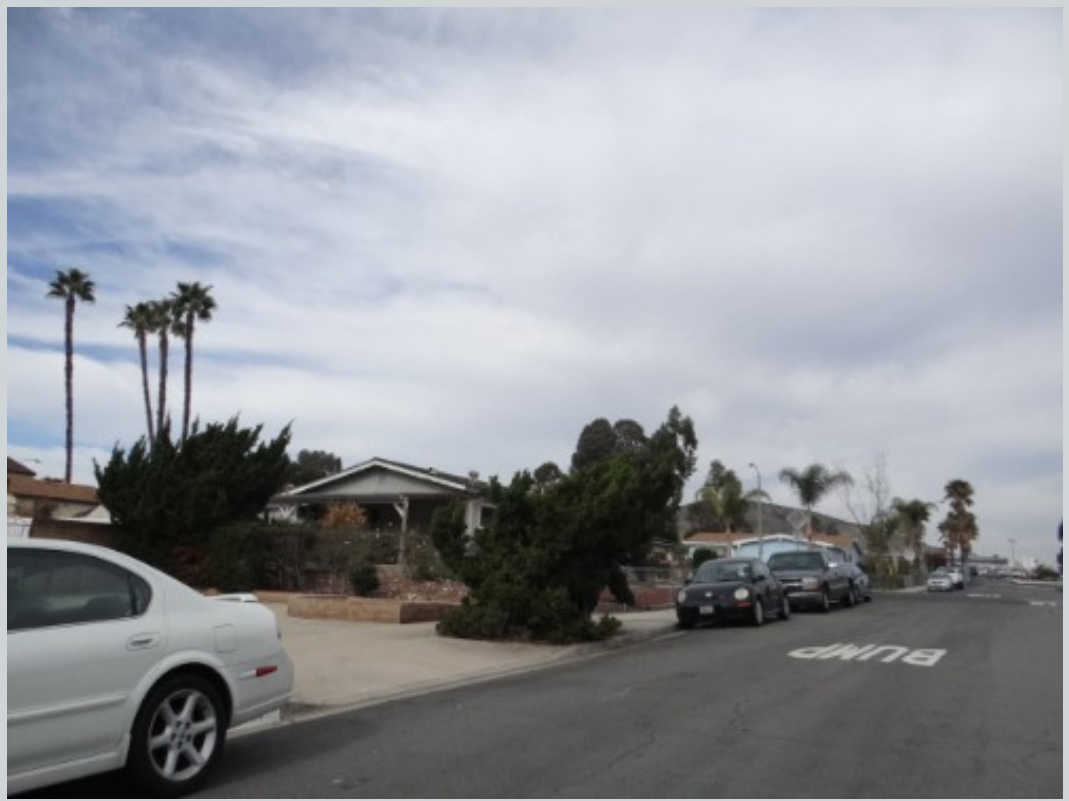
Subject 9356 Oakbourne Rd