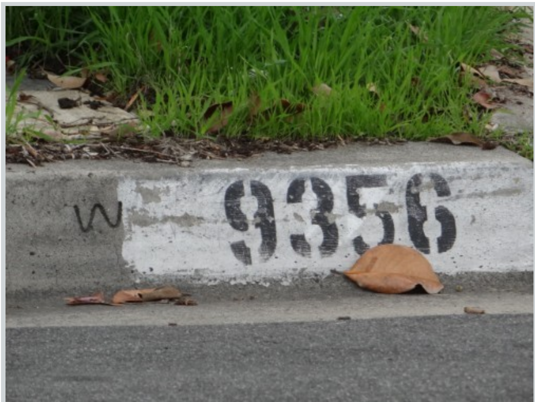
Subject 9356 Oakbourne Rd