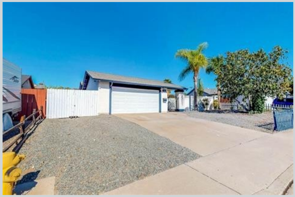
Listing Comp 2 9124 Maranda Drive