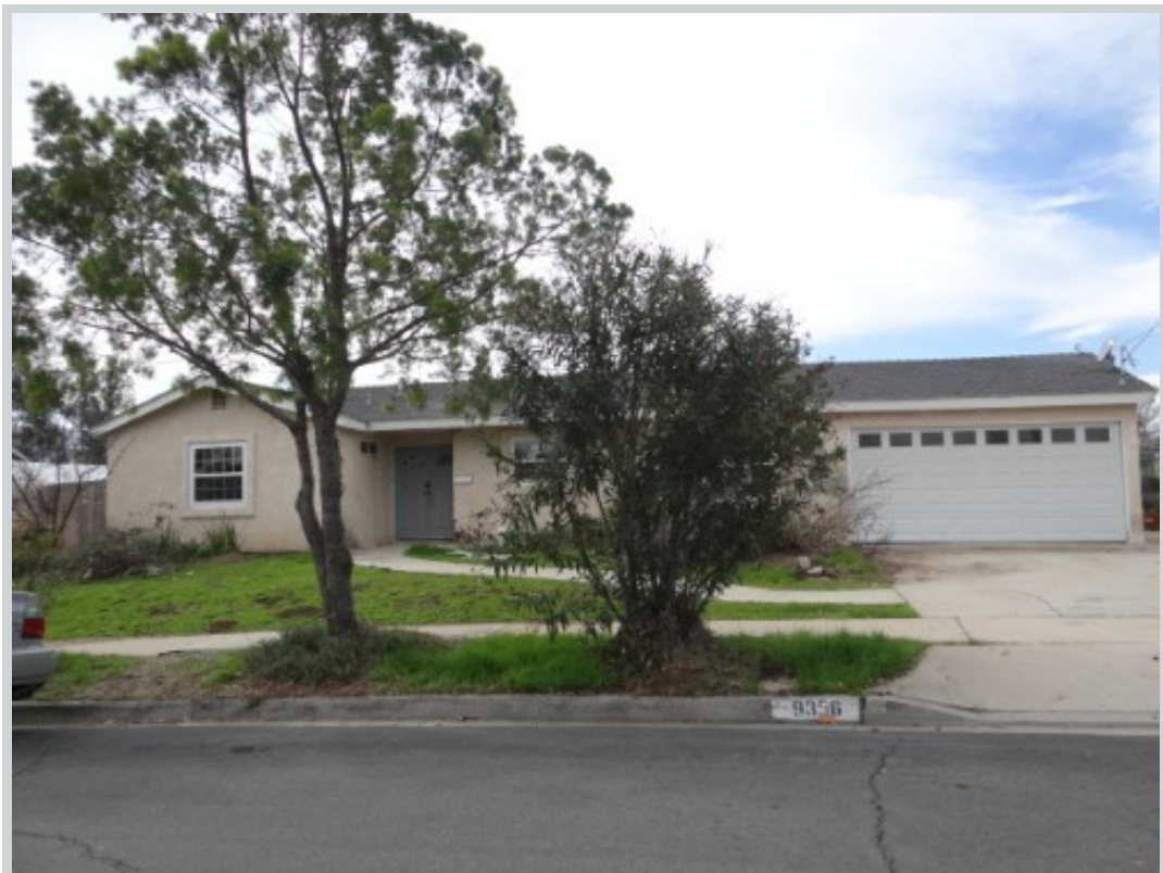
Subject 9356 Oakbourne Rd

Address 9356 Oakbourne Road, Santee, CA 92071 Loan Number 32021 Suggested List $530,000 Suggested Repaired $530,000 Sale $520,000