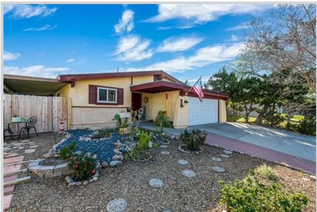
Sold Comp 2 8349 Rumson Dr