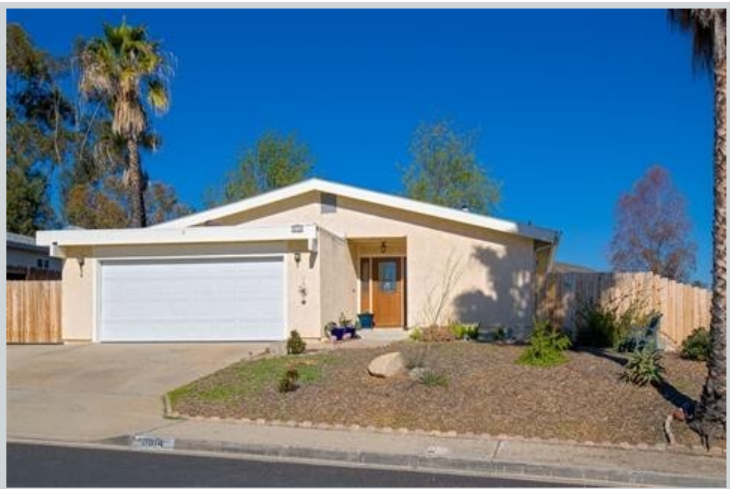
Listing Comp 1 8614 Rumson Dr