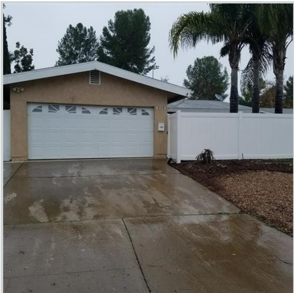
Sold Comp 1 8338 Rumson Drive