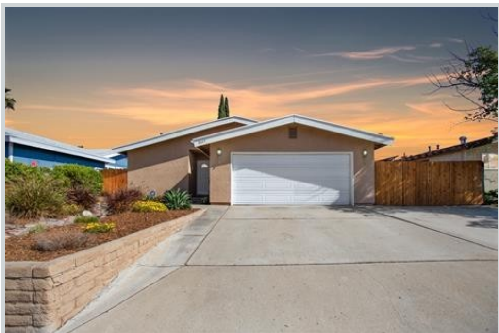
Sold Comp 3 8443 Carlton Oaks Dr