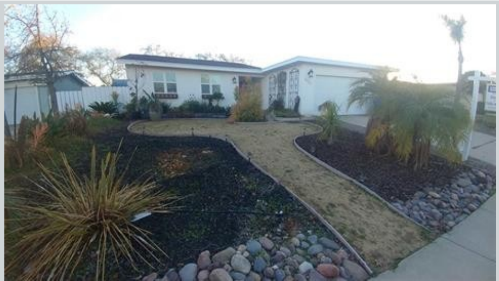
Listing Comp 3 8723 Rumson D