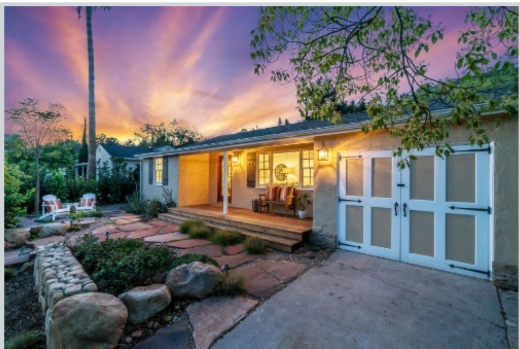
Sold Comp 1 3064 Lucinda Ln