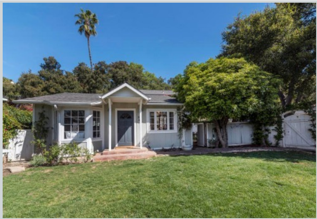
Listing Comp 3 808 Cheltenham Rd