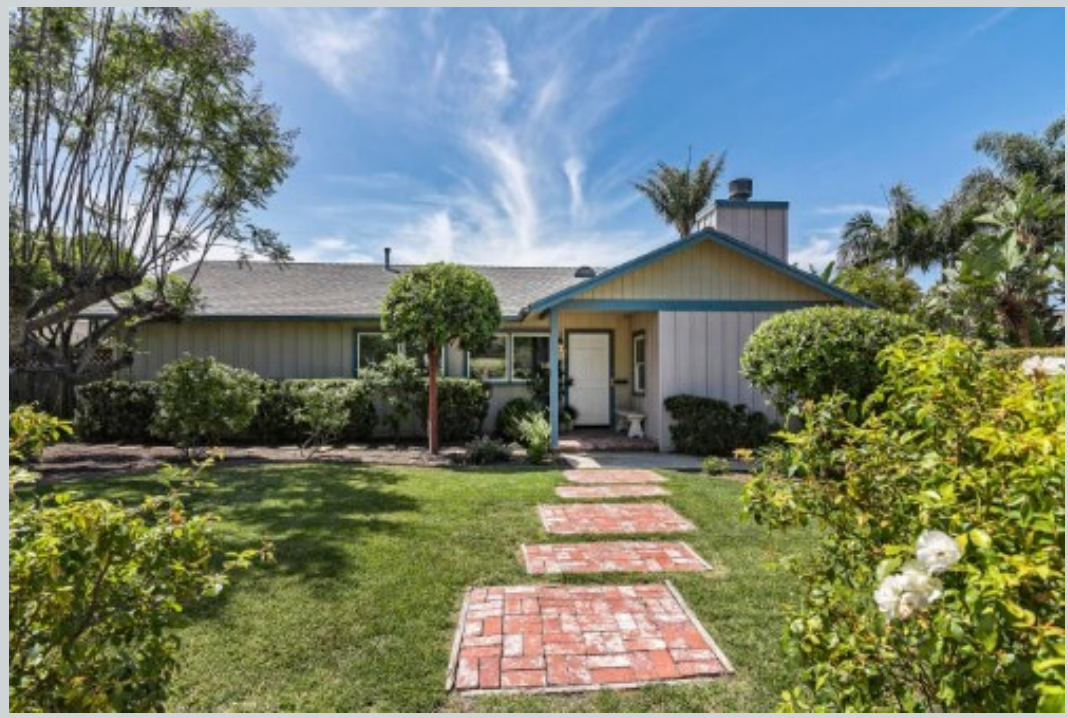
Listing Comp 1 3043 Paseo Tranquillo