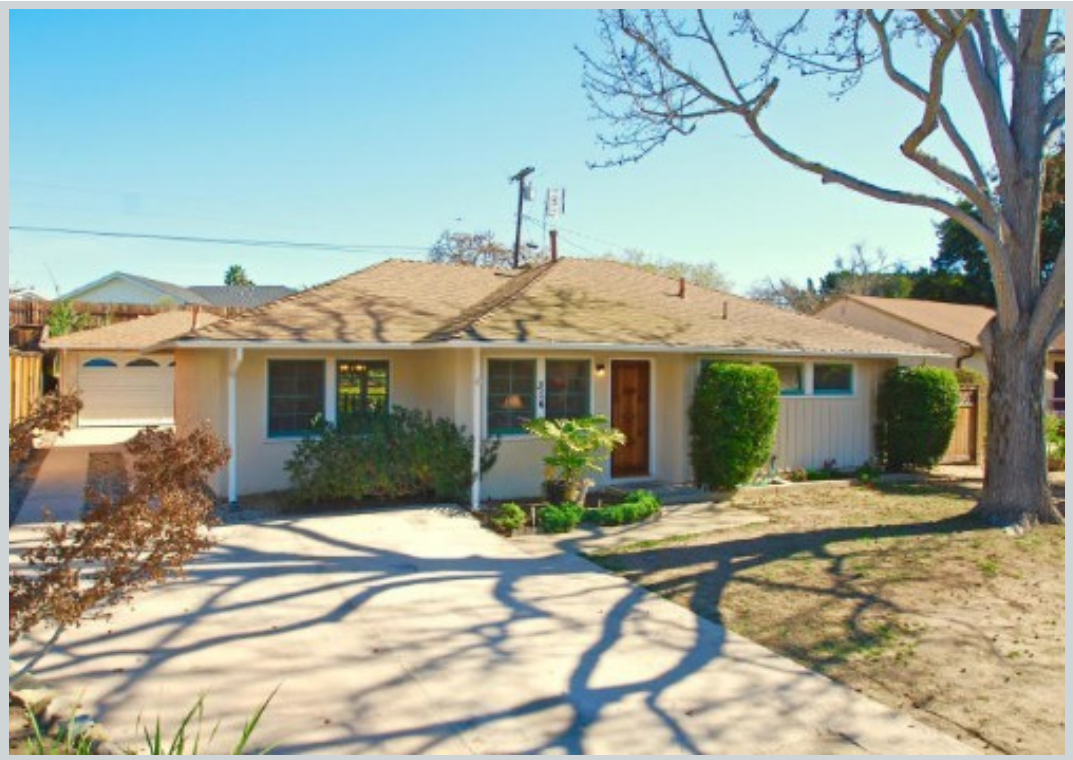
Sold Comp 2 314 E Calle Laureles