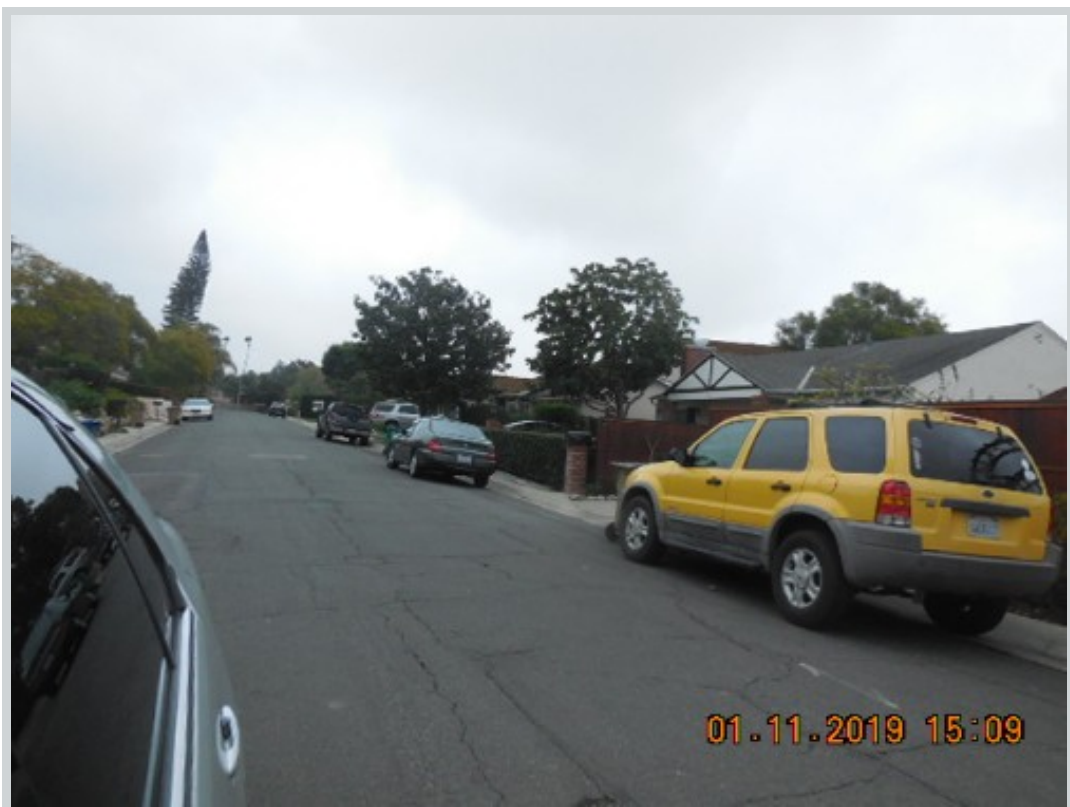
Subject 3055 Lucinda Ln