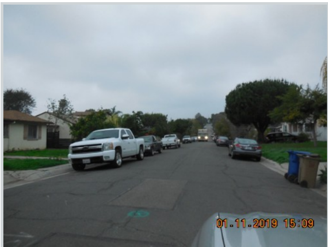
Subject 3055 Lucinda Ln

Address 3055 Lucinda Lane, Santa Barbara, CA 93105 Loan Number 32080 Suggested List $1,025,000 Suggested Repaired $1,025,000 Sale $1,010,000