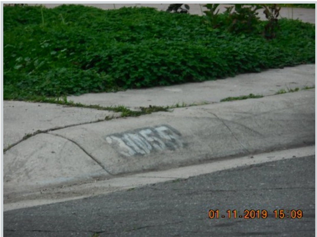
Subject 3055 Lucinda Ln