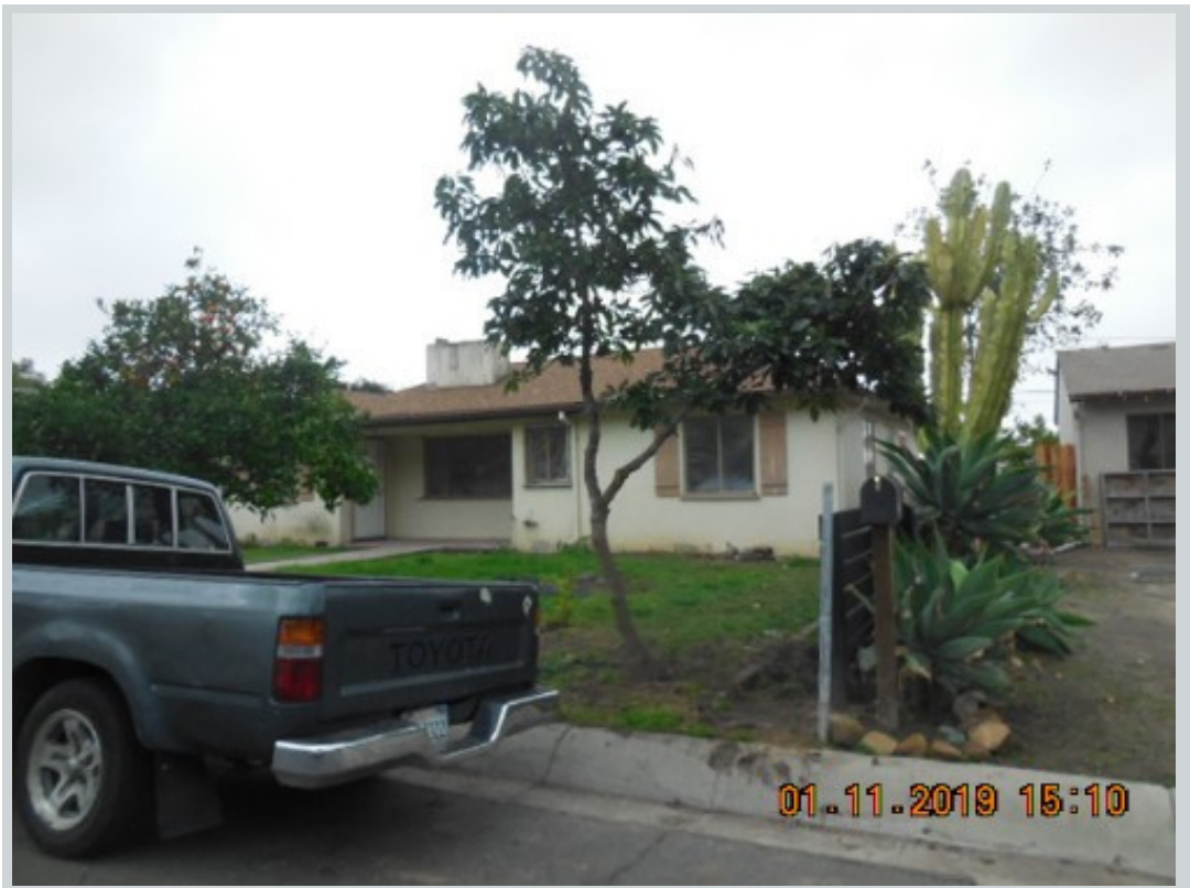
Subject 3055 Lucinda Ln