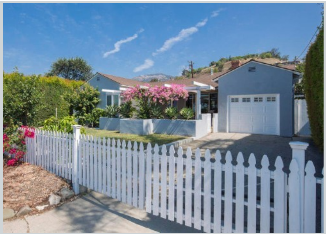
Sold Comp 3 3056 Foothill Rd