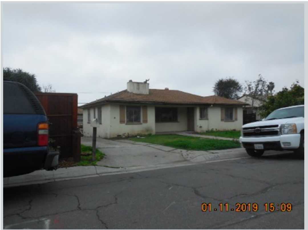
Subject 3055 Lucinda Ln

Address 3055 Lucinda Lane, Santa Barbara, CA 93105 Loan Number 32080 Suggested List $1,025,000 Suggested Repaired $1,025,000 Sale $1,010,000