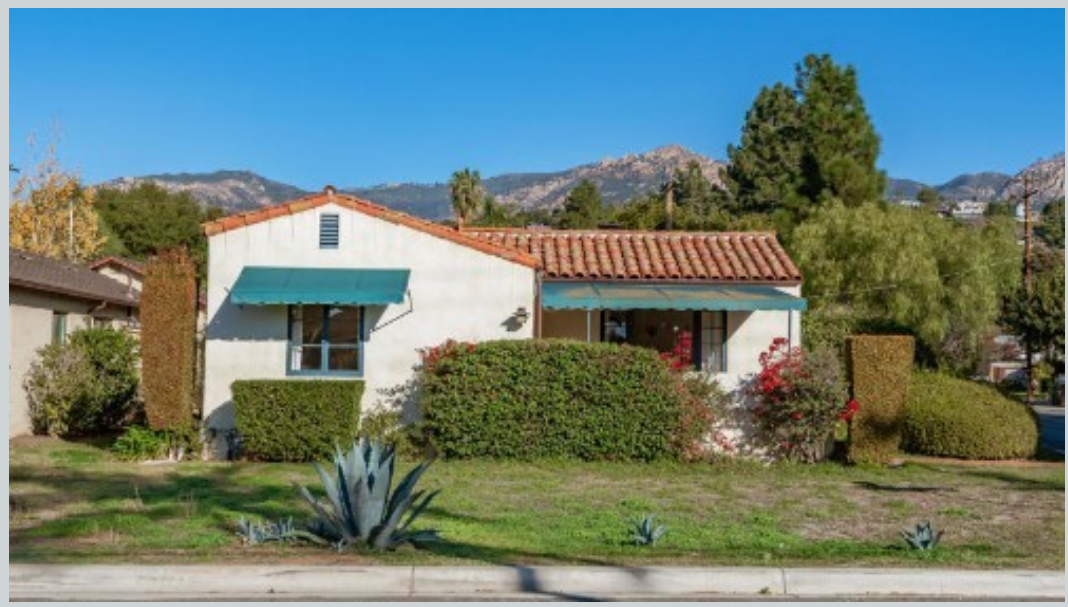
Listing Comp 2 2900 Puesta Del Sol