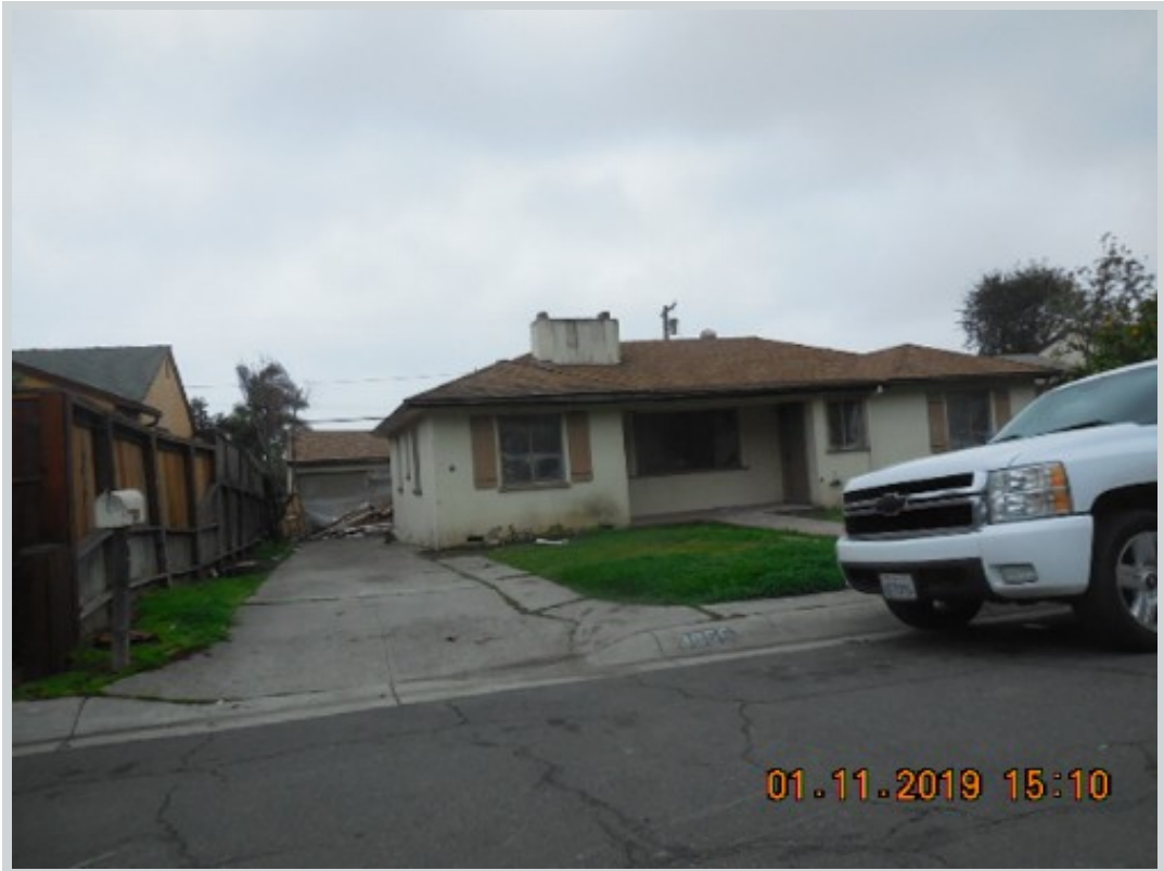
Subject 3055 Lucinda Ln