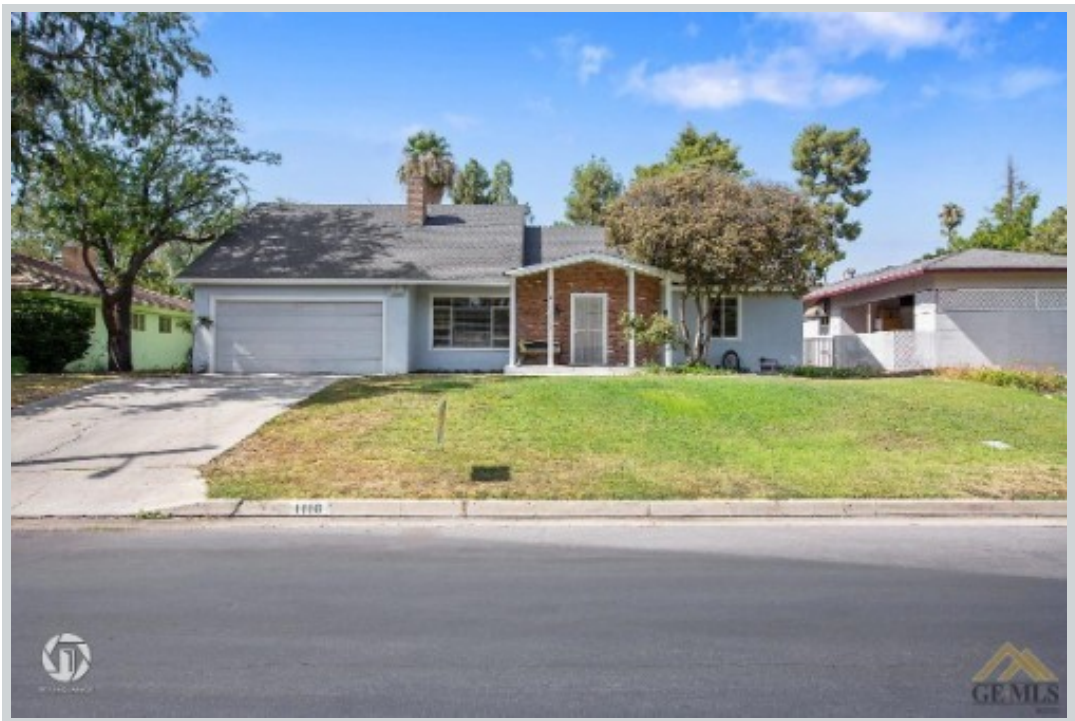
Listing Comp 3 1116 Princeton Ave