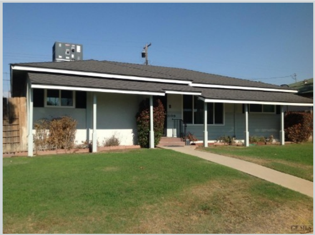
Sold Comp 3 3109 Haley St