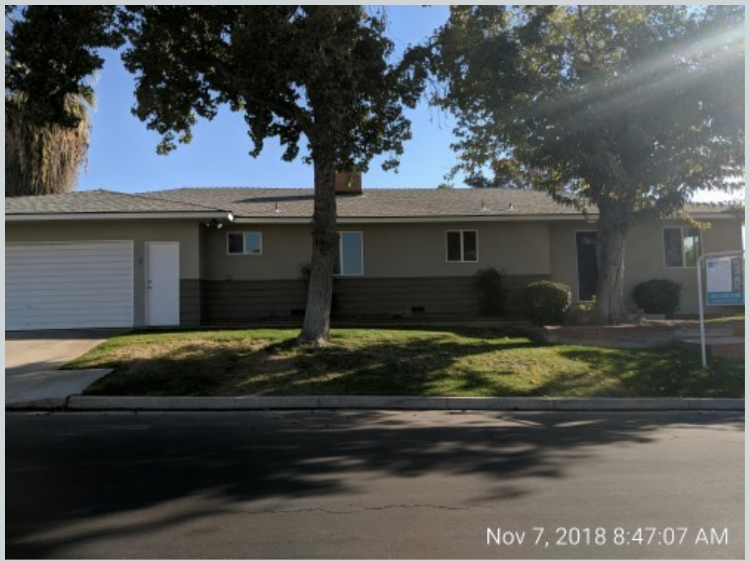
Subject 3701 Bryn Mawr Dr