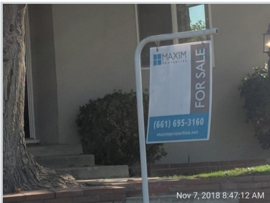
Subject 3701 Bryn Mawr Dr