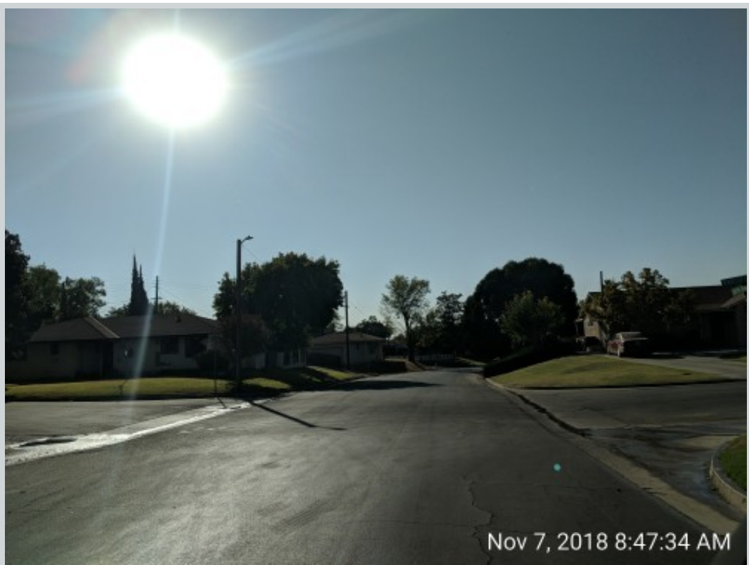
Subject 3701 Bryn Mawr Dr