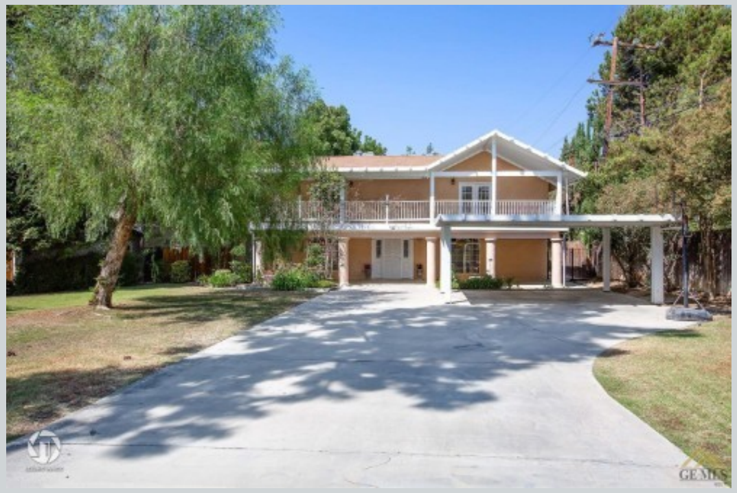
Sold Comp 1 3120 La Cresta Dr