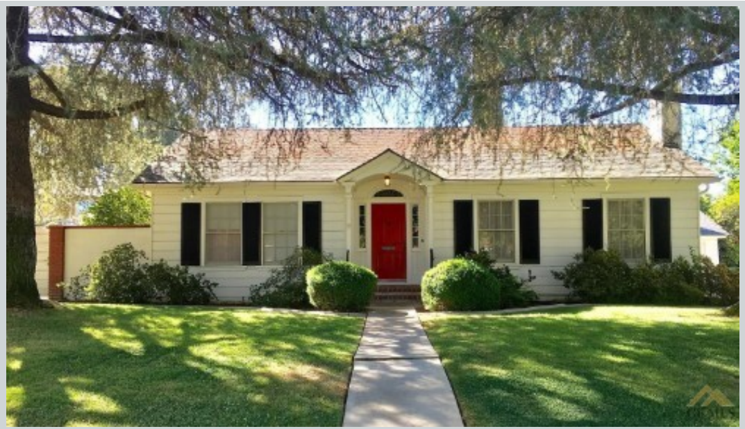
Sold Comp 2 261 Hermosa