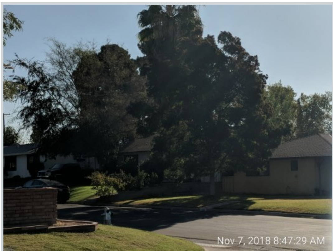
Subject 3701 Bryn Mawr Dr