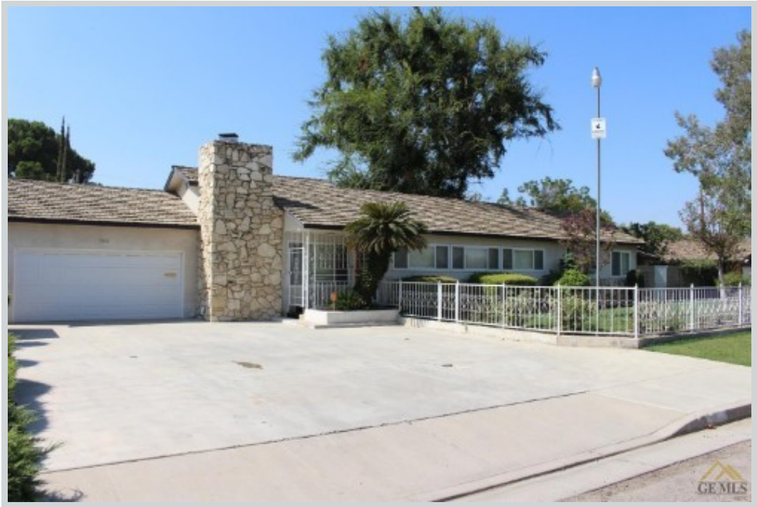
Listing Comp 2 711 Acacia Ave