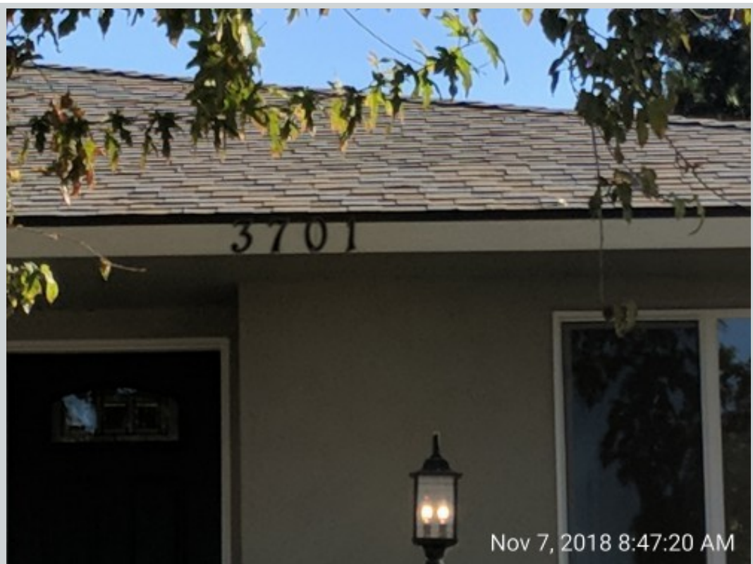
Subject 3701 Bryn Mawr Dr