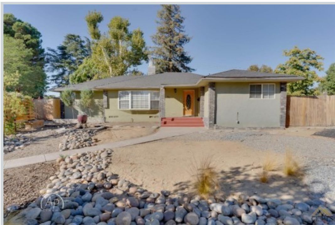
Listing Comp 1 501 Hillcrest Dr