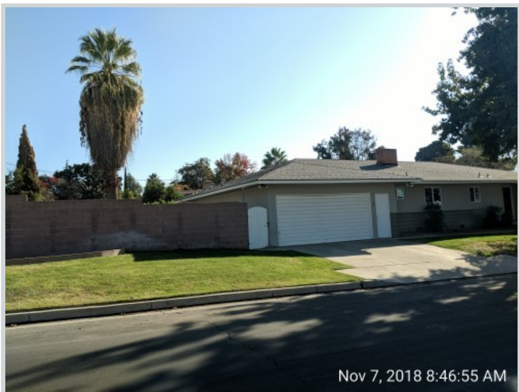
Subject 3701 Bryn Mawr Dr

Address 3701 Bryn Mawr Drive, Bakersfield, CA 93305 Loan Number 32101 Suggested List $250,000 Suggested Repaired $250,000 Sale $250,000