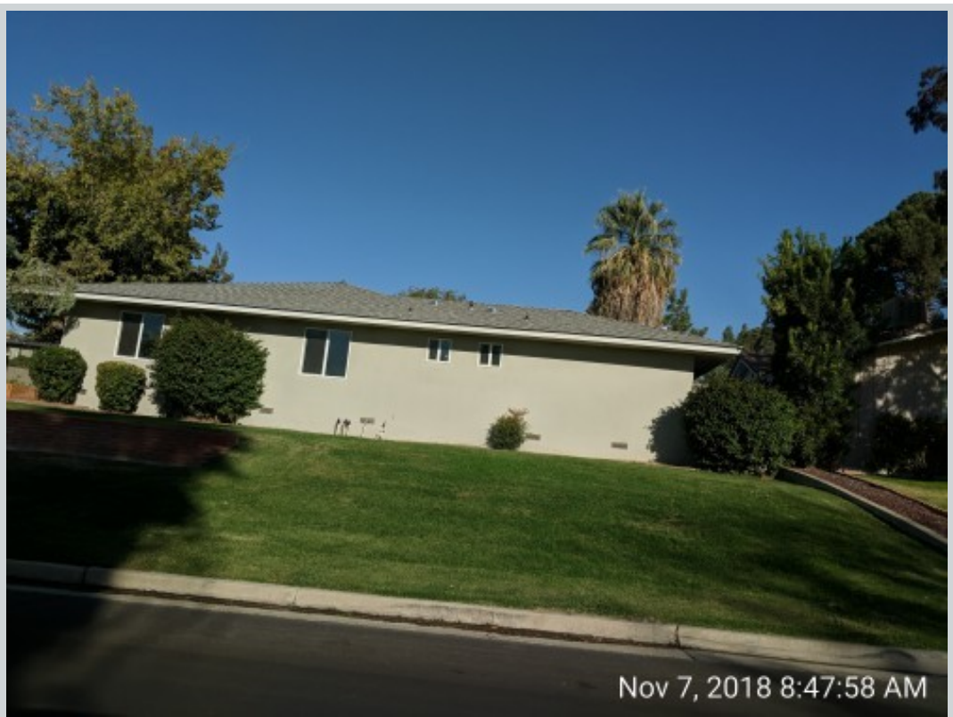
Subject 3701 Bryn Mawr Dr