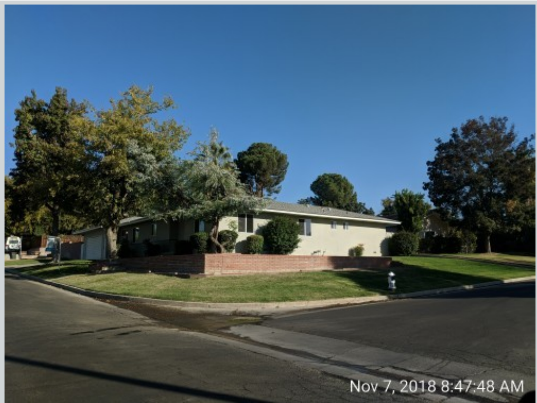
Subject 3701 Bryn Mawr Dr