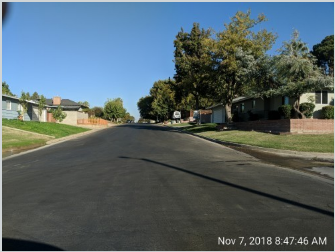
Subject 3701 Bryn Mawr Dr