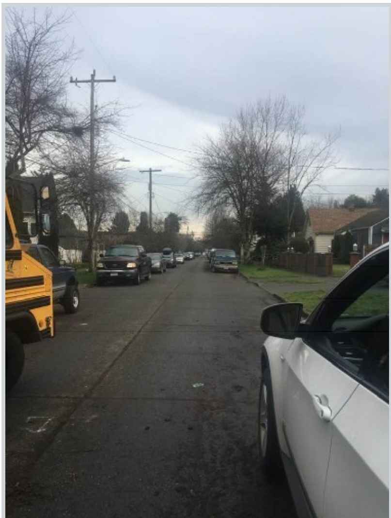
Subject 723 S Southern St