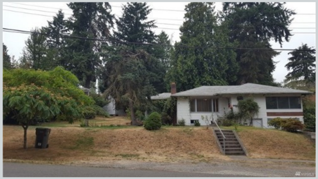
Listing Comp 1 10229 1st Ave Sw