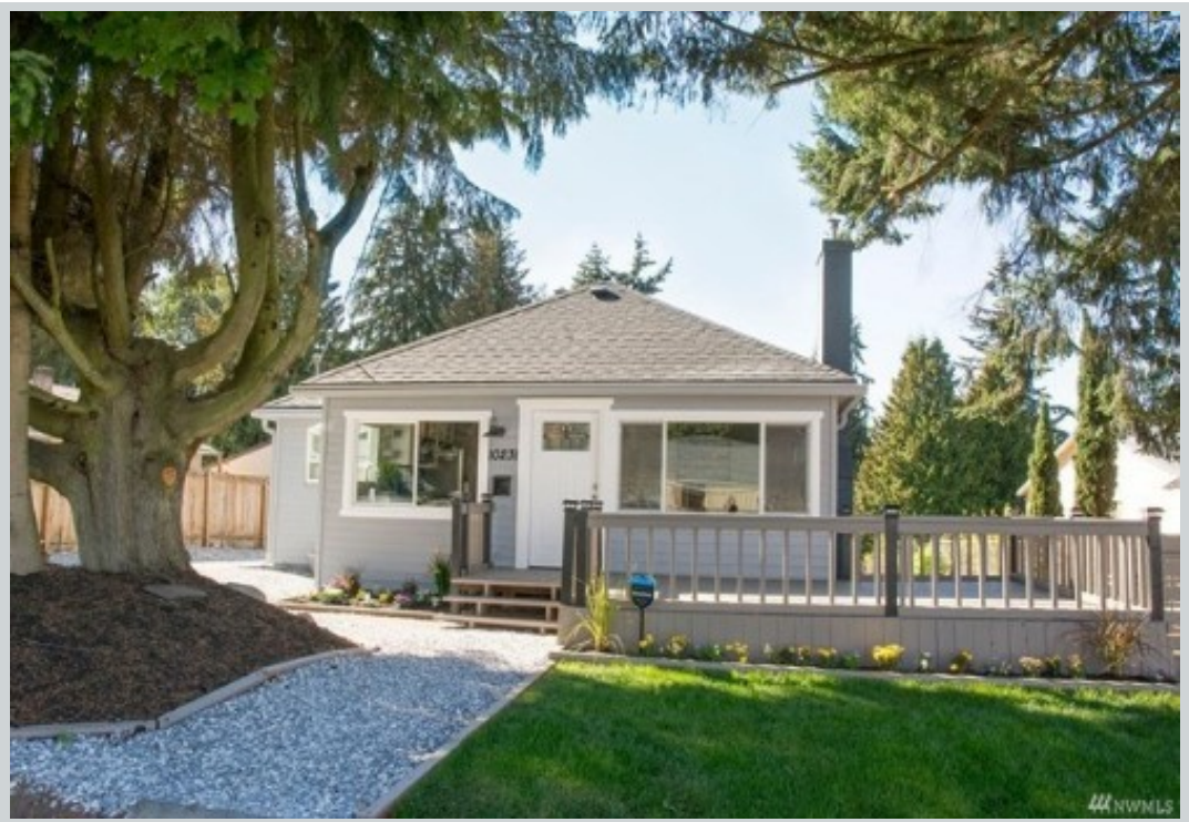
Listing Comp 2 10231 1st Ave S