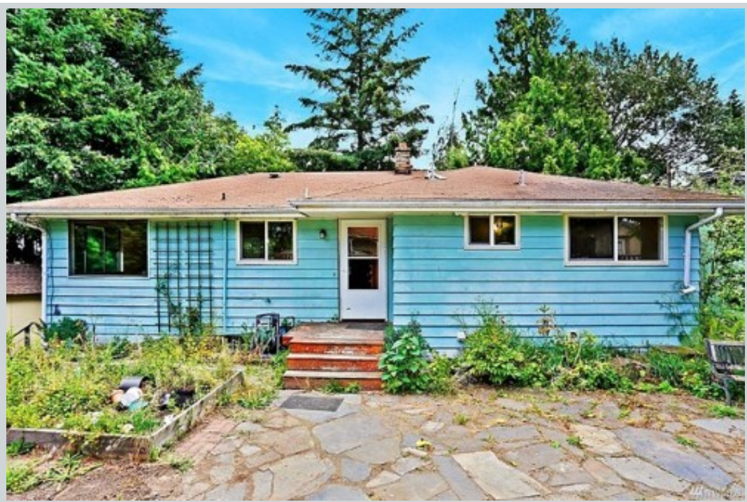
Sold Comp 2 8100 8th Ave Sw

Address 723 S Southern Street, Seattle, WA 98108 Loan Number 32102 Suggested List $455,000 Suggested Repaired $455,000 Sale $455,000