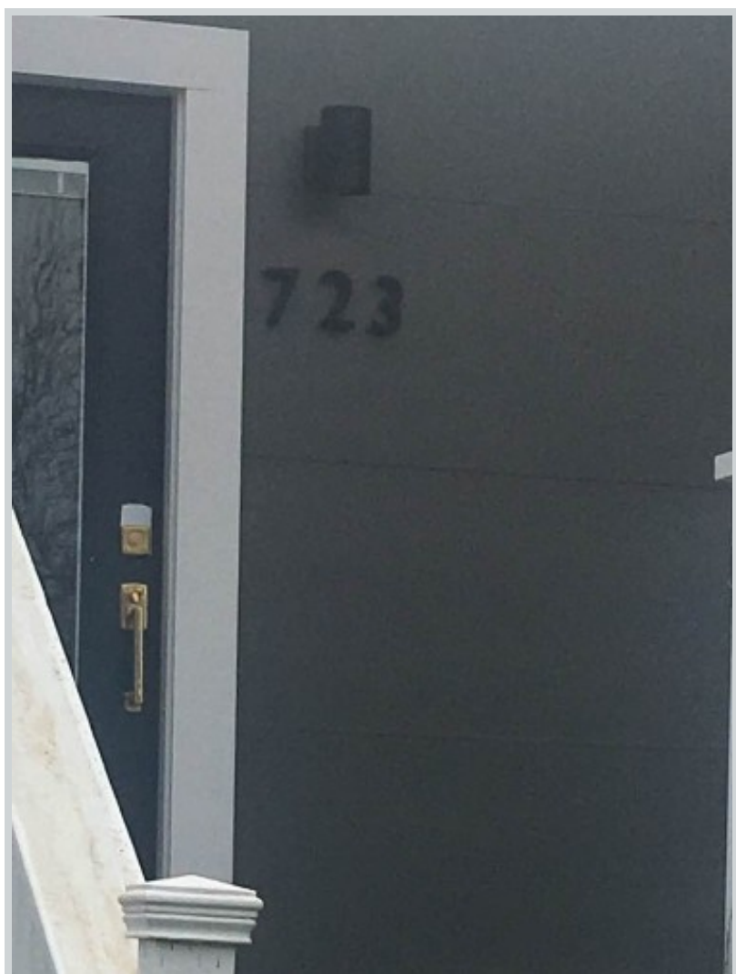
Subject 723 S Southern St