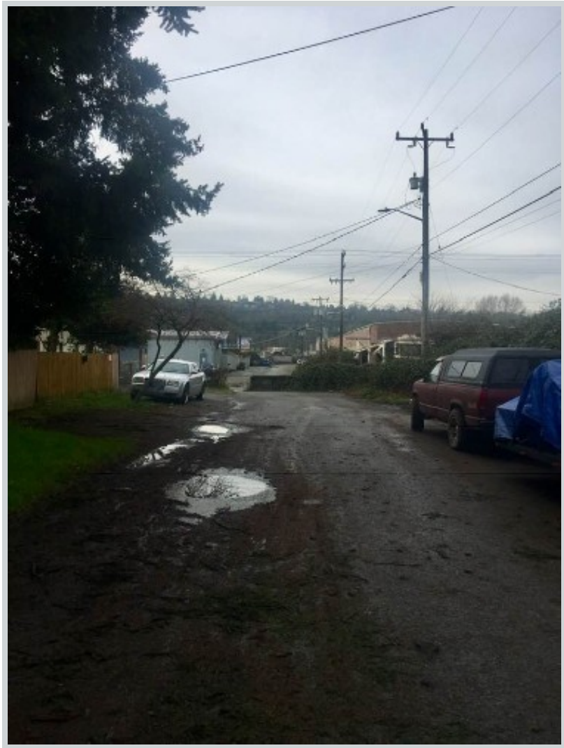
Subject 723 S Southern St