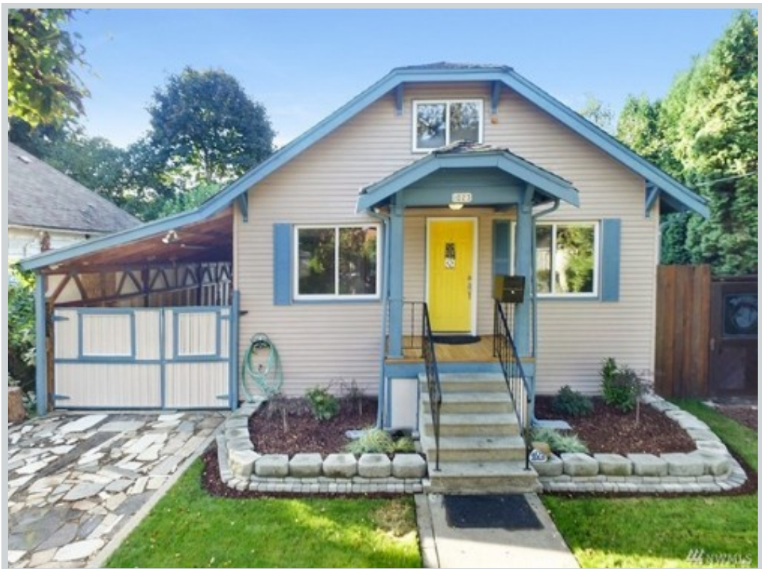
Sold Comp 1 1023 S Thistle St