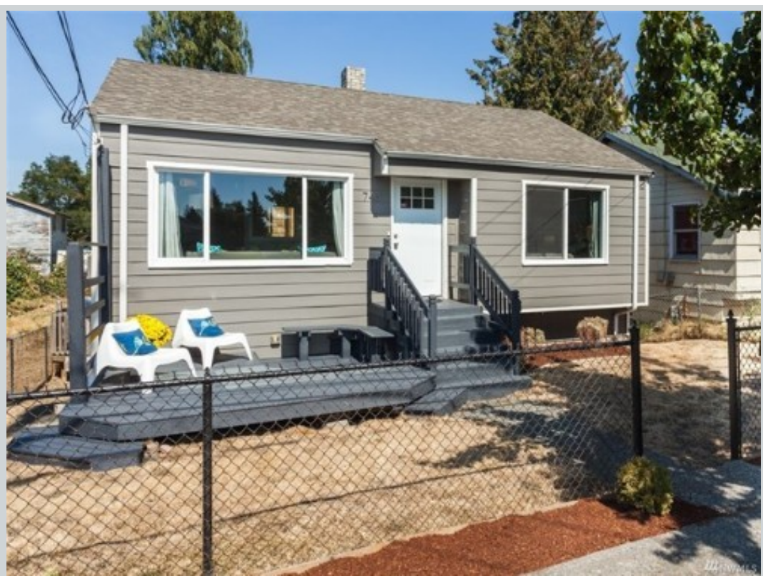
Sold Comp 3 748 S Kenyon St