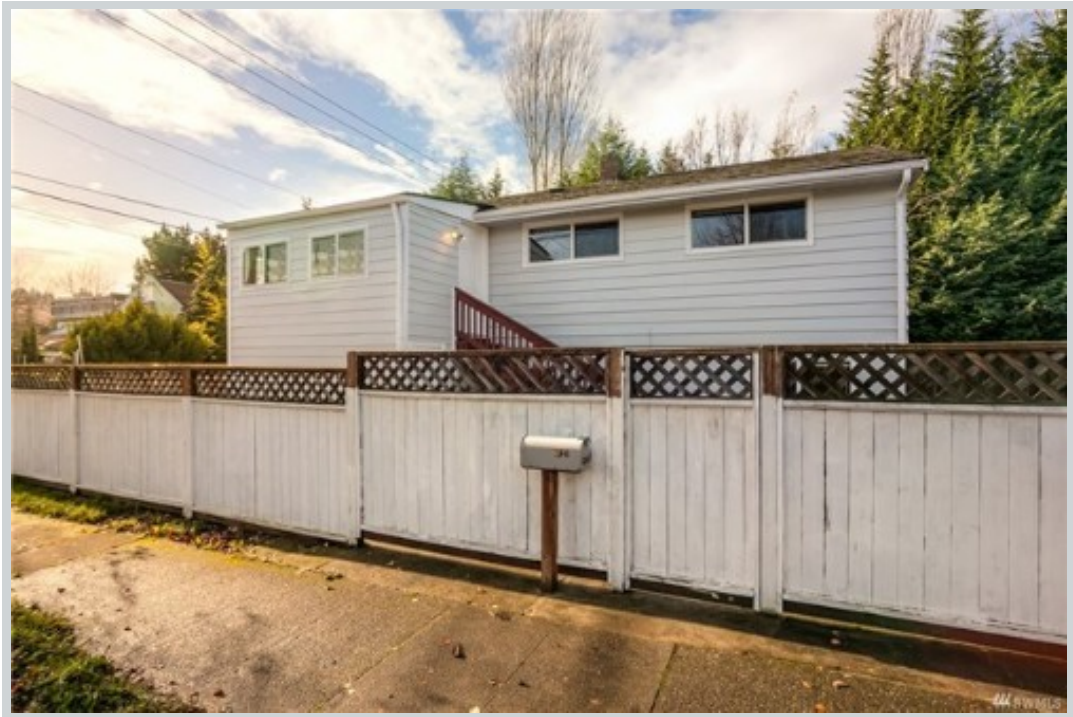
Listing Comp 3 9021 8th Ave S