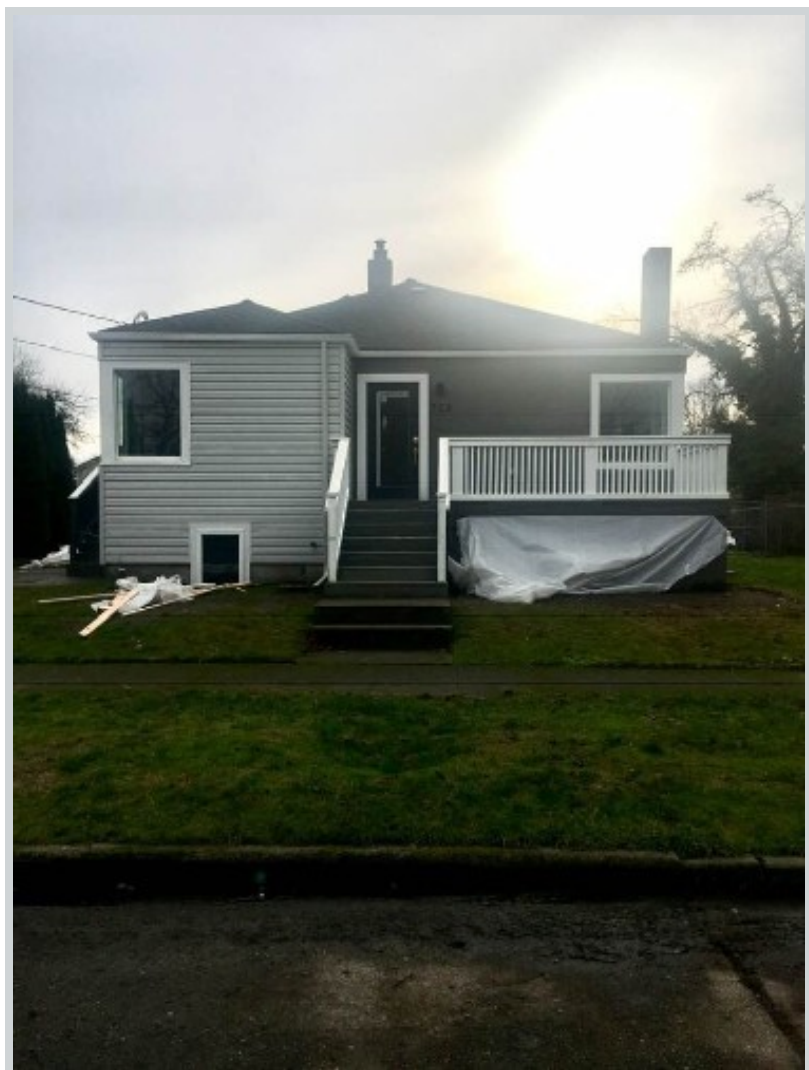
Subject 723 S Southern St