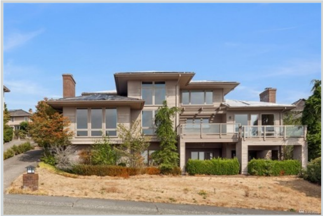
Sold Comp 1 5438 154th Ave Se

Address 5526 166th Place Se, Bellevue, WA 98006 Loan Number 32228 Suggested List $1,040,000 Suggested Repaired $1,040,000 Sale $1,030,000