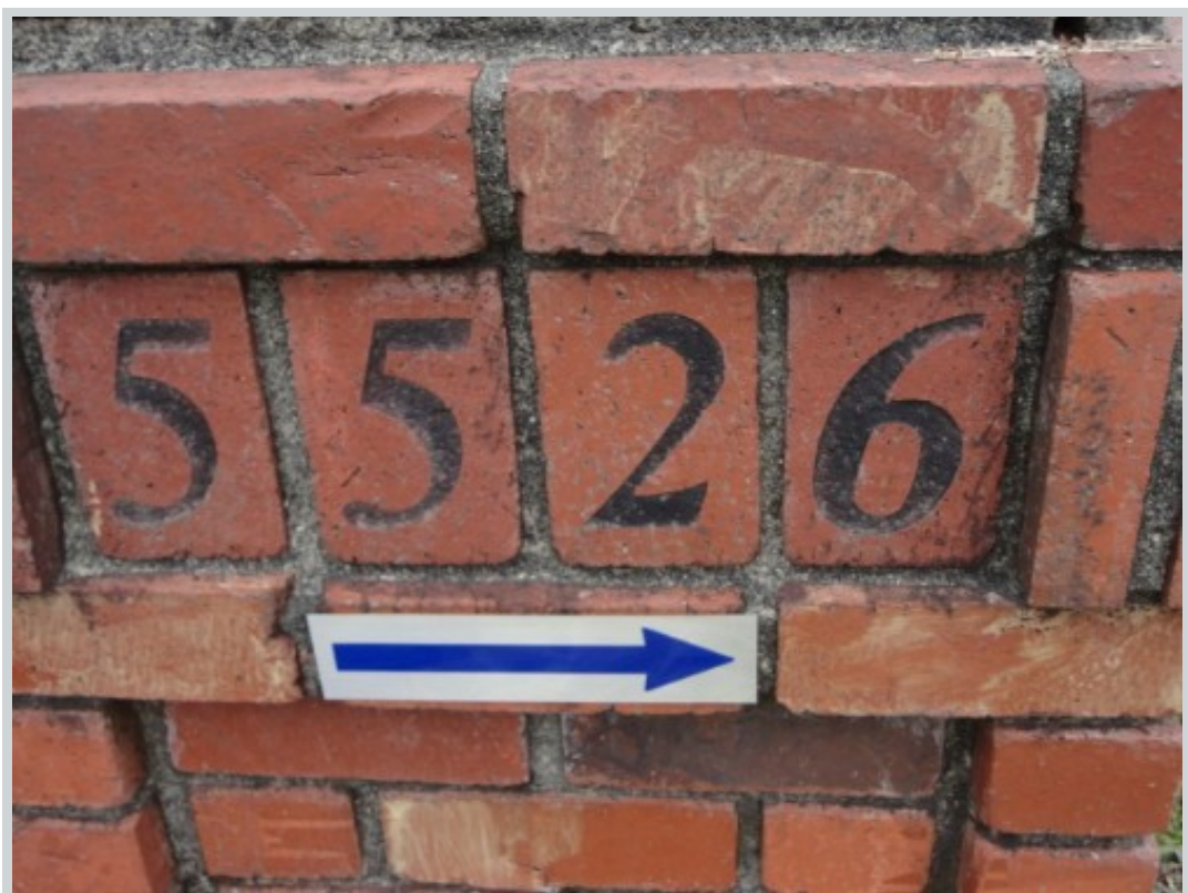
Subject 5526 166th Pl Se View Address Verification