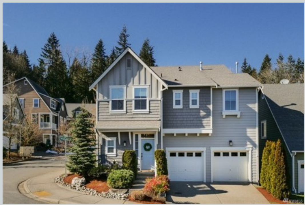
Listing Comp 2 5061 163rd Place Se