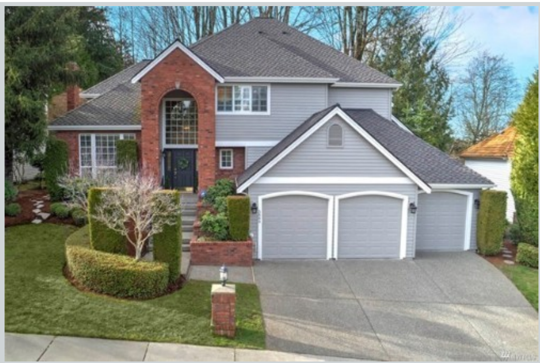
Listing Comp 3 5884 Nw Lac Leman Dr