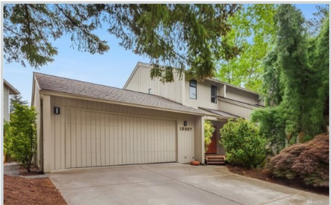
Sold Comp 2 15907 Se 48th Dr