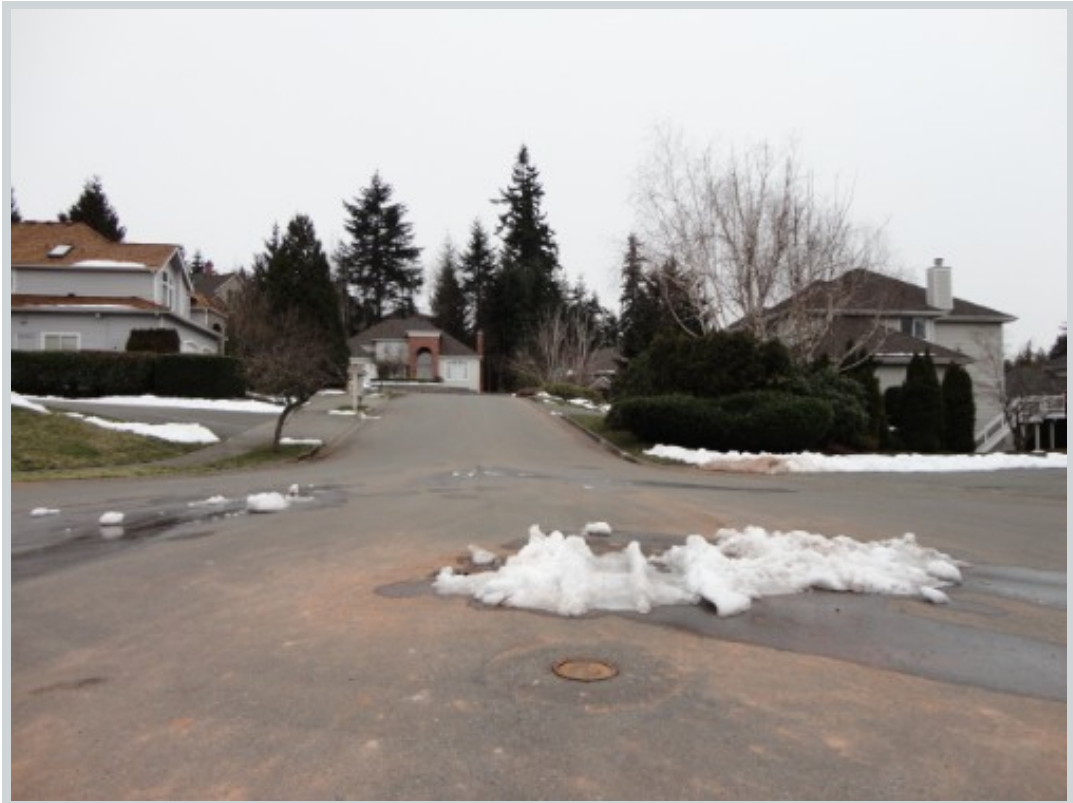
Subject 5526 166th Pl Se