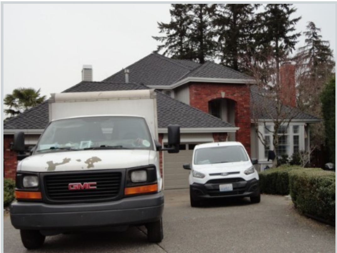
Subject 5526 166th Pl Se View Front Comment "Construction vehicles at front"

Address 5526 166th Place Se, Bellevue, WA 98006 Loan Number 32228 Suggested List $1,040,000 Suggested Repaired $1,040,000 Sale $1,030,000