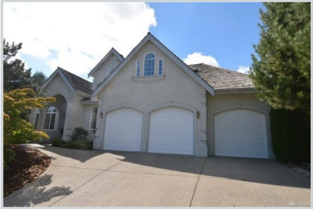
Sold Comp 3 6293 155th Ave Se