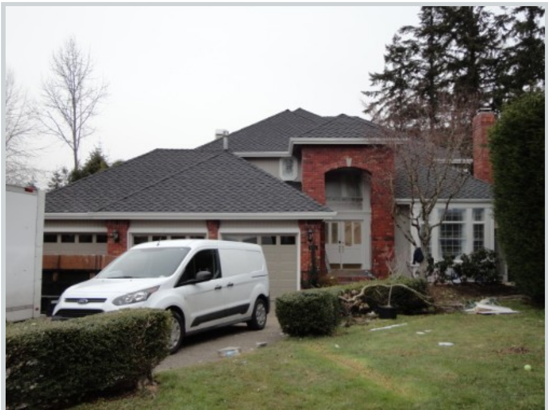
Subject 5526 166th Pl Se