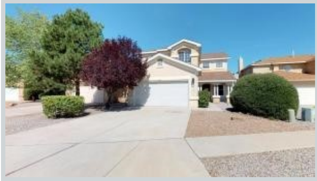
Listing Comp 1 9511 La Rocca Ct Nw View Front