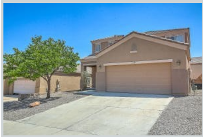
Sold Comp 3 7244 Teypana Rd Nw View Front