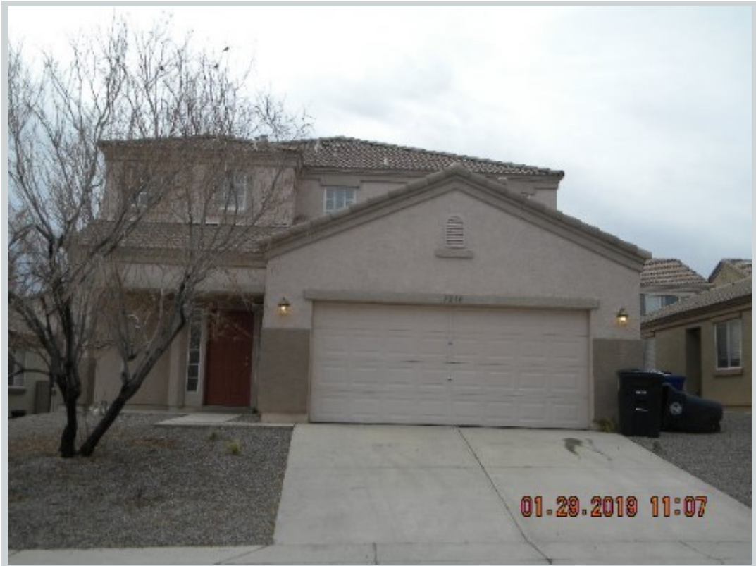
Subject 7216 Teypana Rd Nw