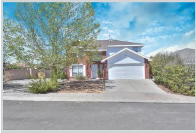
Sold Comp 2 9401 Vervain Dr Nw View Front