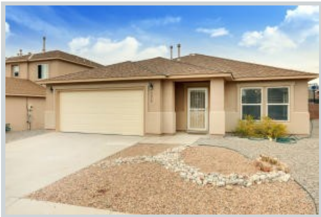
Listing Comp 2 7616 Briar Ridge Ave Nw View Front