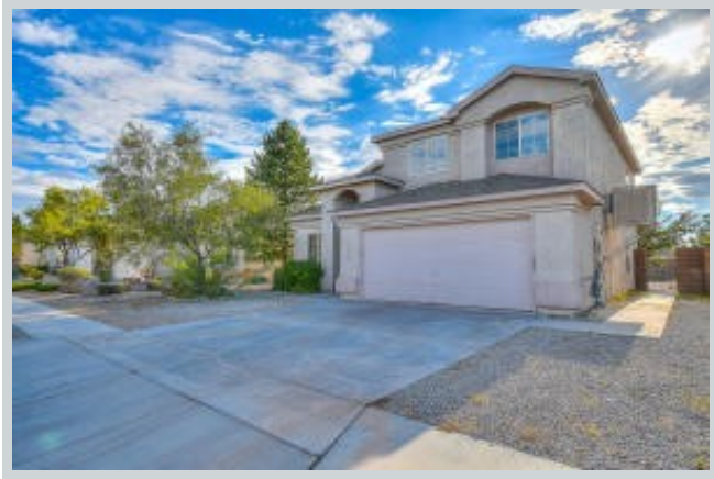
Listing Comp 3 10004 Ashland St Nw View Front