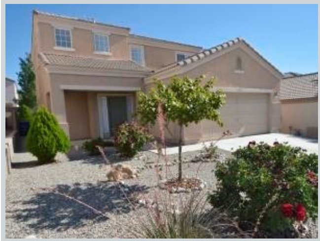
Sold Comp 1 7239 Teypana Rd Nw View Front