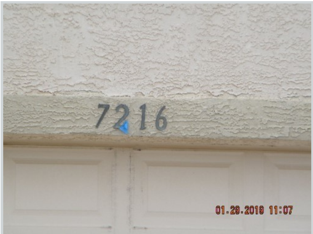
Subject 7216 Teypana Rd Nw