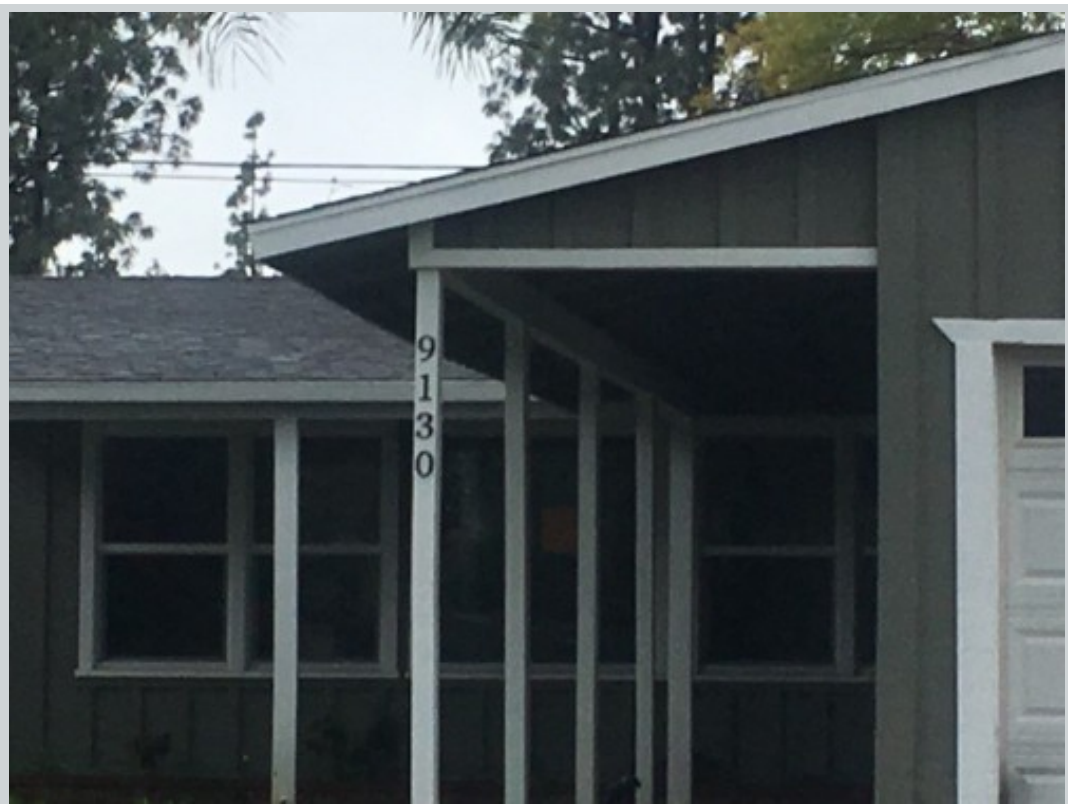
Subject 9130 Manzanar Ave