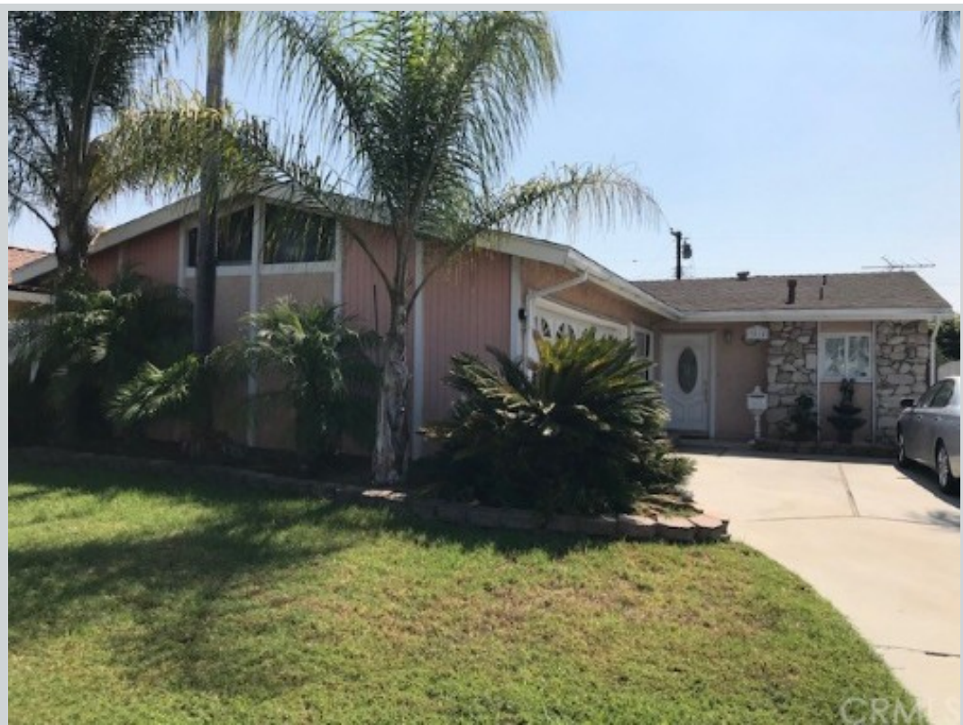
Sold Comp 2 9010 Chaney Ave

Address 9130 Manzanar Avenue, Downey, CA 90240 Suggested Repaired $575,000 Sale $565,000 Loan Number 32454 Suggested List $575,000