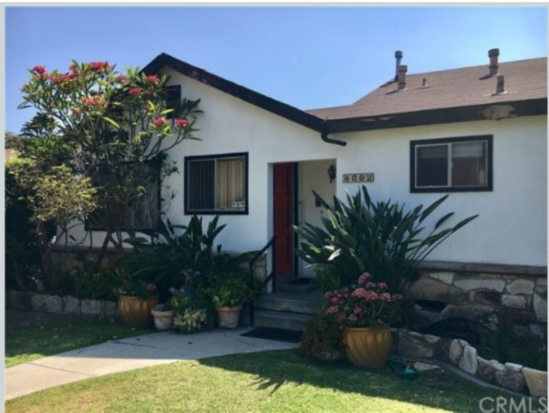
Sold Comp 1 8002 Blandwood Rd