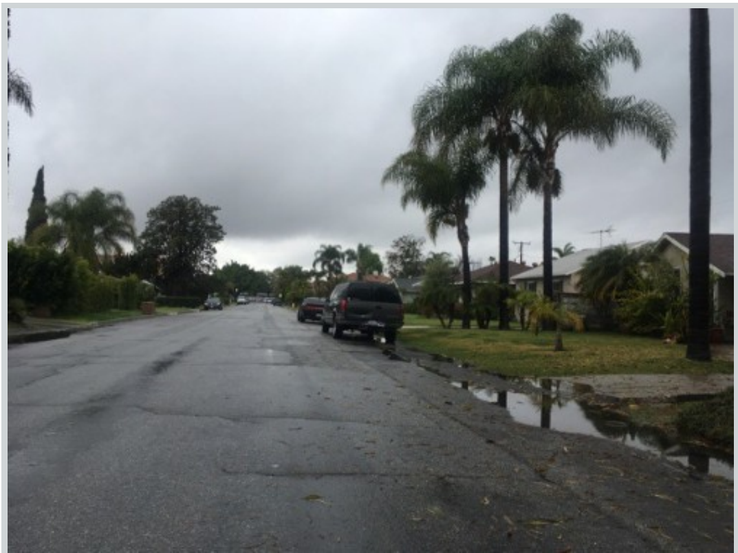
Subject 9130 Manzanar Ave