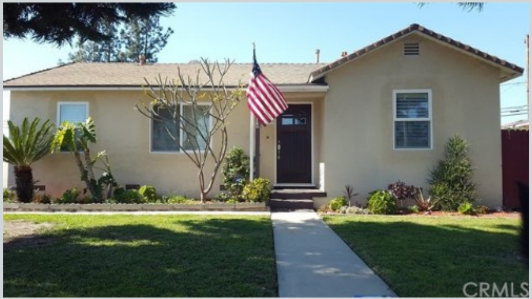
Listing Comp 2 8453 Serapis Ave