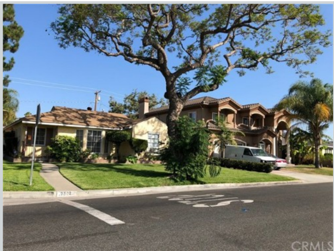
Sold Comp 3 9502 Brock Ave