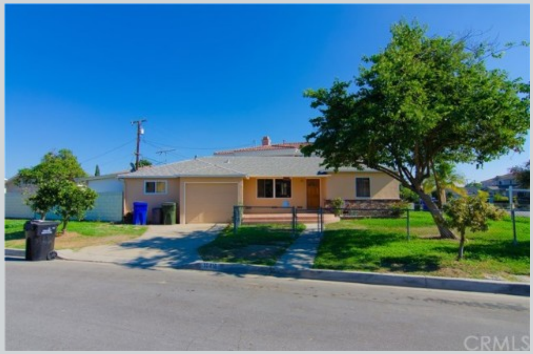
Listing Comp 1 10416 Bellder Dr