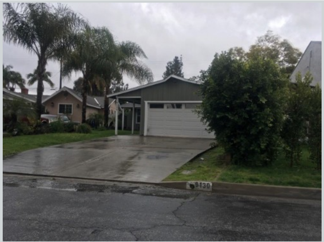
Subject 9130 Manzanar Ave