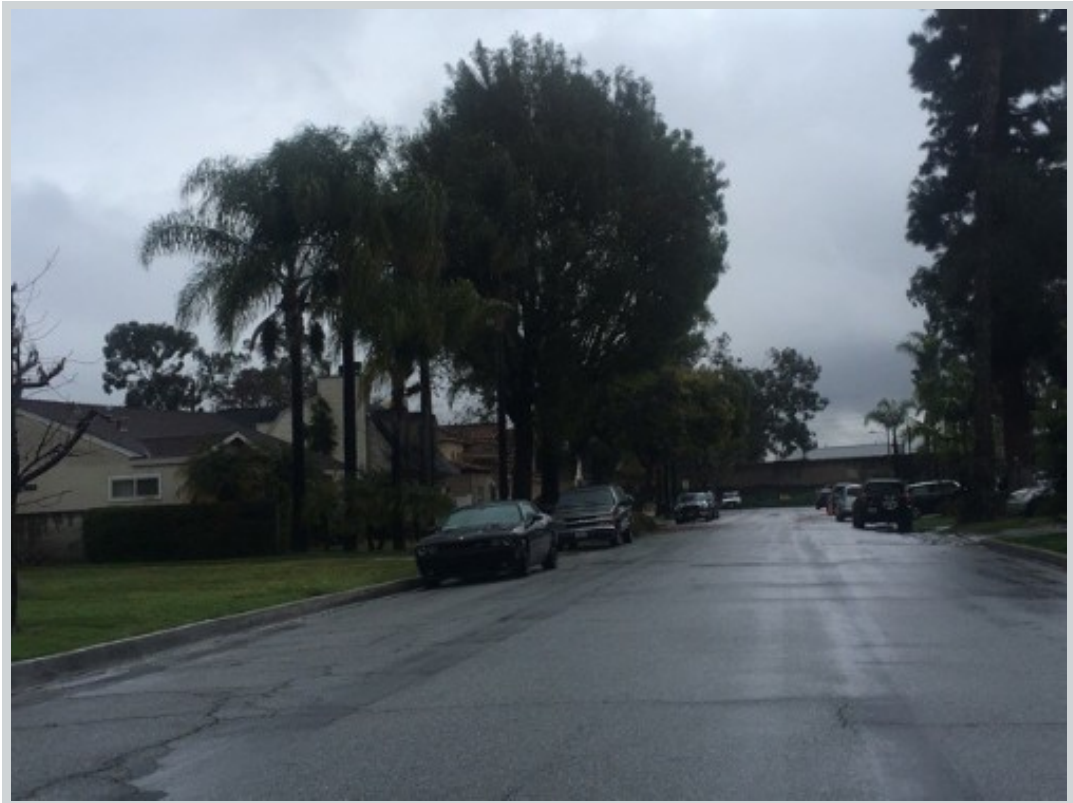
Subject 9130 Manzanar Ave