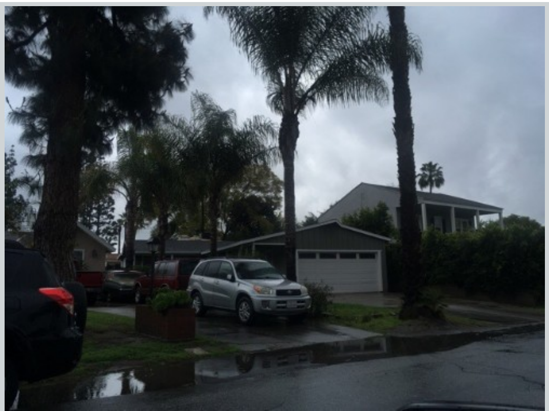
Subject 9130 Manzanar Ave