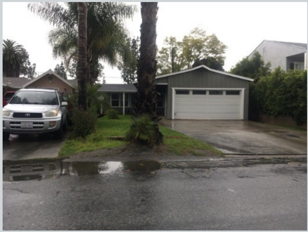
Subject 9130 Manzanar Ave