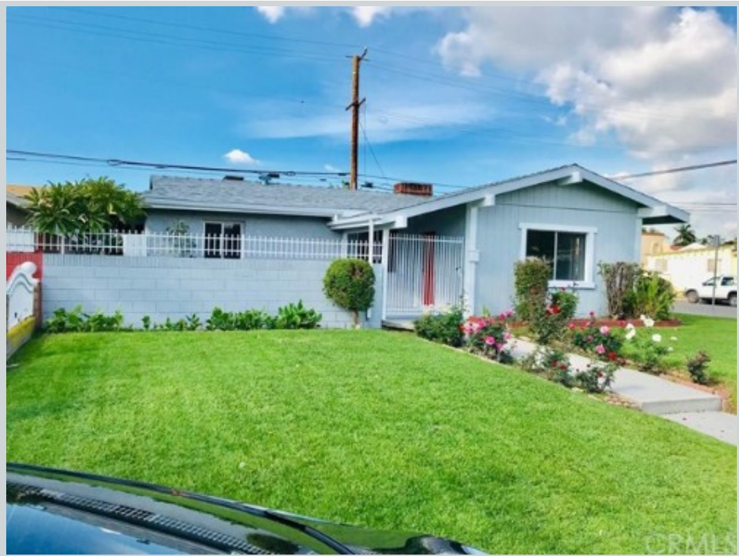
Listing Comp 3 8403 Lexington Gallatin Rd