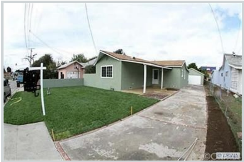
Sold Comp 1 9527 Stephens Street View Front