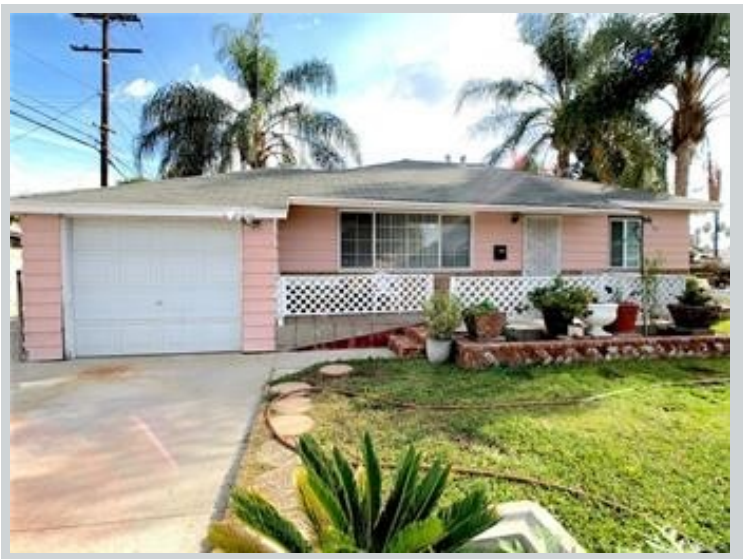
Sold Comp 2 4592 Deland Avenue View Front

Address 5212 Lindsey Avenue, Pico Rivera, CA 90660 Loan Number 32717 Suggested List $440,000 Suggested Repaired $440,000 Sale $440,000