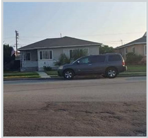
Listing Comp 1 8818 Mines Avenue View Front