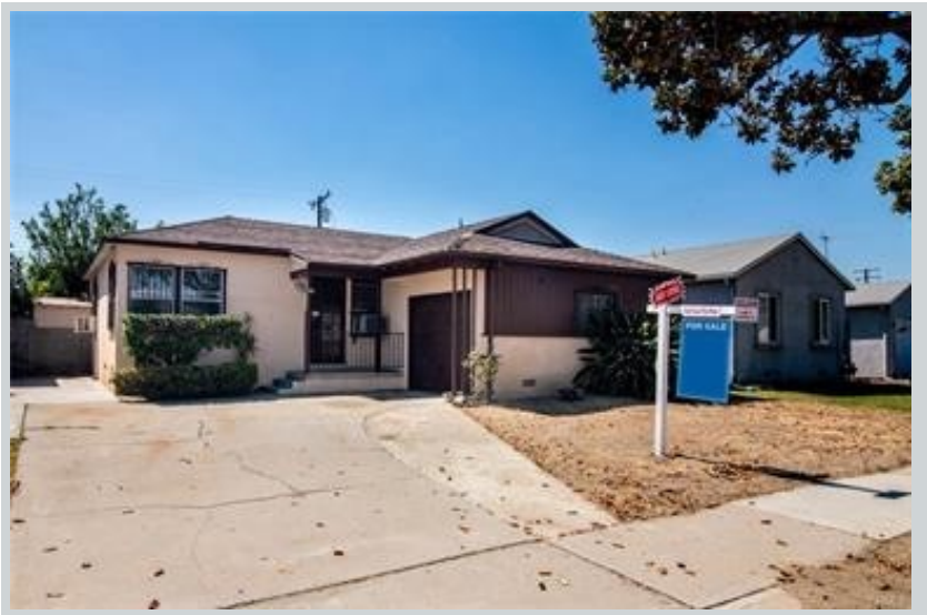
Sold Comp 3 6358 Paramount View Front