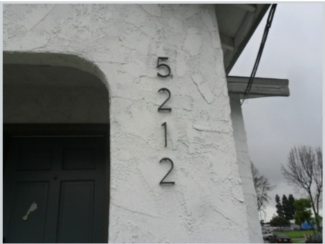
Subject 5212 Lindsey Ave