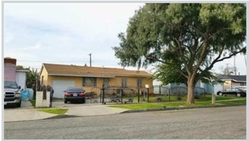
Listing Comp 2 8732 Creeland Street View Front