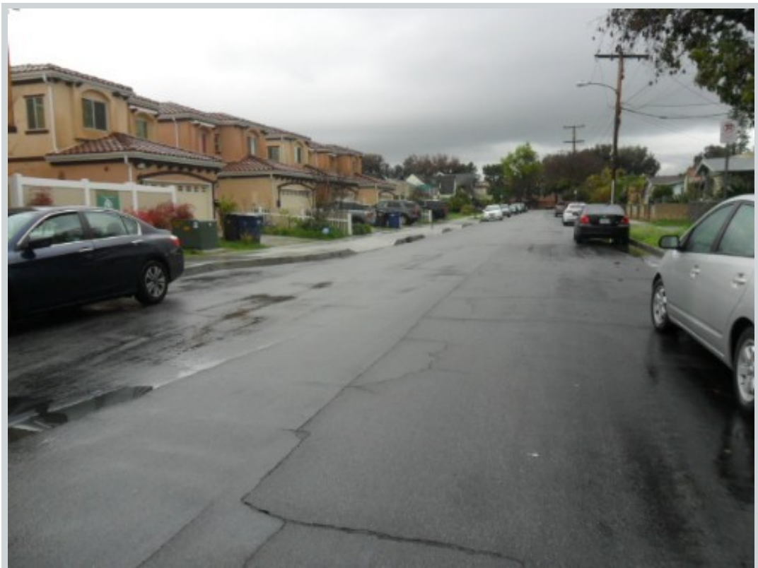
Subject 5212 Lindsey Ave