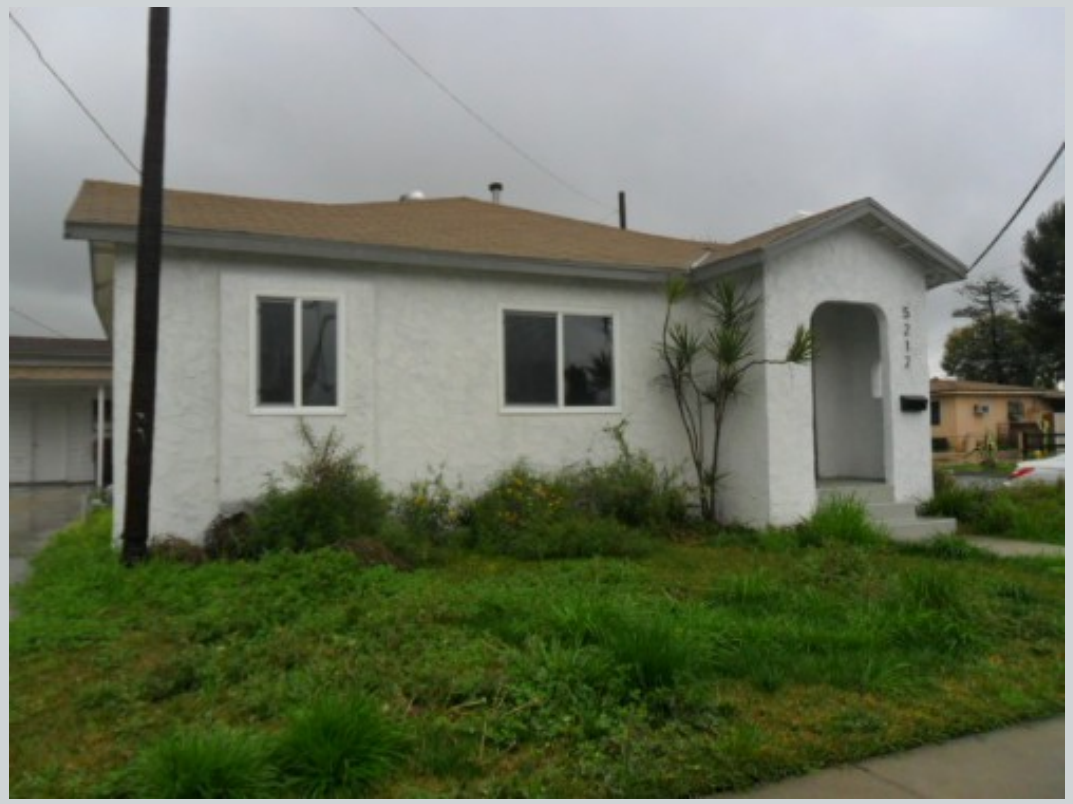
Subject 5212 Lindsey Ave