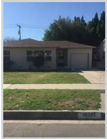
Listing Comp 3 10308 Floral Drive View Front