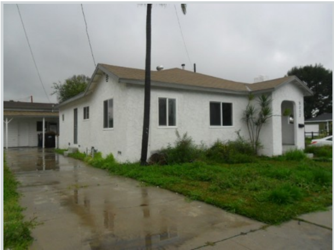
Subject 5212 Lindsey Ave

Address 5212 Lindsey Avenue, Pico Rivera, CA 90660 Loan Number 32717 Suggested List $440,000 Suggested Repaired $440,000 Sale $440,000