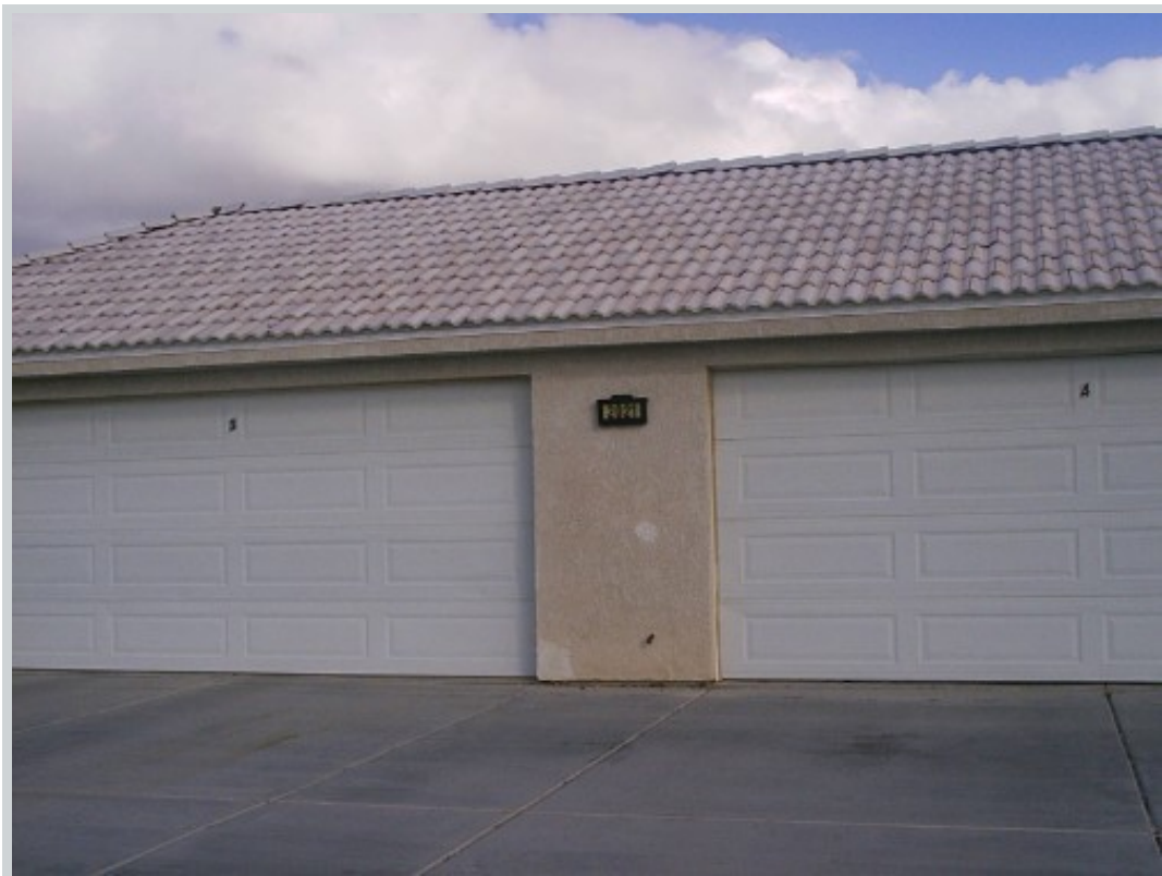
Subject 2021 S Dandelion St

Address 2021 S Dandelion Street, Pahrump, NV 89048 Loan Number 32766 Suggested List $368,000 Suggested Repaired $368,000 Sale $360,000