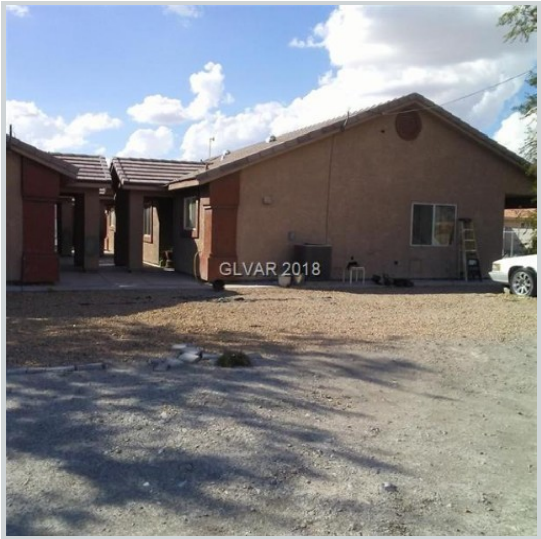
Sold Comp 1