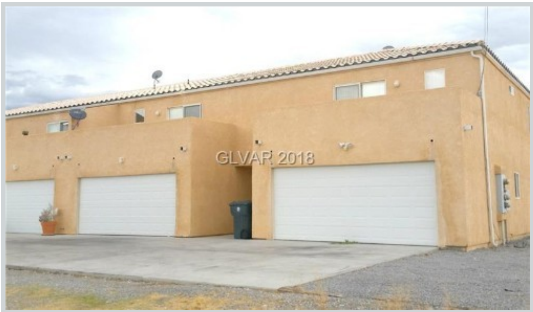
Sold Comp 3