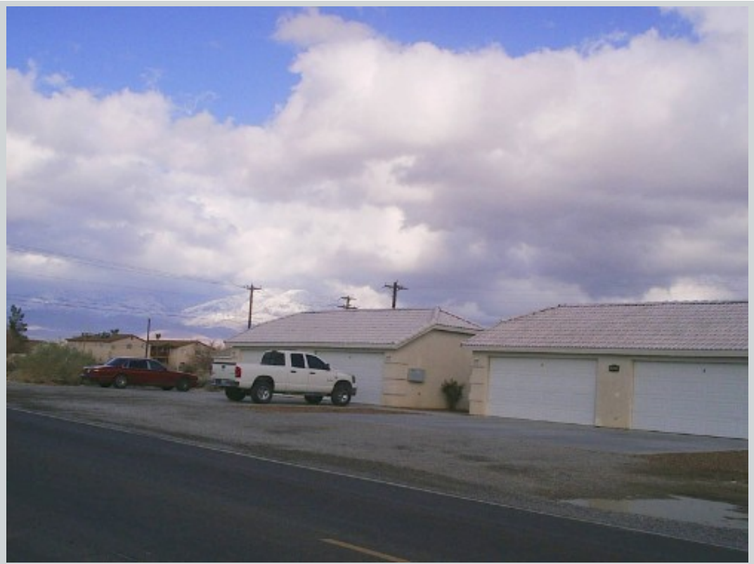
Subject 2021 S Dandelion St