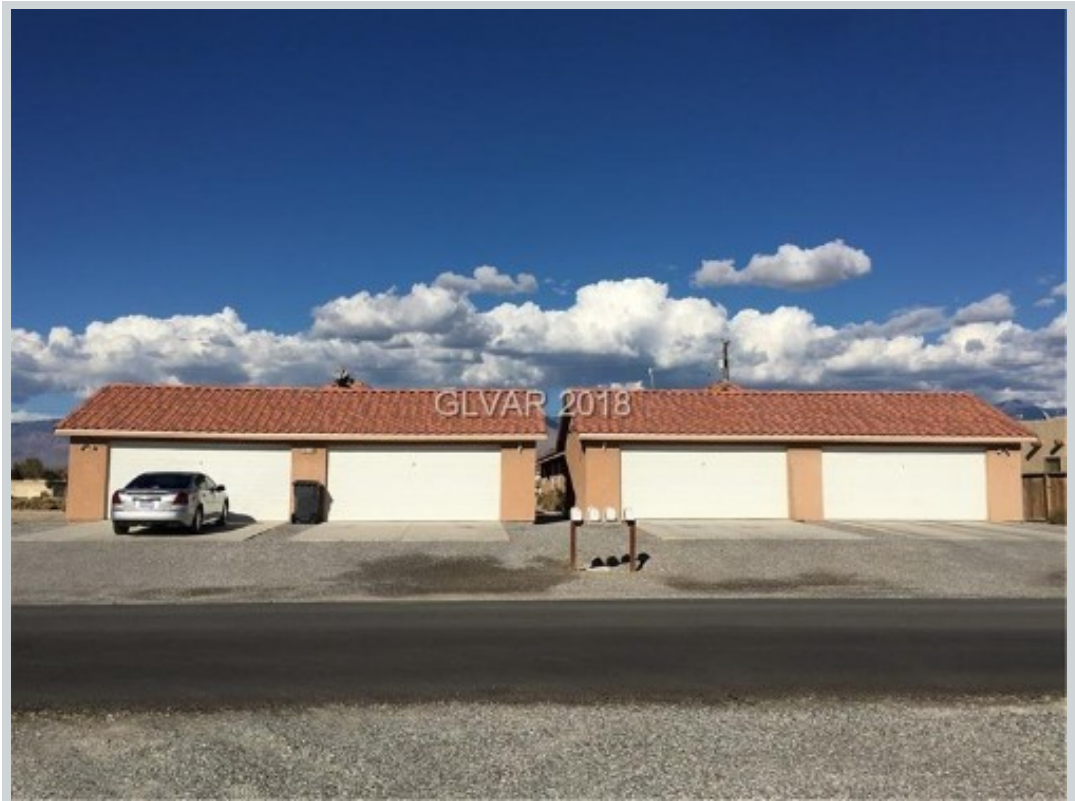
Sold Comp 2