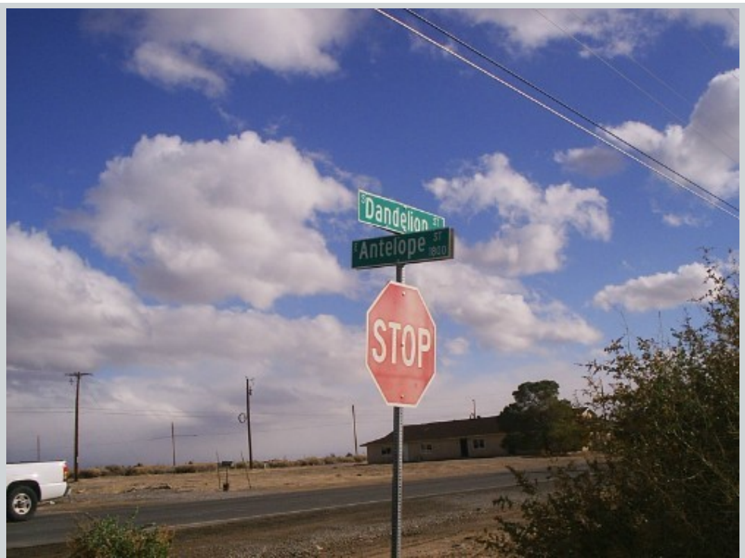
Subject 2021 S Dandelion St