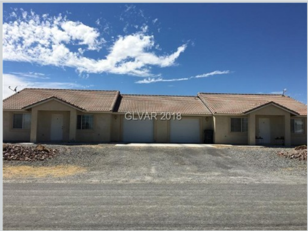
Listing Comp 2