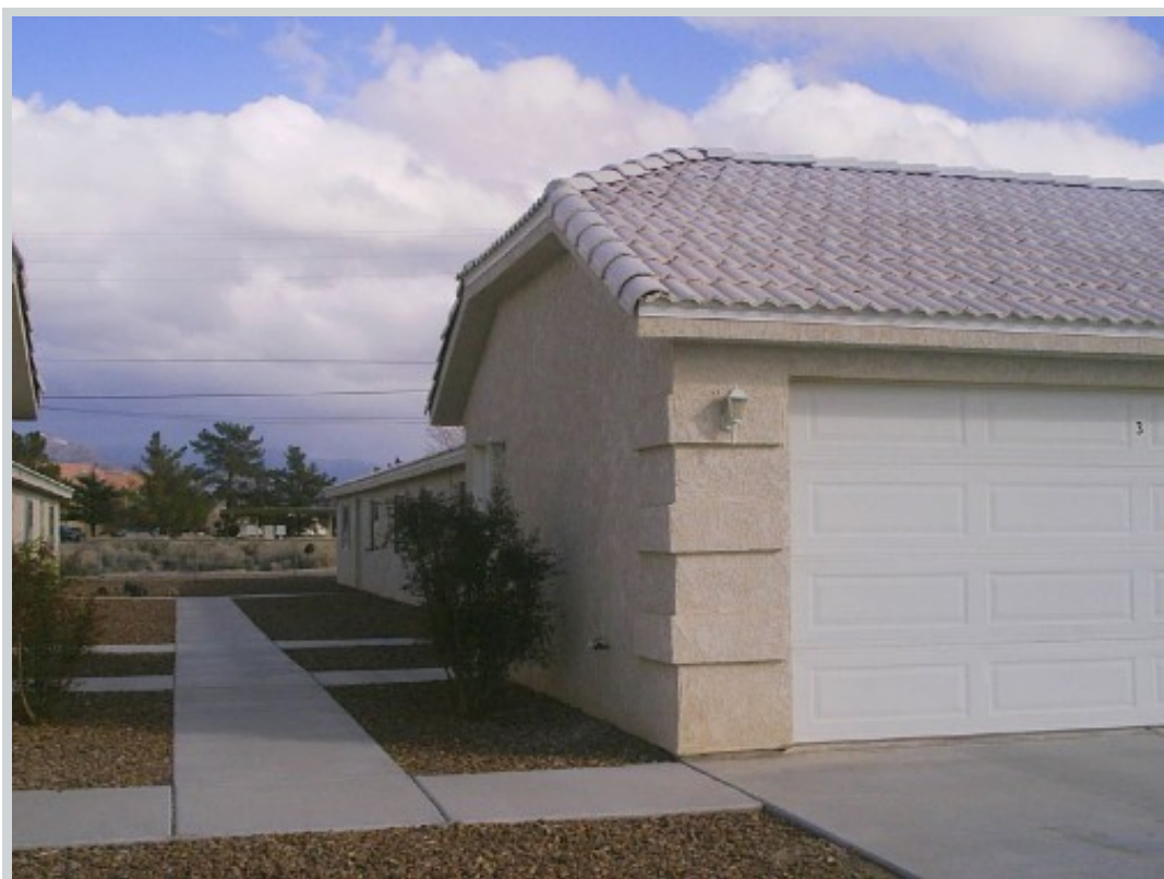
Subject 2021 S Dandelion St