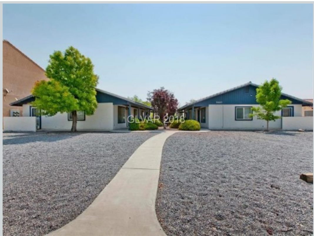
Listing Comp 3