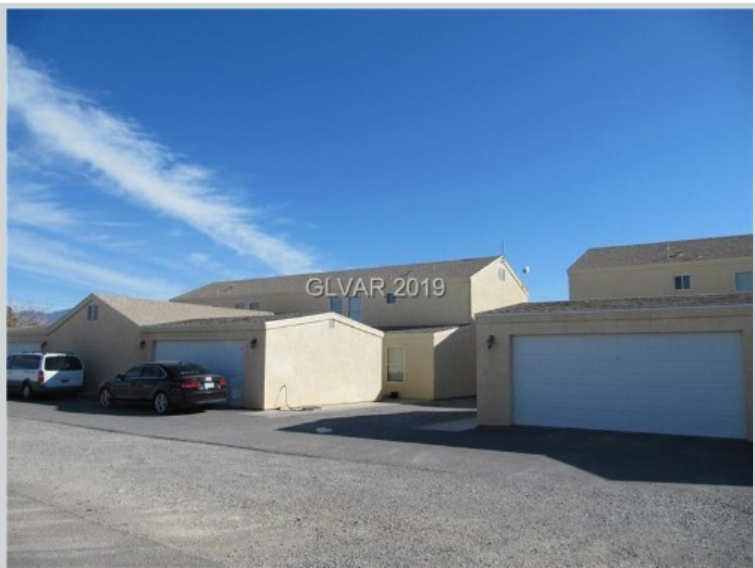
Listing Comp 1