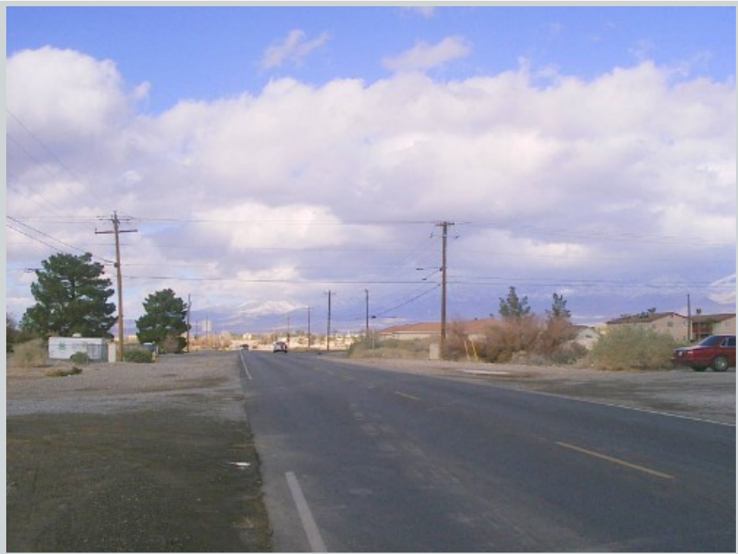
Subject 2021 S Dandelion St