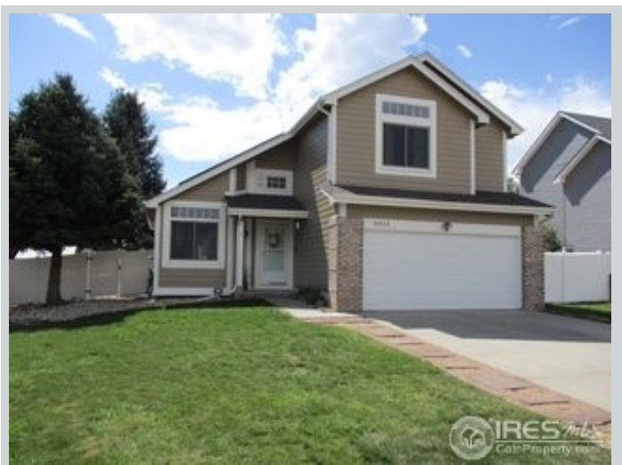
Sold Comp 3 4434 W A St View Front