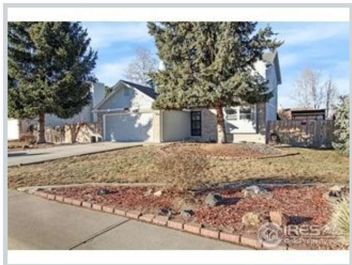
Listing Comp 2 4979 W 7th St View Front