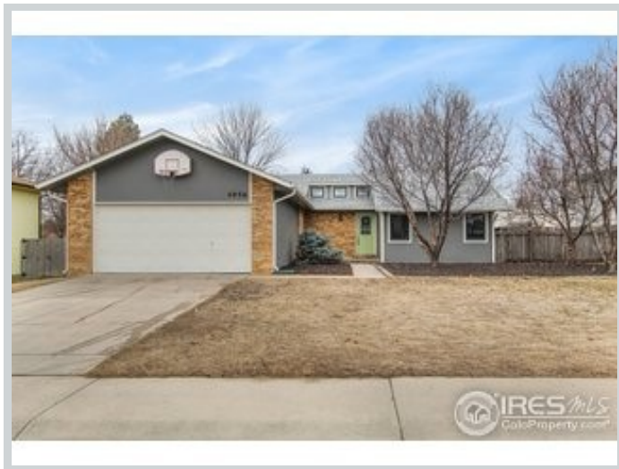
Listing Comp 3 4956 W 8th St Rd