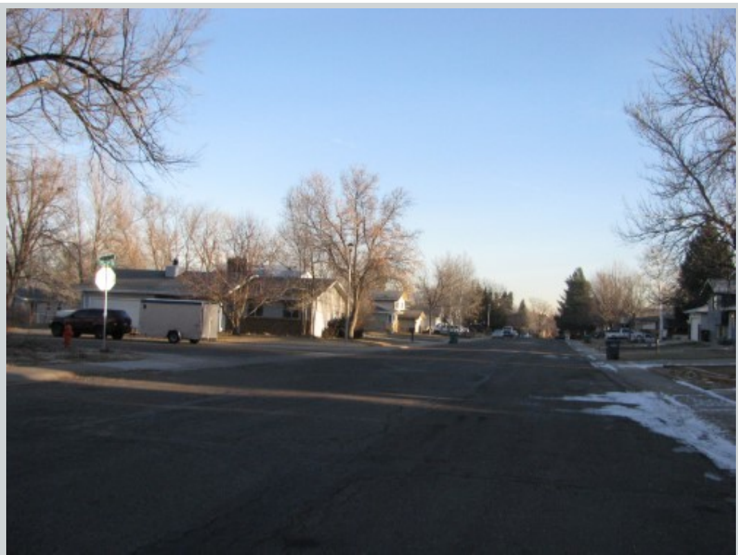
Subject 4520 W 7th St