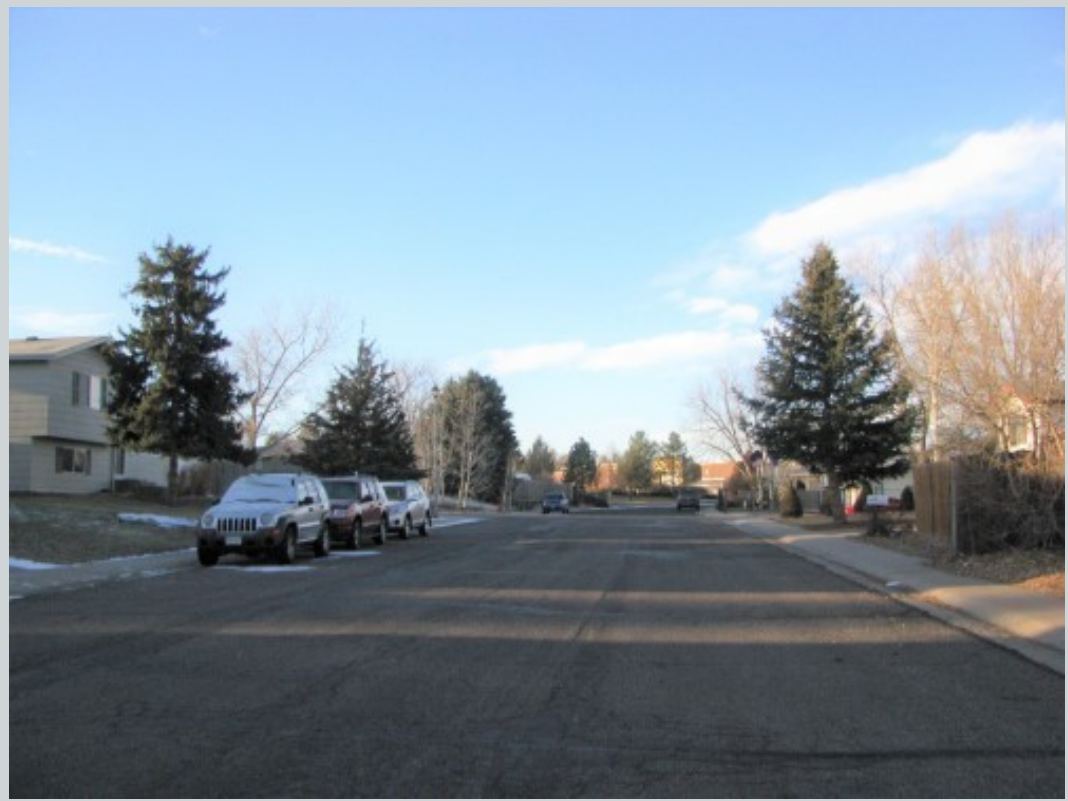
Subject 4520 W 7th St