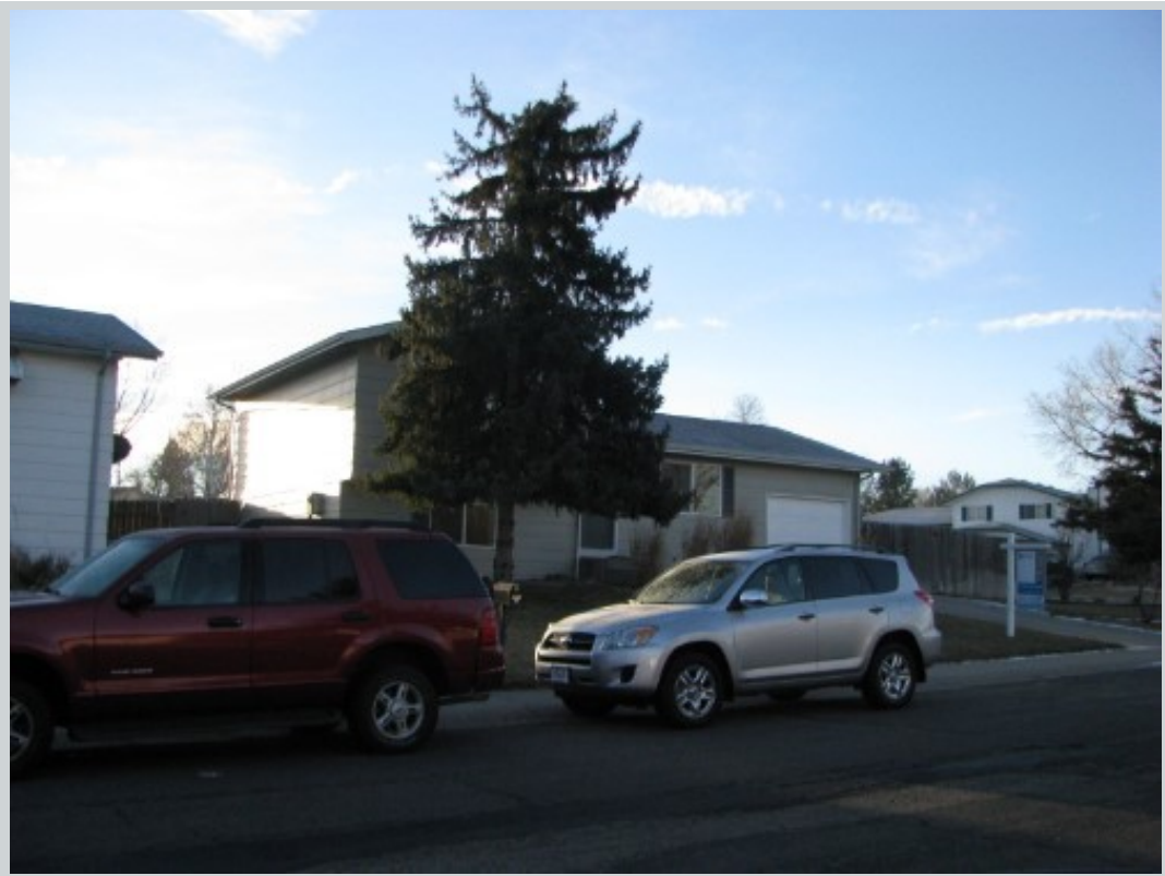
Subject 4520 W 7th St