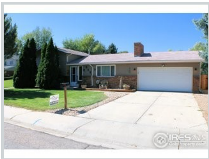
Sold Comp 1 923 49th Ave Ct