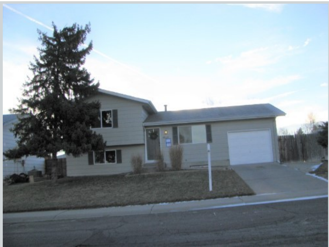
Subject 4520 W 7th St