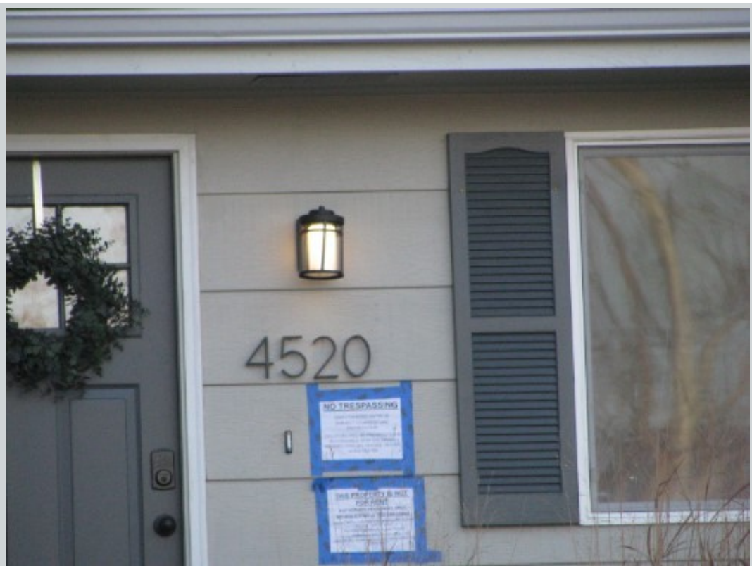
Subject 4520 W 7th St