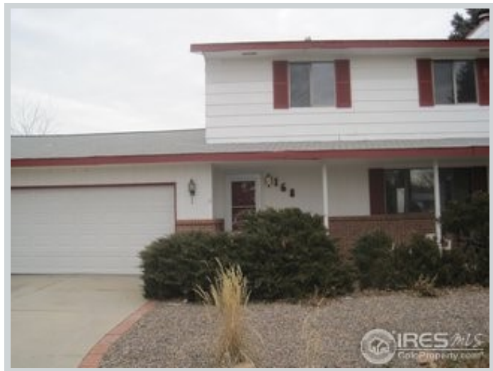
Listing Comp 1 168 45th Ave Ct View Front