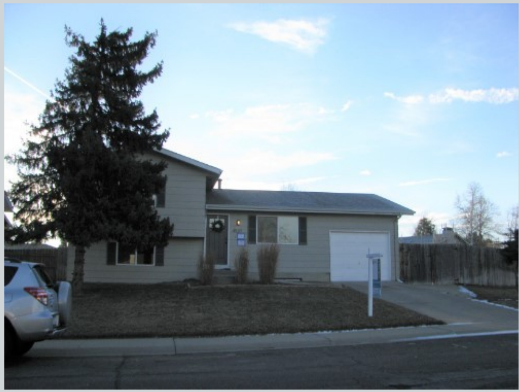
Subject 4520 W 7th St