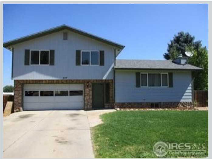
Sold Comp 2 727 41st Ave Ct View Front

Address 4520 W 7th Street, Greeley, CO 80634 Loan Number 33142 Suggested List $290,000 Suggested Repaired $290,000 Sale $289,000