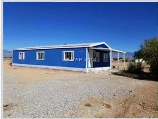
Listing Comp 1 361 N Monta View Front