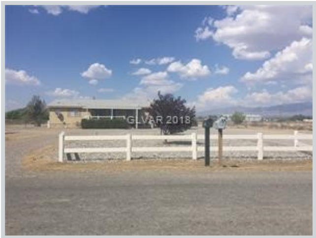
Sold Comp 3 4050 W Medicine Man View Front