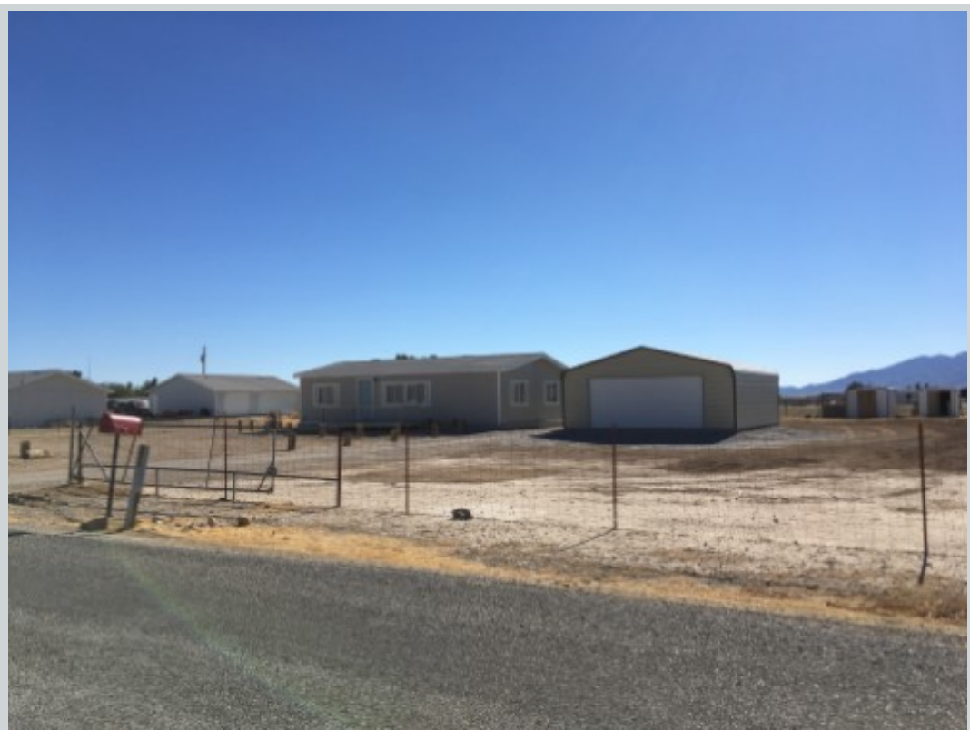
Subject 3891 W Dyer Rd