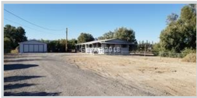
Listing Comp 2 3391 W Charleston Park View Front