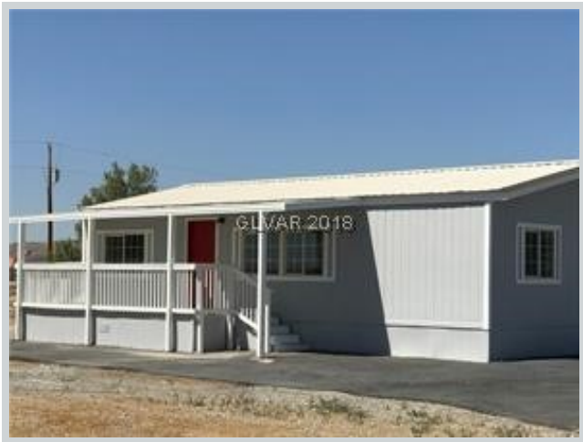
Sold Comp 1 4431 W Grubstake View Front