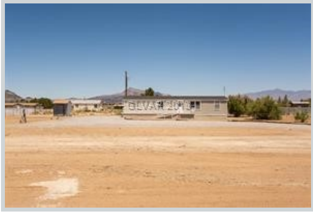
Listing Comp 3 3680 W Wilson View Front