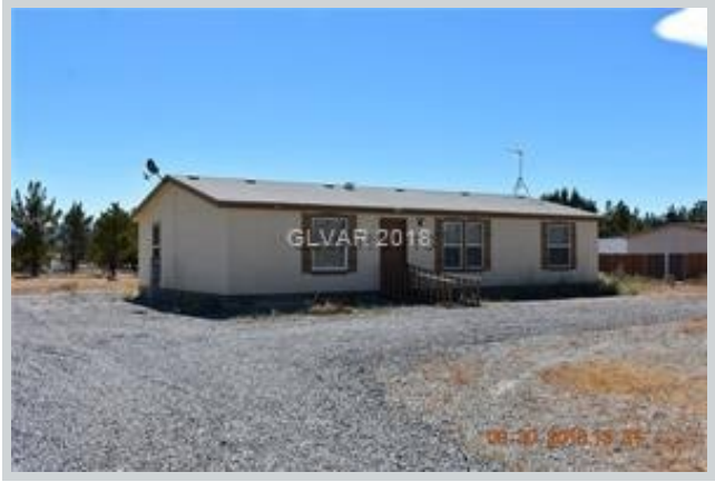
Sold Comp 2 3761 Basin Av View Front

Address 3891 W Dyer Road, Pahrump, NV 89048 Loan Number 33815 Suggested List $125,000 Suggested Repaired $125,000 Sale $125,000