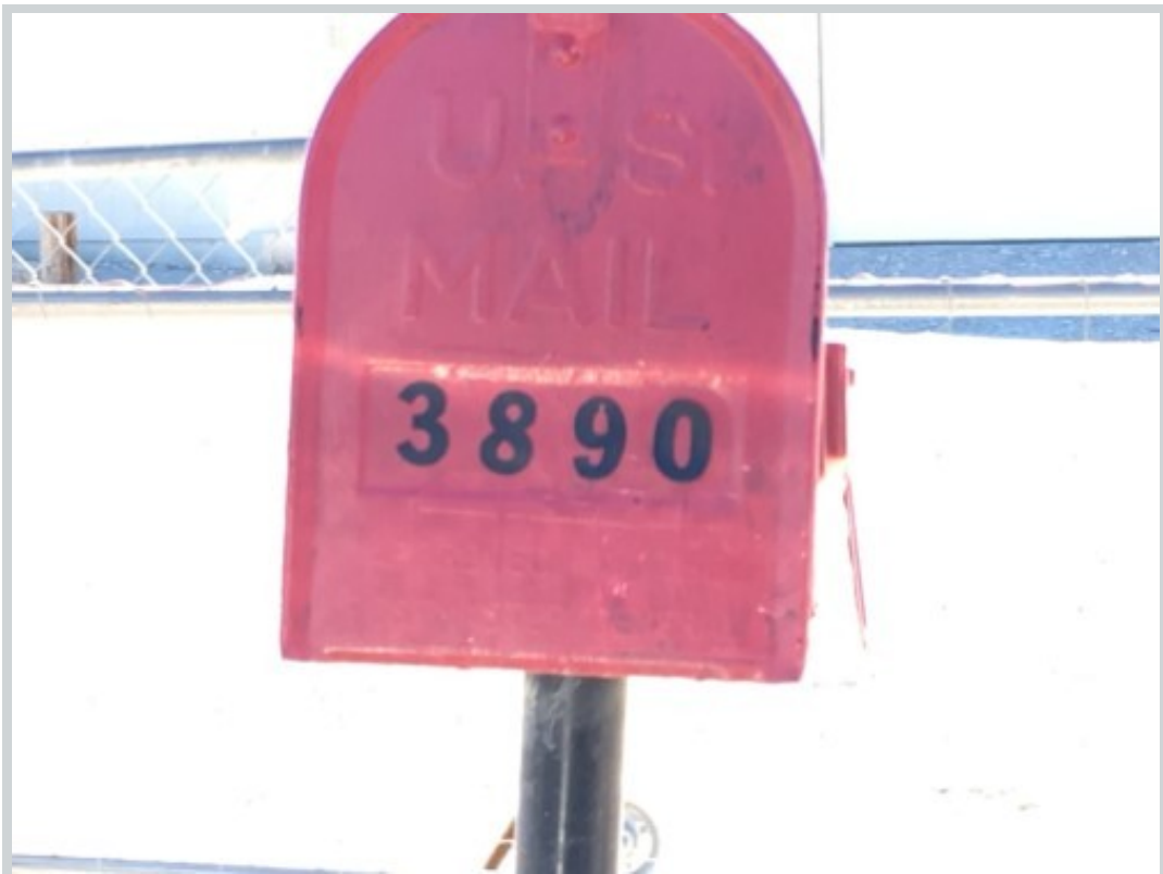
Subject 3891 W Dyer Rd