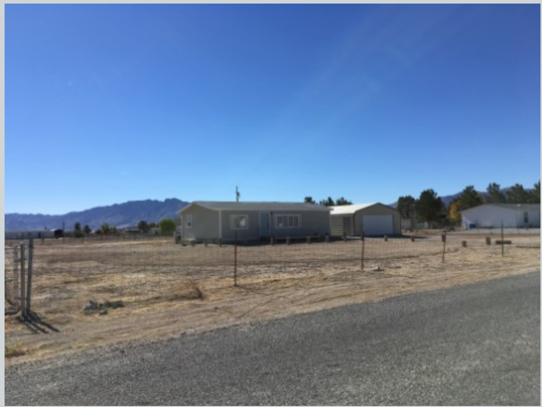
Subject 3891 W Dyer Rd