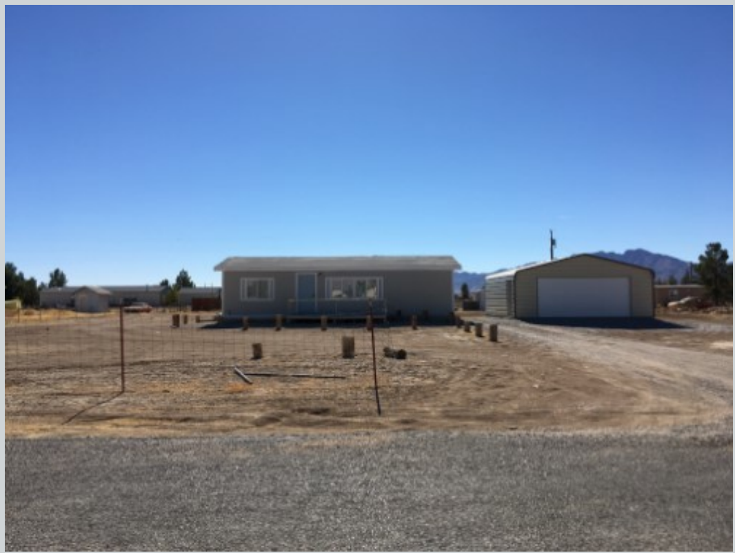
Subject 3891 W Dyer Rd