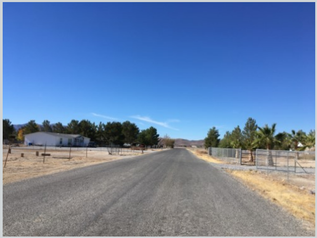
Subject 3891 W Dyer Rd