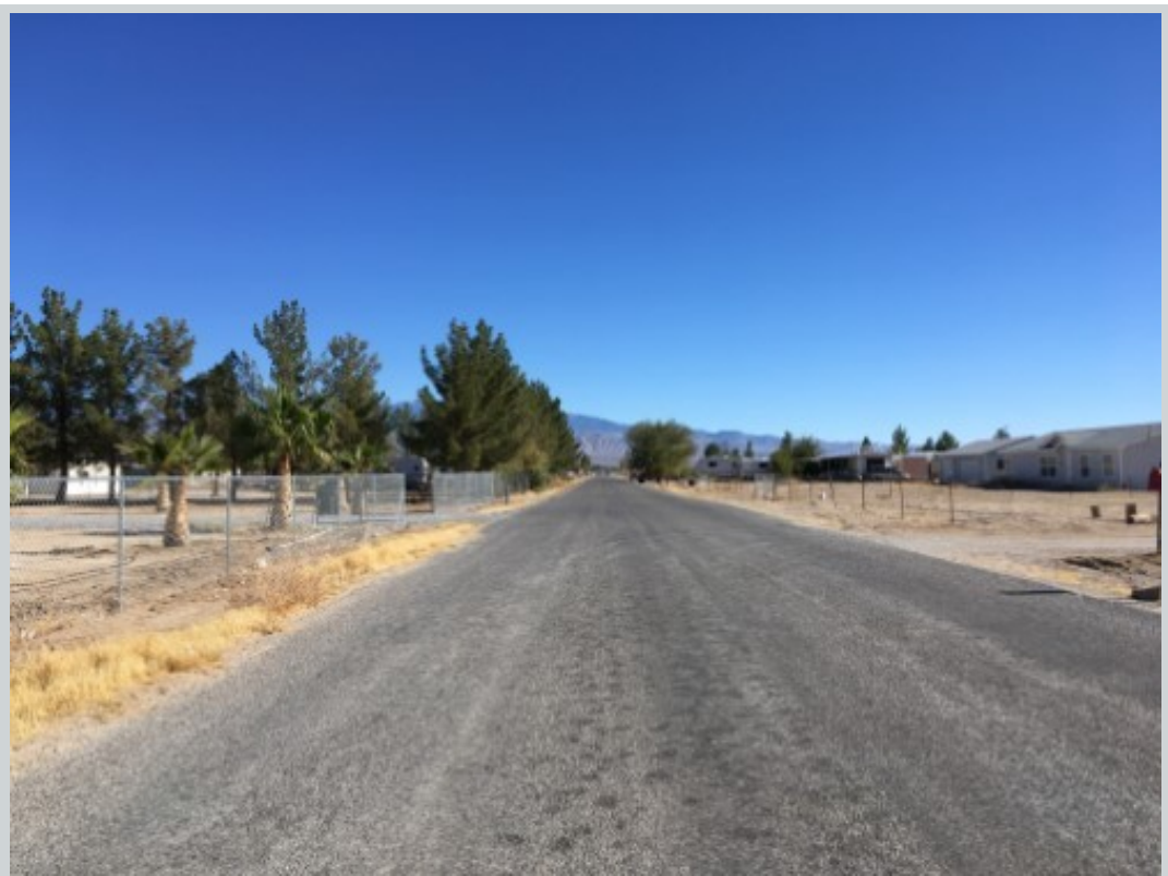
Subject 3891 W Dyer Rd