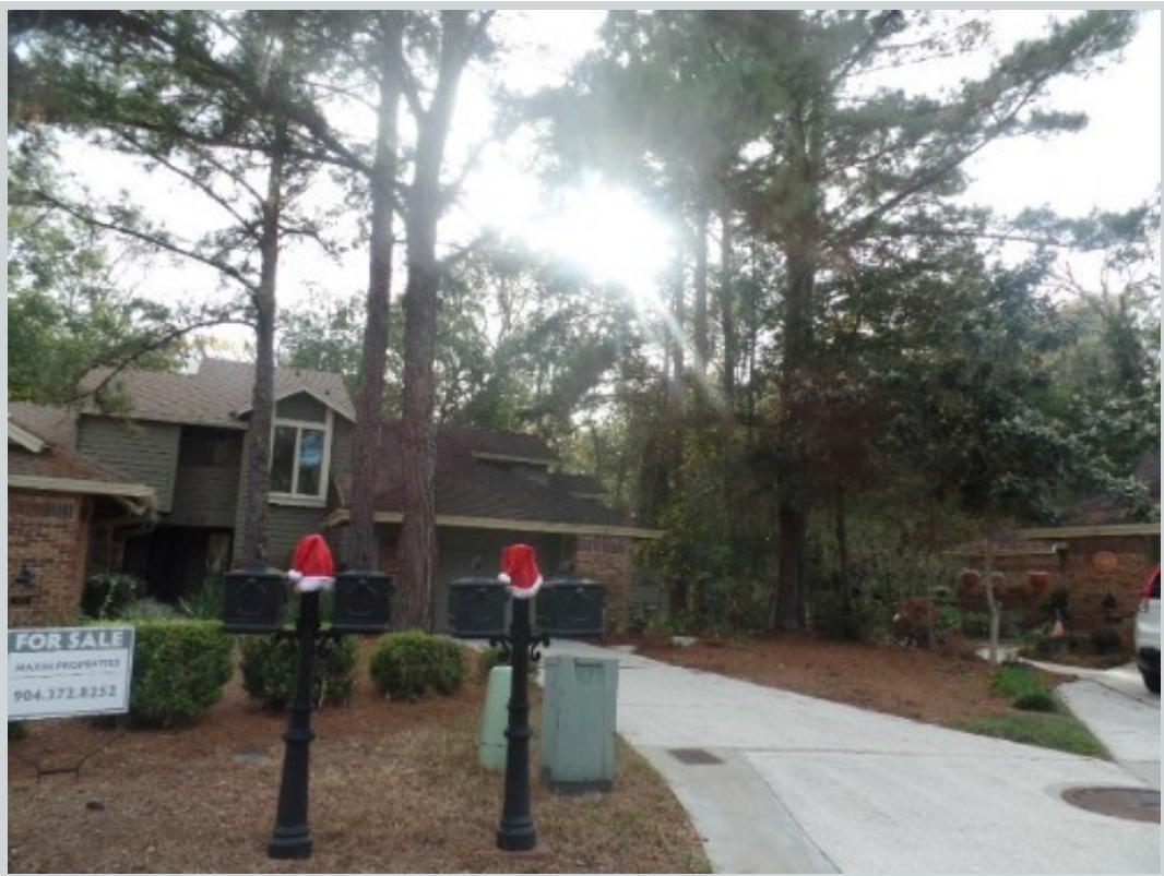
Subject 675 Wells Landing Dr