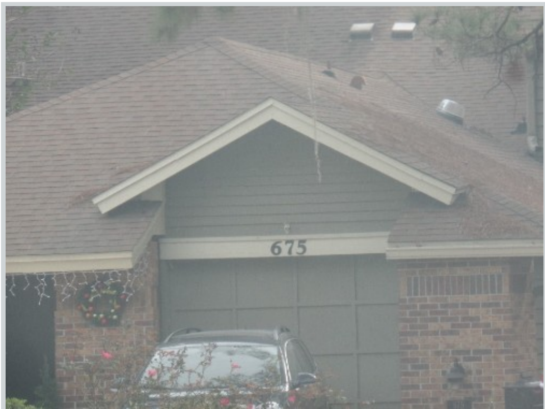
Subject 675 Wells Landing Dr