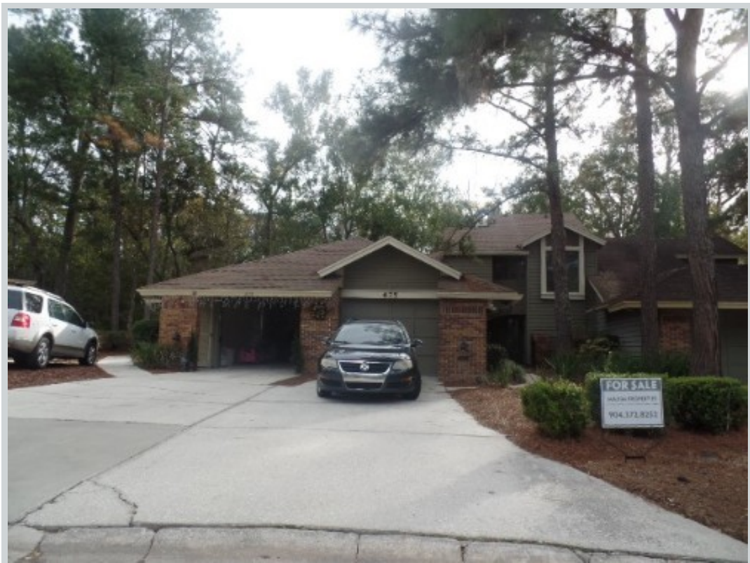
Subject 675 Wells Landing Dr