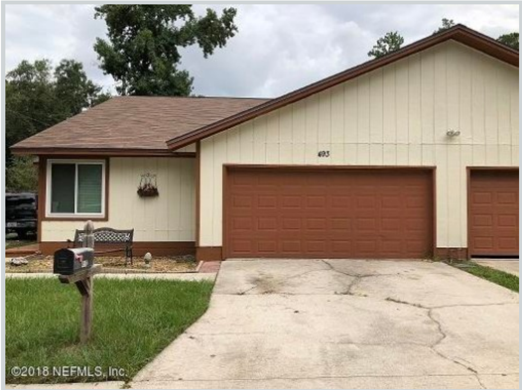
Listing Comp 3 493 Newport Dr