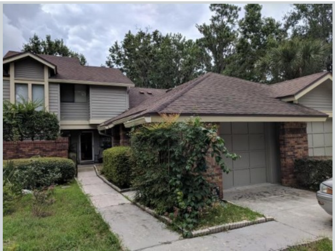
Listing Comp 2 604 Wells Landing Dr