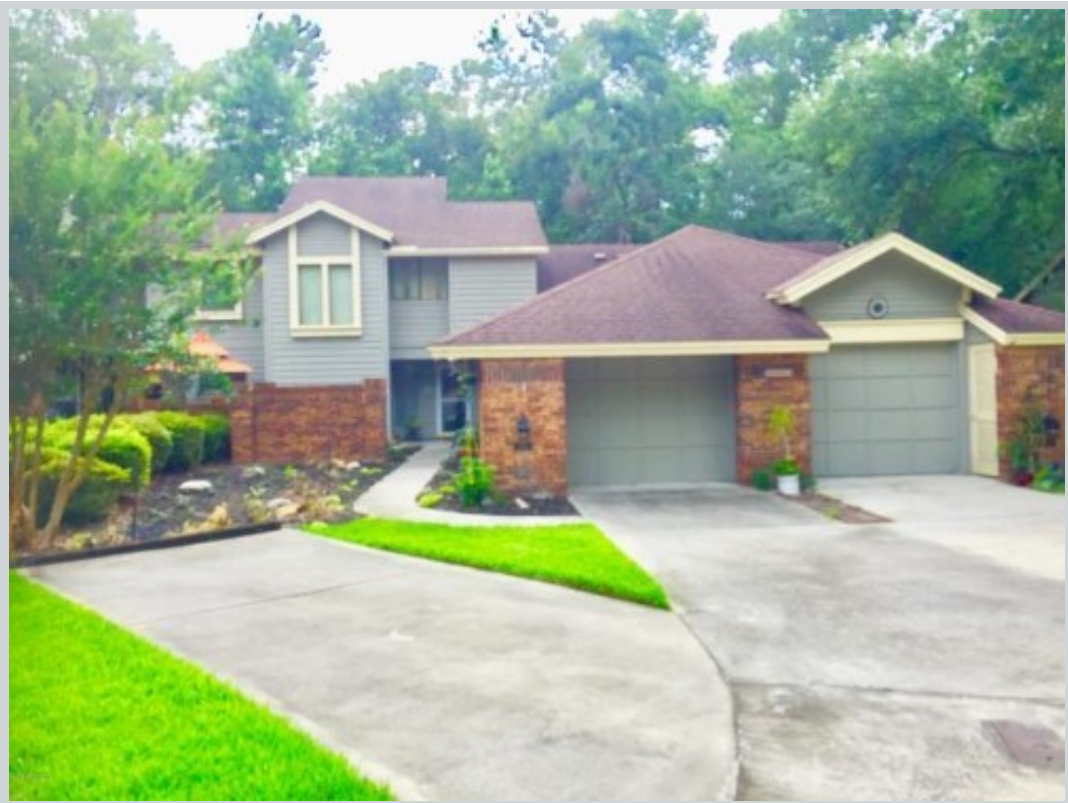
Sold Comp 2 659 Wells Landing Dr U#: 1