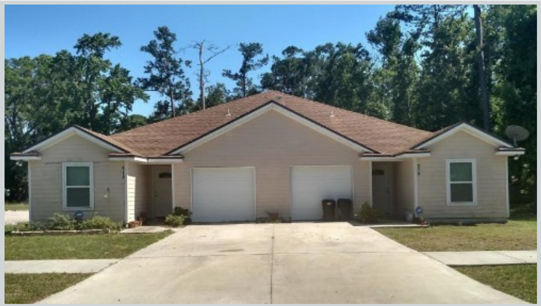
Listing Comp 1 820 Filmore Ln