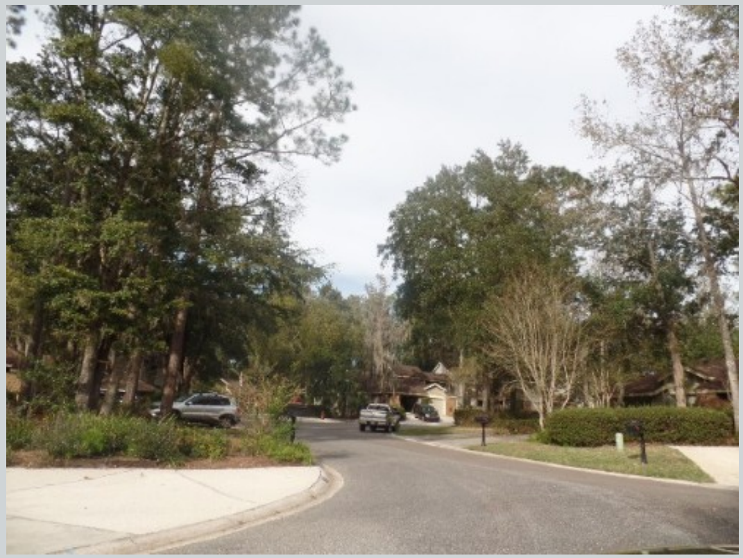
Subject 675 Wells Landing Dr