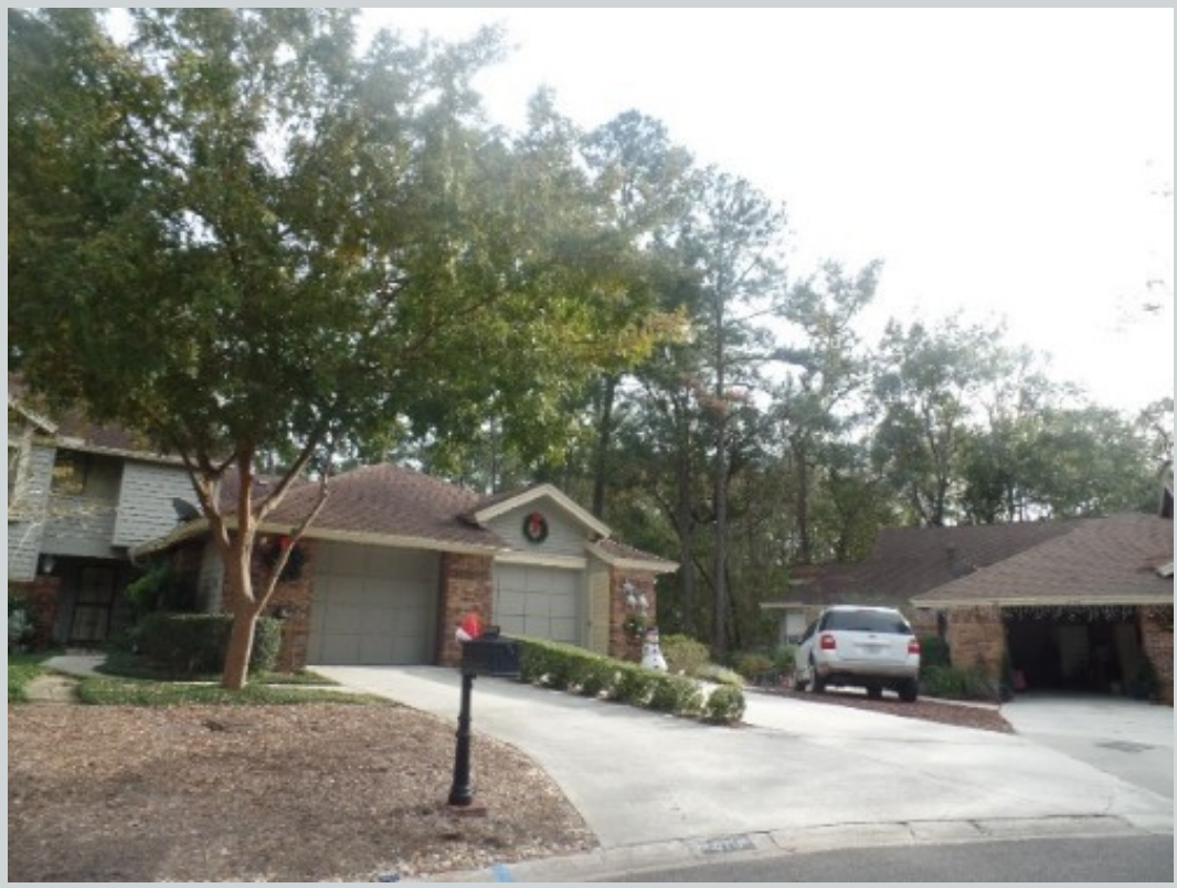
Subject 675 Wells Landing Dr