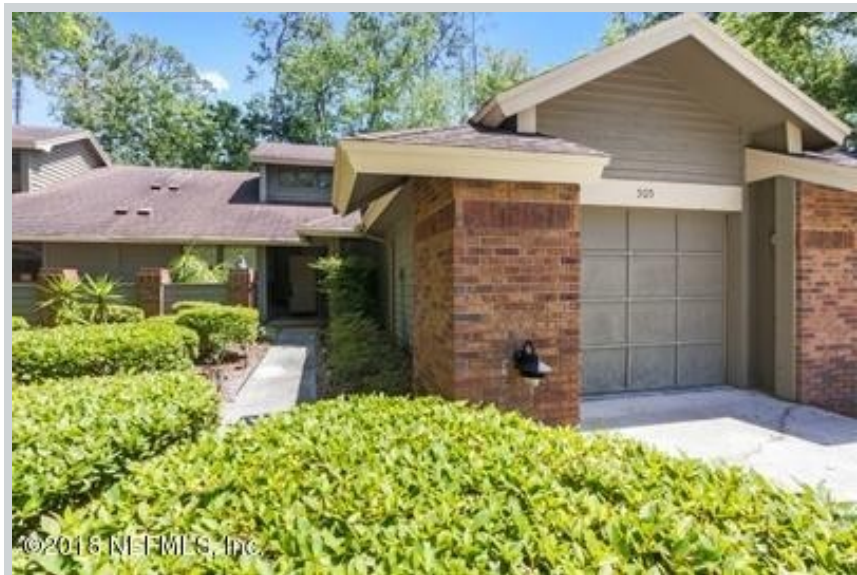
Sold Comp 1 505 Pine Forest Trl