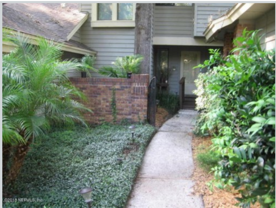
Sold Comp 3 633 Wells Landing Dr