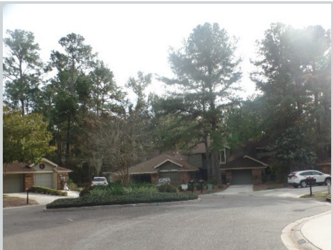
Subject 675 Wells Landing Dr