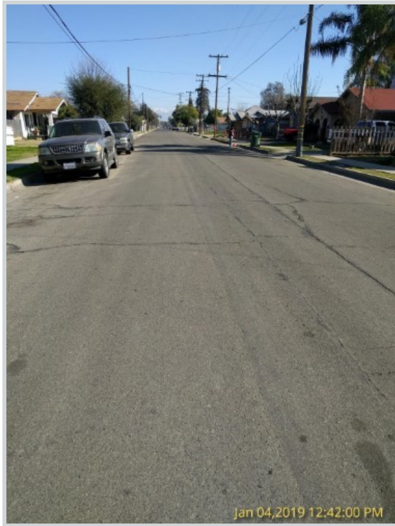
Subject 1099 E Park Way

Address 1099 E Park Way, Dinuba, CA 93618 Loan Number 34308 Suggested List $159,000 Suggested Repaired $159,000 Sale $159,000