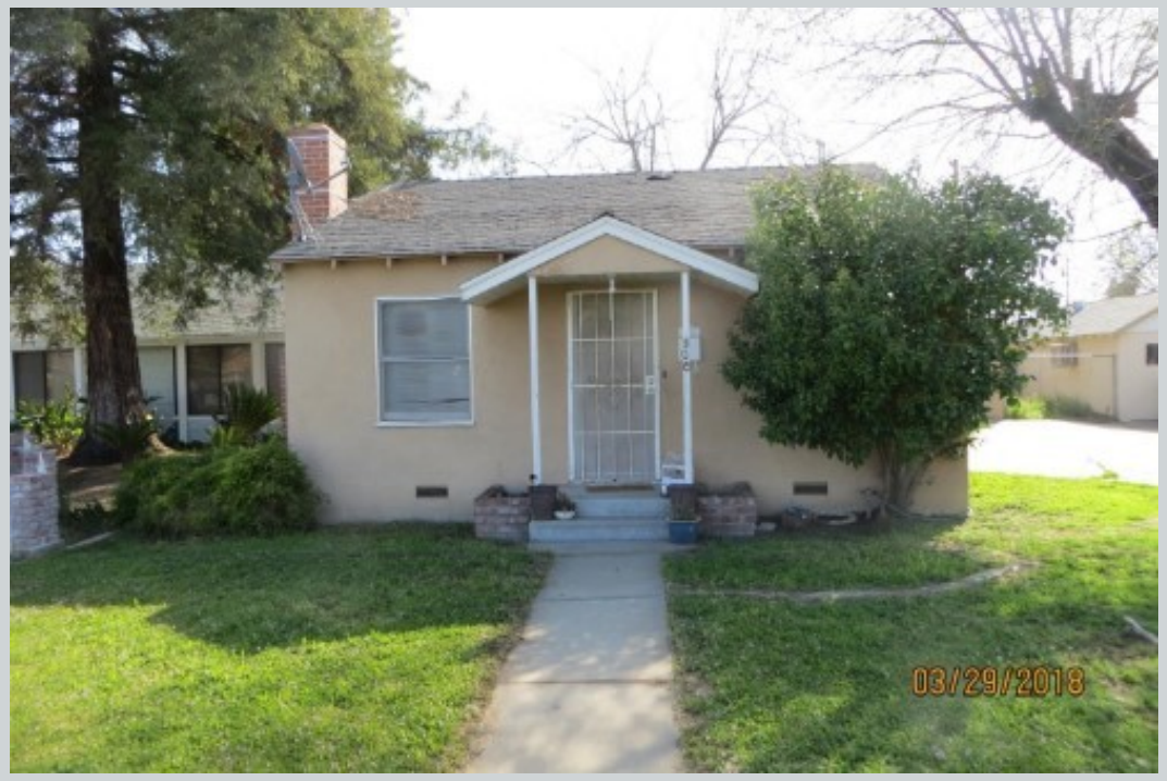
Sold Comp 1 300 N Bates Ave

Address 1099 E Park Way, Dinuba, CA 93618 Loan Number 34308 Suggested List $159,000 Suggested Repaired $159,000 Sale $159,000