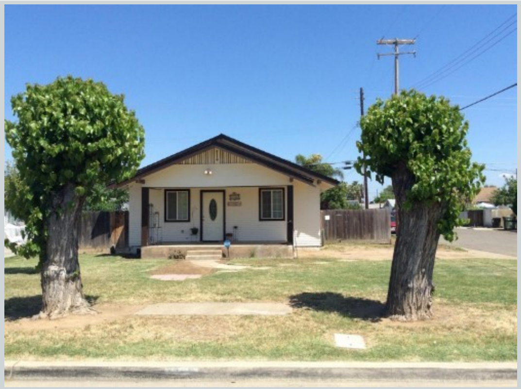
Sold Comp 2 1493 E Olive Way