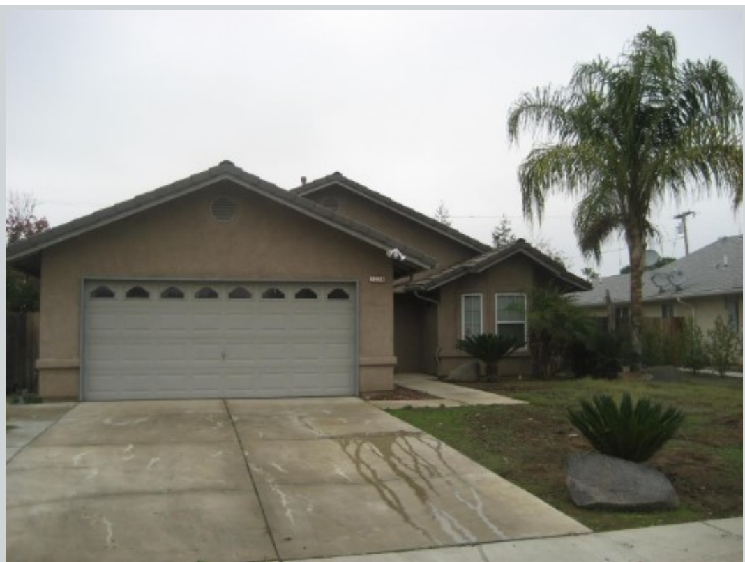
Listing Comp 3 1225 Brent Rd