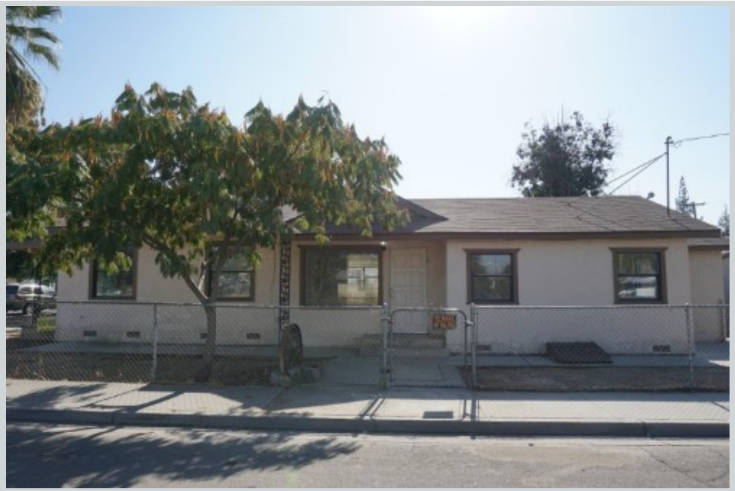
Sold Comp 3 305 South P St

Address 1099 E Park Way, Dinuba, CA 93618 Loan Number 34308 Suggested List $159,000 Suggested Repaired $159,000 Sale $159,000