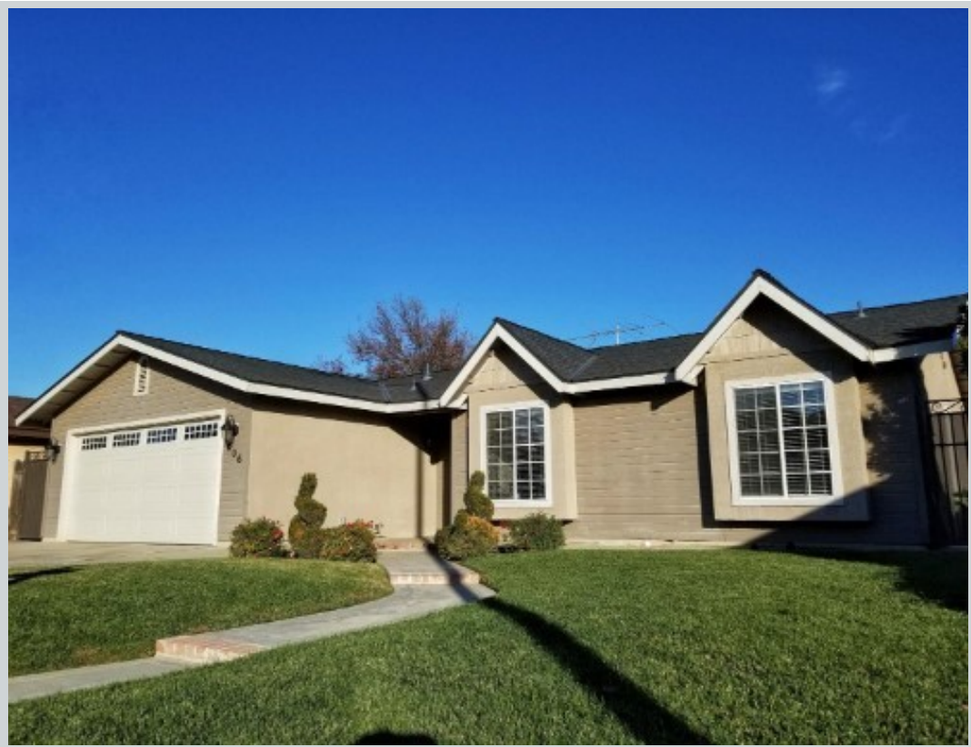
Listing Comp 2 806 N Charles St