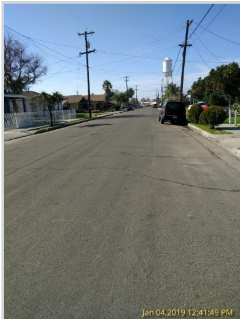
Subject 1099 E Park Way