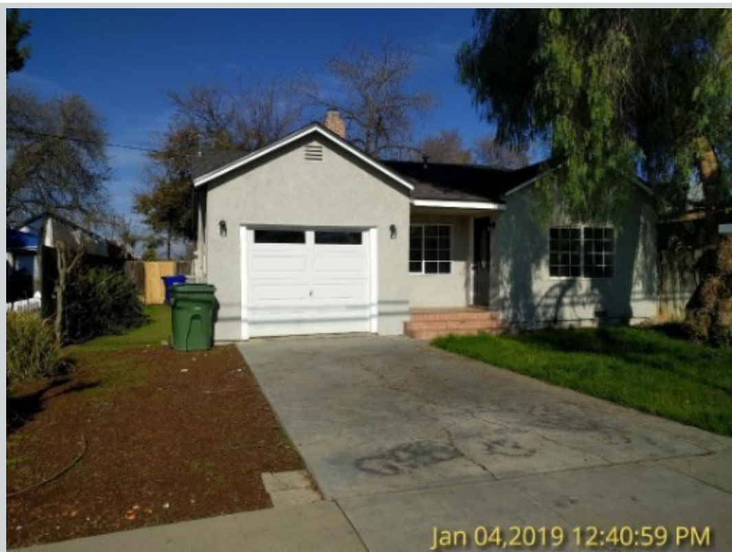
Subject 1099 E Park Way