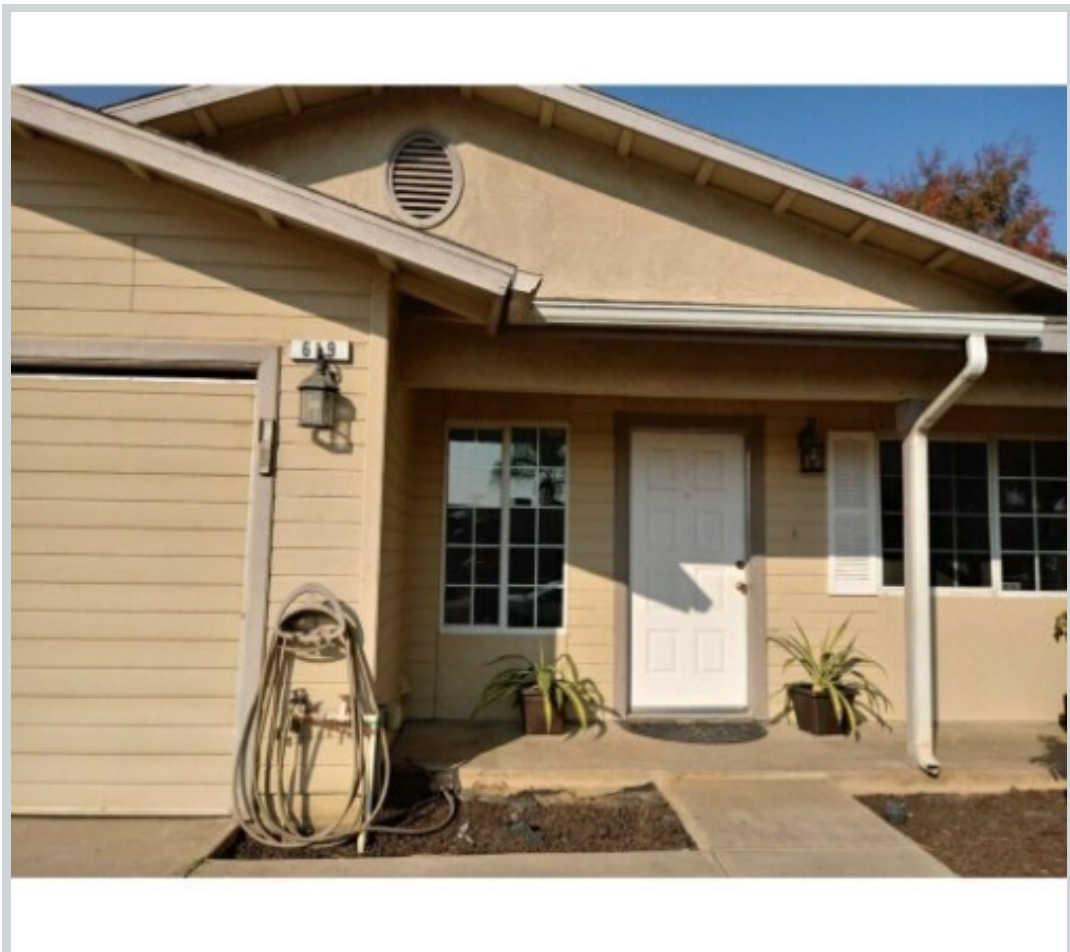
Listing Comp 1 619 E Marshall Ave