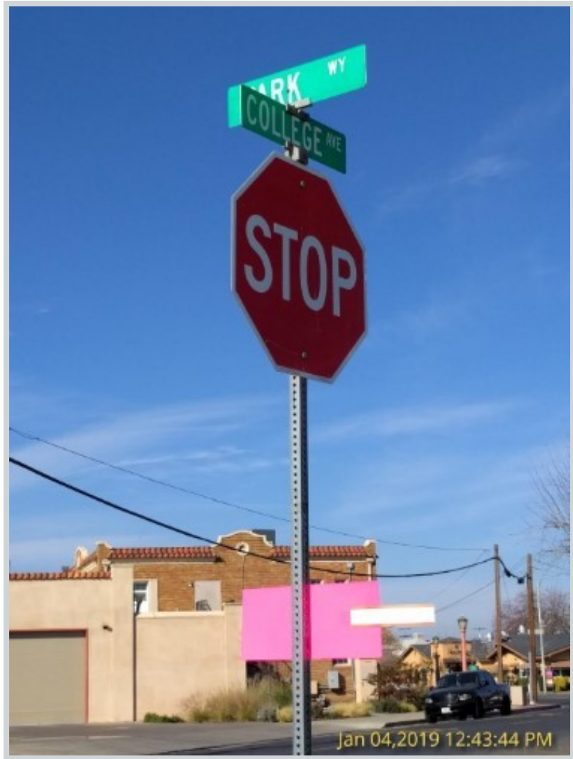
Subject 1099 E Park Way

Address 1099 E Park Way, Dinuba, CA 93618 Loan Number 34308 Suggested List $159,000 Suggested Repaired $159,000 Sale $159,000