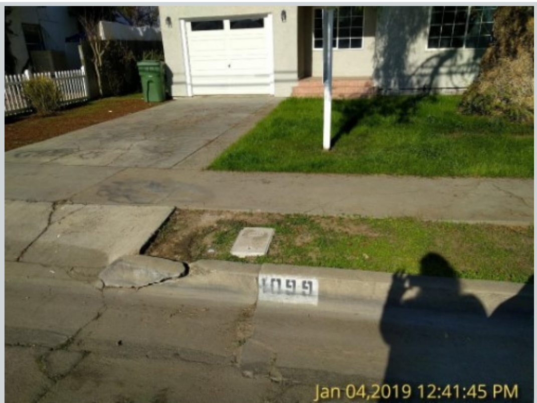
Subject 1099 E Park Way