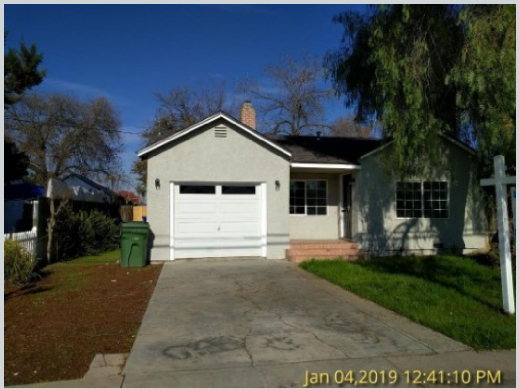
Subject 1099 E Park Way

Address 1099 E Park Way, Dinuba, CA 93618 Loan Number 34308 Suggested List $159,000 Suggested Repaired $159,000 Sale $159,000