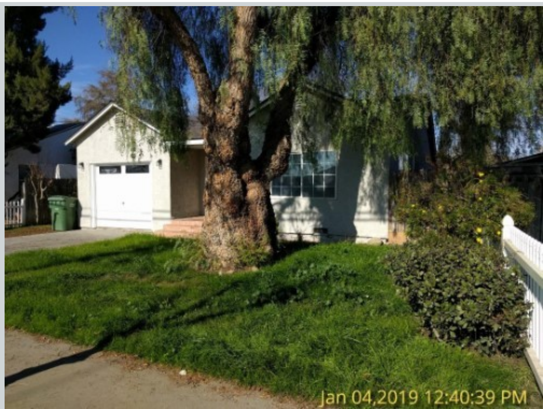
Subject 1099 E Park Way

Address 1099 E Park Way, Dinuba, CA 93618 Loan Number 34308 Suggested List $159,000 Suggested Repaired $159,000 Sale $159,000