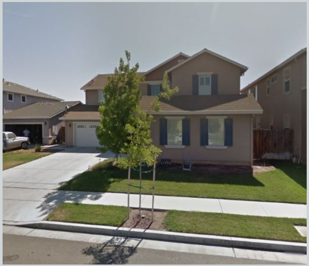
Listing Comp 1