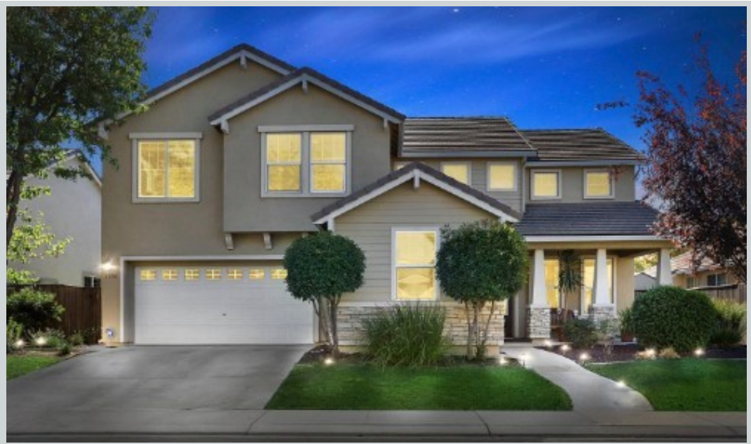
Sold Comp 3