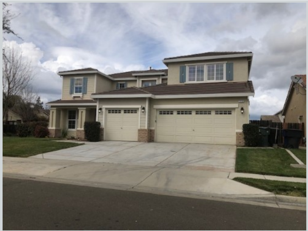
Subject 1233 Fawn Lily Dr