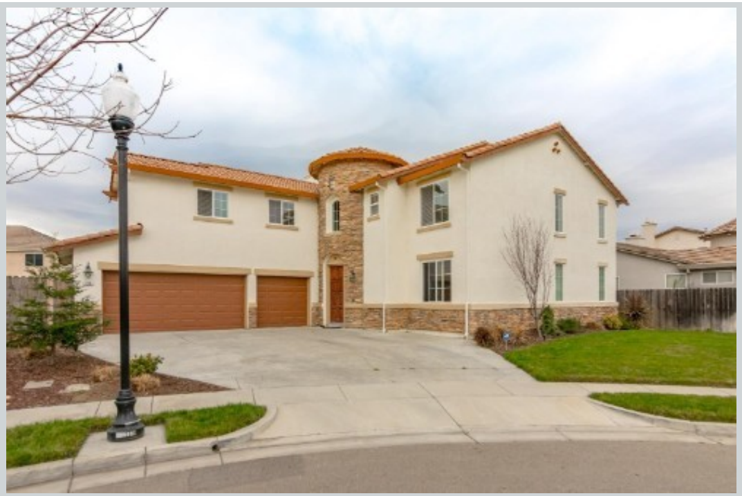
Listing Comp 2