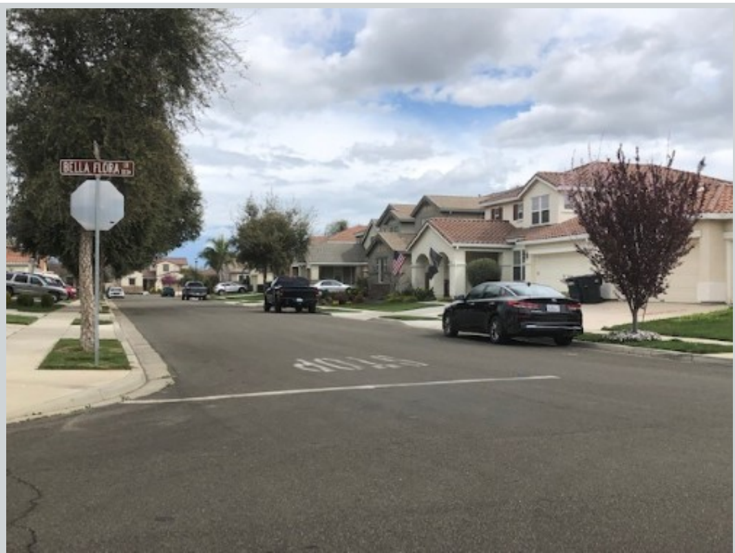
Subject 1233 Fawn Lily Dr

Address 1233 Fawn Lily Drive, Patterson, CA 95363 Loan Number 35044 Suggested List $466,000 Suggested Repaired $466,000 Sale $444,000