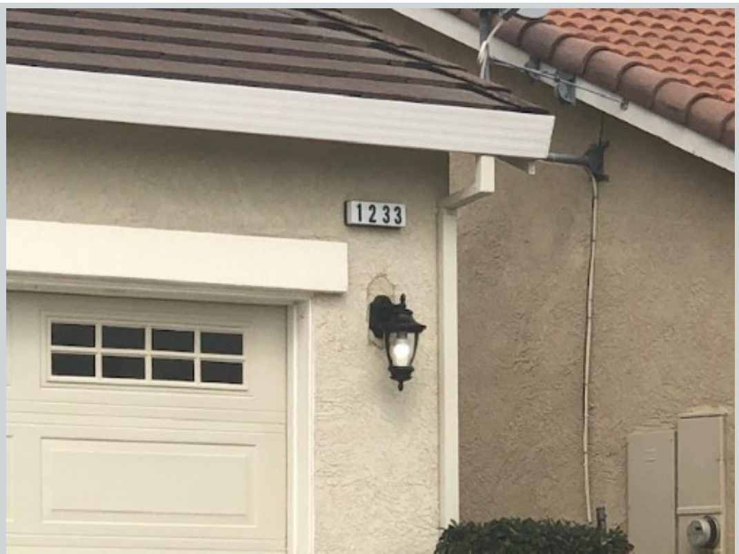
Subject 1233 Fawn Lily Dr