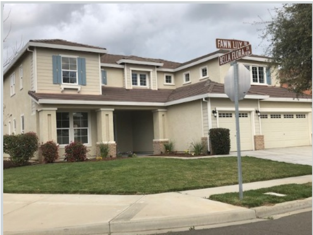
Subject 1233 Fawn Lily Dr