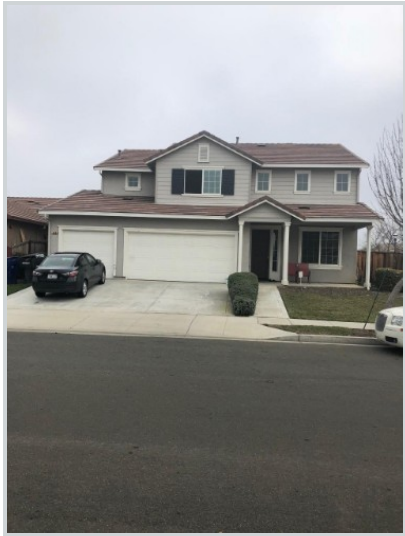
Listing Comp 3