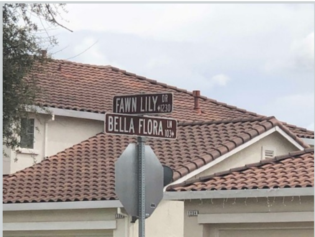
Subject 1233 Fawn Lily Dr