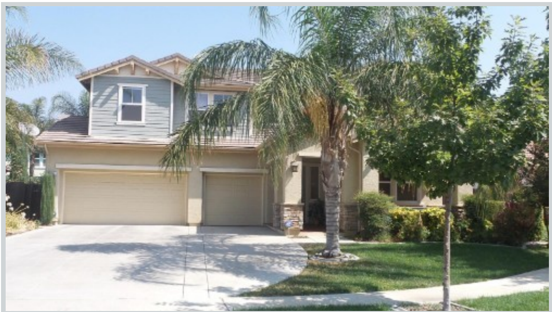
Sold Comp 1