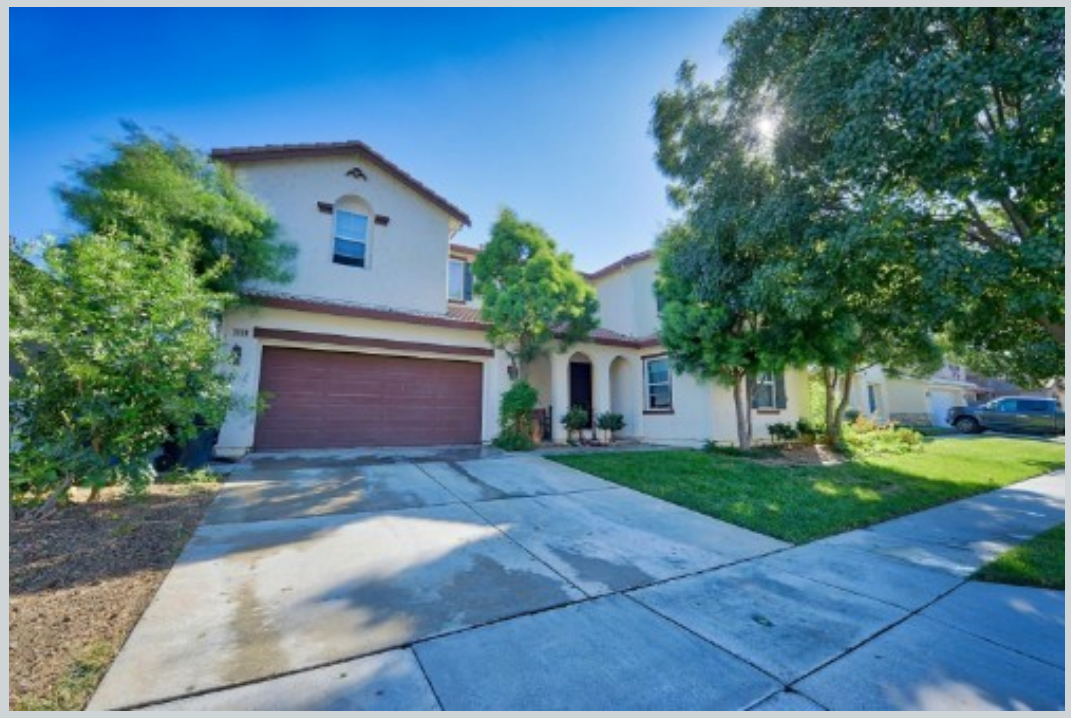
Sold Comp 2