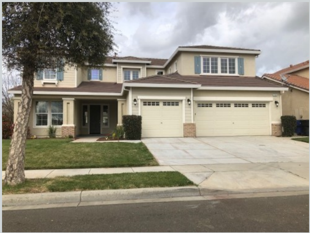
Subject 1233 Fawn Lily Dr