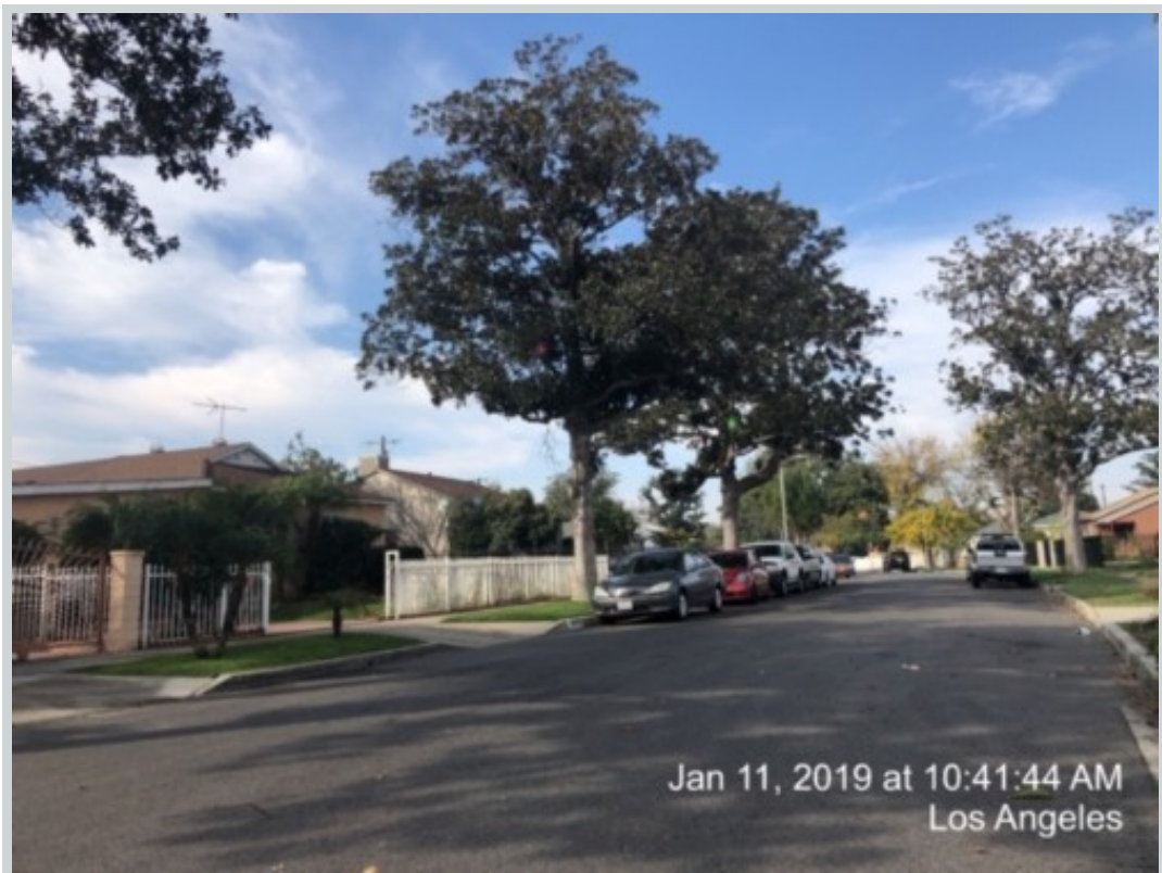
Subject 8018 Katherine Ave