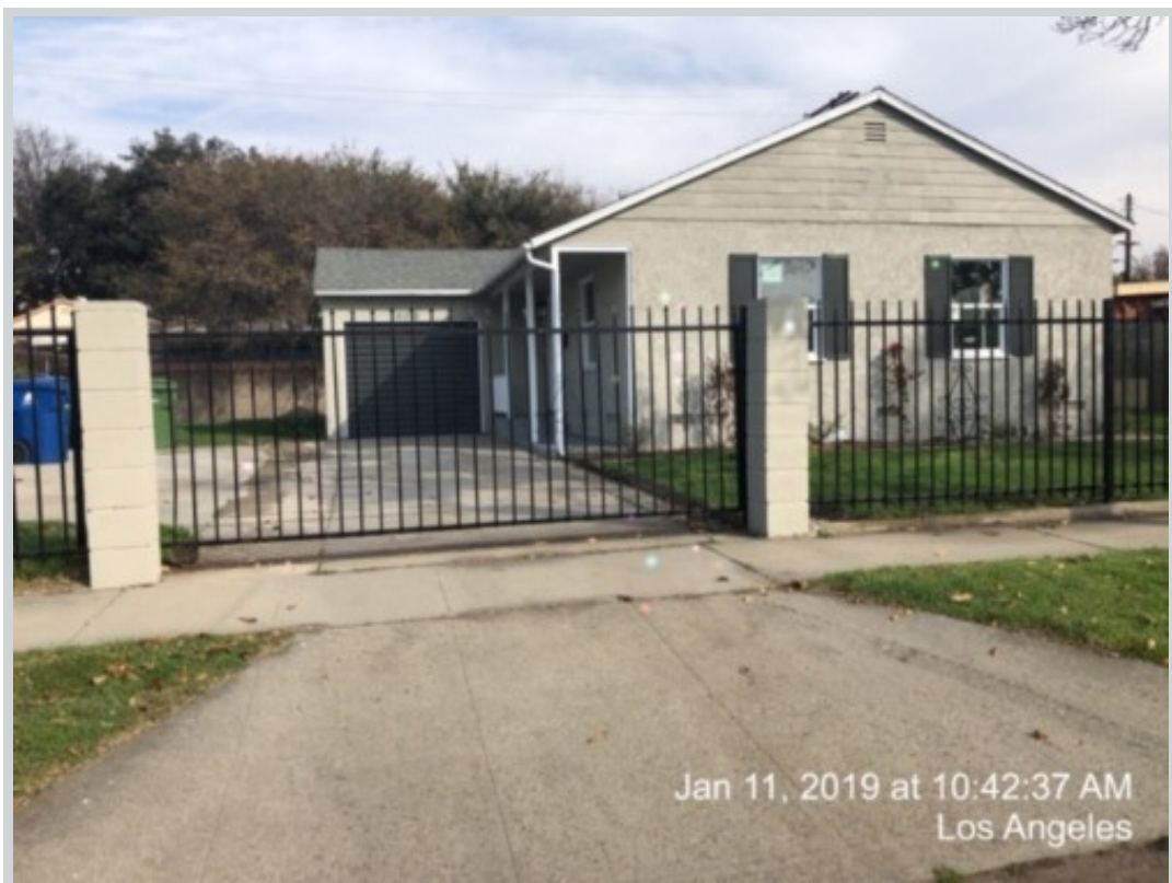
Subject 8018 Katherine Ave