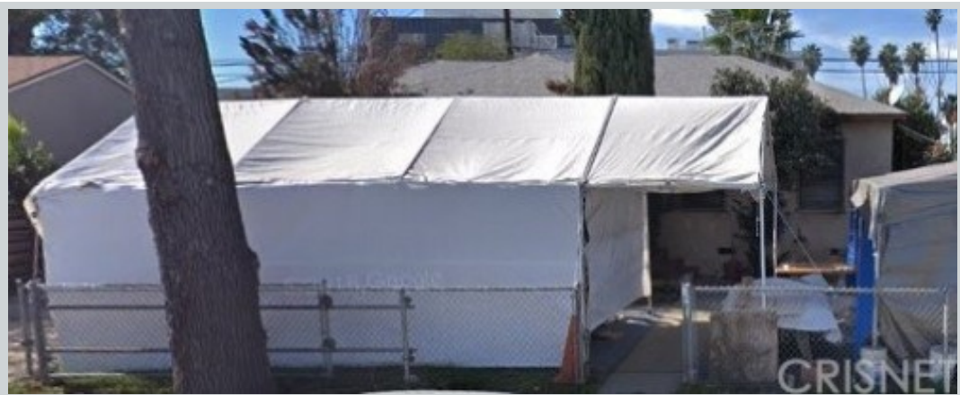
Sold Comp 3 8137 Tilden