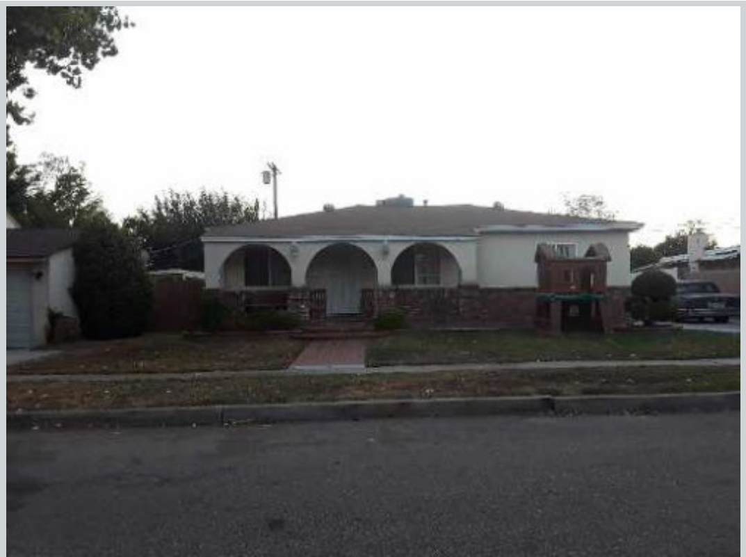
Sold Comp 1 8427 Colbath