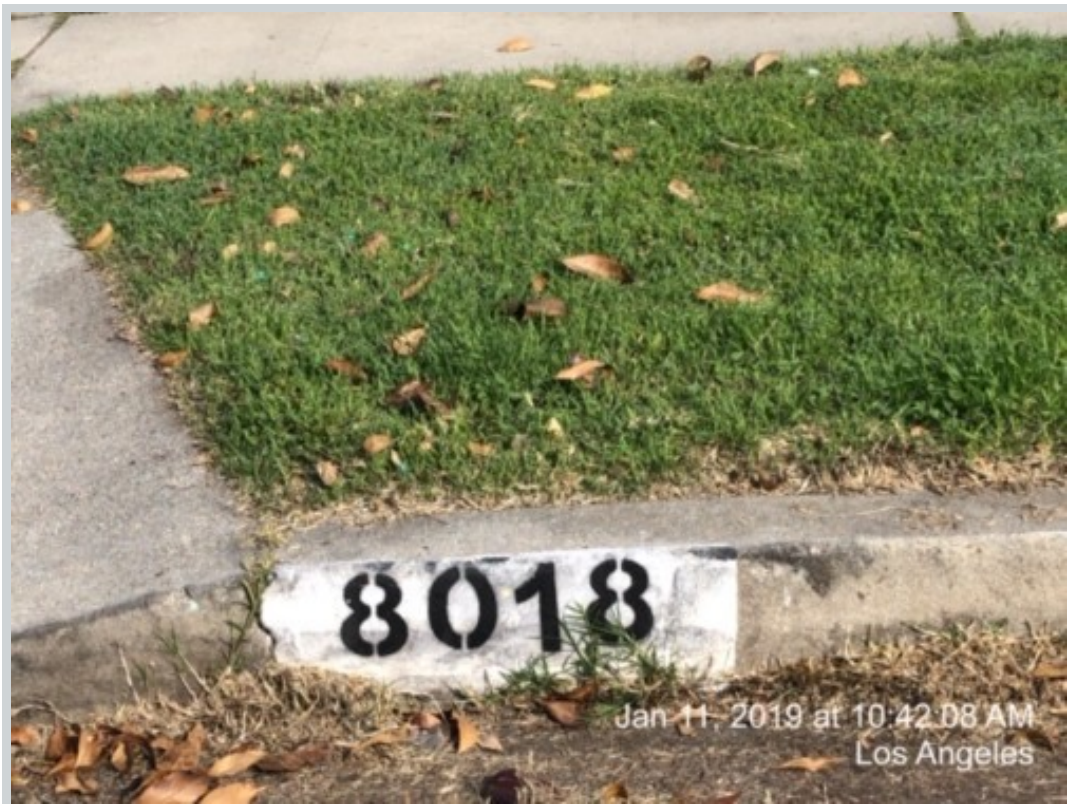
Subject 8018 Katherine Ave