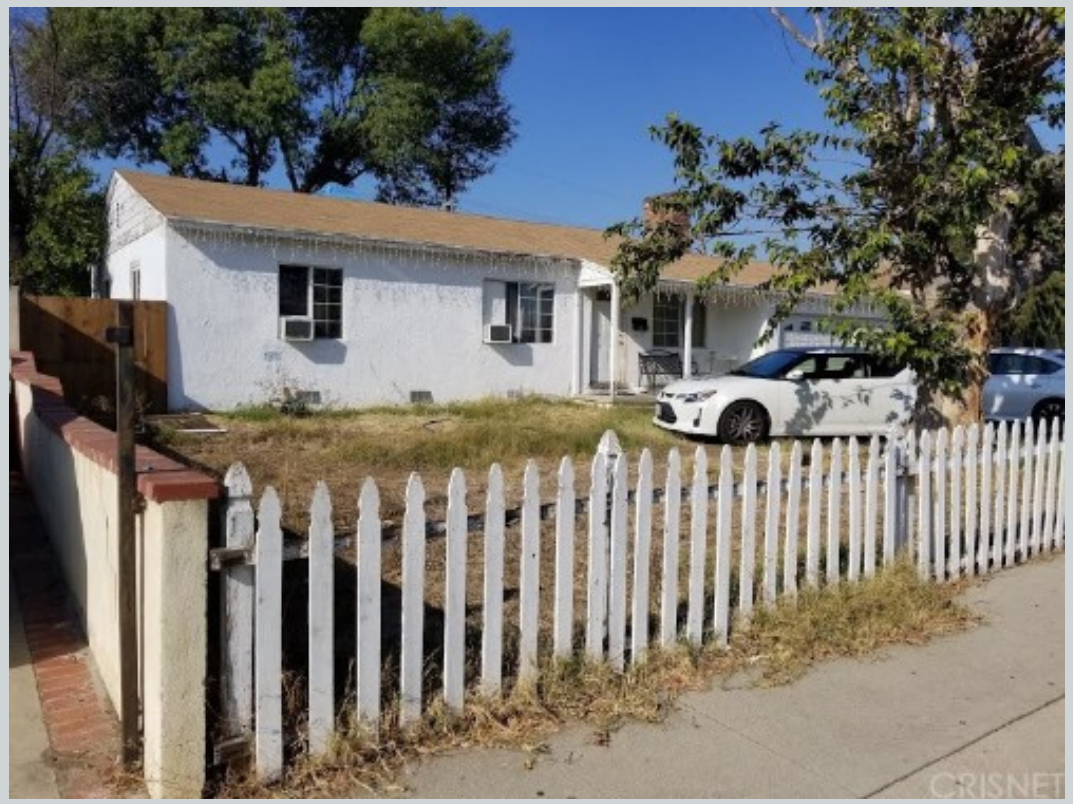
Listing Comp 3 8901 Moonbeam