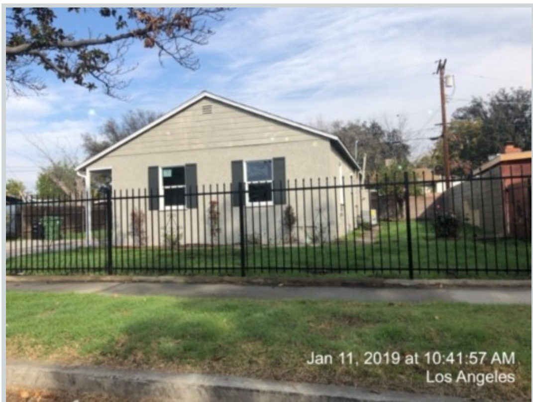
Subject 8018 Katherine Ave