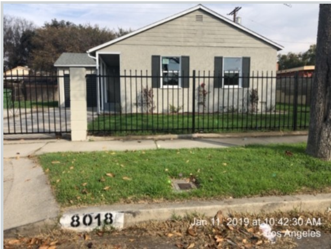
Subject 8018 Katherine Ave