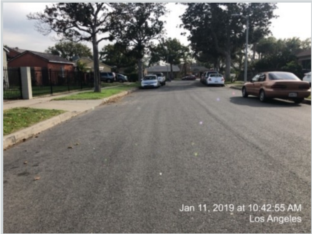
Subject 8018 Katherine Ave