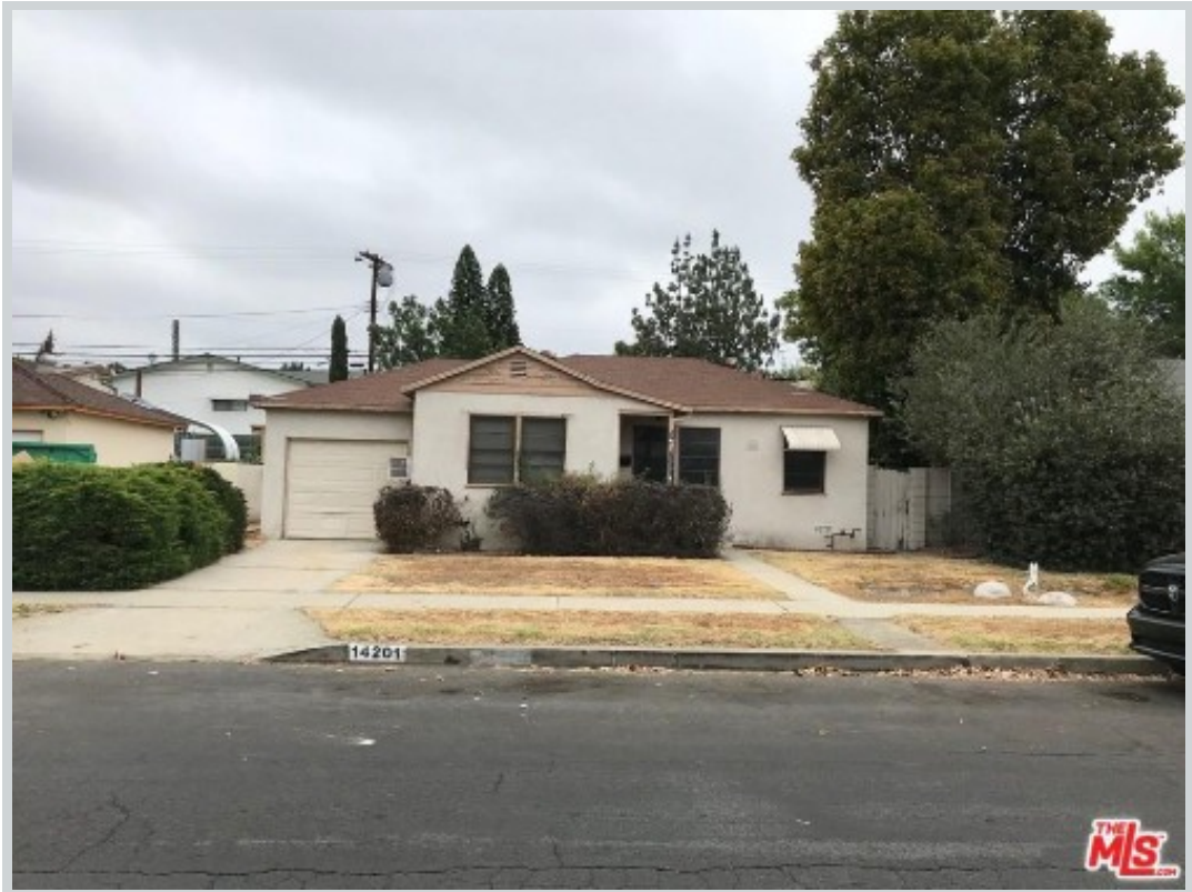
Listing Comp 1 14201 Burton