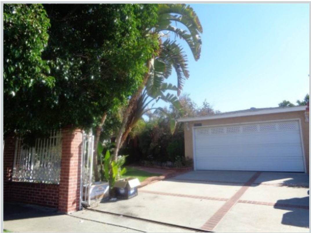
Listing Comp 2 8428 Sylmar