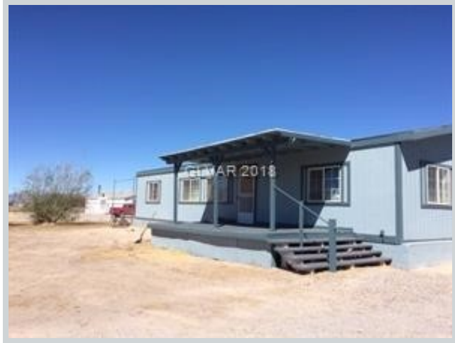
Listing Comp 1