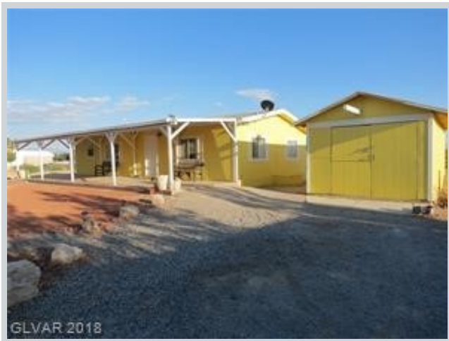
Sold Comp 1