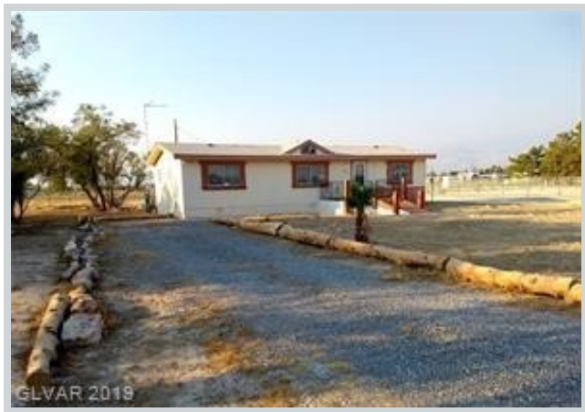
Listing Comp 2