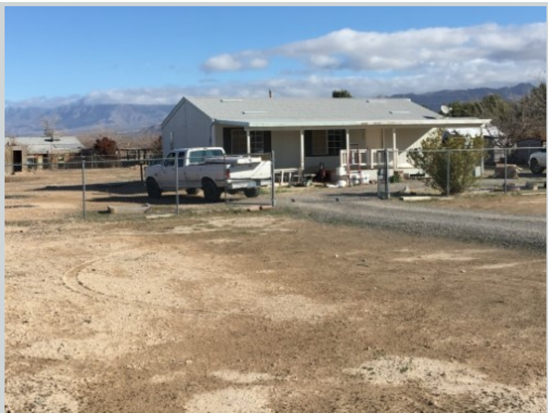
Subject 4030 Paiute Blvd