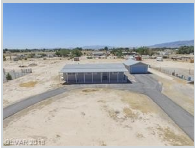
Sold Comp 2