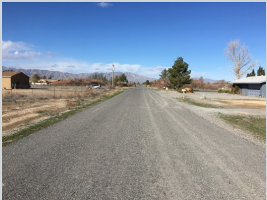
Subject 4030 Paiute Blvd