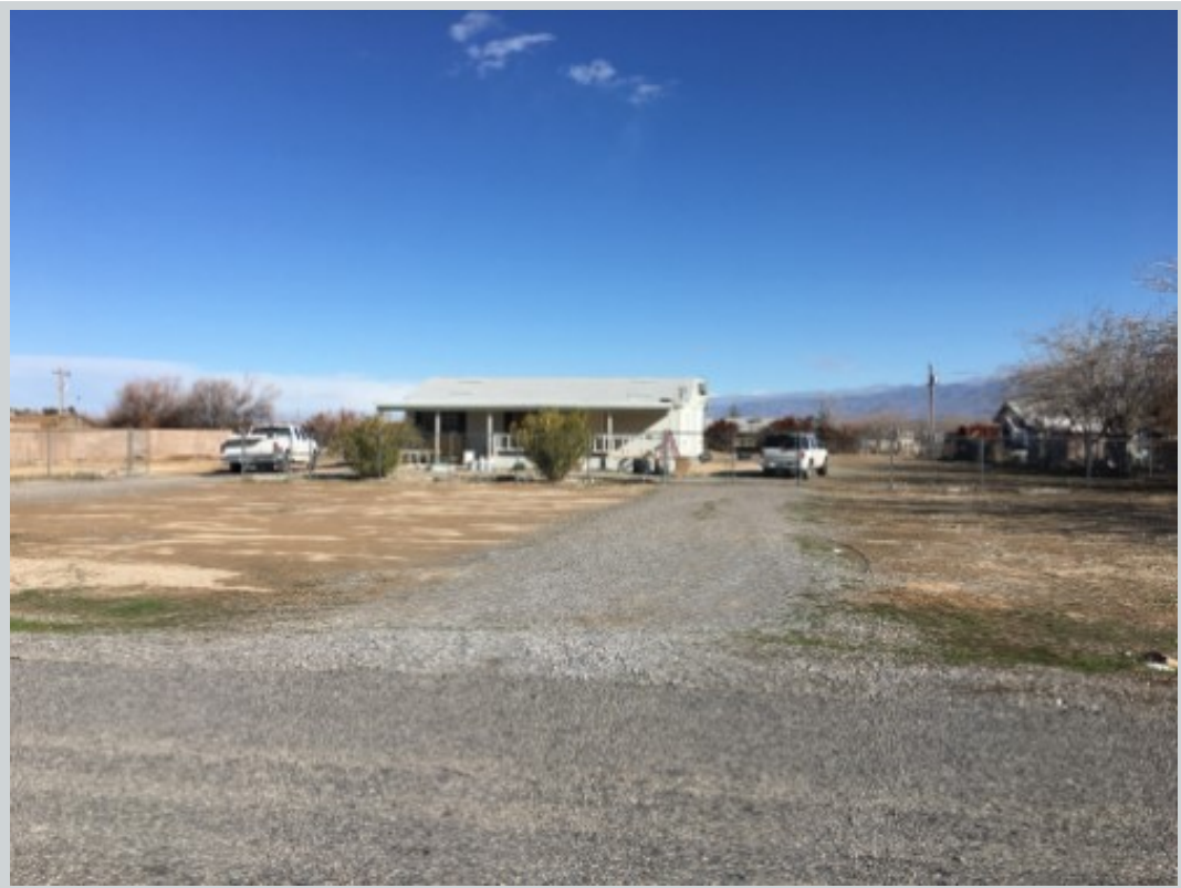
Subject 4030 Paiute Blvd