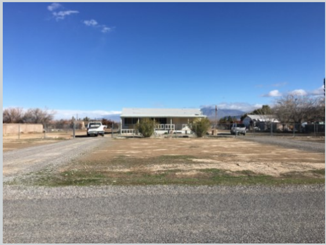
Subject 4030 Paiute Blvd