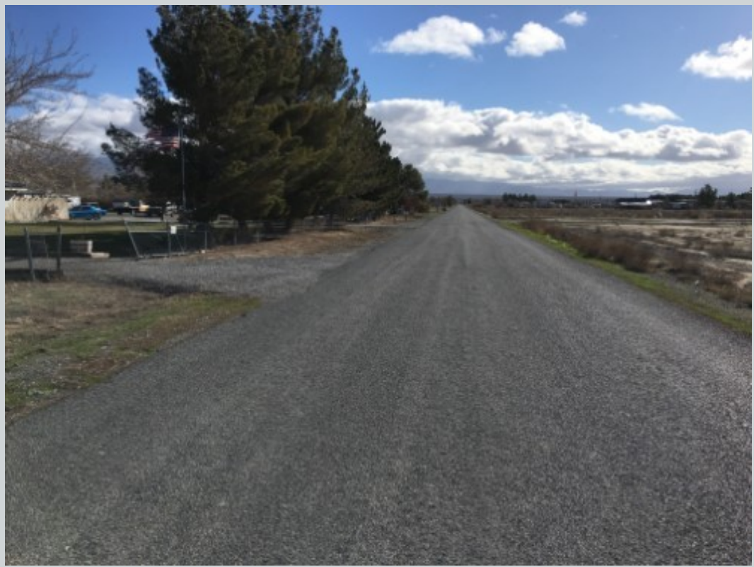
Subject 4030 Paiute Blvd