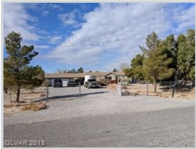
Listing Comp 3