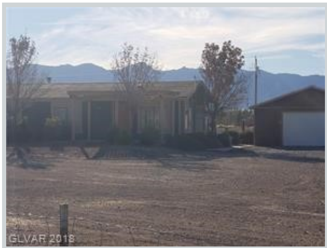
Sold Comp 3