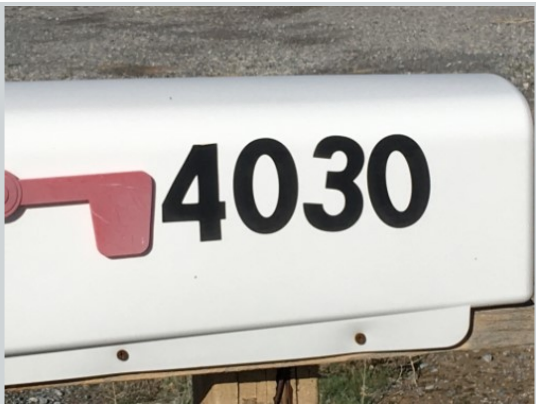
Subject 4030 Paiute Blvd