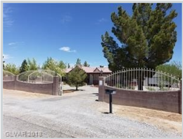
Listing Comp 2