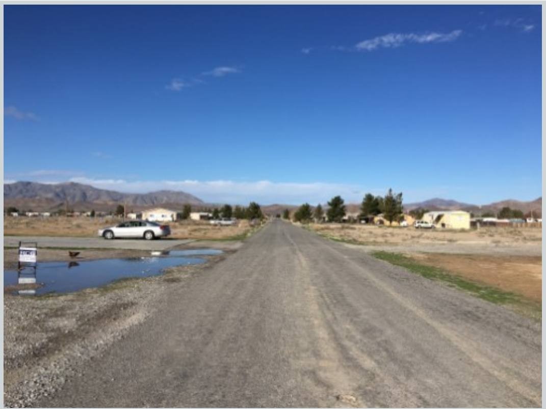
Subject 3731 W Donner St