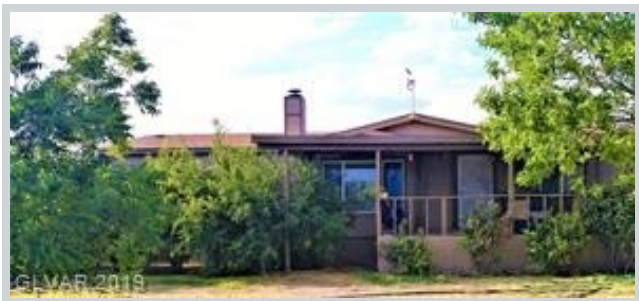
Listing Comp 1

Address 3731 W Donner Street, Pahrump, NV 89048 Loan Number 35494 Suggested List $146,000 Suggested Repaired $146,000 Sale $146,000