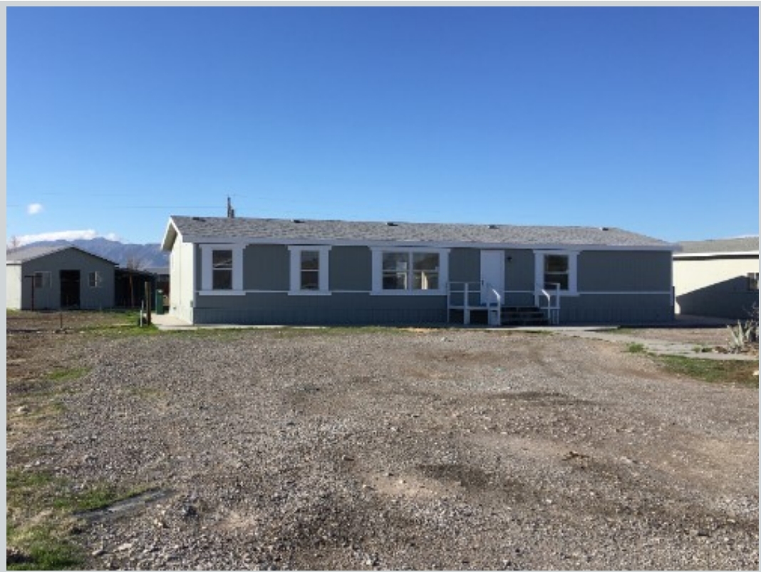
Subject 3731 W Donner St