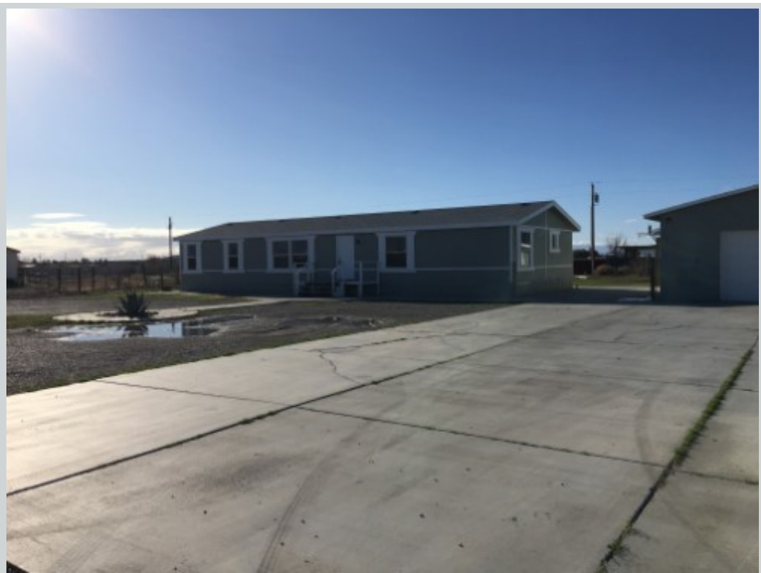
Subject 3731 W Donner St