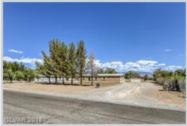
Sold Comp 3