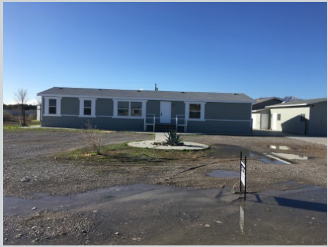
Subject 3731 W Donner St