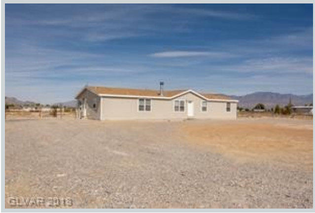
Sold Comp 2