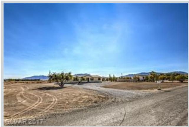
Sold Comp 1