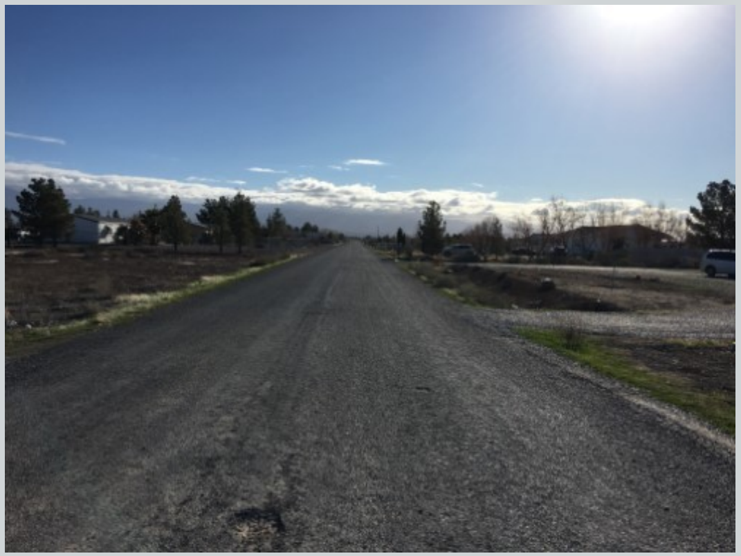
Subject 3731 W Donner St