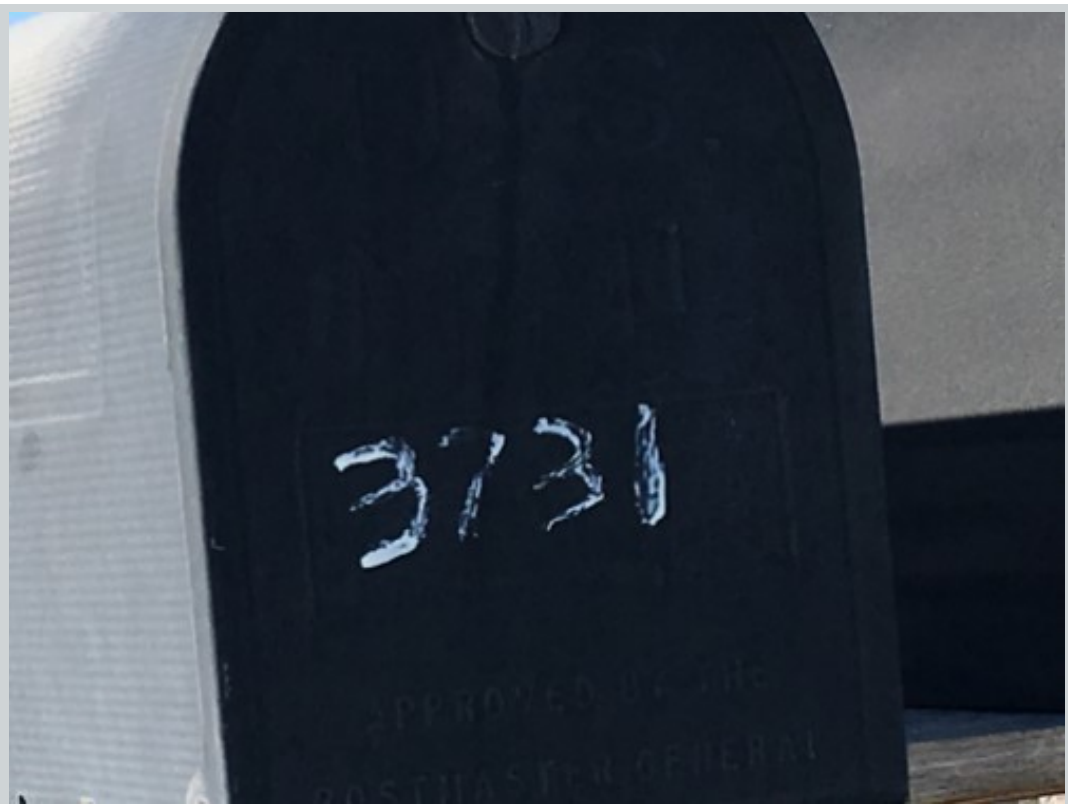
Subject 3731 W Donner St