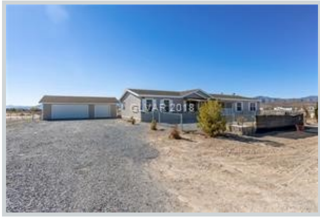
Listing Comp 3