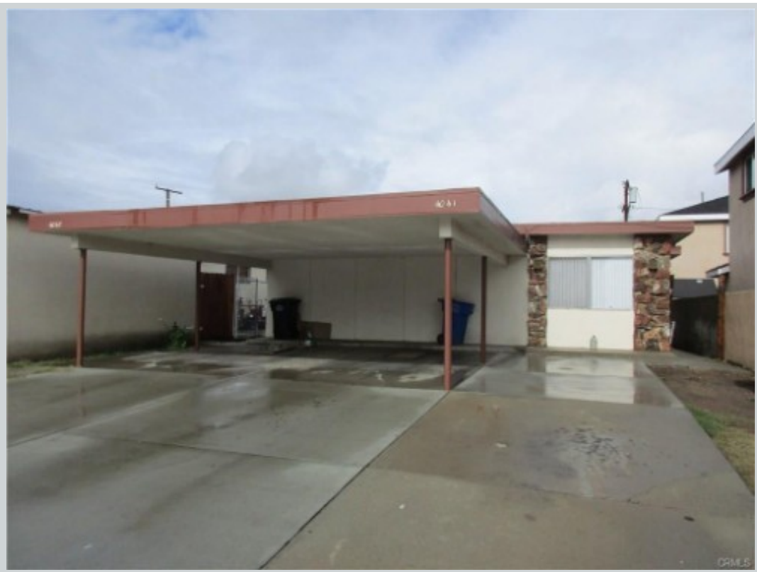
Sold Comp 1 4041 W 166th St