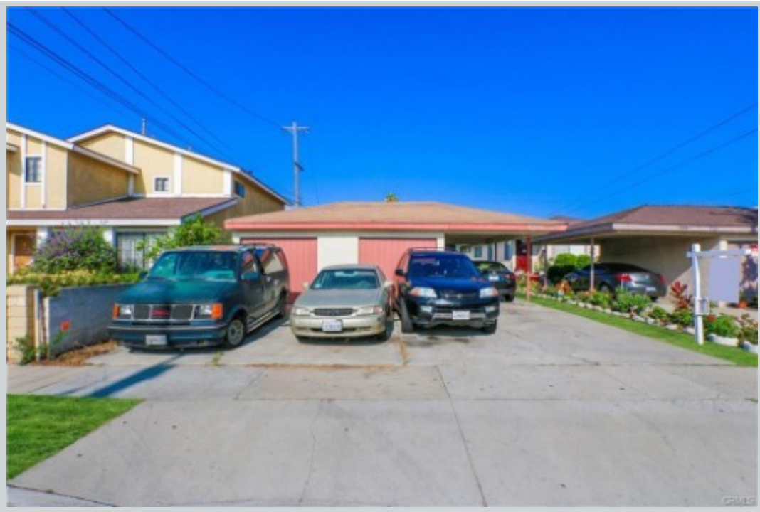
Listing Comp 3 15205 Avis