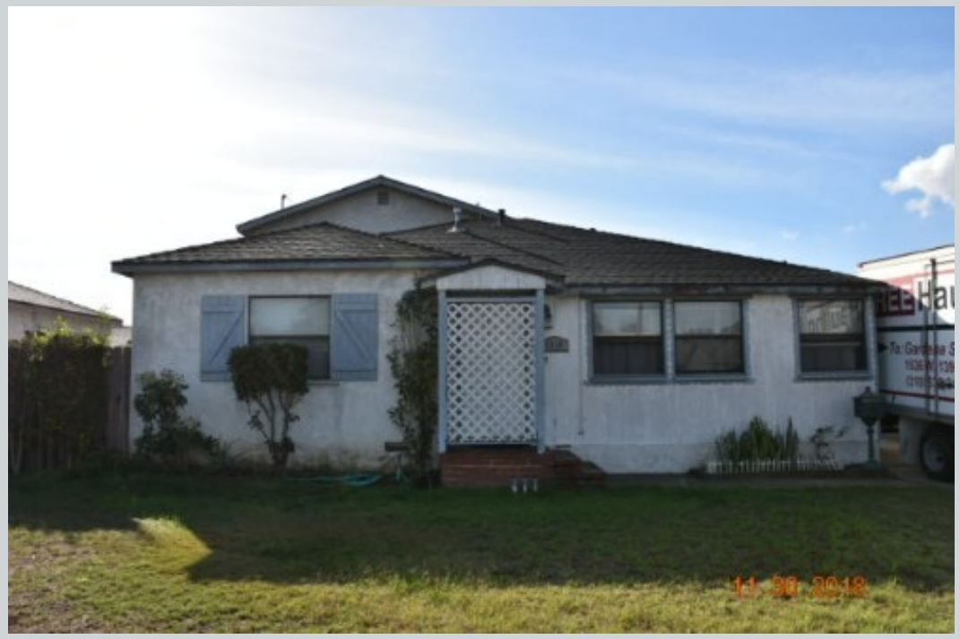
Subject 1610 W Gardena Blvd Unit A