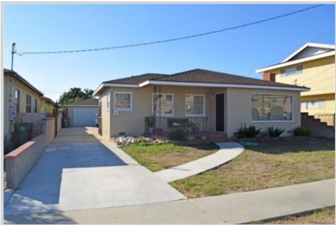
Sold Comp 2 4066 W 136th St