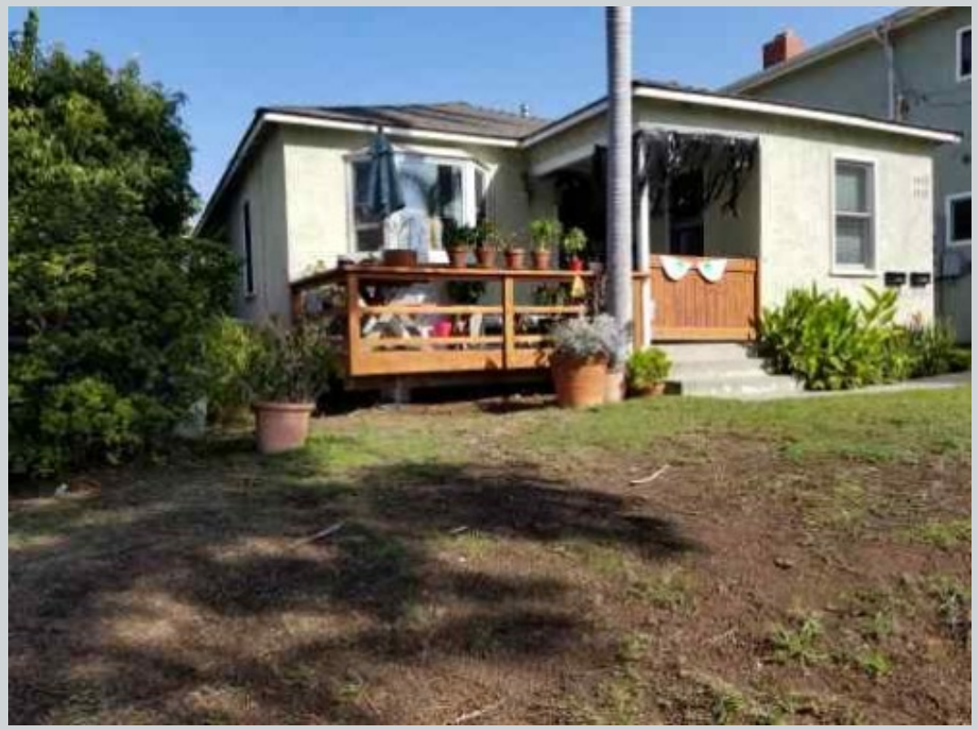
Listing Comp 1 4515 W 173rd St