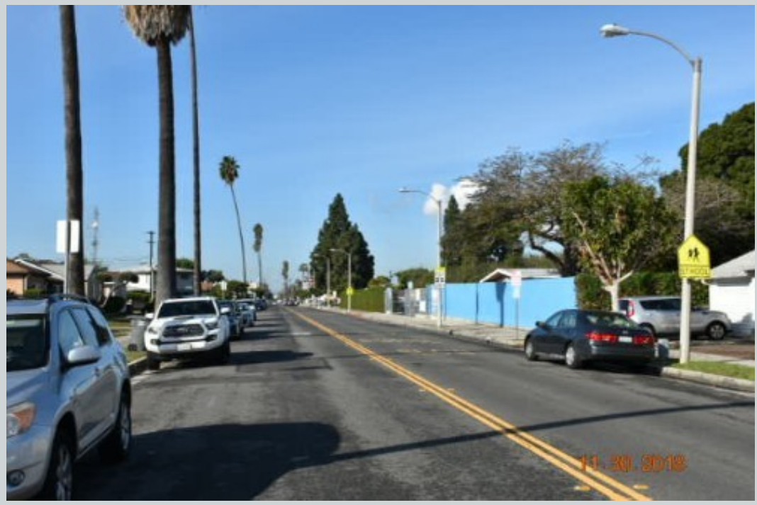
Subject 1610 W Gardena Blvd Unit A