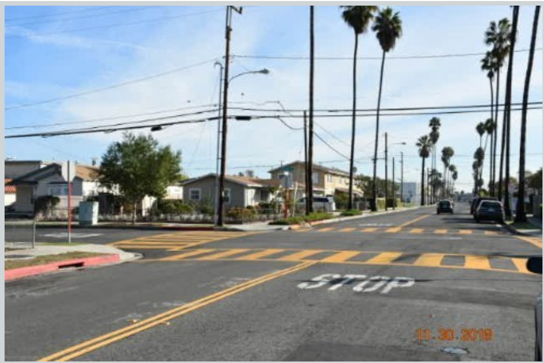
Subject 1610 W Gardena Blvd Unit A