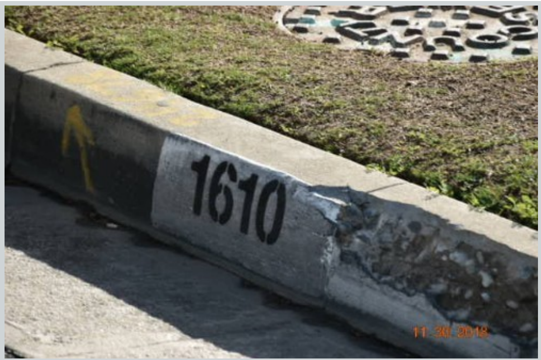
Subject 1610 W Gardena Blvd Unit A