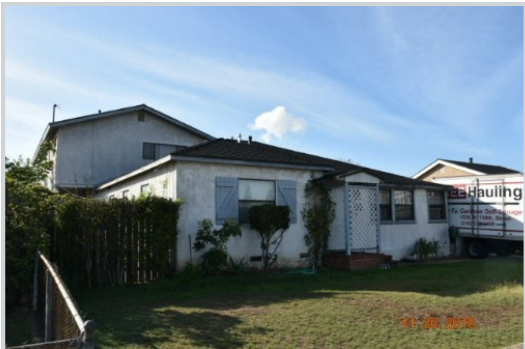
Subject 1610 W Gardena Blvd Unit A View Side

Address 1610 W Gardena Boulevard Unit A, Gardena, CA 90247 Loan Number 35785 Suggested List $770,000 Suggested Repaired $770,000 Sale $760,000