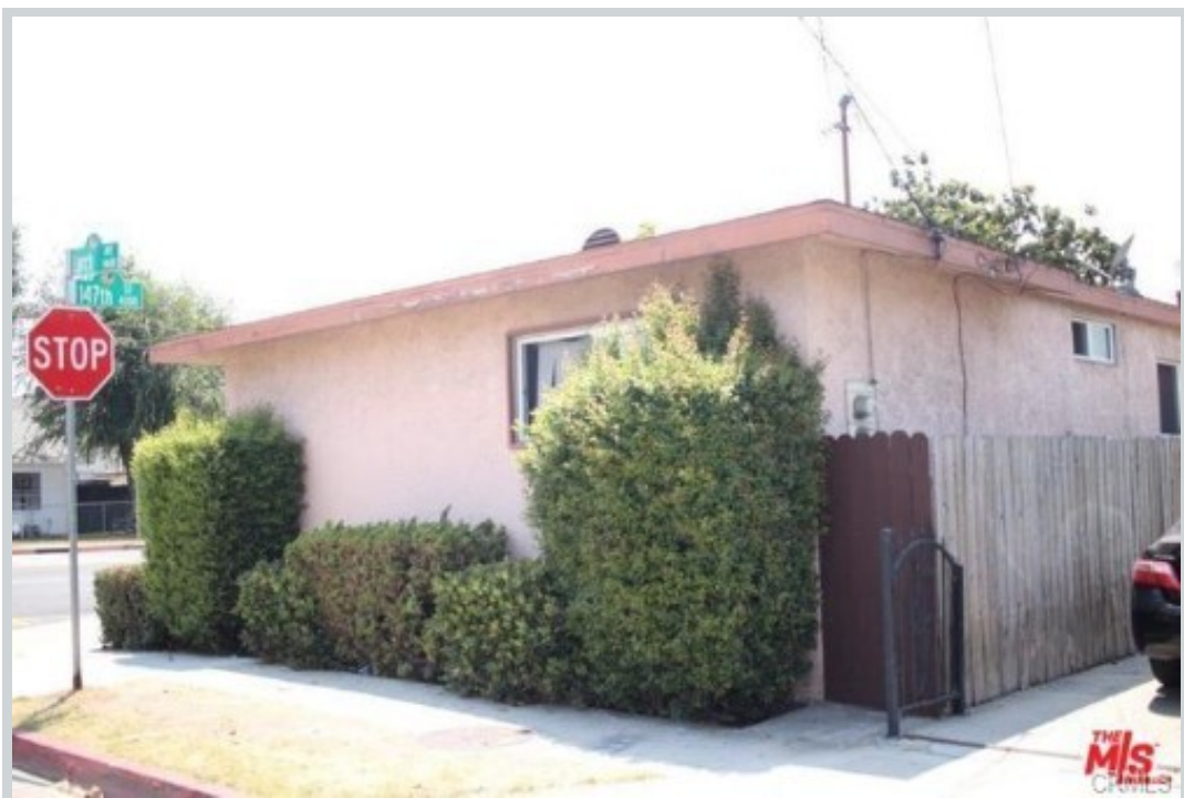
Sold Comp 3 4305 W 147th St