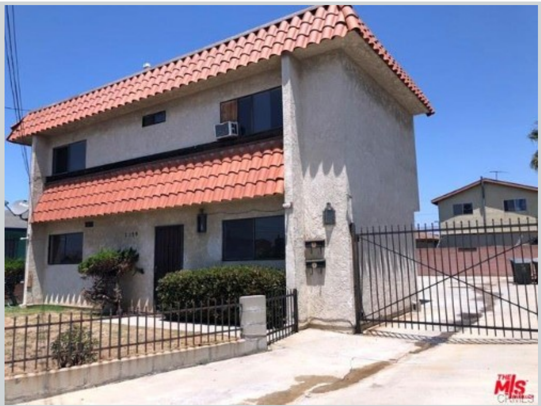
Listing Comp 2 1029 W 168th St