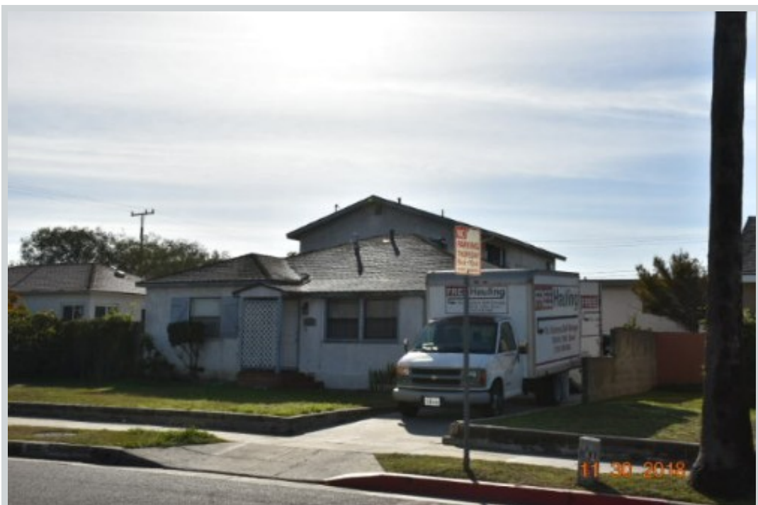
Subject 1610 W Gardena Blvd Unit A View Side