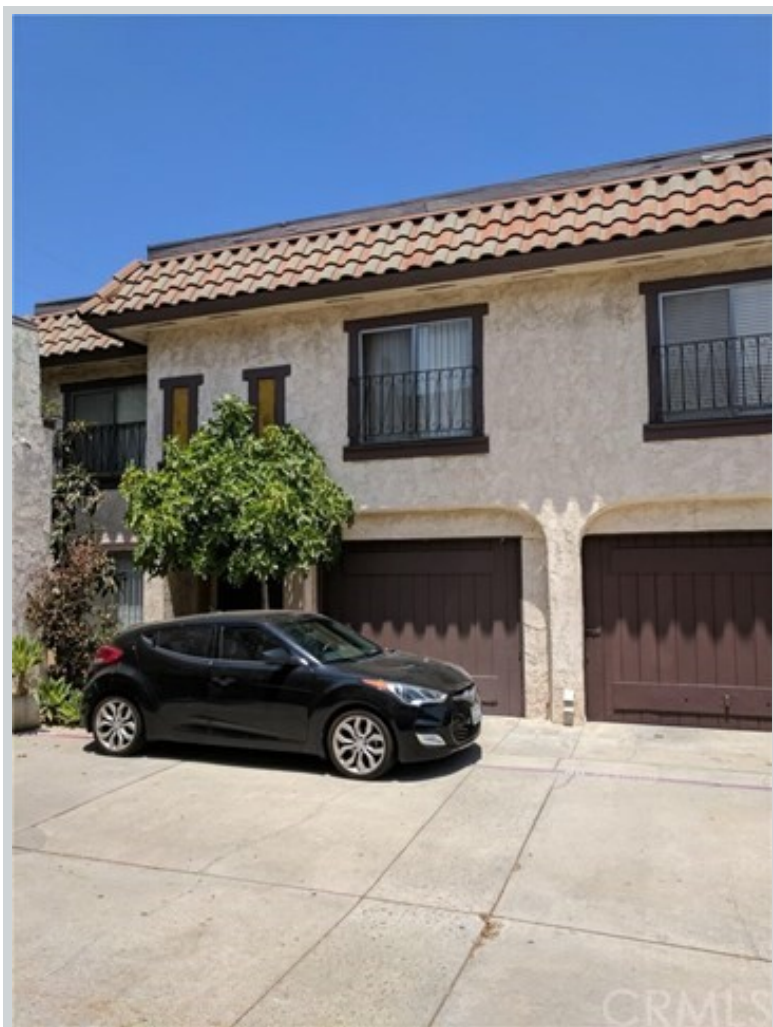
Sold Comp 1 508 S Sefton Ave #A