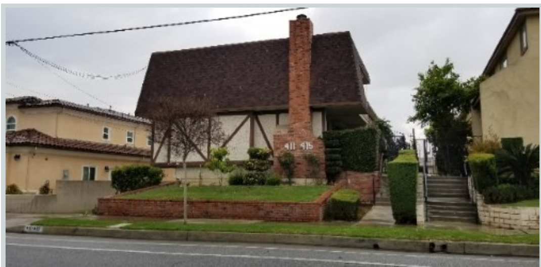
Subject 415 N Alhambra Ave Unit A View Side