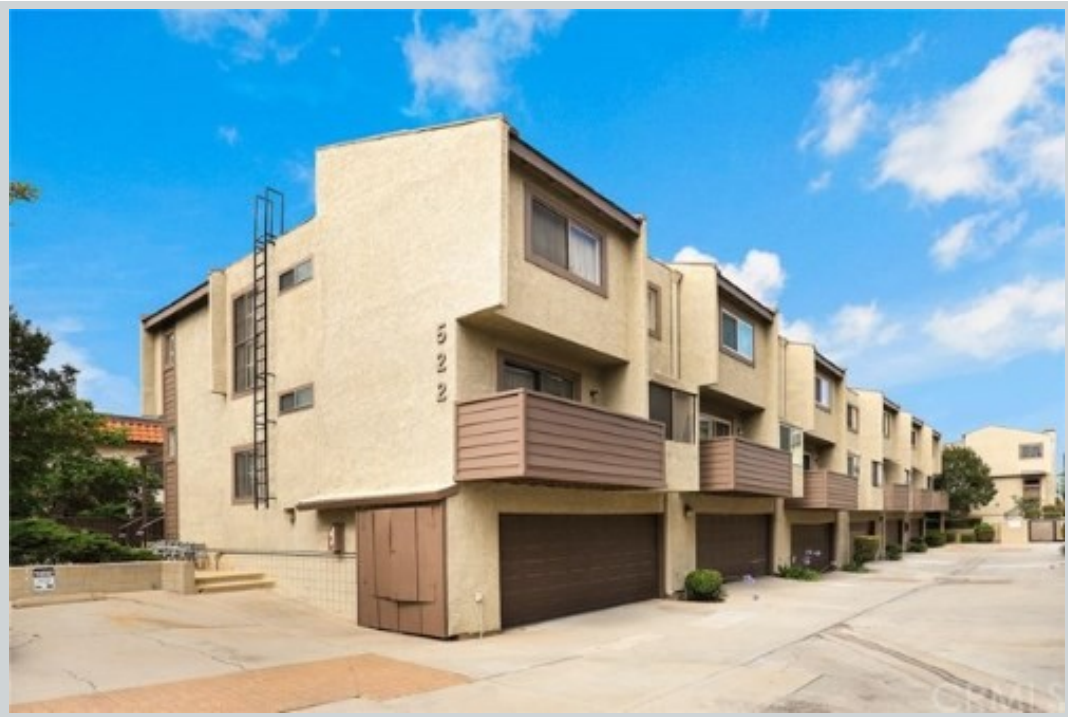
Sold Comp 2 522 Sefton Ave #D