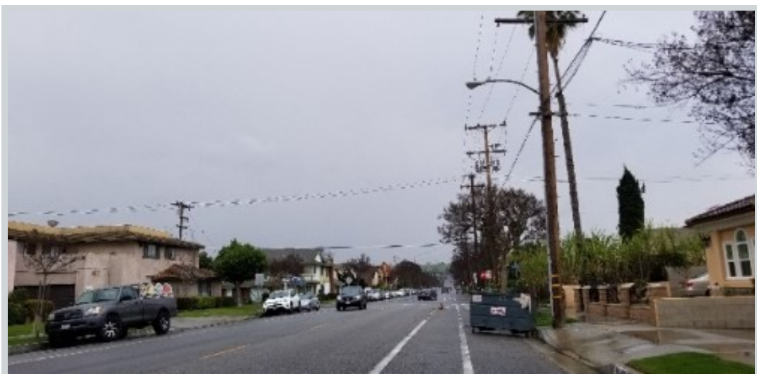
Subject 415 N Alhambra Ave Unit A View Street