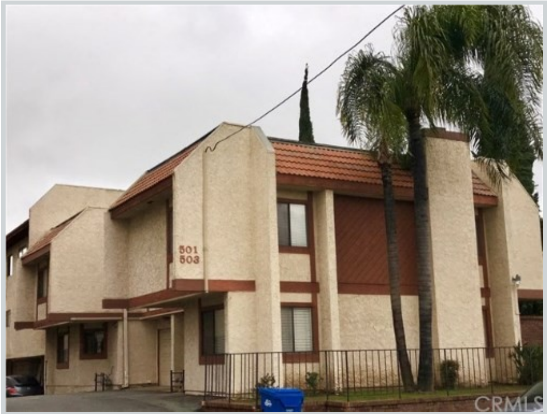
Listing Comp 1 503 Pomelo Ave #B