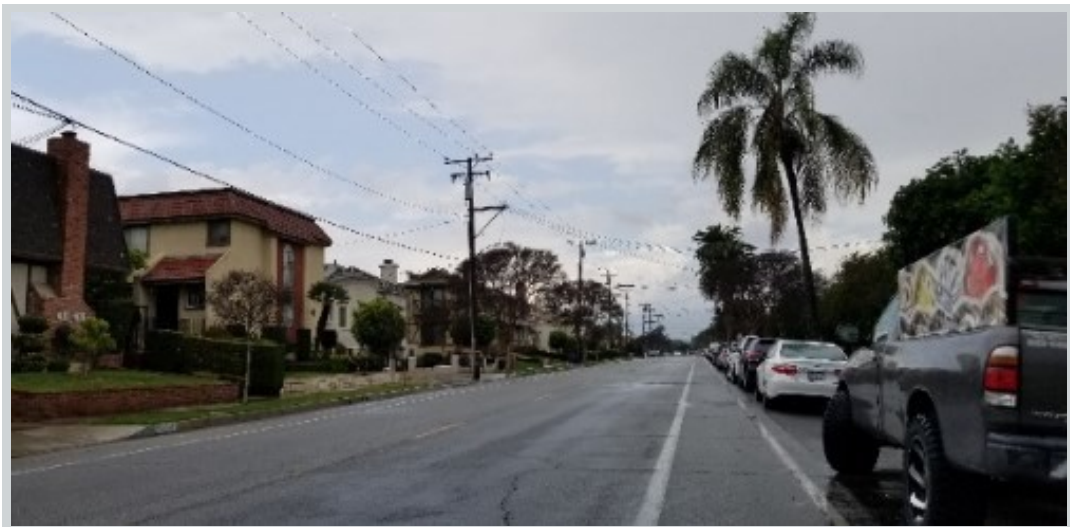
Subject 415 N Alhambra Ave Unit A View Street

Address 415 N Alhambra Avenue A, Monterey Park, CA 91755 Loan Number 35812 Suggested List $549,000 Suggested Repaired $549,000 Sale $540,000