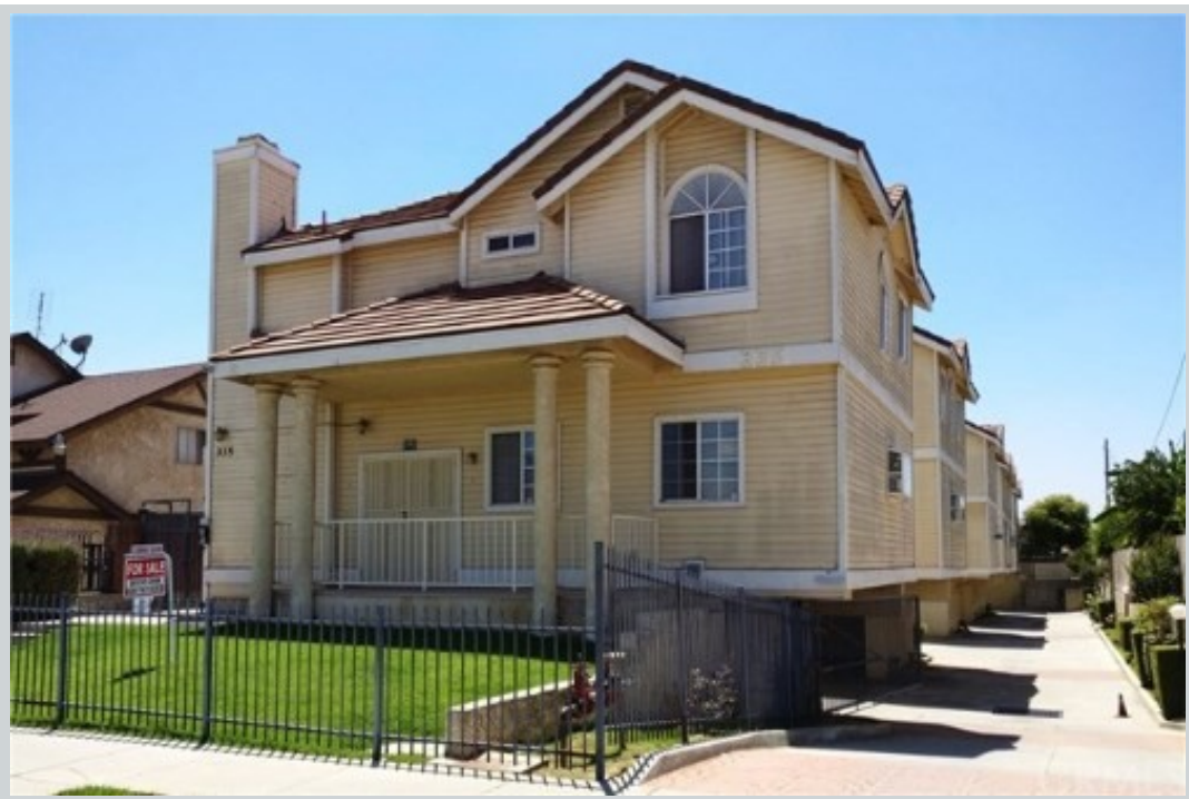
Sold Comp 3 335 Pomelo Ave #B