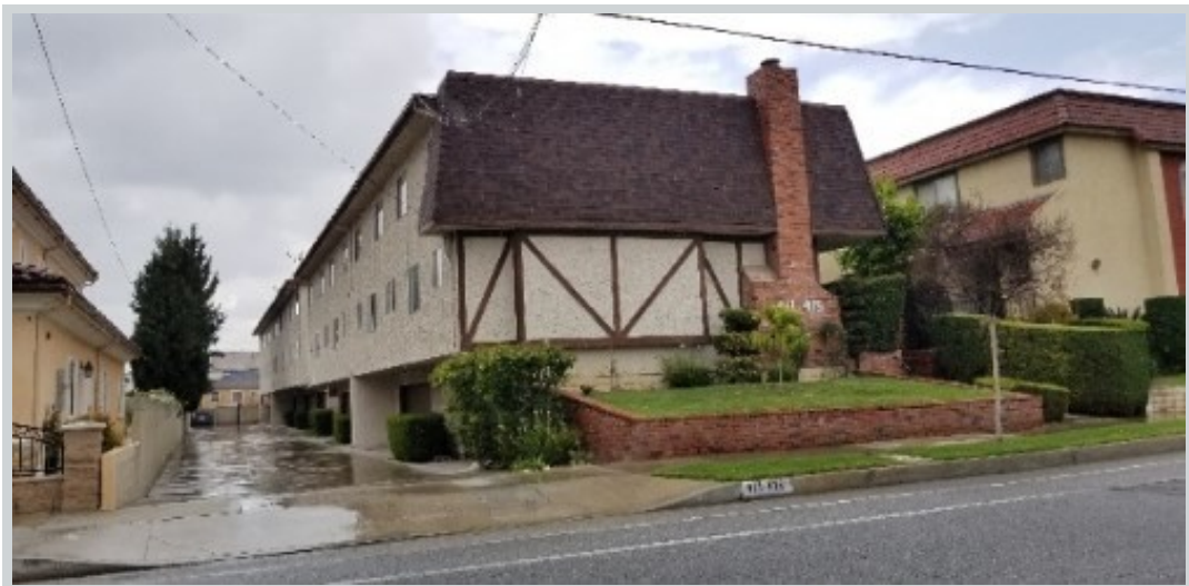
Subject 415 N Alhambra Ave Unit A View Side

Address 415 N Alhambra Avenue A, Monterey Park, CA 91755 Loan Number 35812 Suggested List $549,000 Suggested Repaired $549,000 Sale $540,000