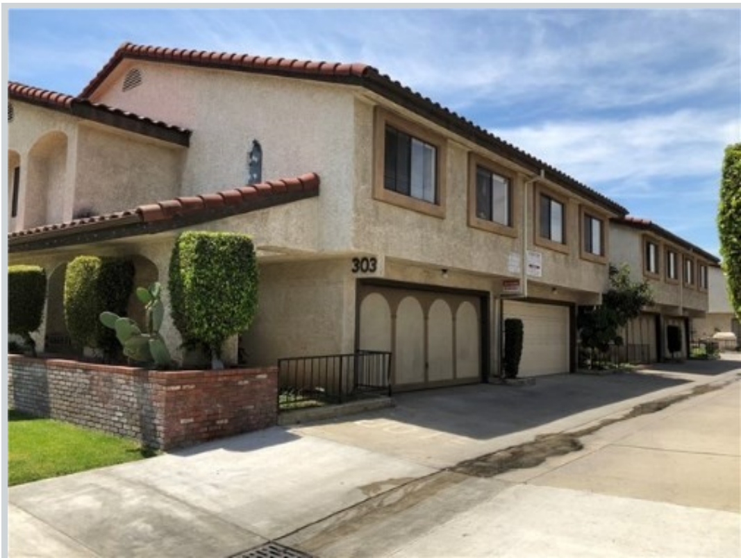
Listing Comp 3 303 N Lincoln Ave #B