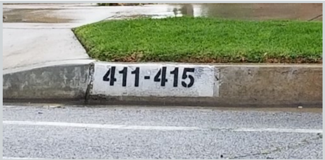
Subject 415 N Alhambra Ave Unit A