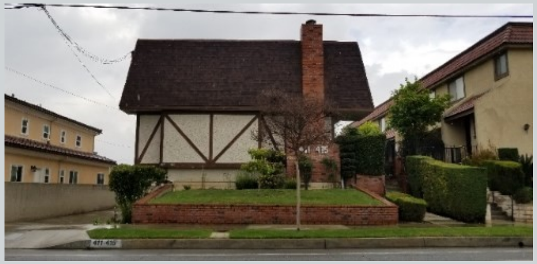
Subject 415 N Alhambra Ave Unit A