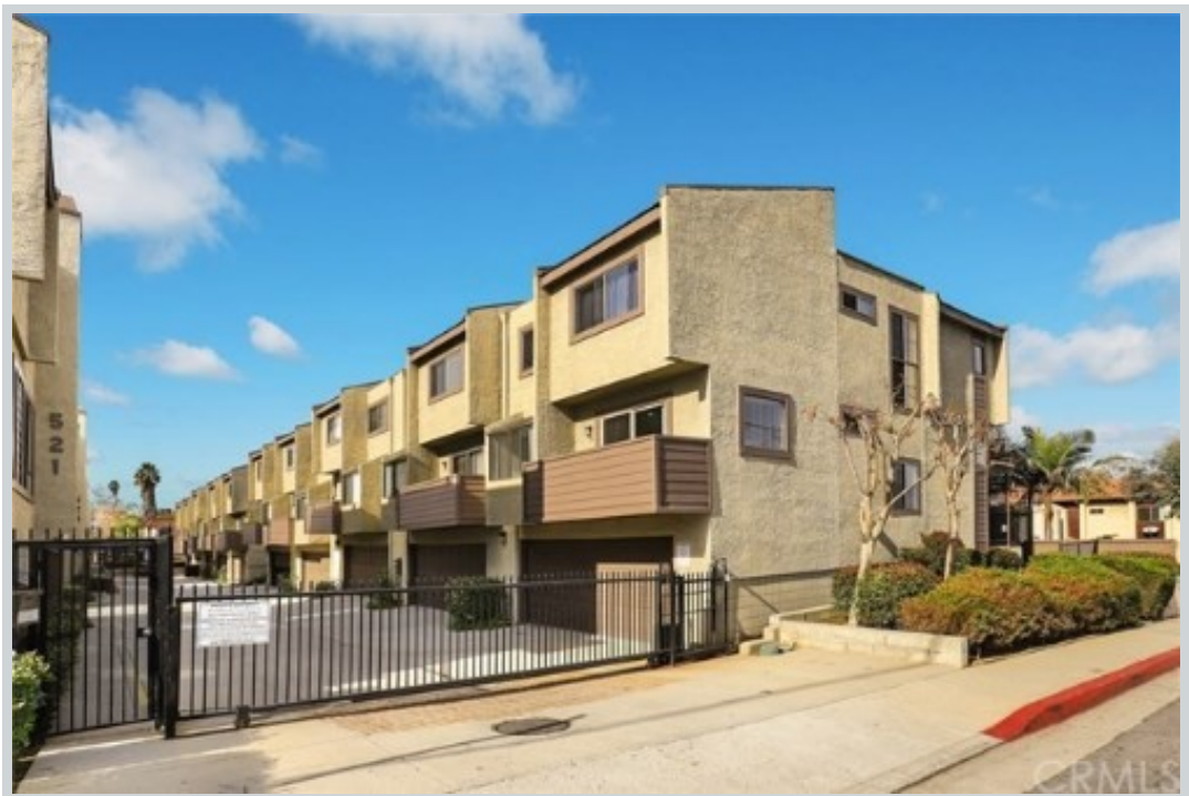
Listing Comp 2 517 S Orange Ave #A