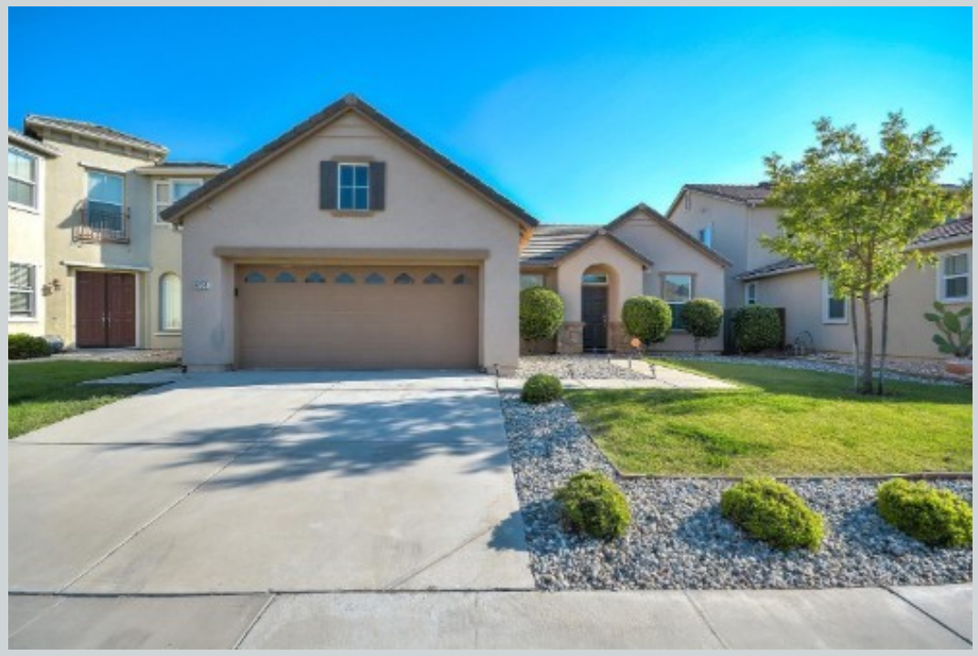
Listing Comp 2 9724 Everbloom