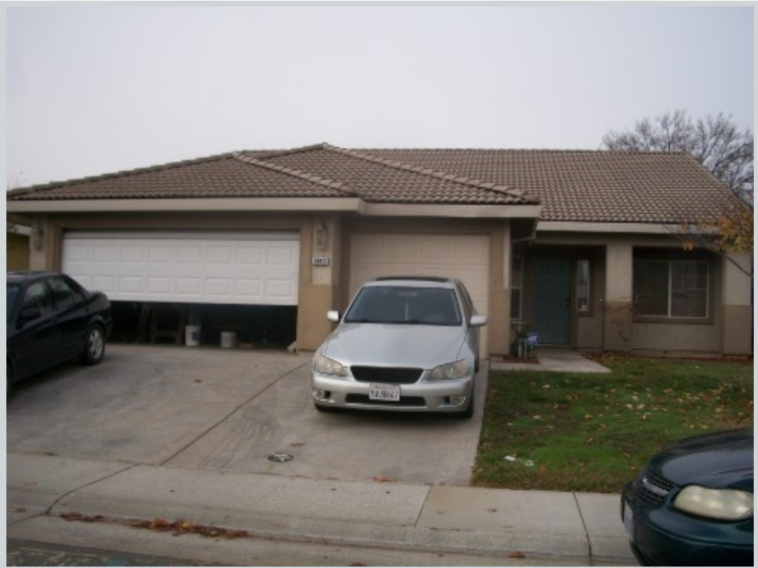
Subject 9943 Prairie Dunes Way