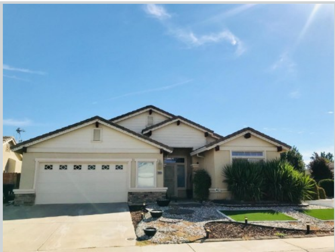
Listing Comp 1 7920 Quaker Ridge