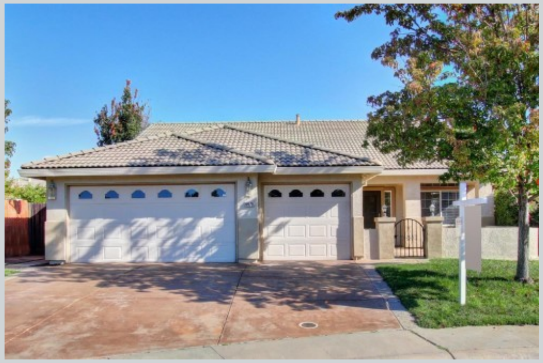
Sold Comp 1 9979 Aspen Meadows