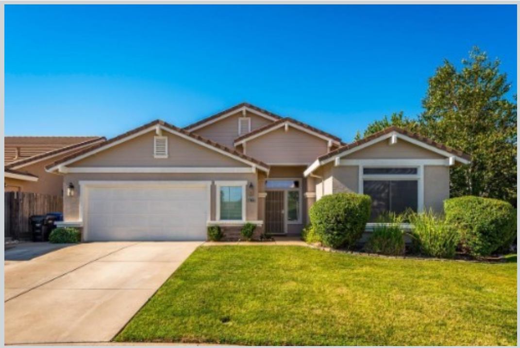
Sold Comp 3 7985 Quaker Ridge