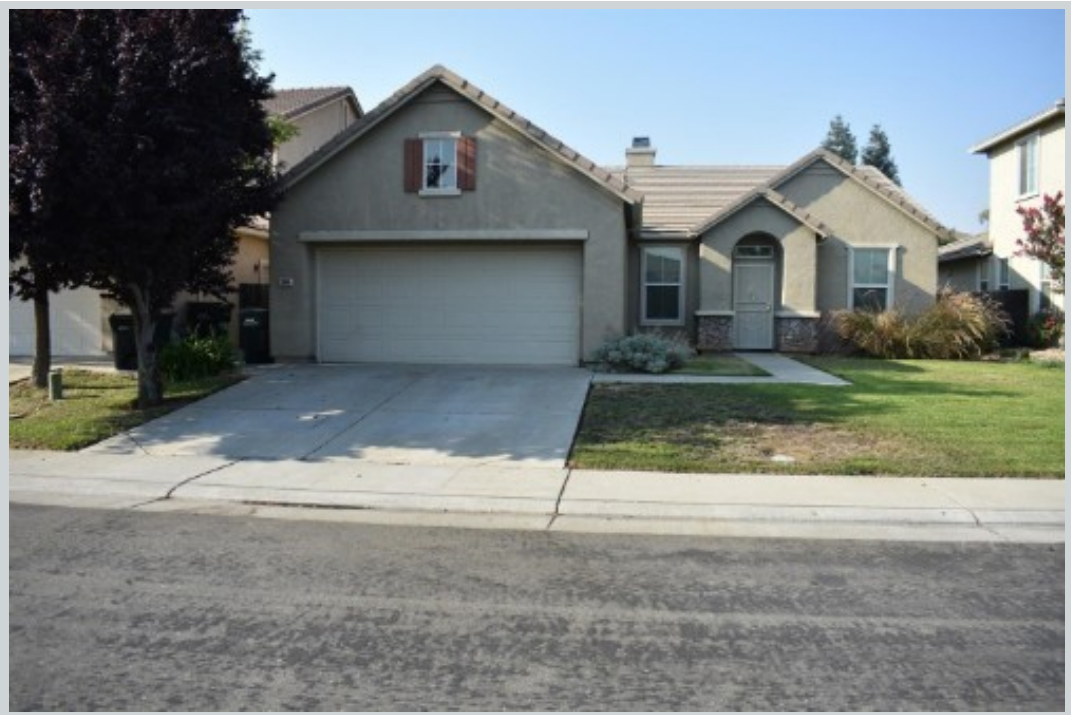
Listing Comp 3 9840 Fall Valley