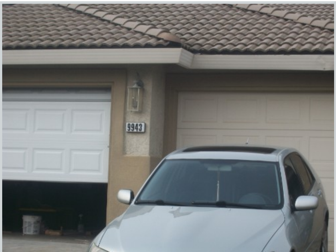
Subject 9943 Prairie Dunes Way