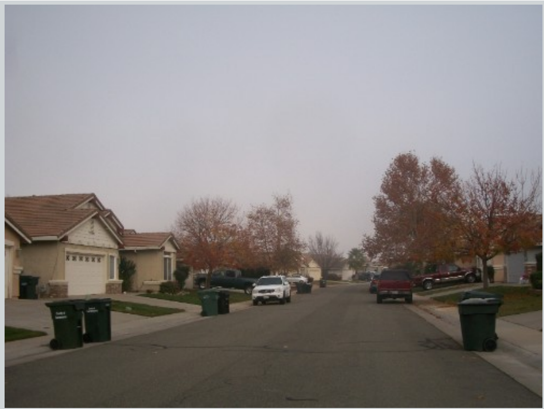
Subject 9943 Prairie Dunes Way