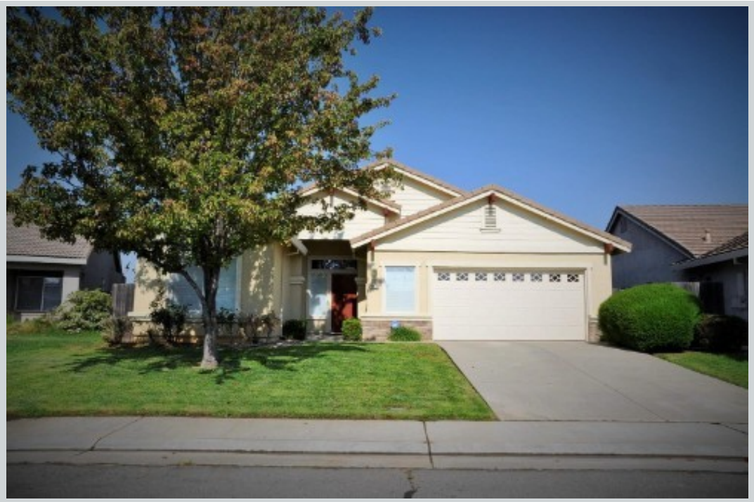
Sold Comp 2 9979 Prairie Dune