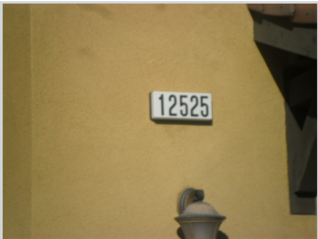
Subject 12525 Heritage Springs Dr