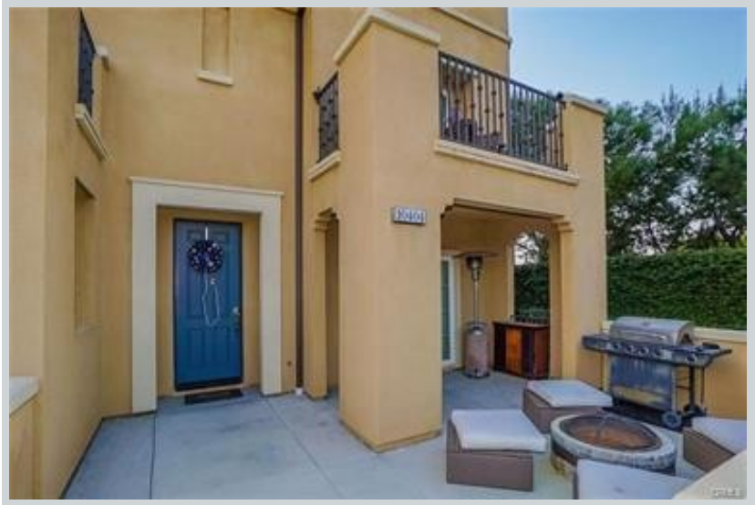
Sold Comp 2 10404 Orchid Way