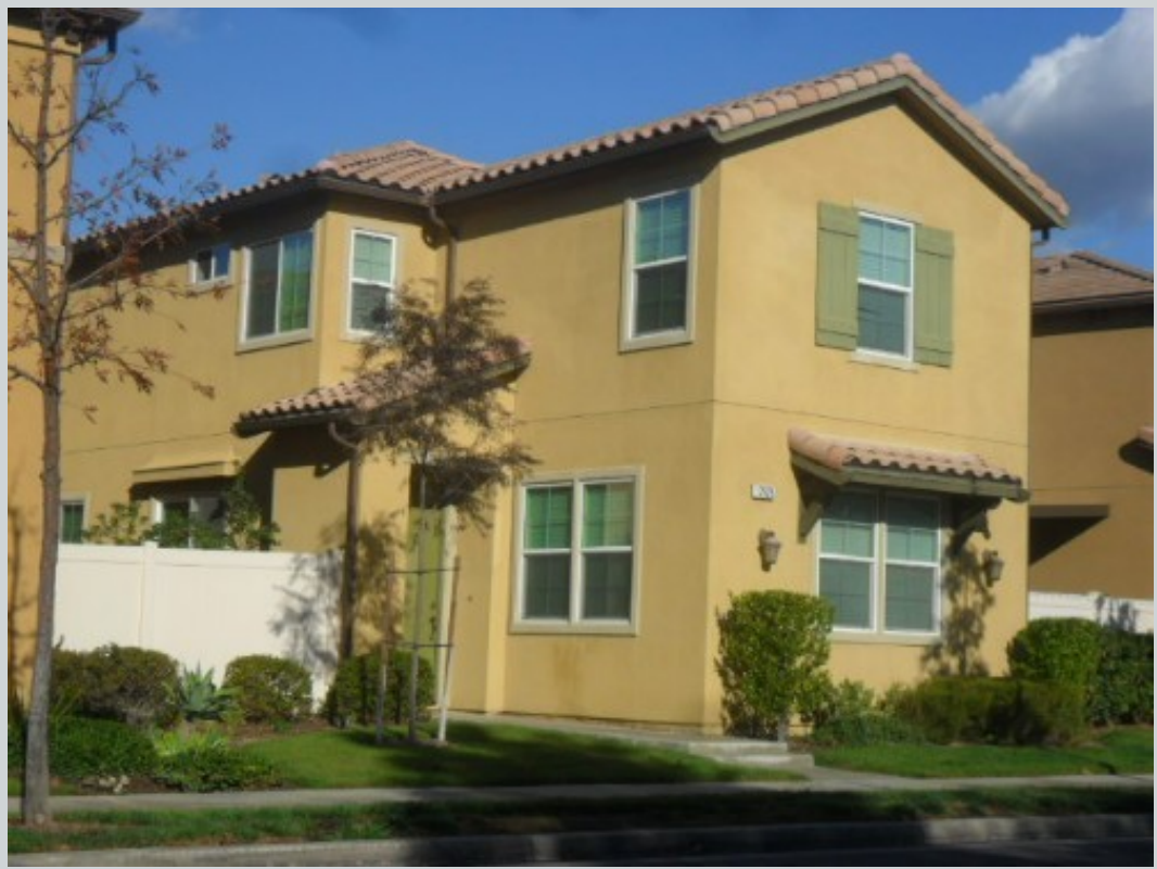
Subject 12525 Heritage Springs Dr