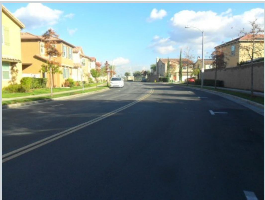
Subject 12525 Heritage Springs Dr