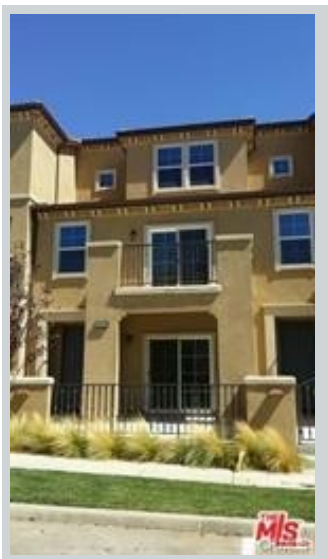
Listing Comp 2 10518 Willow Ln View Front