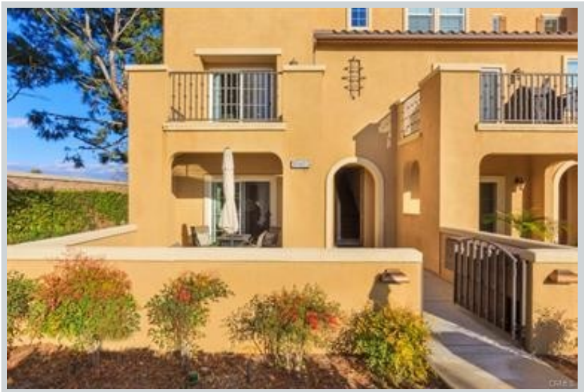
Sold Comp 3 10403 Satinwood Ct