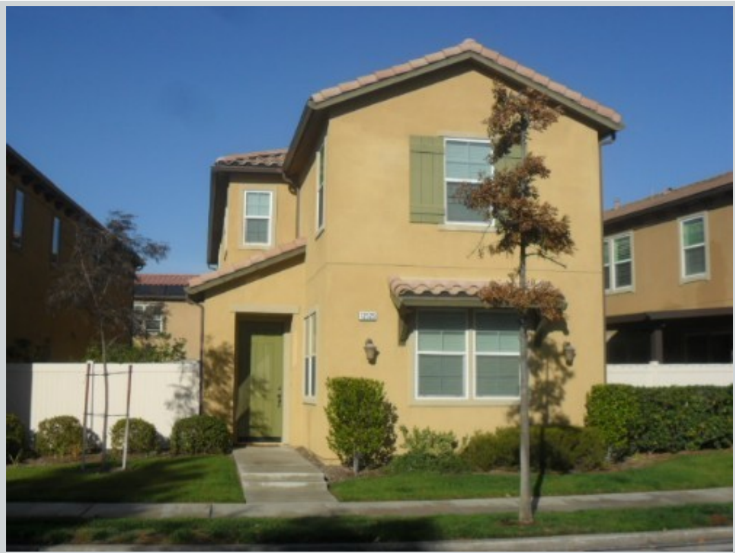
Subject 12525 Heritage Springs Dr