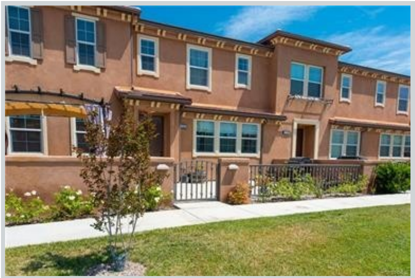
Sold Comp 1 12385 Heritage Springs Dr View Front