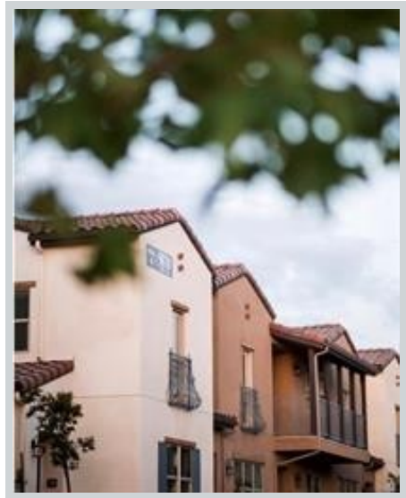
Listing Comp 3 9821 Alburdis Ave # 49 View Front