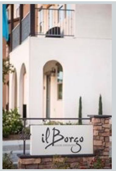
Listing Comp 1 9881 Albutis Ave # 43 View Front

Address 12525 Heritage Springs Drive, Santa Fe Springs, CA 90670 Suggested Repaired $550,000 Sale $550,000 Loan Number 36215 Suggested List $550,000