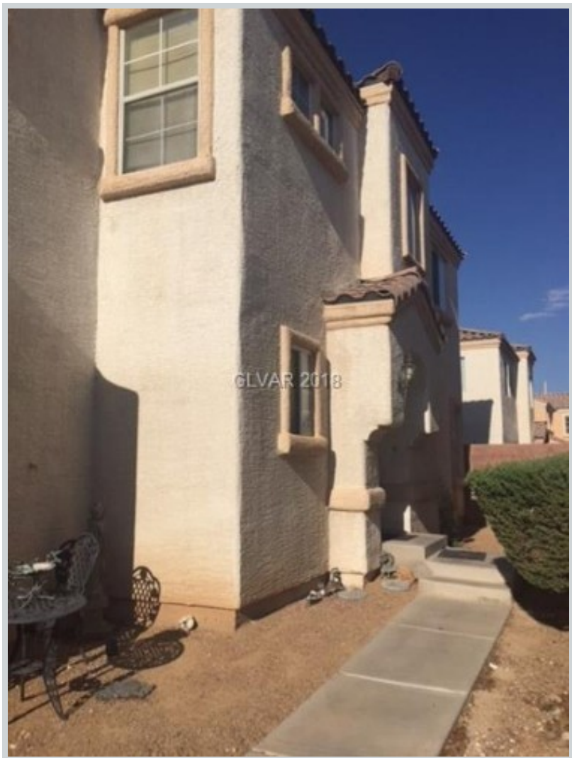
Sold Comp 2 4950 Attitude Ct

Address 2508 Lady Elizabeth Court, North Las Vegas, NEVADA 89031 Loan Number 36437 Suggested List $230,000 Suggested Repaired $230,000 Sale $225,000