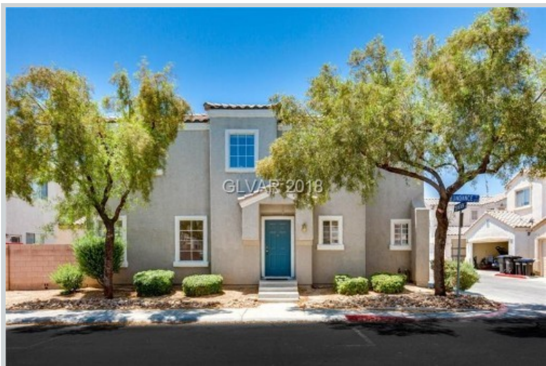
Sold Comp 3 2703 Commitment Ct