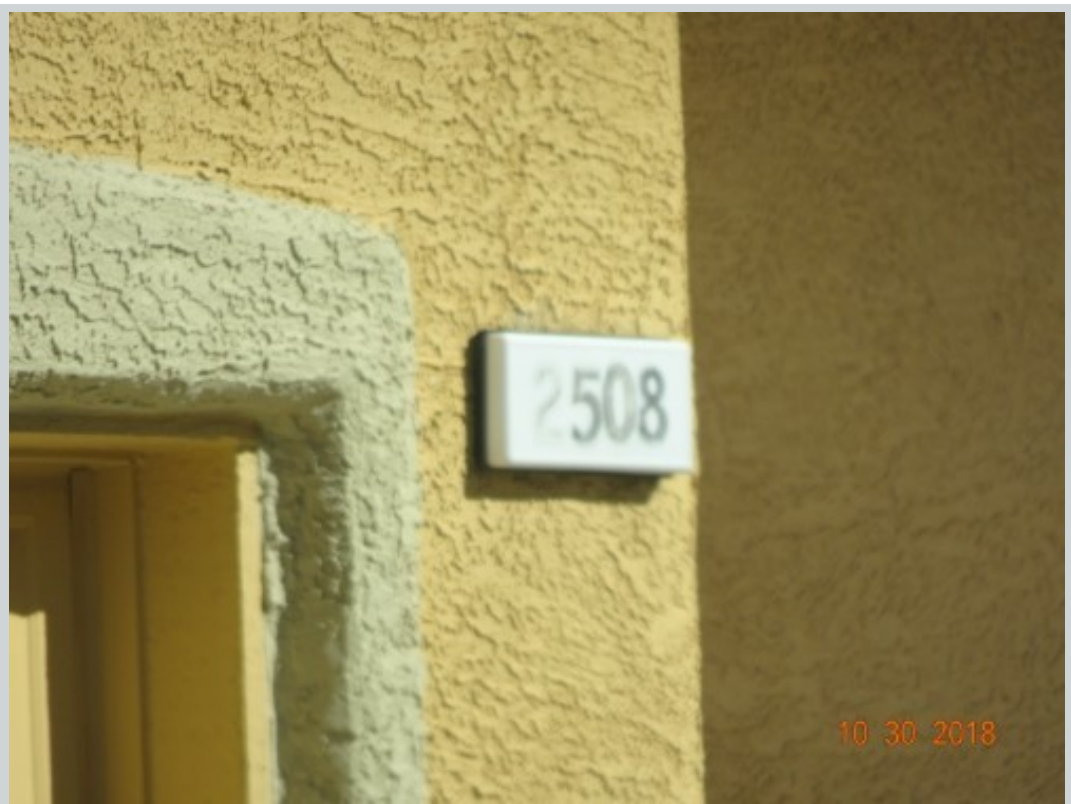
Subject 2508 Lady Elizabeth Ct