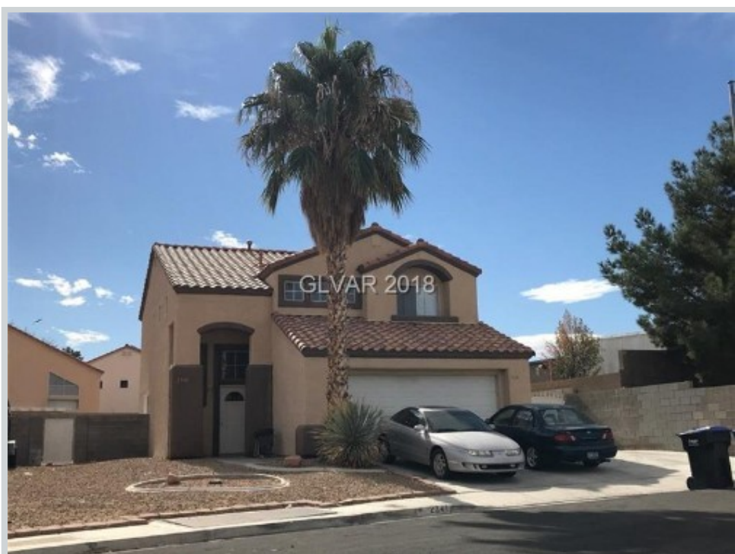
Listing Comp 2 2341 Whitney Peak Wy View Front