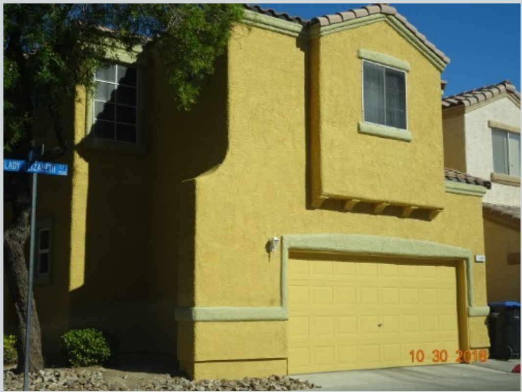
Subject 2508 Lady Elizabeth Ct