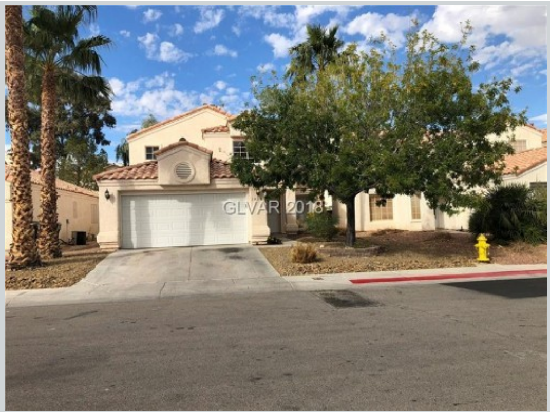
Listing Comp 3 1930 La Villa Dr