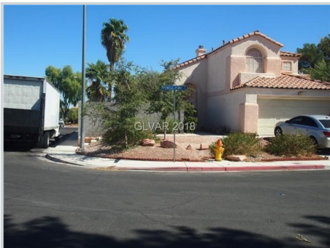
Listing Comp 1 4540 Powell Point Wy View Front

Address 2508 Lady Elizabeth Court, North Las Vegas, NEVADA 89031 Loan Number 36437 Suggested List $230,000 Suggested Repaired $230,000 Sale $225,000