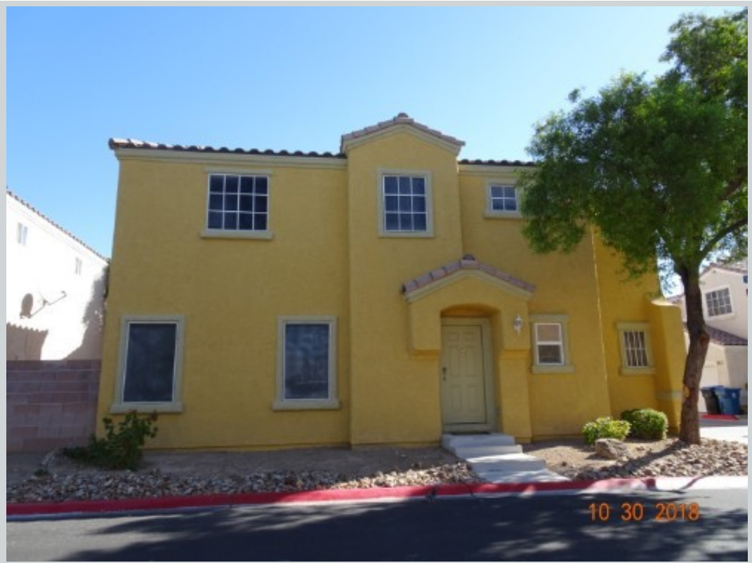
Subject 2508 Lady Elizabeth Ct