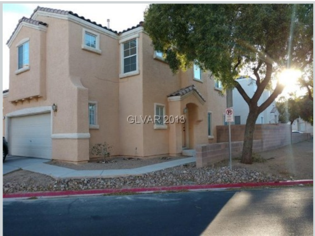
Sold Comp 1 4837 Integrity St