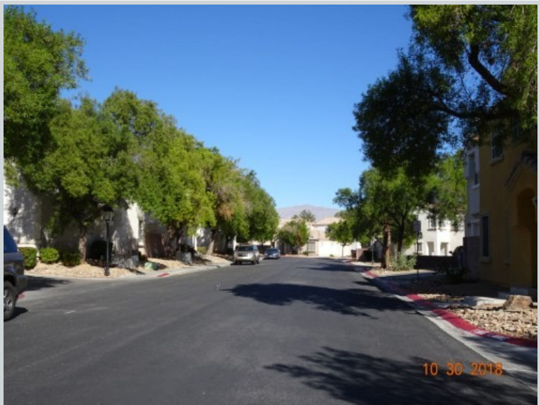
Subject 2508 Lady Elizabeth Ct