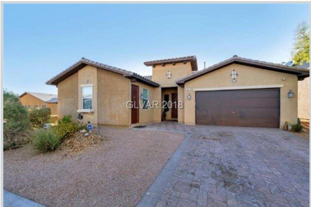
Listing Comp 3 2611 Early Sky Ct View Front