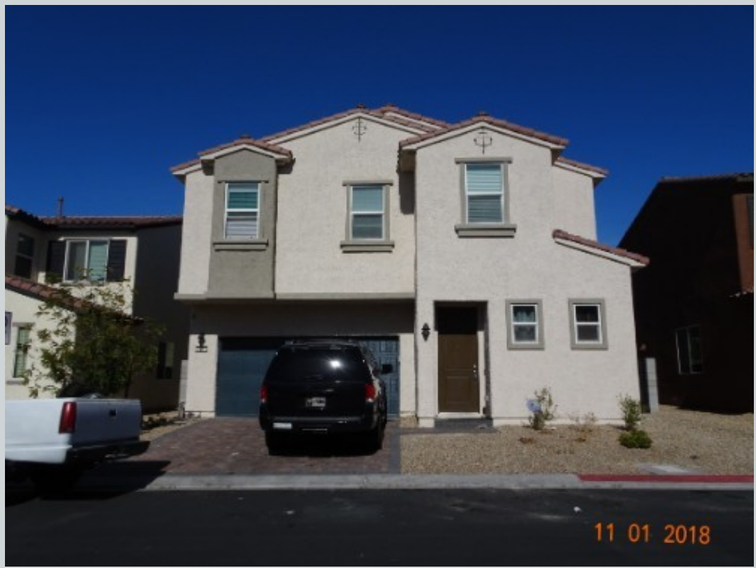
Subject 6964 Lilac Clouds Ct