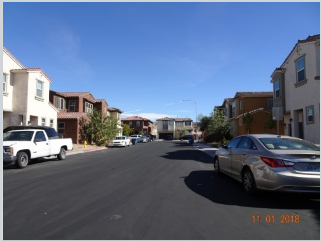
Subject 6964 Lilac Clouds Ct