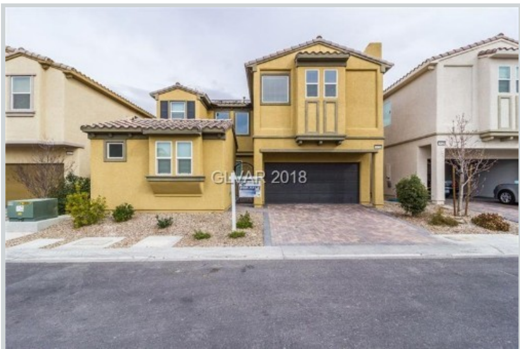
Sold Comp 2 6828 Aqua Cove Av