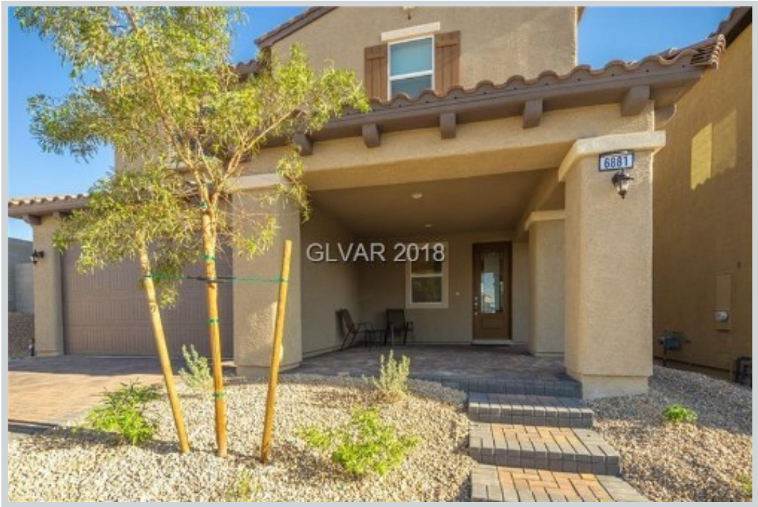
Sold Comp 3 6881 Wispy Sky Ct