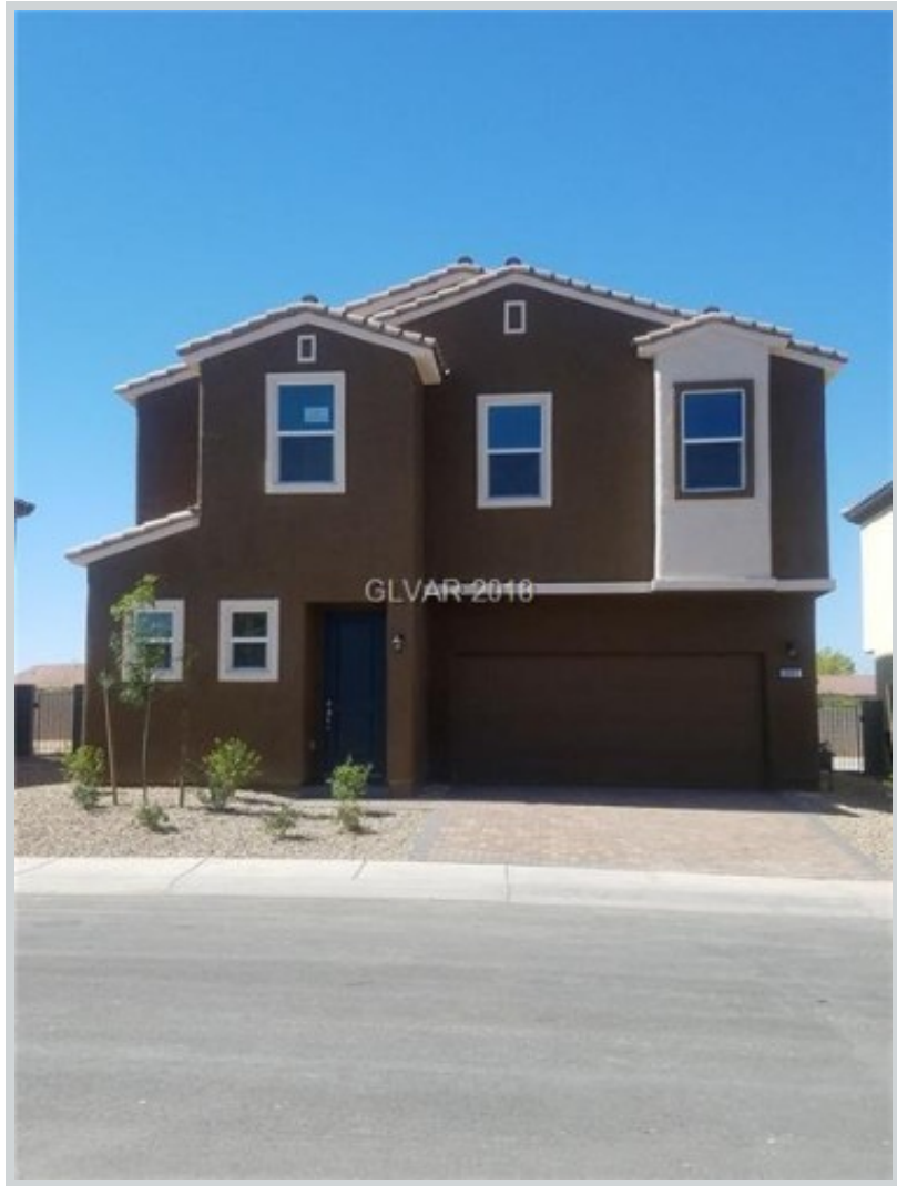
Listing Comp 2 2661 Rainbow River Dr View Front