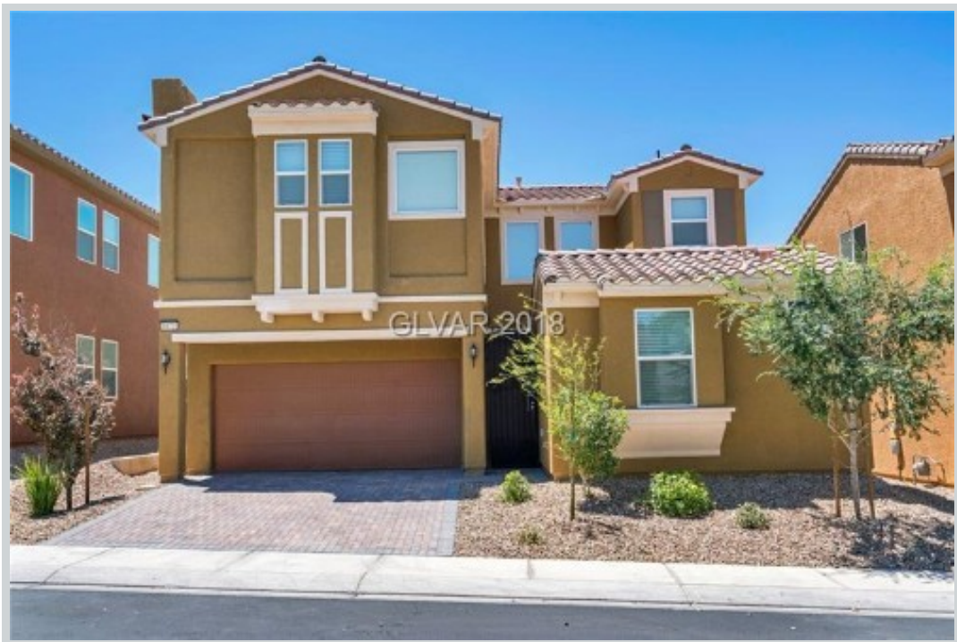
Sold Comp 1 6871 Compass Cove Av

Address 6964 Lilac Clouds Court, Las Vegas, NV 89142 Loan Number 36451 Suggested List $305,000 Suggested Repaired $305,000 Sale $295,000