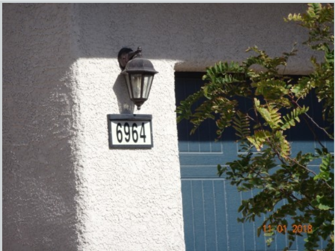
Subject 6964 Lilac Clouds Ct