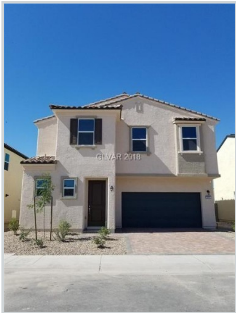
Listing Comp 1 2693 Rainbow River Dr