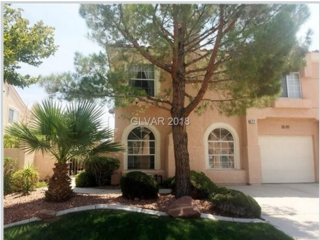
Sold Comp 2 677 Corte Madera Ave View Front