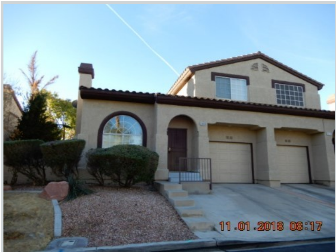
Subject 2609 Trellis Ave