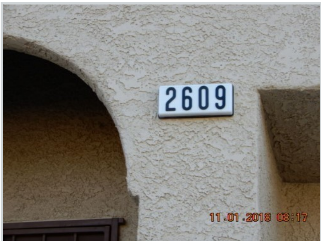
Subject 2609 Trellis Ave