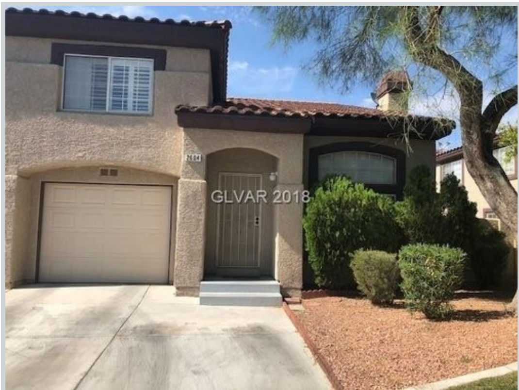
Sold Comp 1 2604 Orchard Meadows Ave View Front

Address 2609 Trellis Avenue, Henderson, NV 89074 Loan Number 36453 Suggested List $219,000 Suggested Repaired $219,000 Sale $208,000