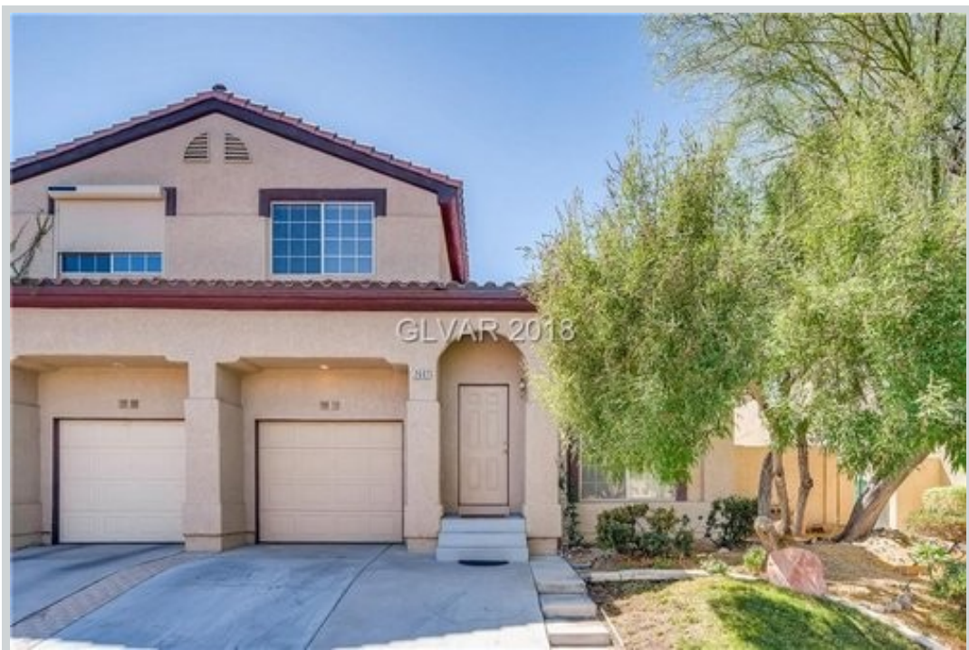
Listing Comp 1 2607 Autumn Blaze Ave