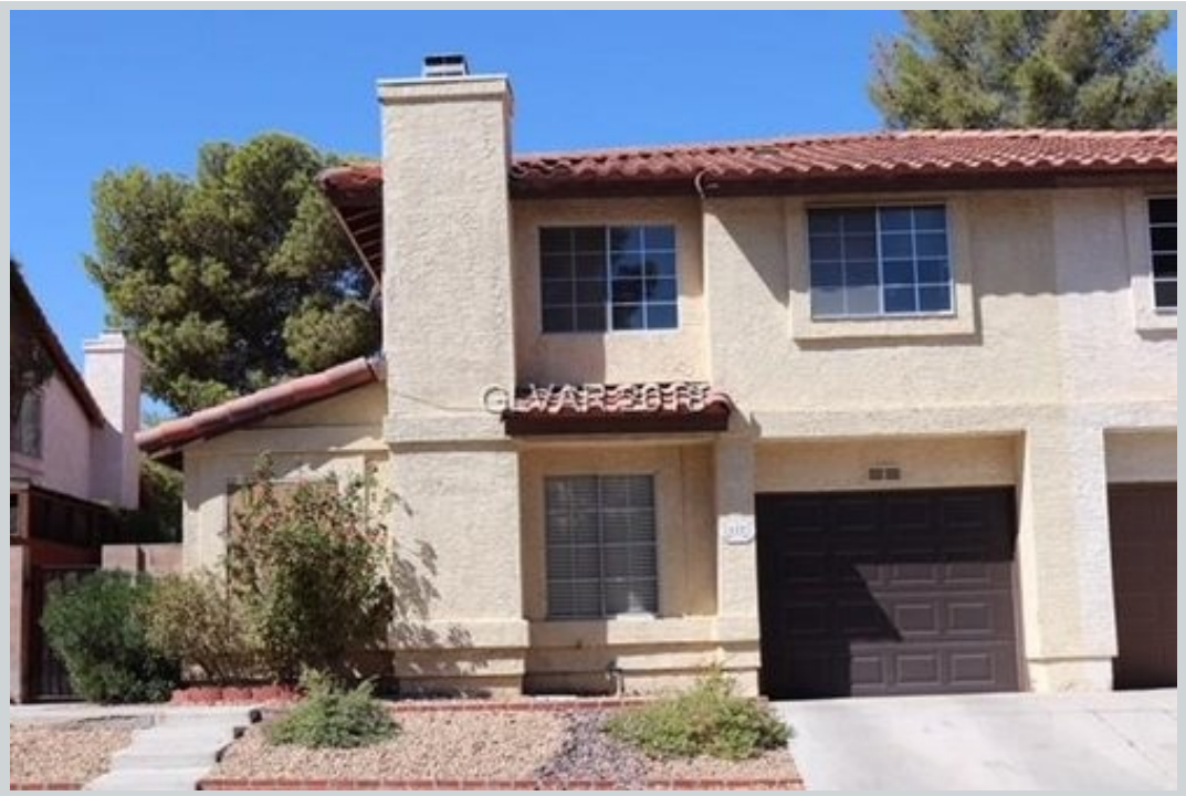
Listing Comp 2 117 Blueberry Ln