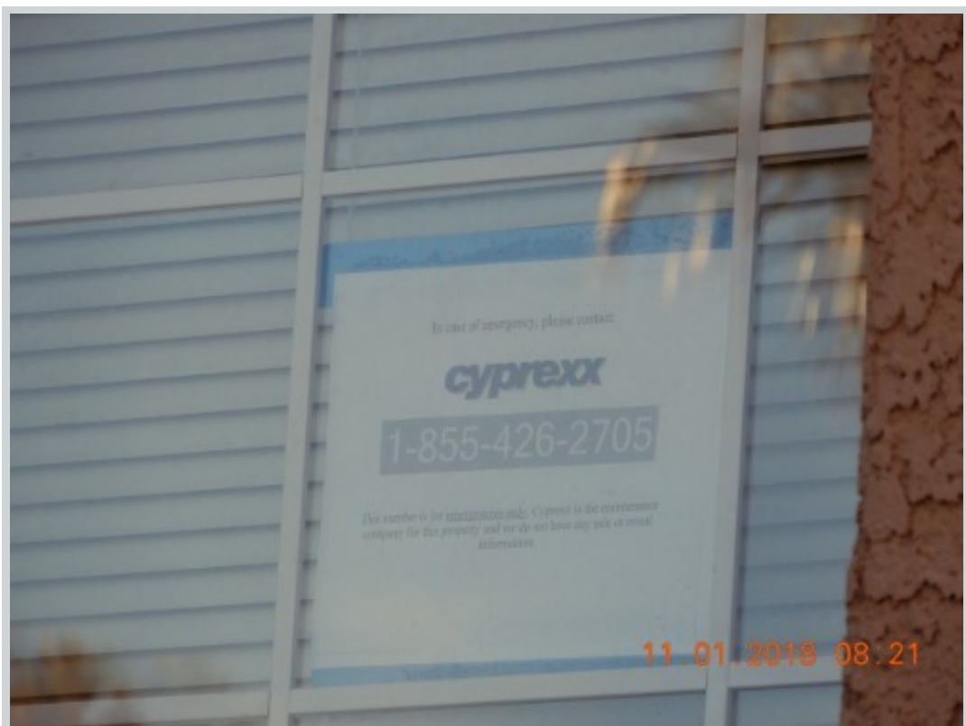
Subject 2609 Trellis Ave

Address 2609 Trellis Avenue, Henderson, NV 89074 Loan Number 36453 Suggested List $219,000 Suggested Repaired $219,000 Sale $208,000