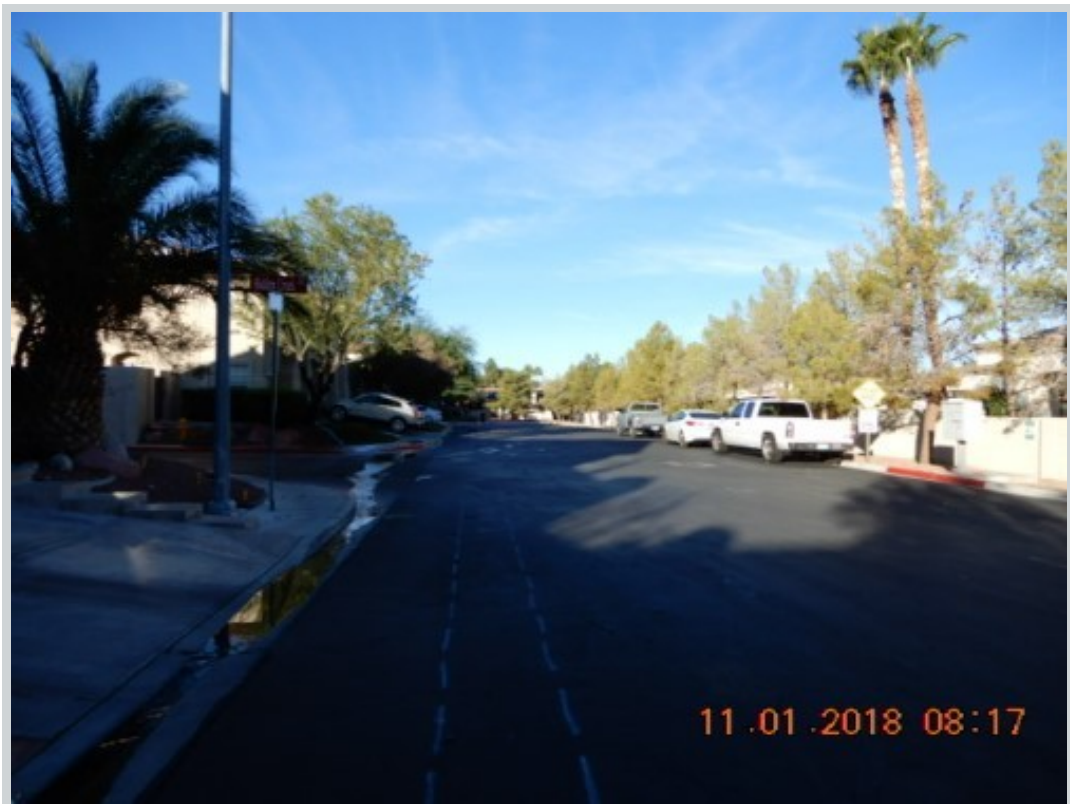
Subject 2609 Trellis Ave