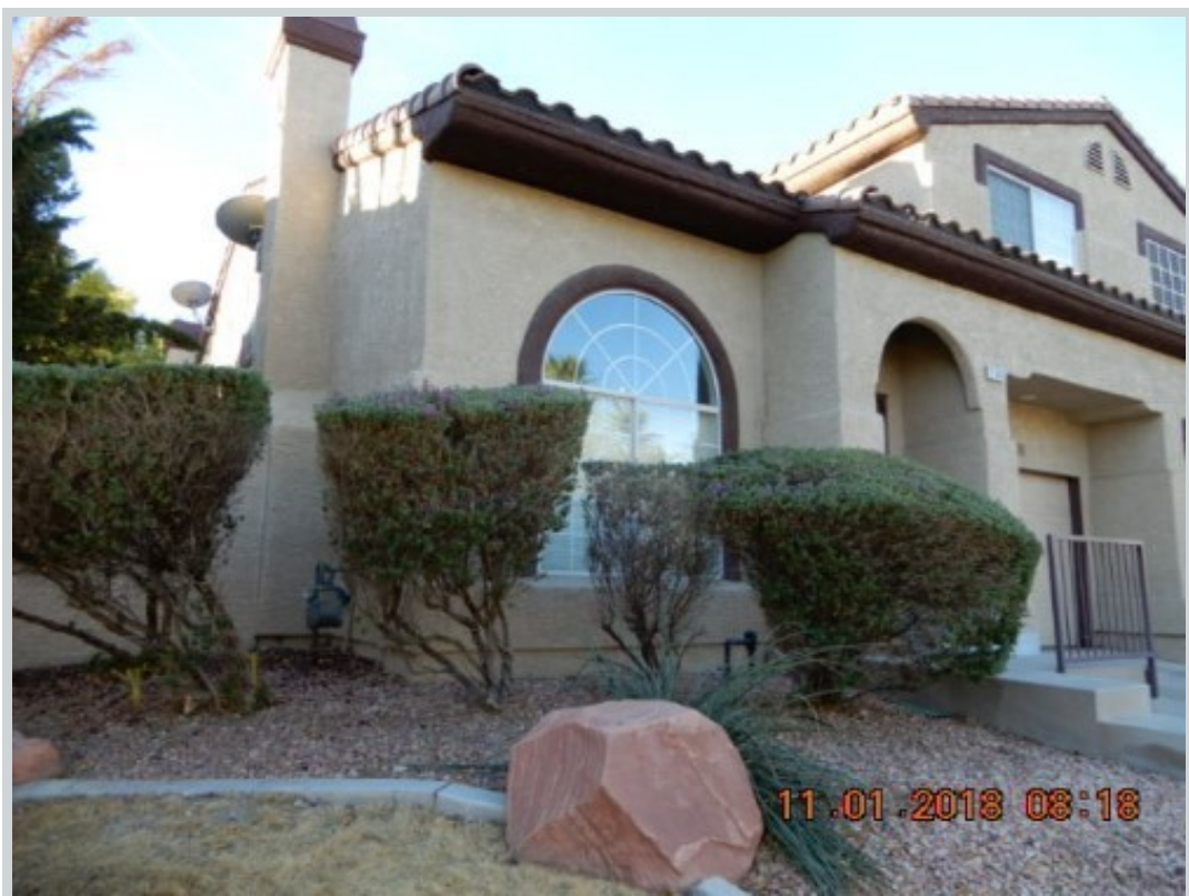
Subject 2609 Trellis Ave

Address 2609 Trellis Avenue, Henderson, NV 89074 Loan Number 36453 Suggested List $219,000 Suggested Repaired $219,000 Sale $208,000