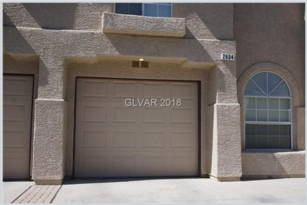
Sold Comp 3 2604 Pebblegold Ave