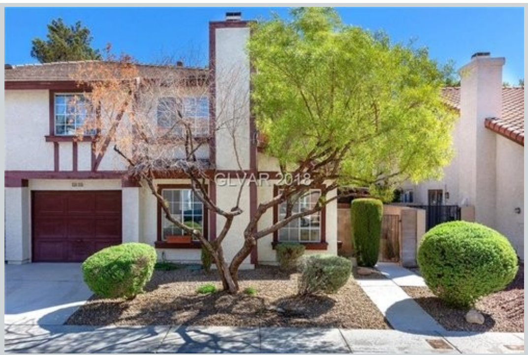
Listing Comp 3 108 Blueberry Ln