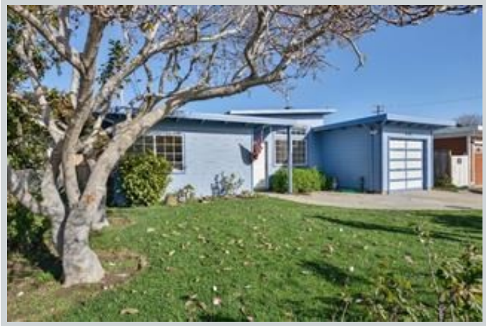
Listing Comp 2 641 Fallon Avenue View Front