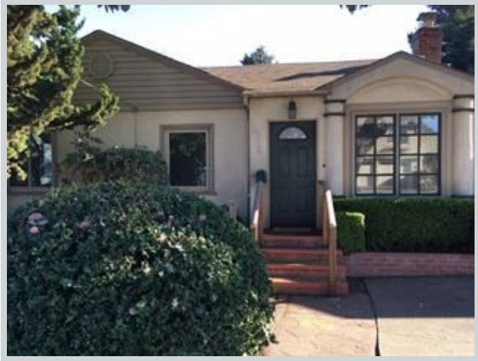
Listing Comp 1 512 State Street View Front