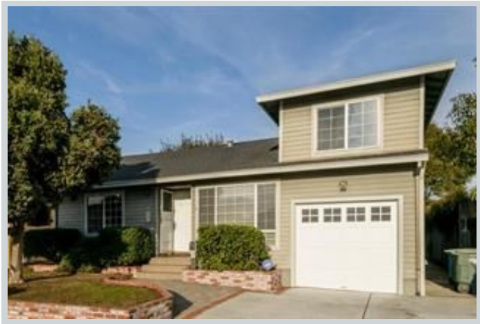
Listing Comp 3 400 Cavanaugh Street View Front