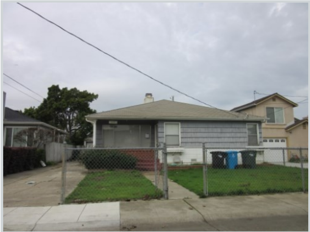
Subject 1425 Bradley Ct