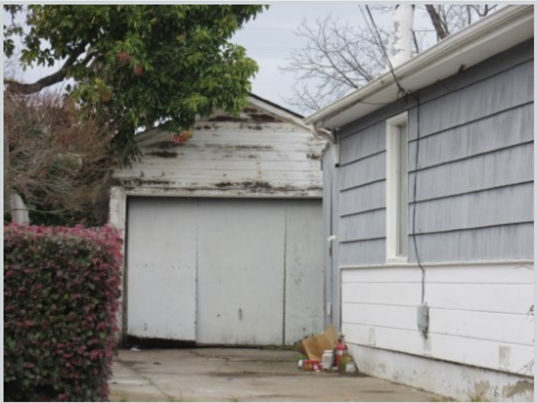
Subject 1425 Bradley Ct