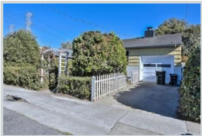
Sold Comp 1 1720 York Ave View Front