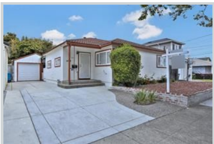
Sold Comp 2 1409 Bradley Ct View Front