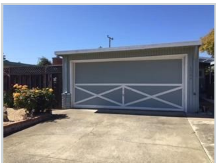
Sold Comp 3 1764 Dewey Street, View Front