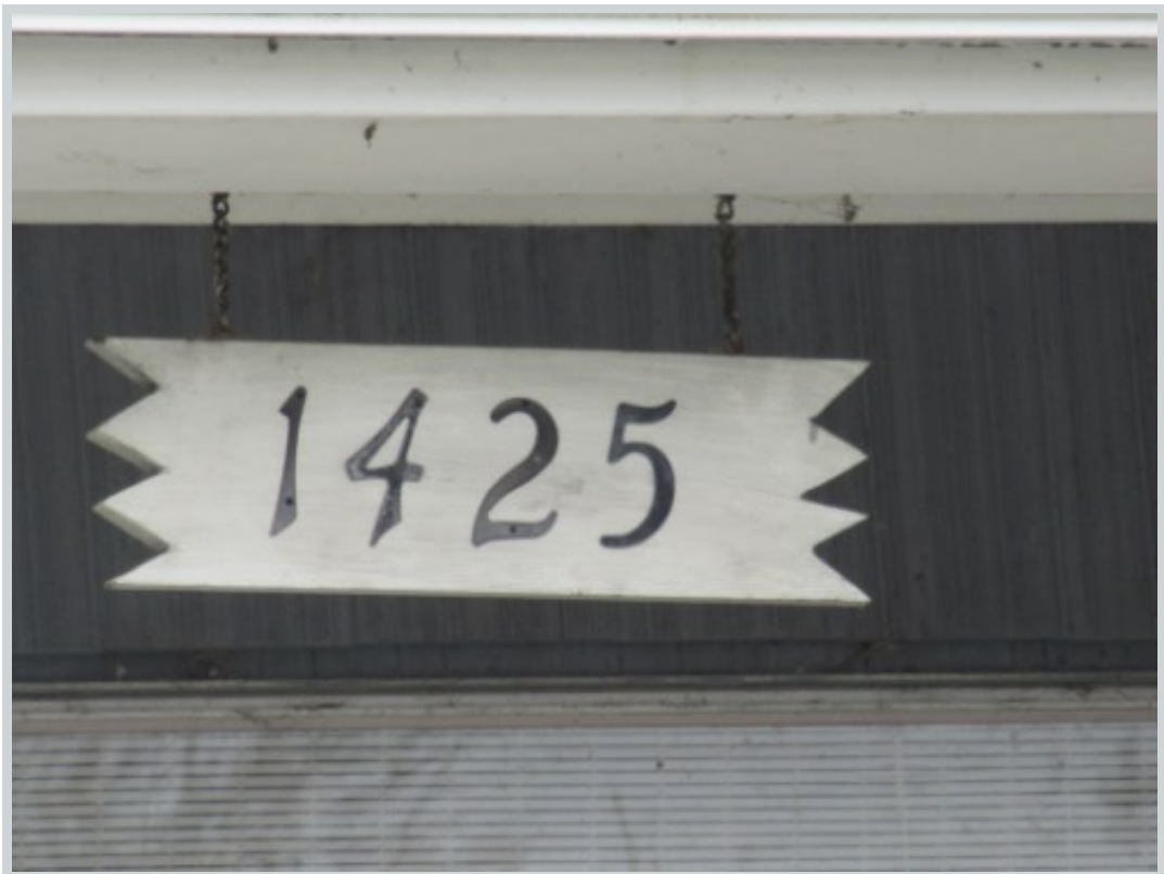
Subject 1425 Bradley Ct