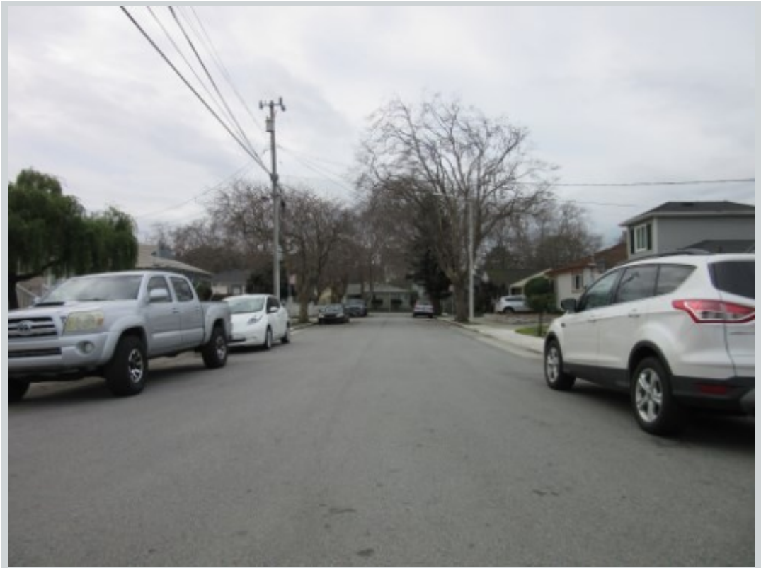
Subject 1425 Bradley Ct