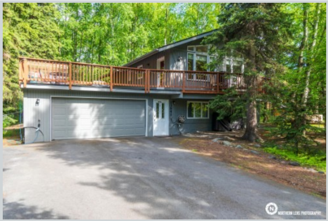
Sold Comp 3 13941 Venus Way