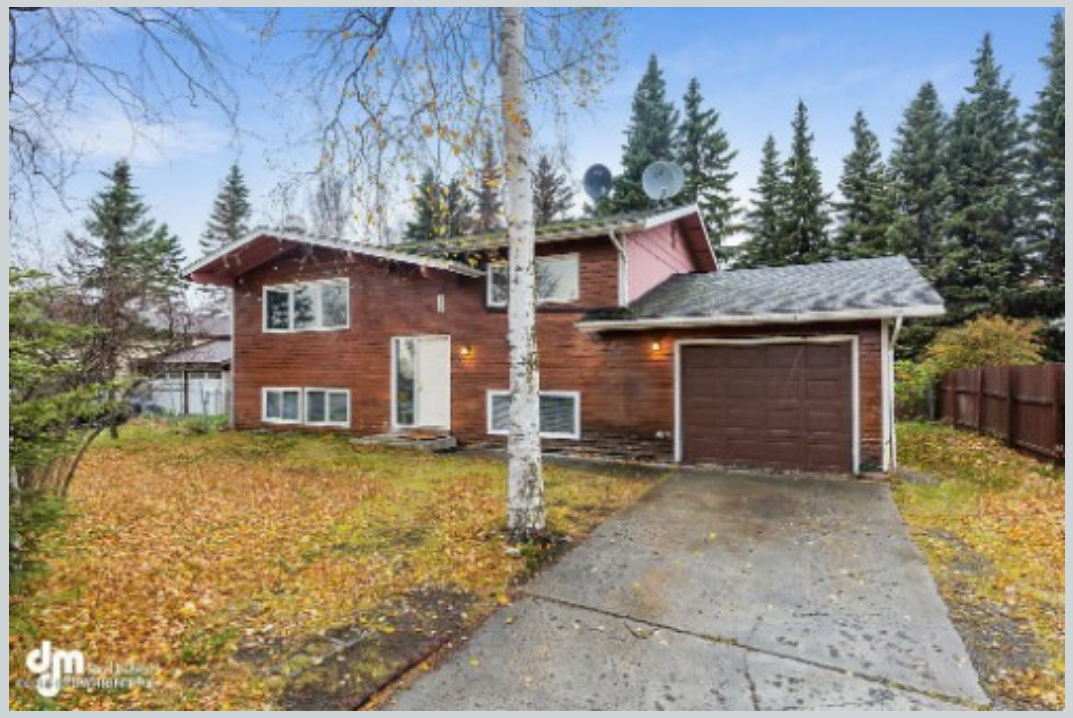
Listing Comp 2 1111 Oceanview Drive