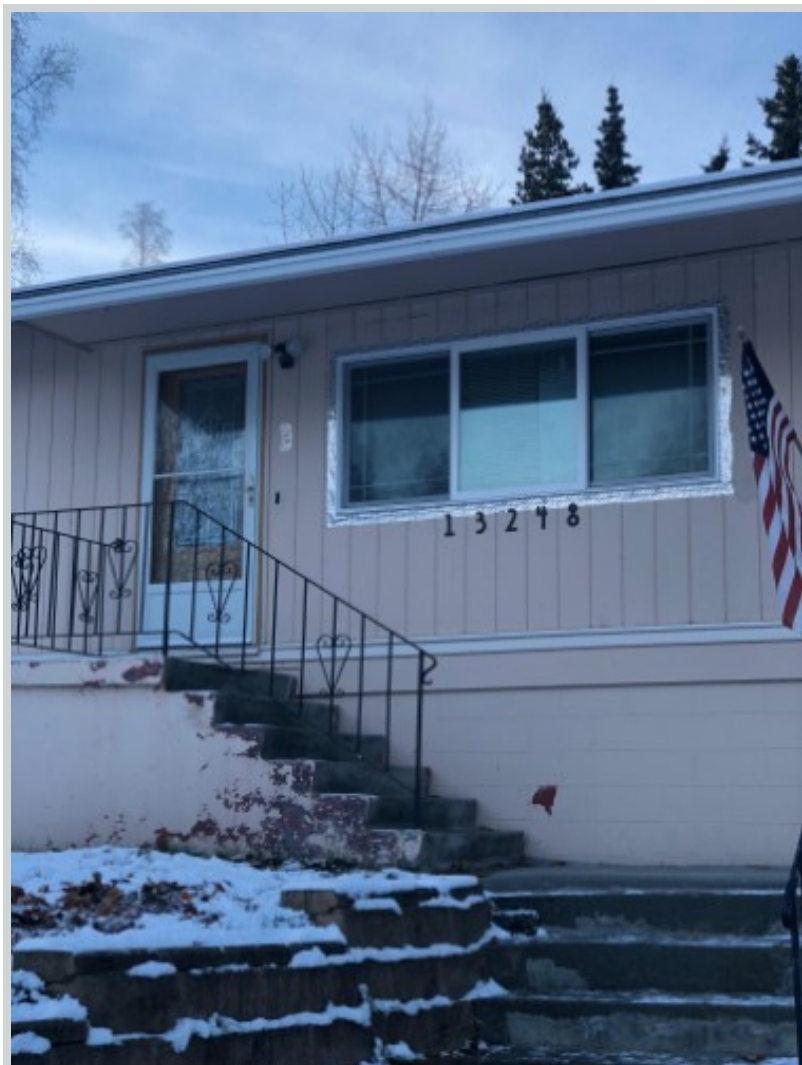
Subject 13248 Stephenson St