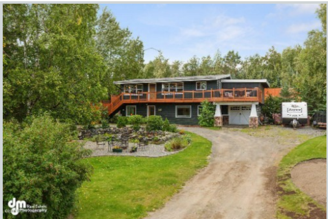
Listing Comp 1 2181 Hannah S Court