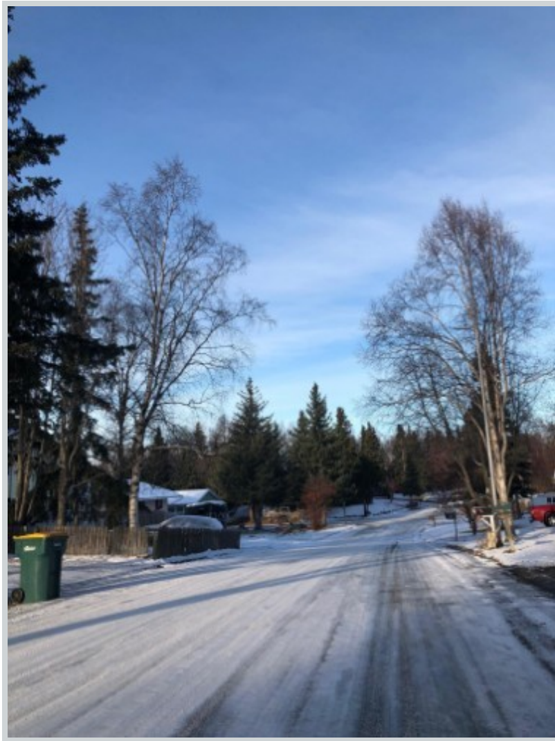
Subject 13248 Stephenson St