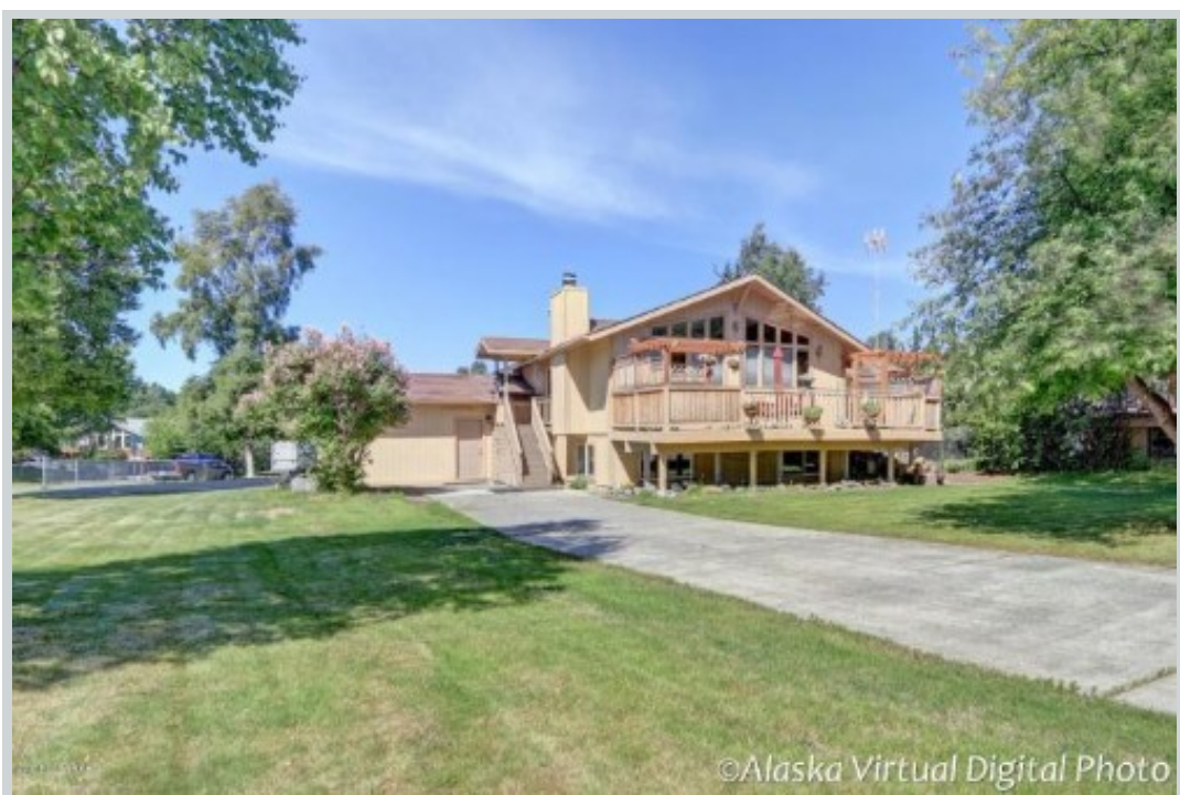
Sold Comp 2 13211 Elmhurst Drive