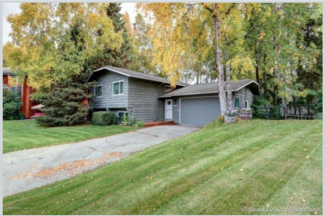
Listing Comp 3 12641 Nautilus Court