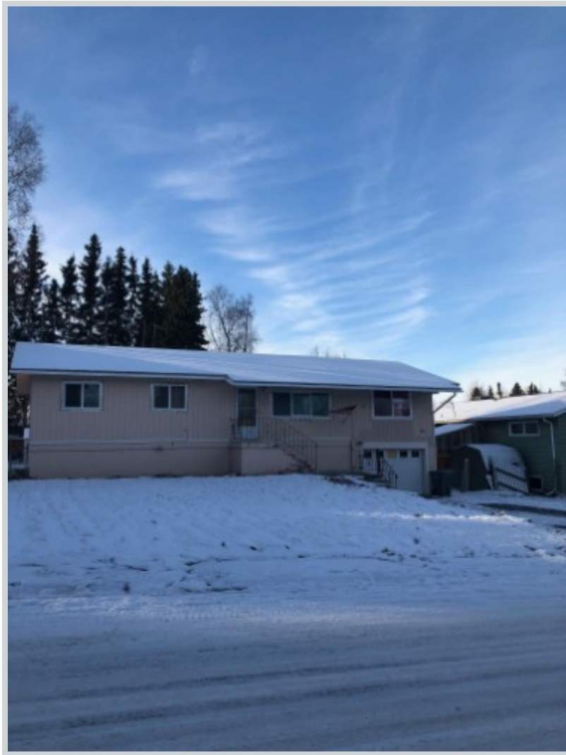
Subject 13248 Stephenson St