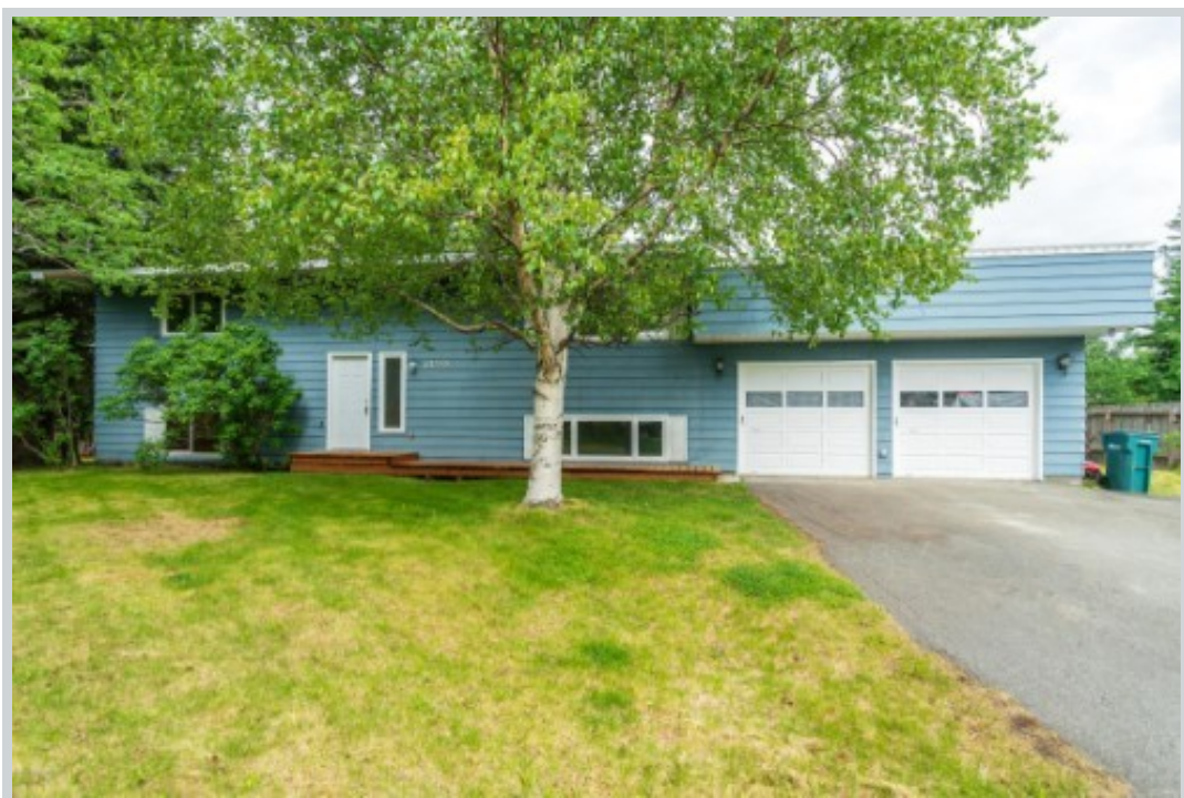
Sold Comp 1 13100 Scottie Court

Address 13248 Stephenson Street, Anchorage, AK 99515 Suggested Repaired $322,000 Sale $322,000 Loan Number 36466 Suggested List $322,000