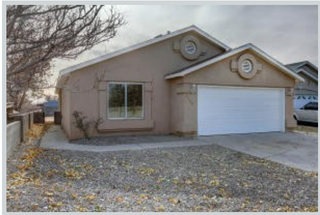
Sold Comp 3 2420 Native Flower Pl Sw View Front