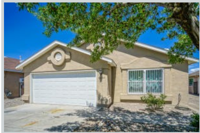
Sold Comp 1 8605 Silverado Ave Sw View Front