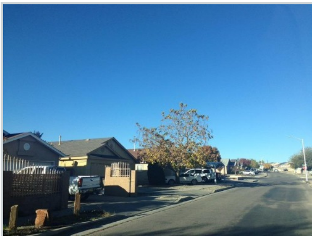
Subject 1912 Summerfield Pl Sw