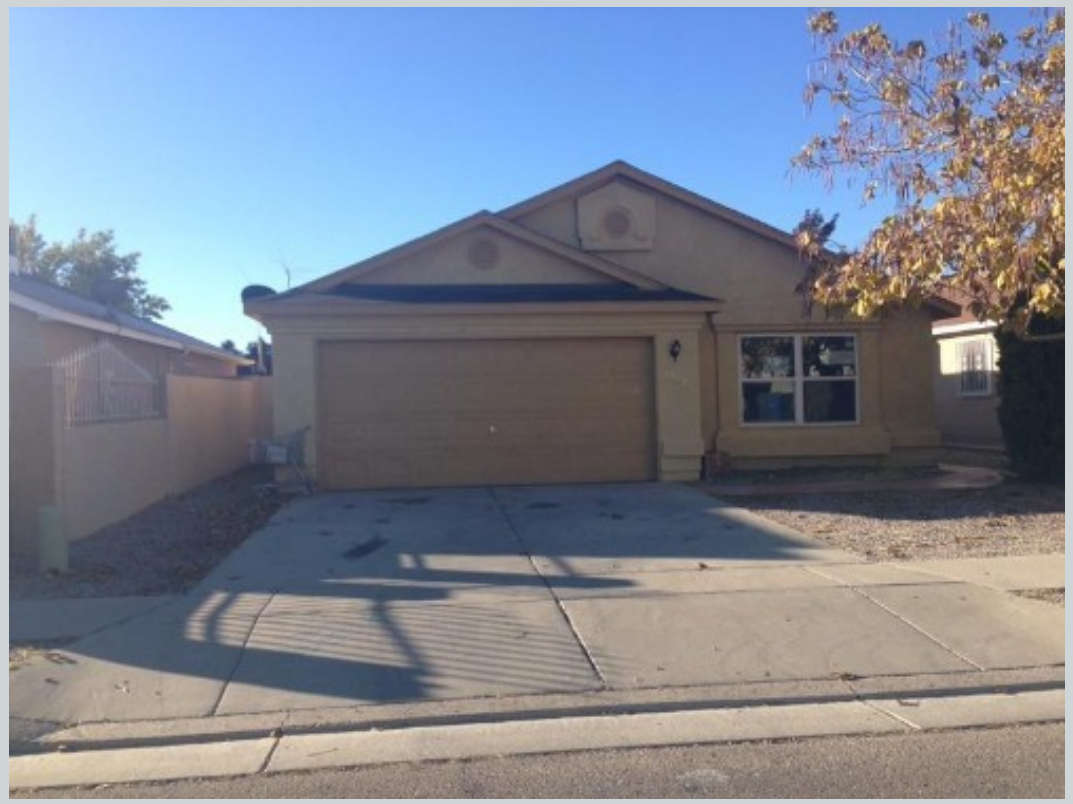
Subject 1912 Summerfield Pl Sw