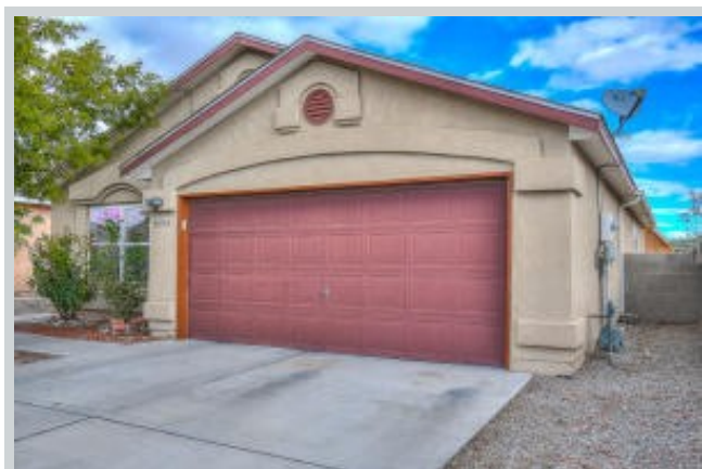
Listing Comp 1 8415 Rushing Brook Ave Sw