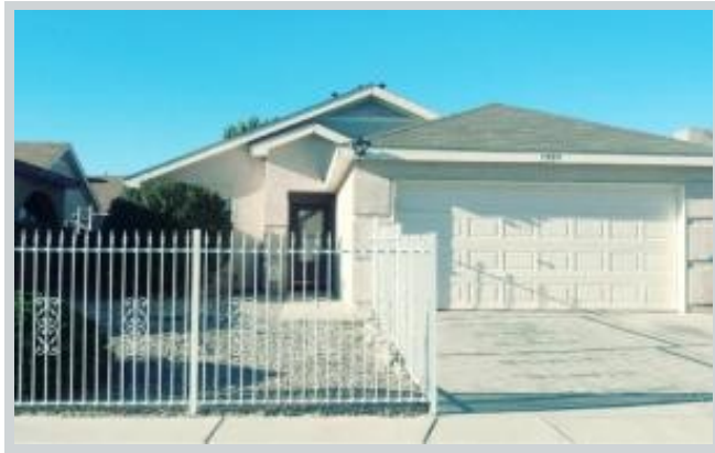
Listing Comp 3 7909 Blue Avena Ave Sw View Front