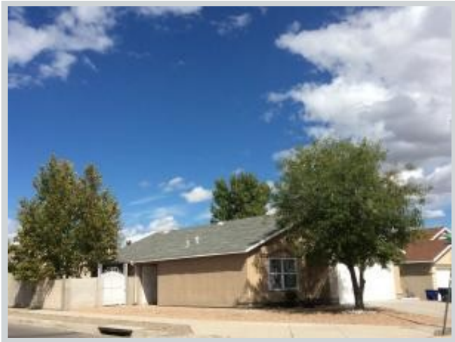
Listing Comp 2 8423 Fence Post Rd Sw View Front