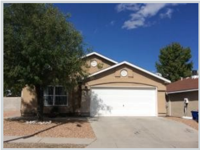
Listing Comp 2 8423 Fence Post Rd Sw View Front