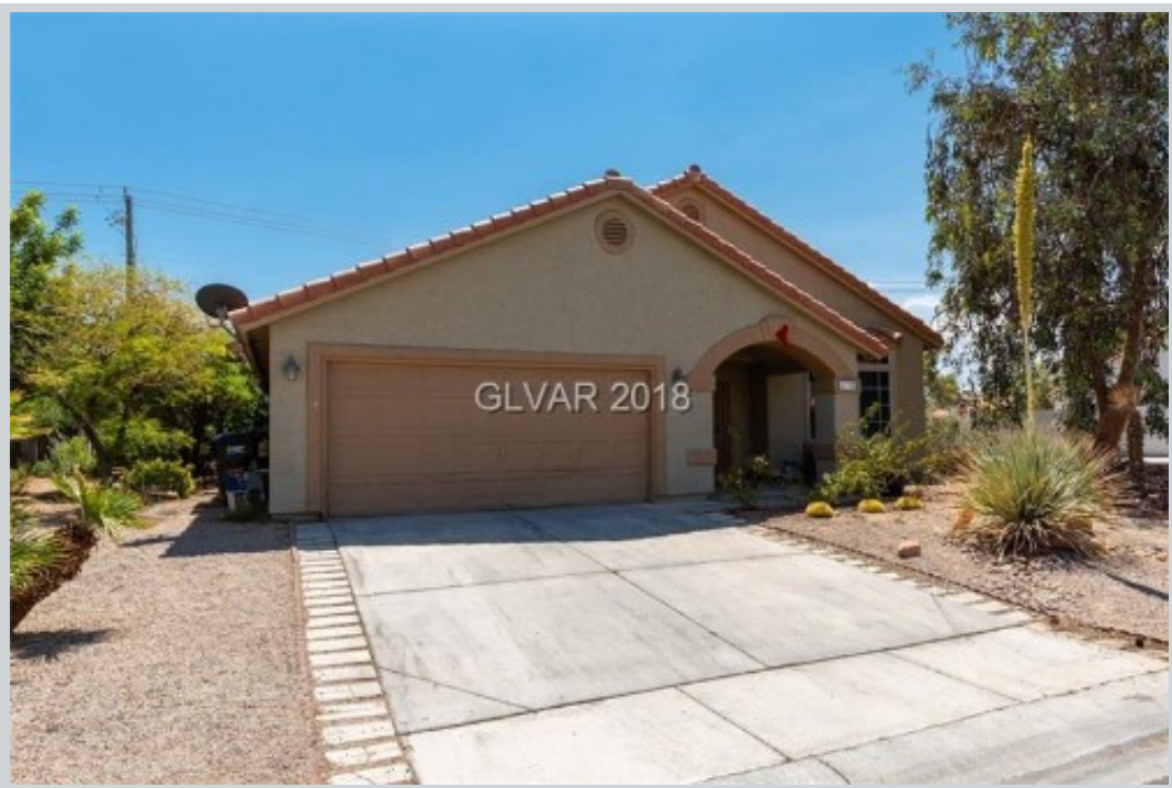
Listing Comp 2 4335 Twin Peaks Dr