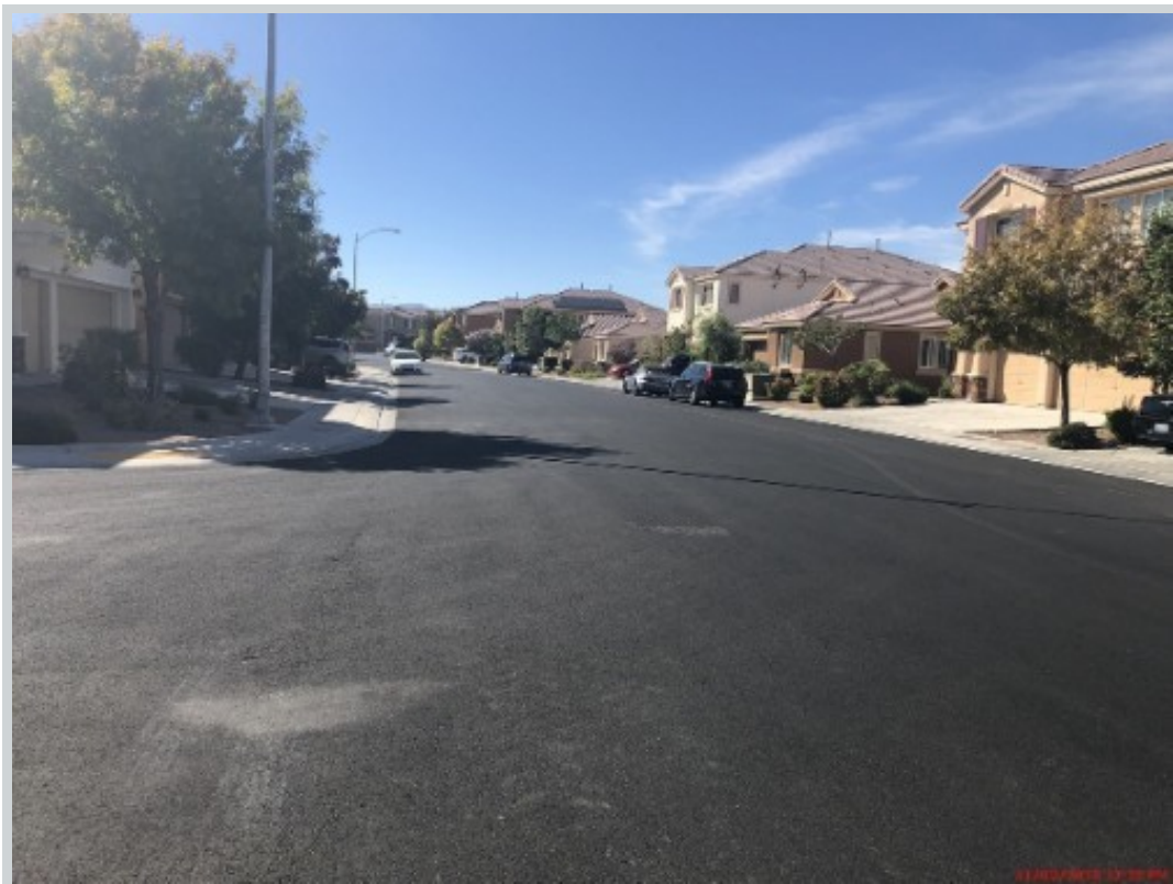
Subject 3906 Burma Rd Comment "Left view"

Address 3906 Burma Road, North Las Vegas, NV 89032 Loan Number 36469 Suggested List $285,000 Suggested Repaired $285,000 Sale $285,000