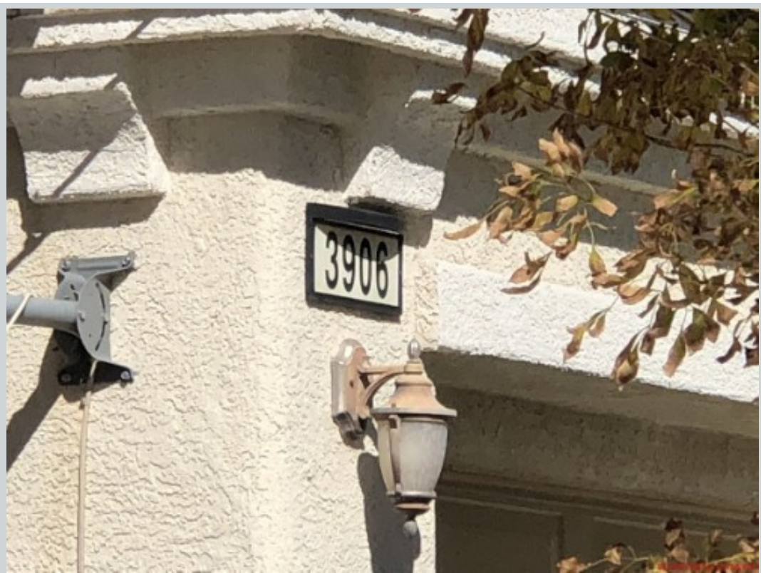
Subject 3906 Burma Rd