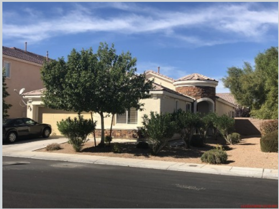
Subject 3906 Burma Rd

Address 3906 Burma Road, North Las Vegas, NV 89032 Loan Number 36469 Suggested List $285,000 Suggested Repaired $285,000 Sale $285,000