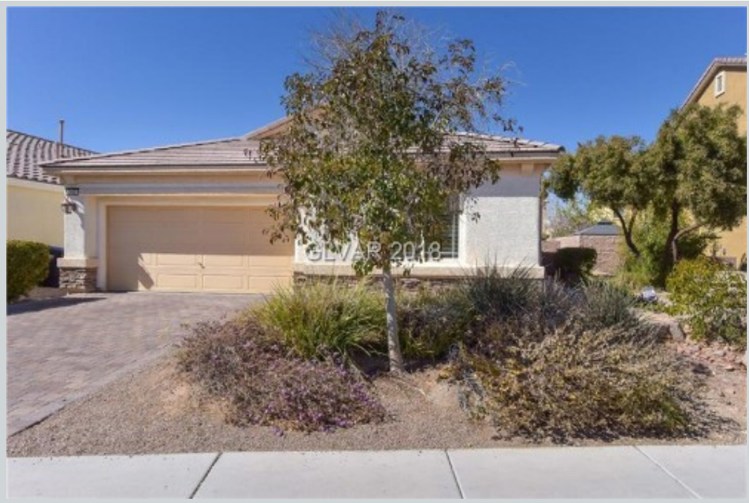
Sold Comp 1 3882 Burma Rd