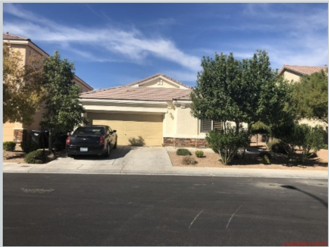
Subject 3906 Burma Rd