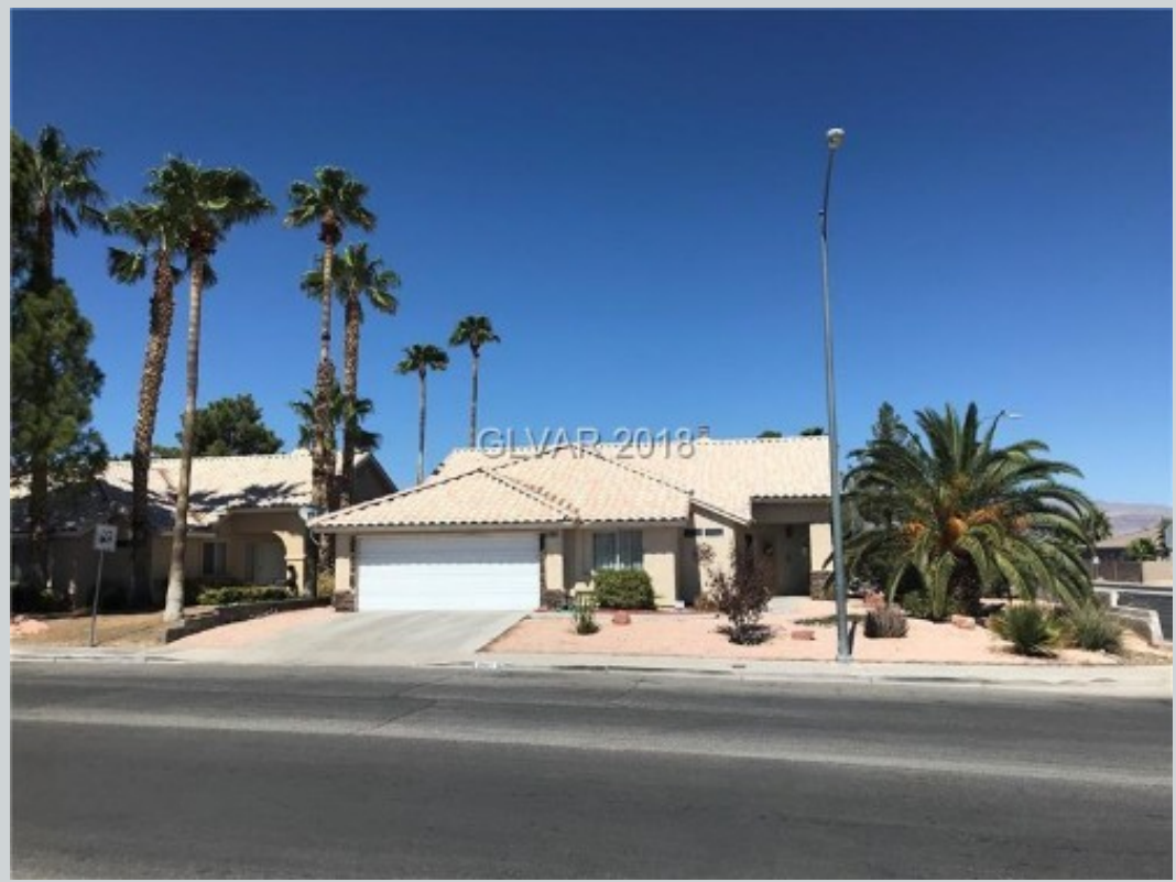
Listing Comp 1 2902 W Gilmore Ave