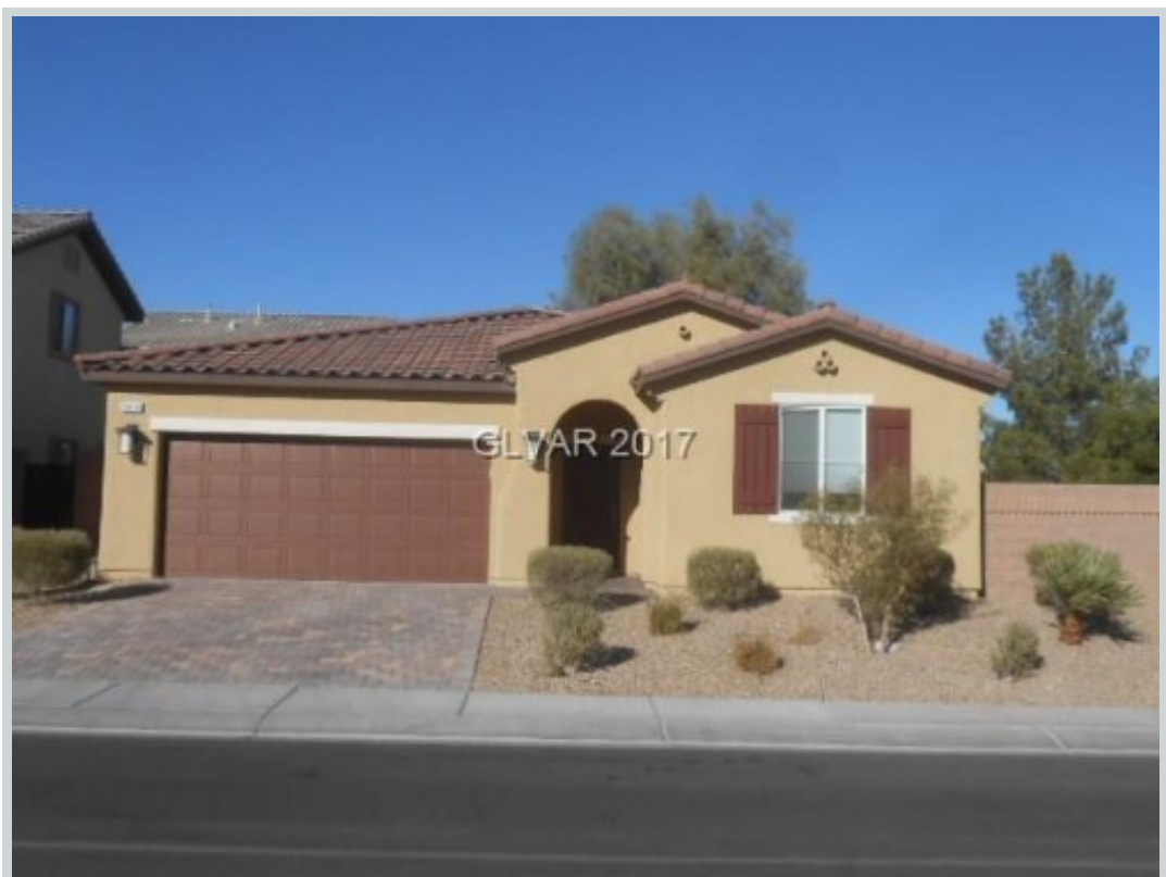
Sold Comp 3 2804 Colts Ave