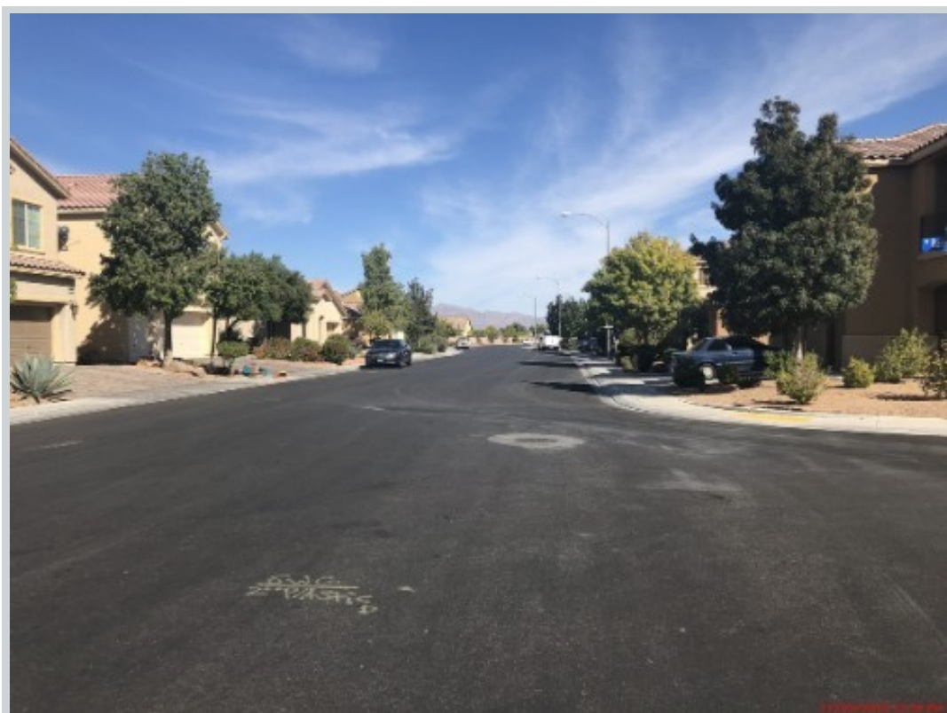
Subject 3906 Burma Rd Comment "Right view"