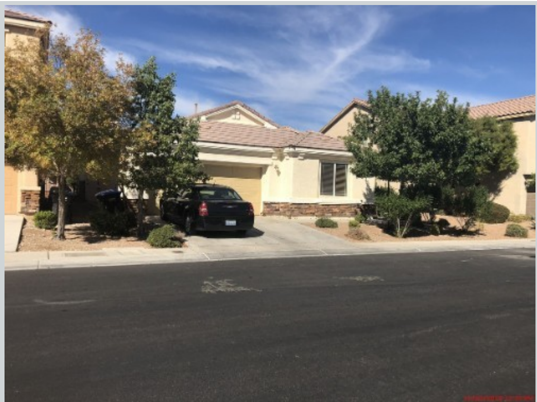
Subject 3906 Burma Rd