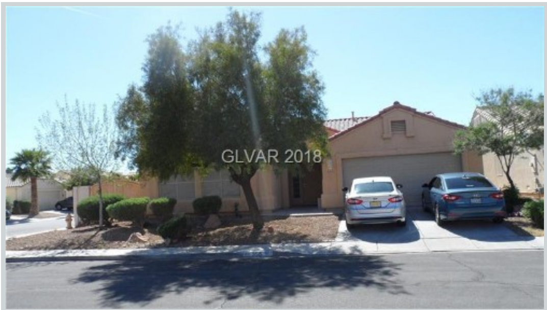
Sold Comp 2 3515 Trotting Horse Rd