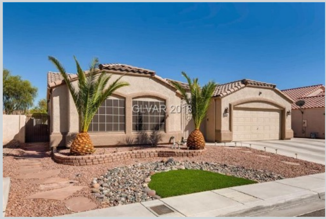
Listing Comp 3 3408 Trotting Horse Rd