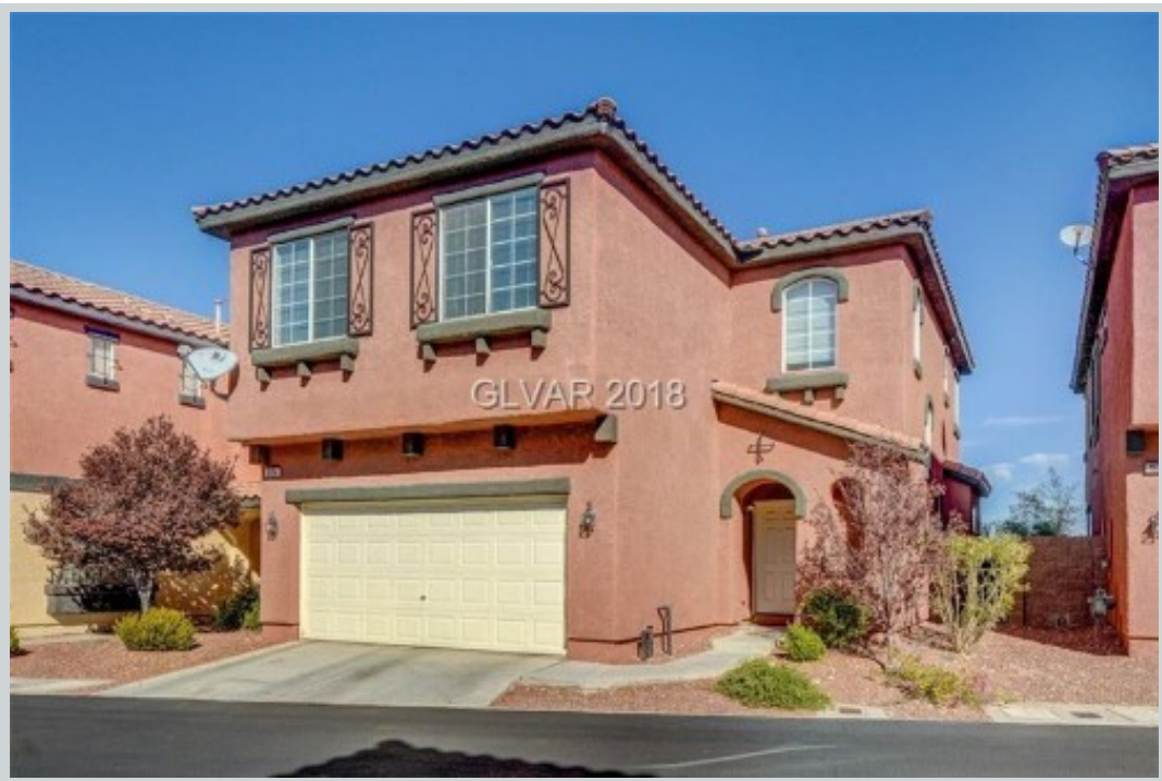
Listing Comp 2