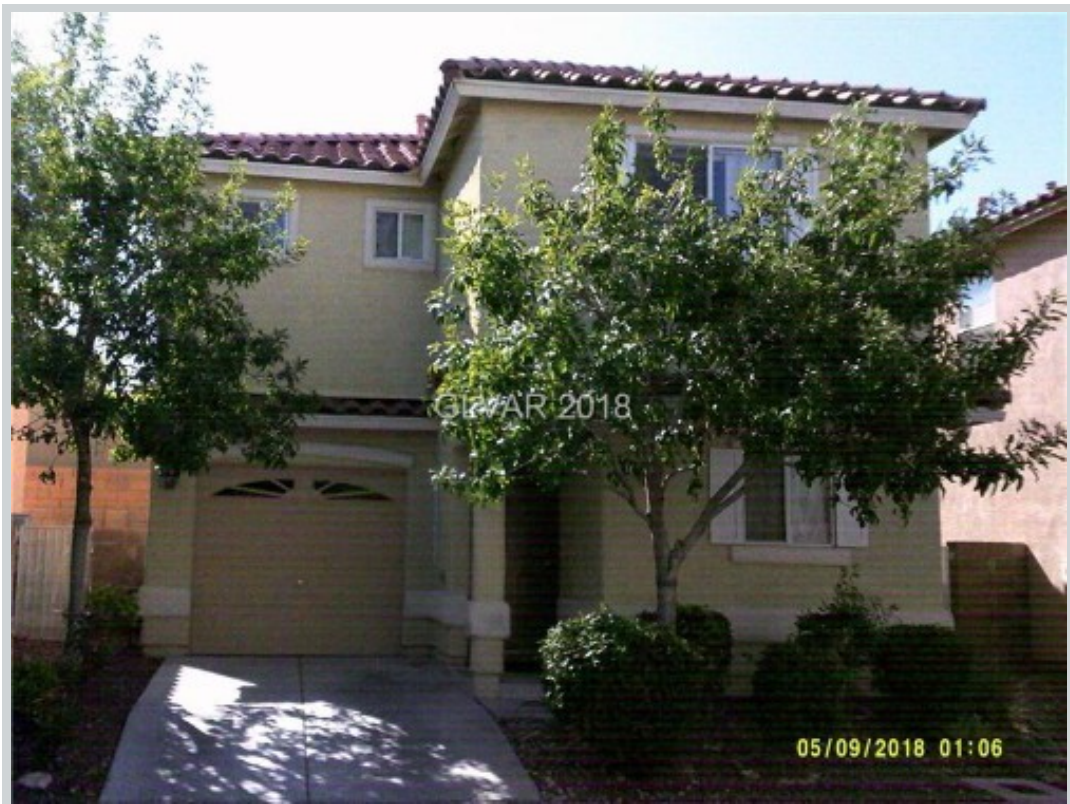
Listing Comp 3