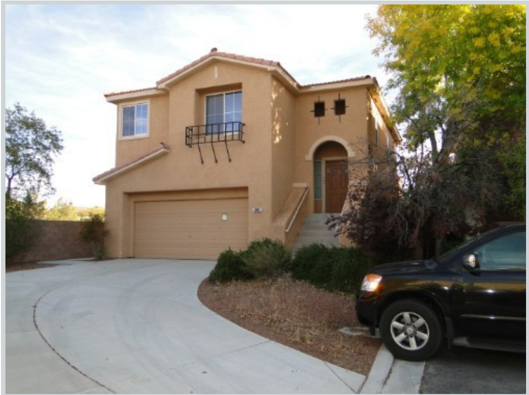
Subject 3805 Bella Palermo Way