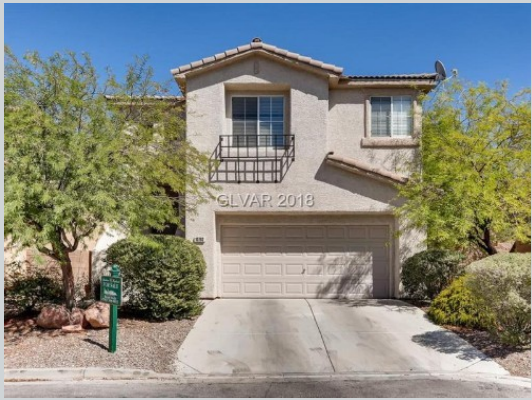
Sold Comp 2