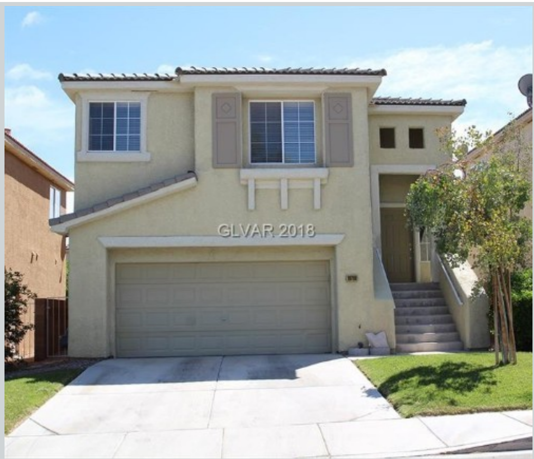
Sold Comp 3