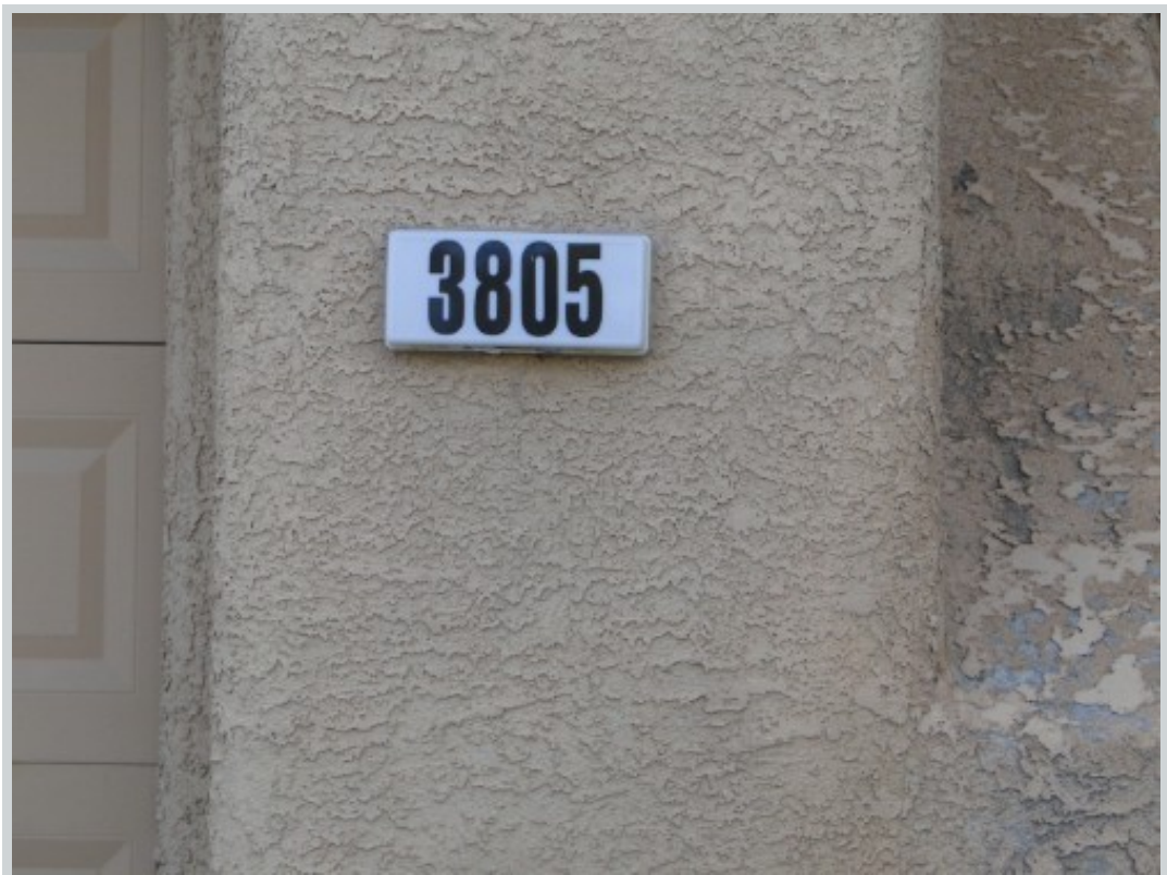
Subject 3805 Bella Palermo Way