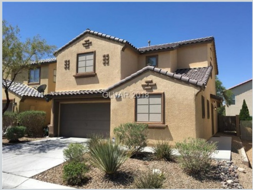
Listing Comp 1