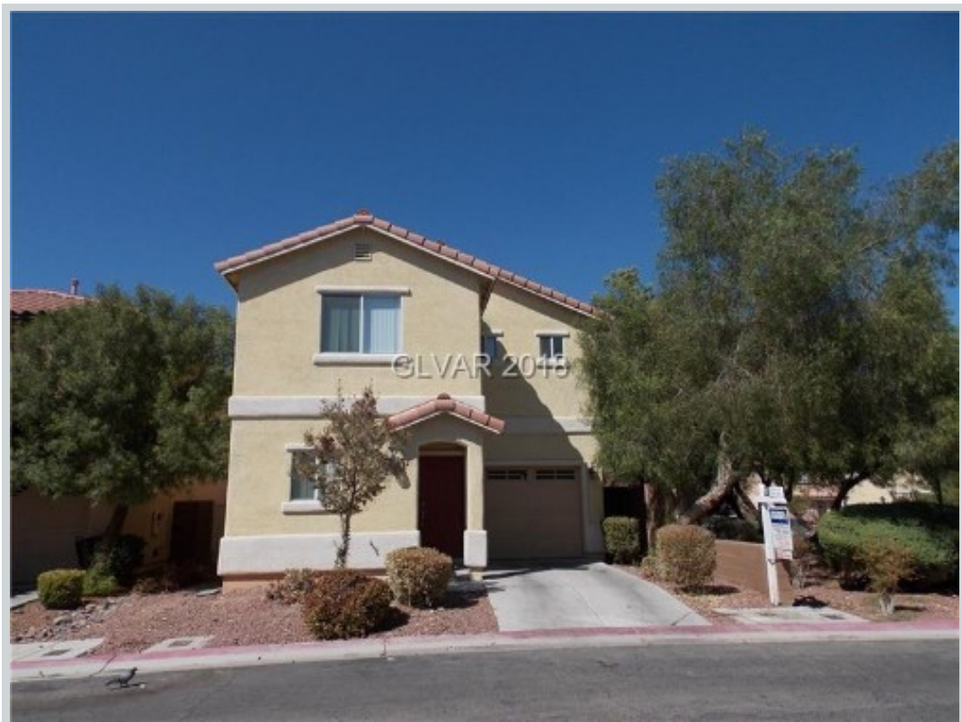
Sold Comp 1