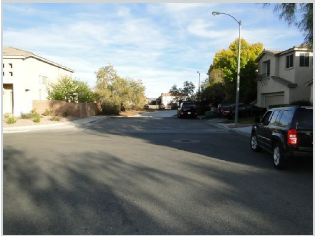
Subject 3805 Bella Palermo Way