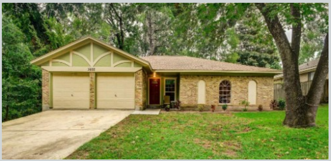
Listing Comp 1 3602 Willie Way Way