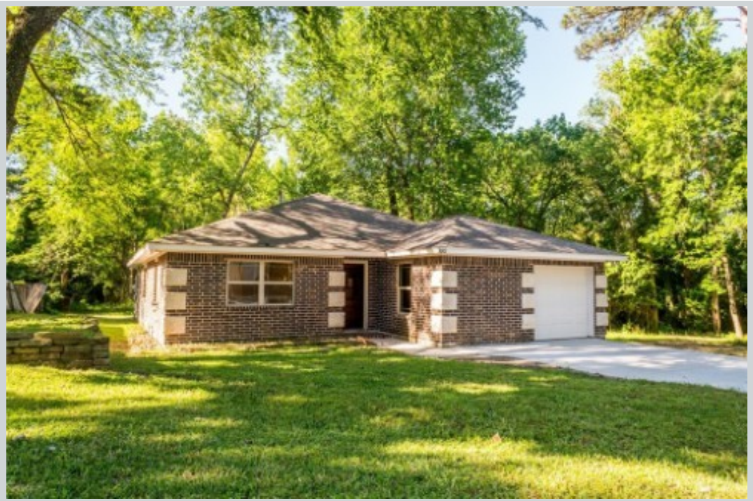
Sold Comp 2 3603 Willie Way