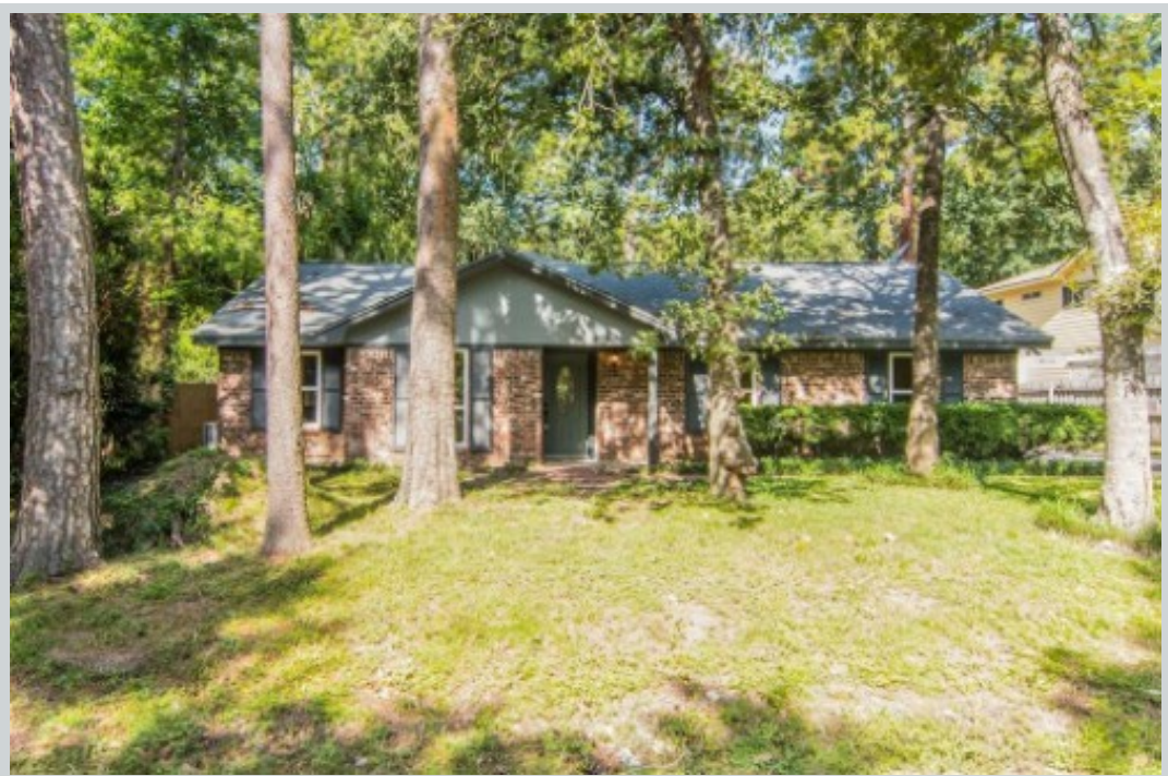
Listing Comp 3