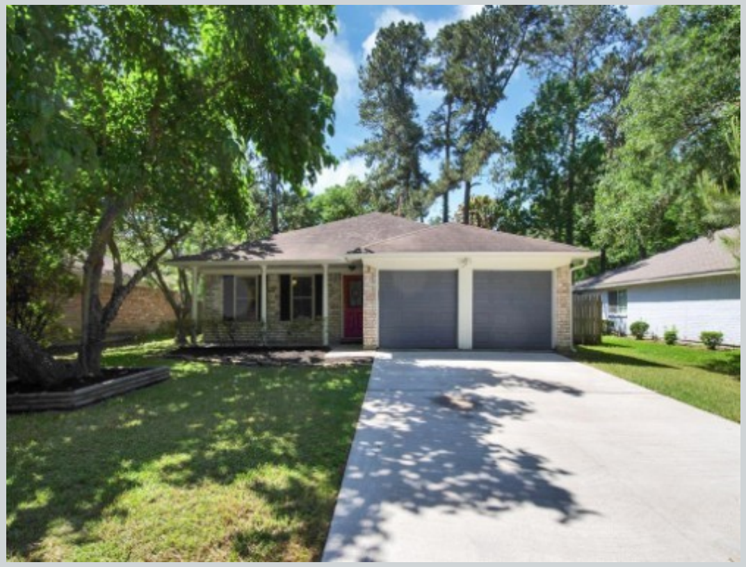
Sold Comp 1 3211 Valerie Lane