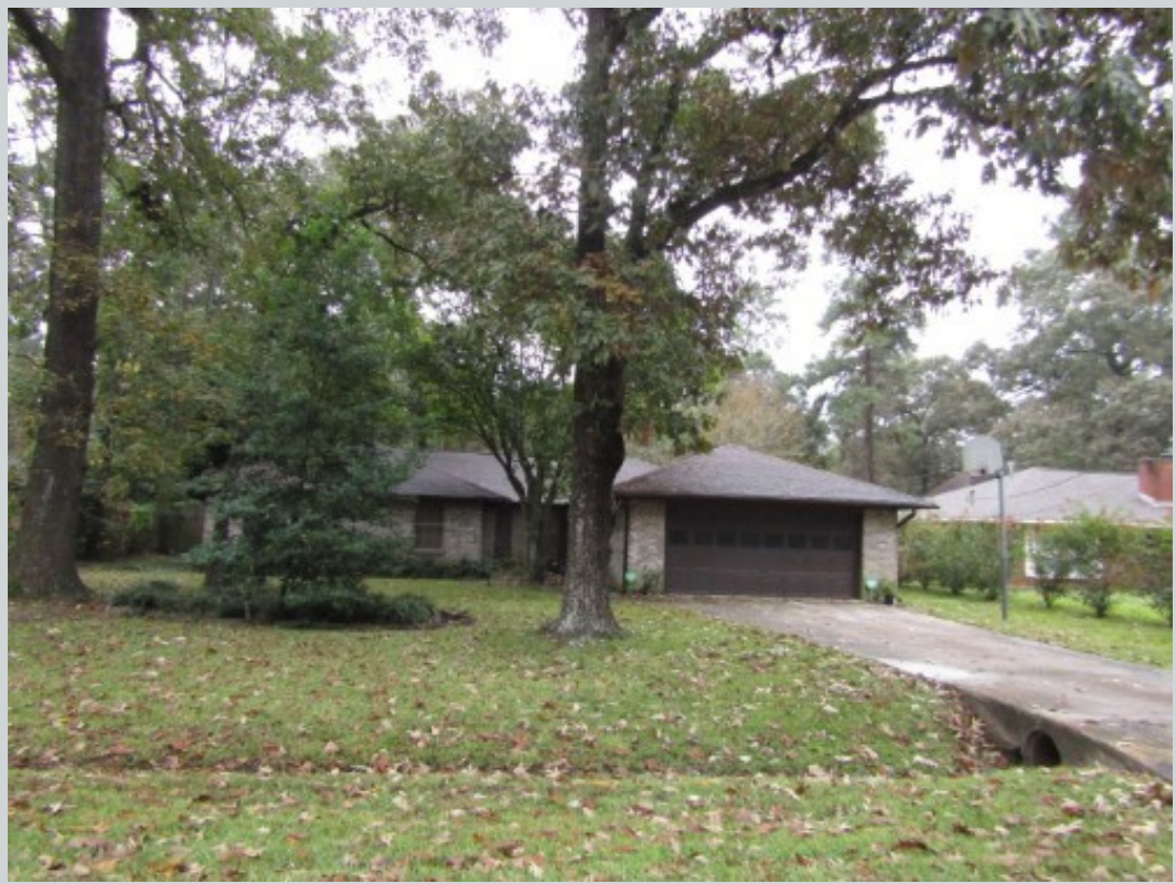
Subject 3303 Forest Glen St