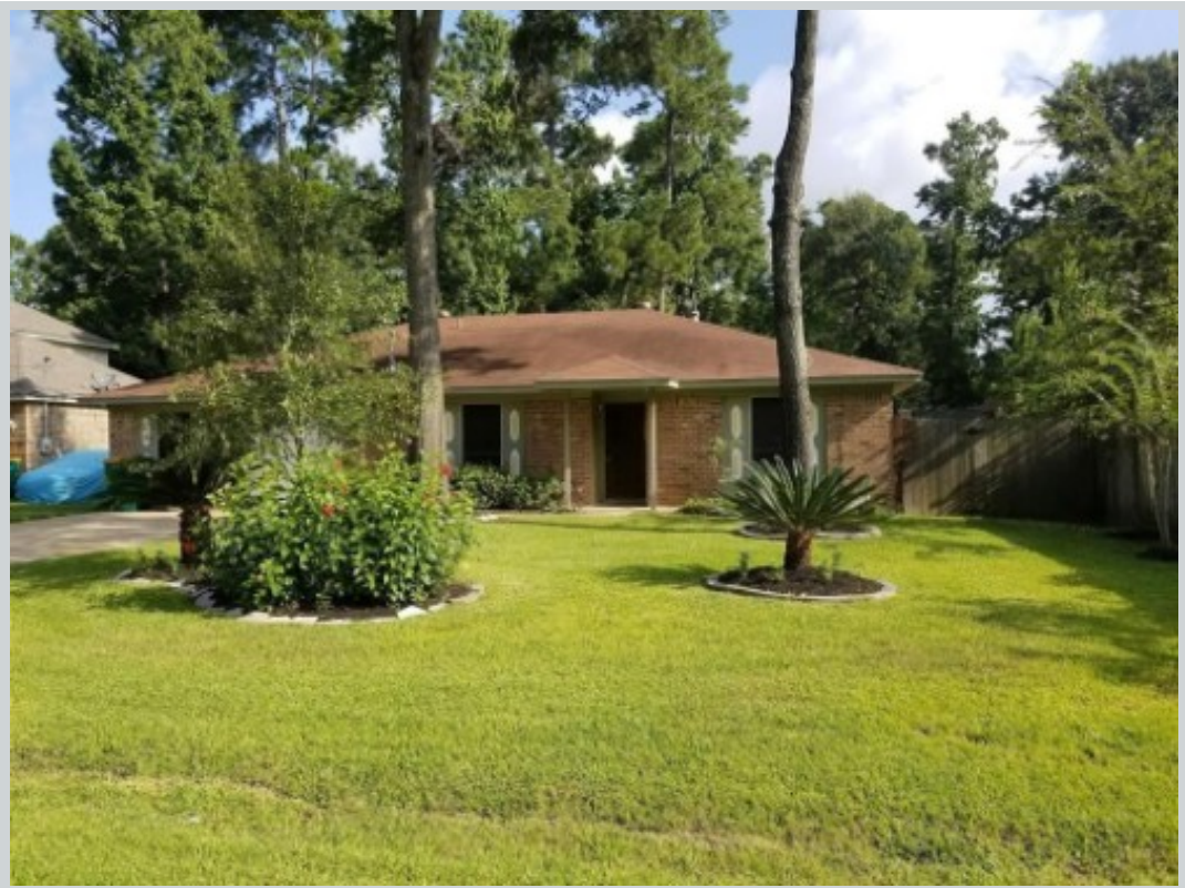
Listing Comp 2 3210 Falling Leaf Lane