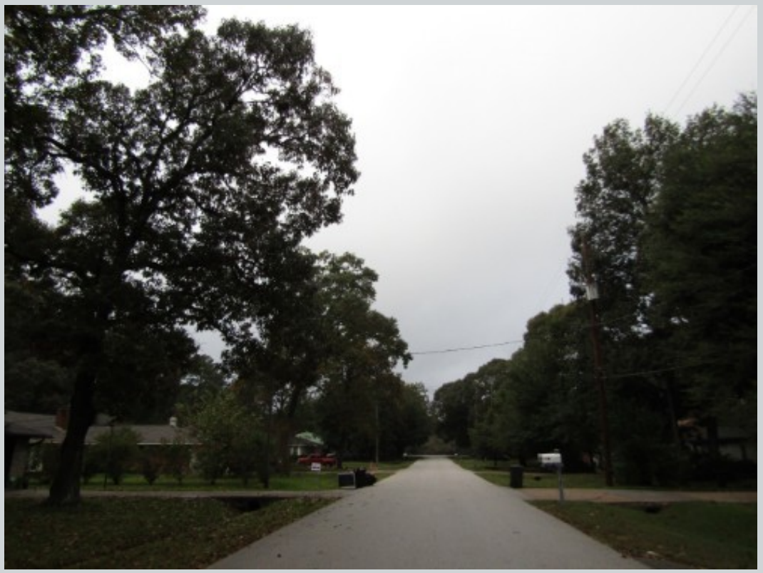
Subject 3303 Forest Glen St