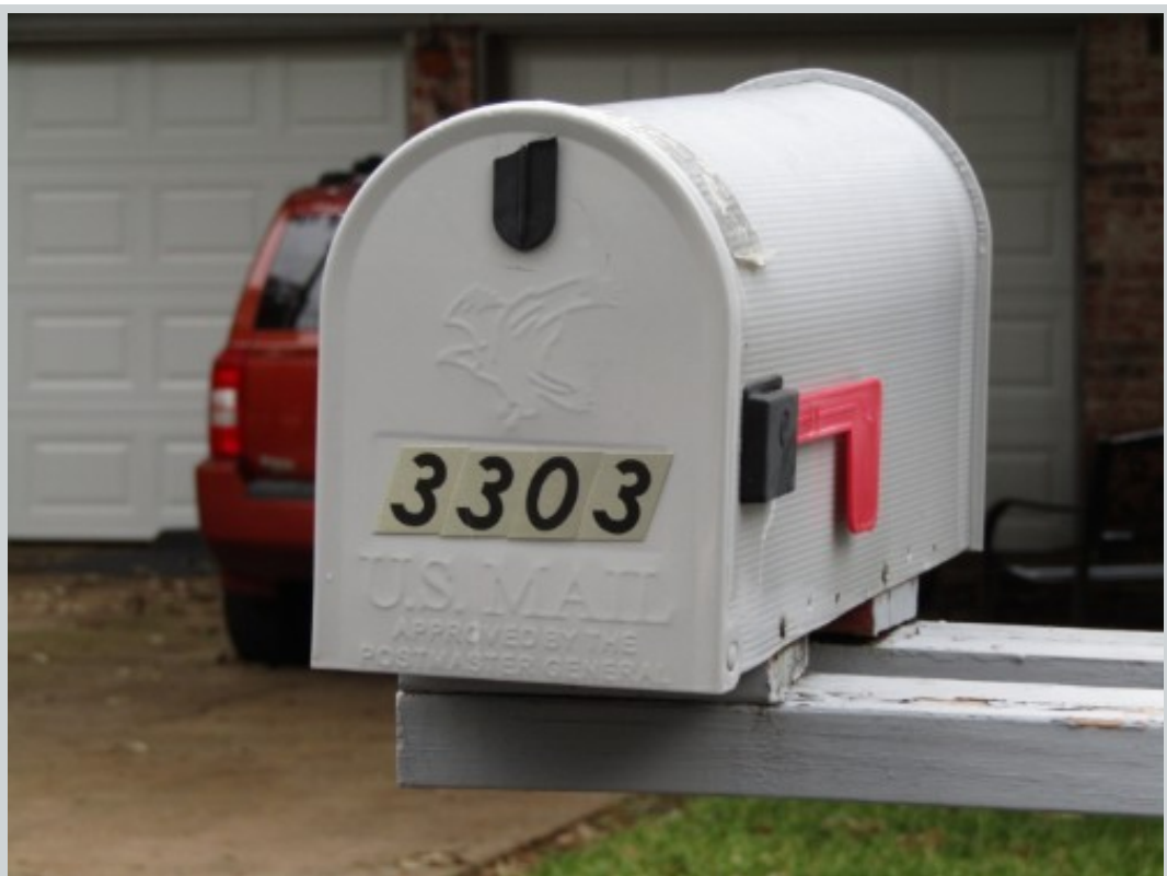
Subject 3303 Forest Glen St