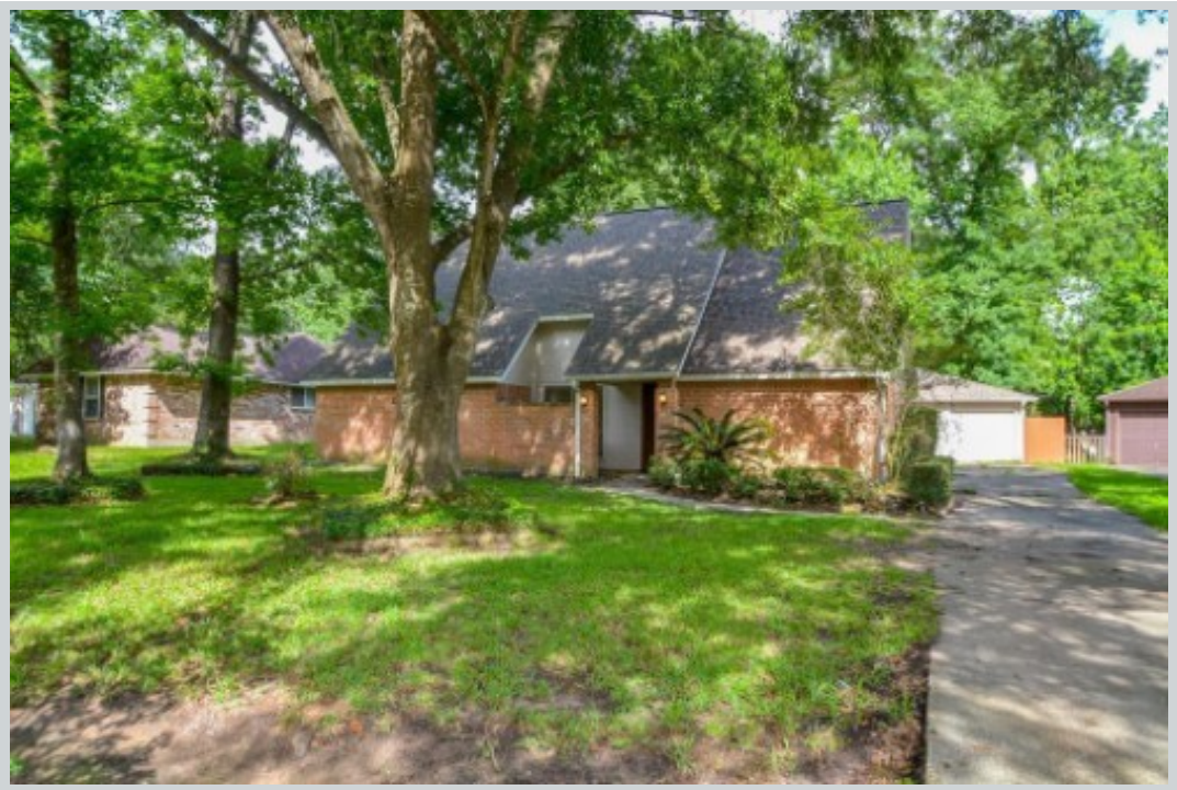
Sold Comp 3 24906 Wilderness Road