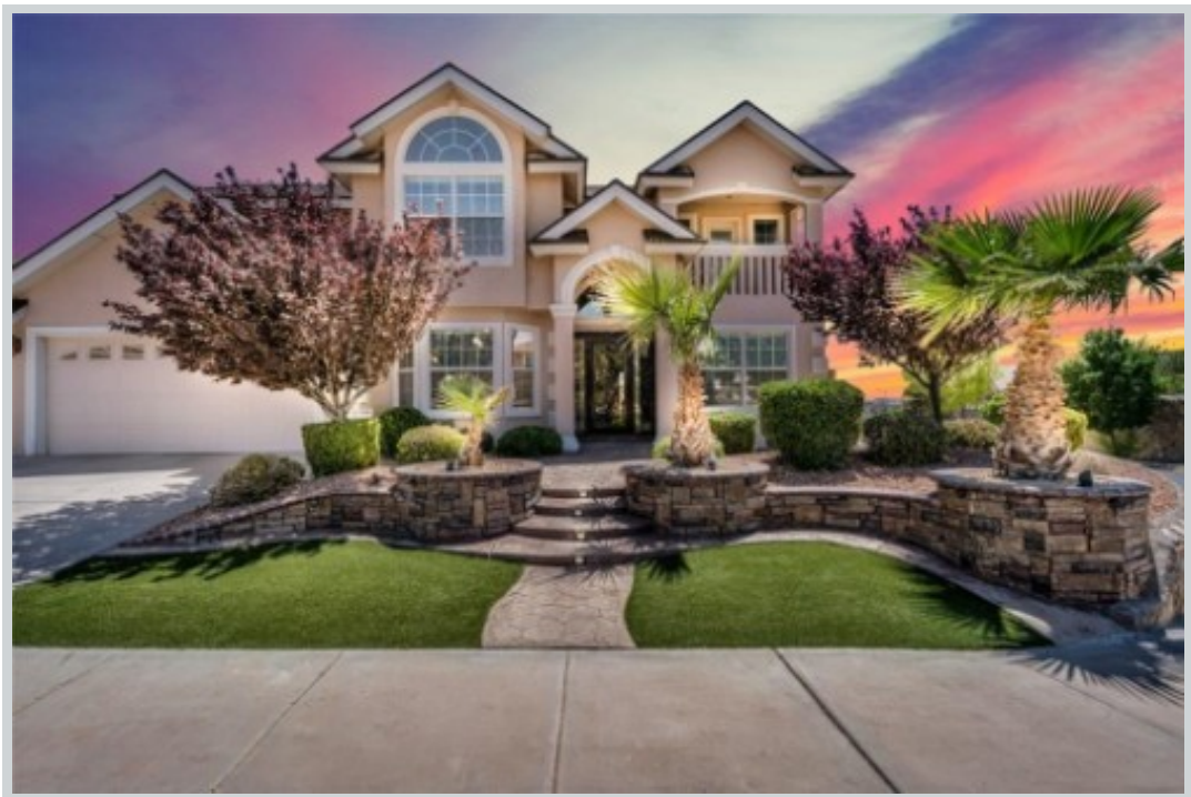
Sold Comp 2 13342 Emerald Hills Street