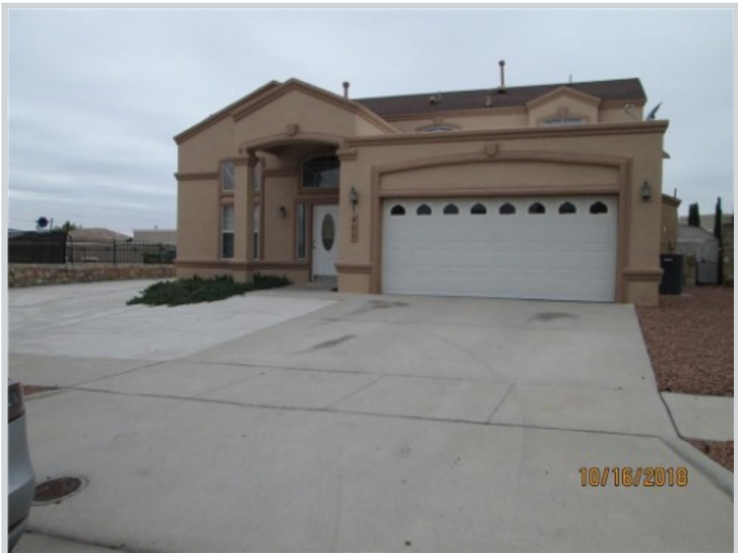
Listing Comp 1 405 Emerald Bluff Drive