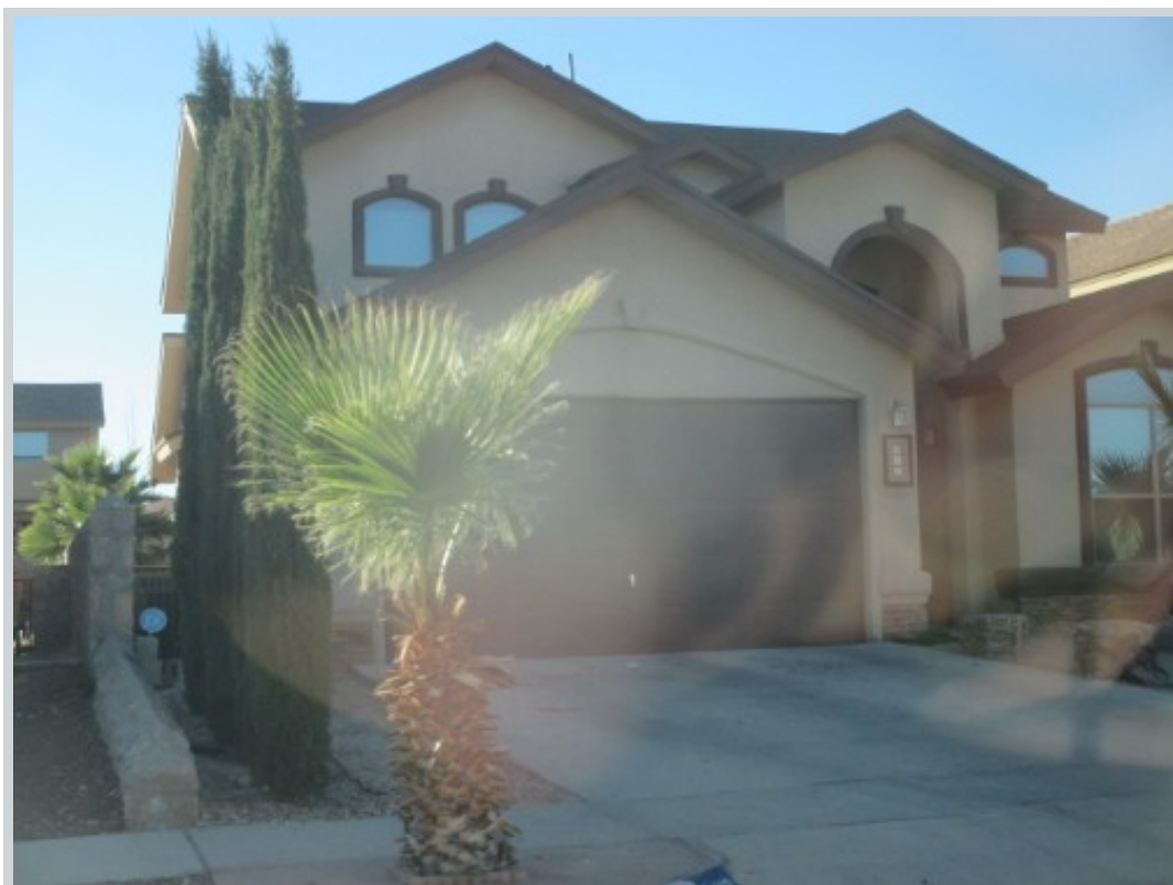
Subject 413 Litchfield St