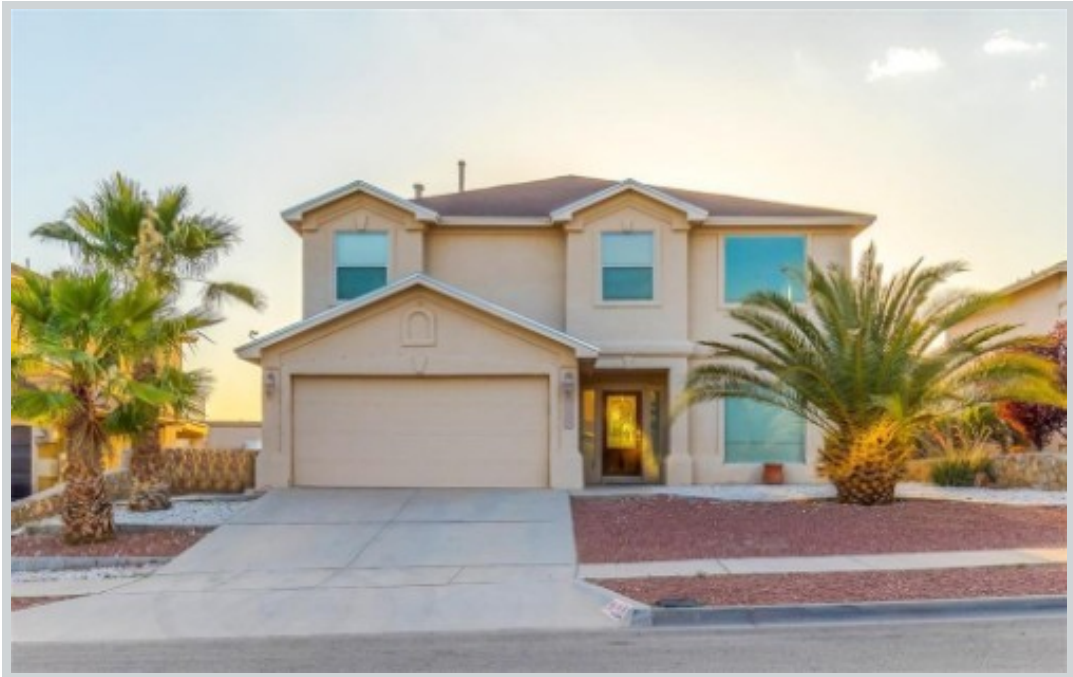
Listing Comp 2 413 Emerald Trail