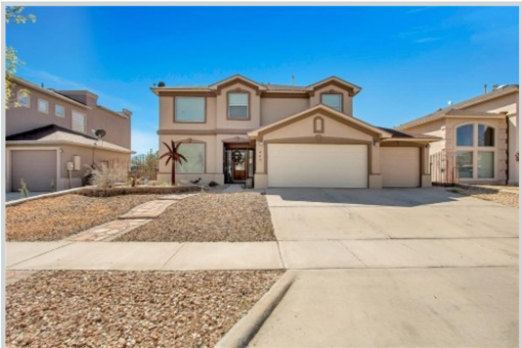
Sold Comp 1 445 Emerald Pass Ave