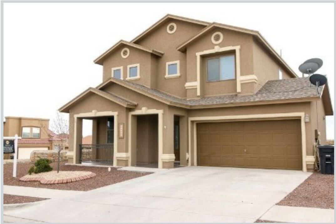
Sold Comp 2 13342 Emerald Hills Street