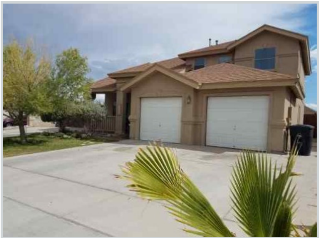
Sold Comp 3 13372 Emerlad Creek Dirve