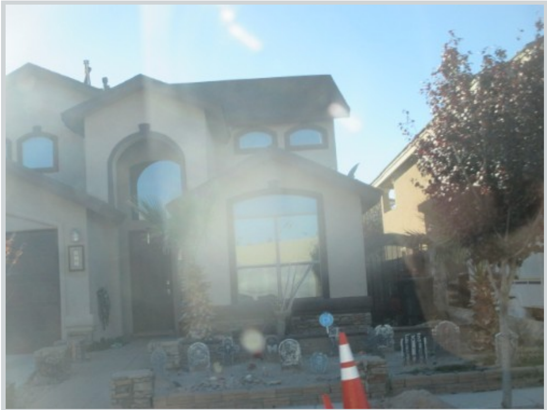
Subject 413 Litchfield St