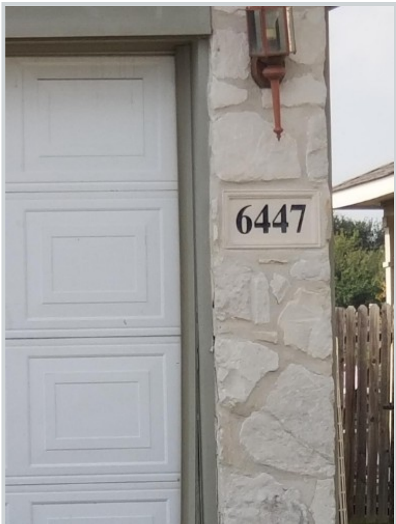
Subject 6447 Candlevue Ct