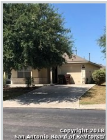
Listing Comp 1 2307 Salmon Crk