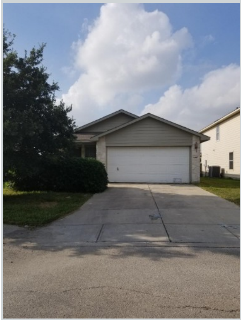
Subject 6447 Candlevue Ct