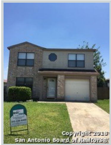
Sold Comp 3 6146 Candletree View Front