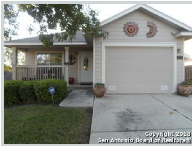
Listing Comp 3 2703 Moon Rock View Front