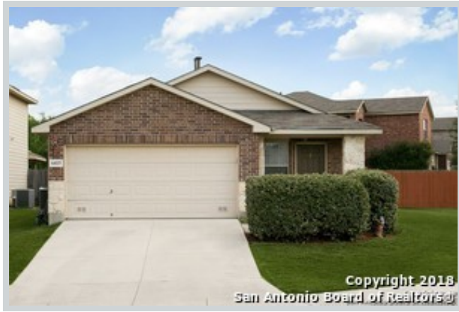
Sold Comp 1 6415 Candlewick Ct View Front