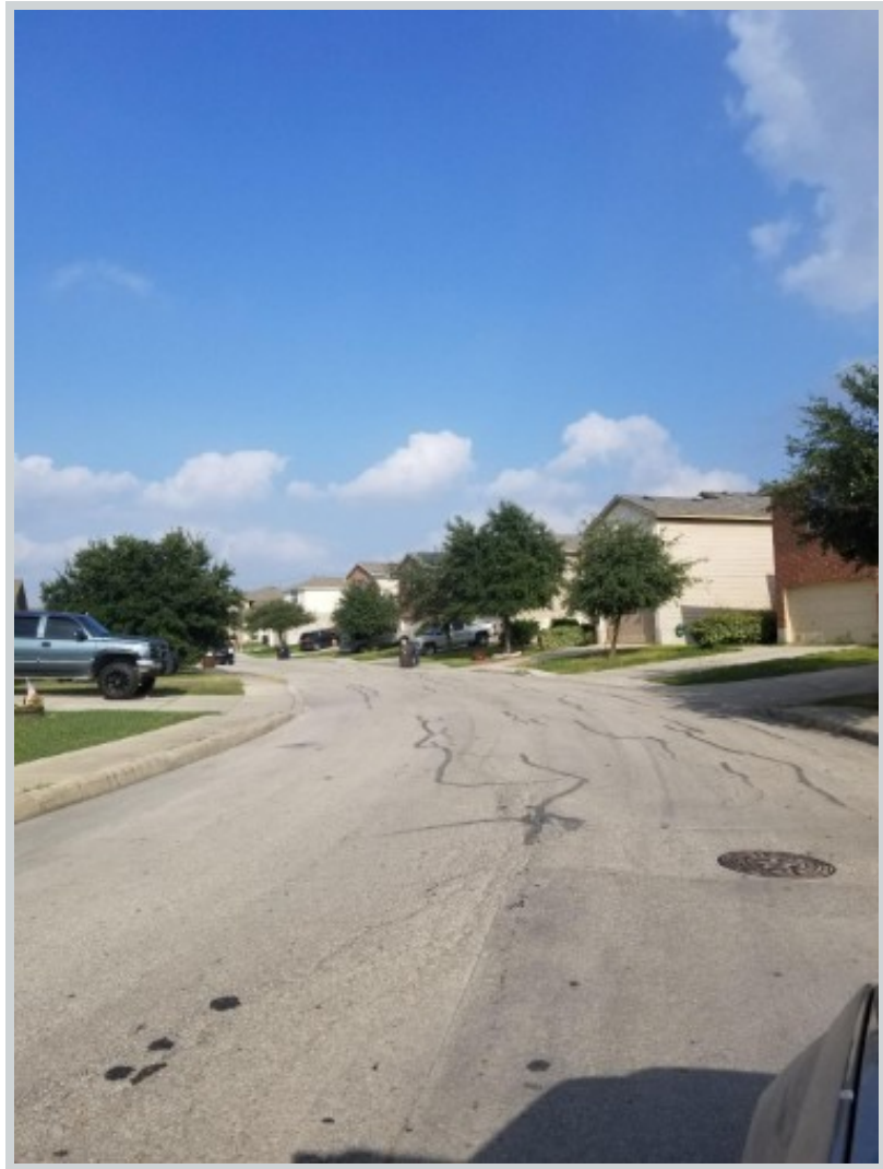
Subject 6447 Candleview Ct