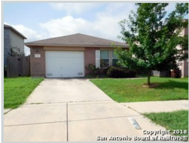
Sold Comp 2 6338 Fence Xing View Front