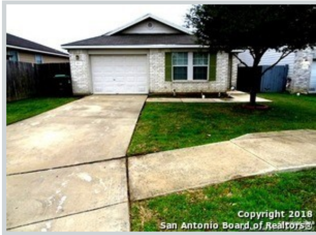
Listing Comp 2 2727 Candleridge Dr View Front