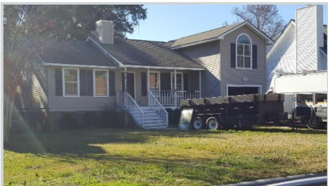
Subject 525 Pointe South Dr