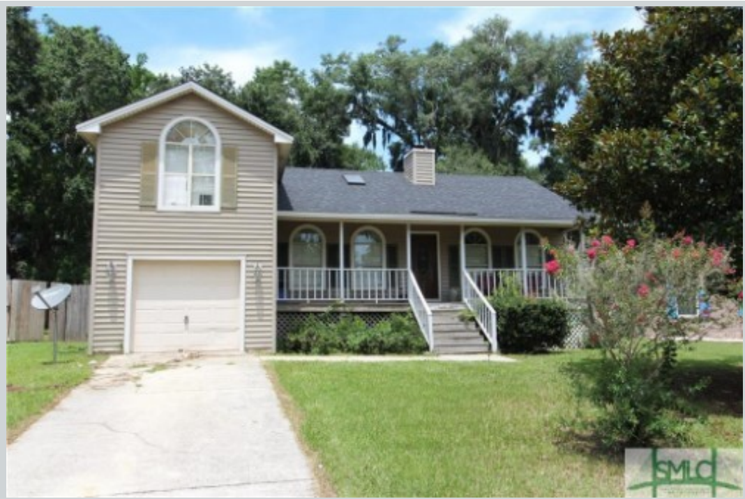
Listing Comp 1 524 Pointe South Dr