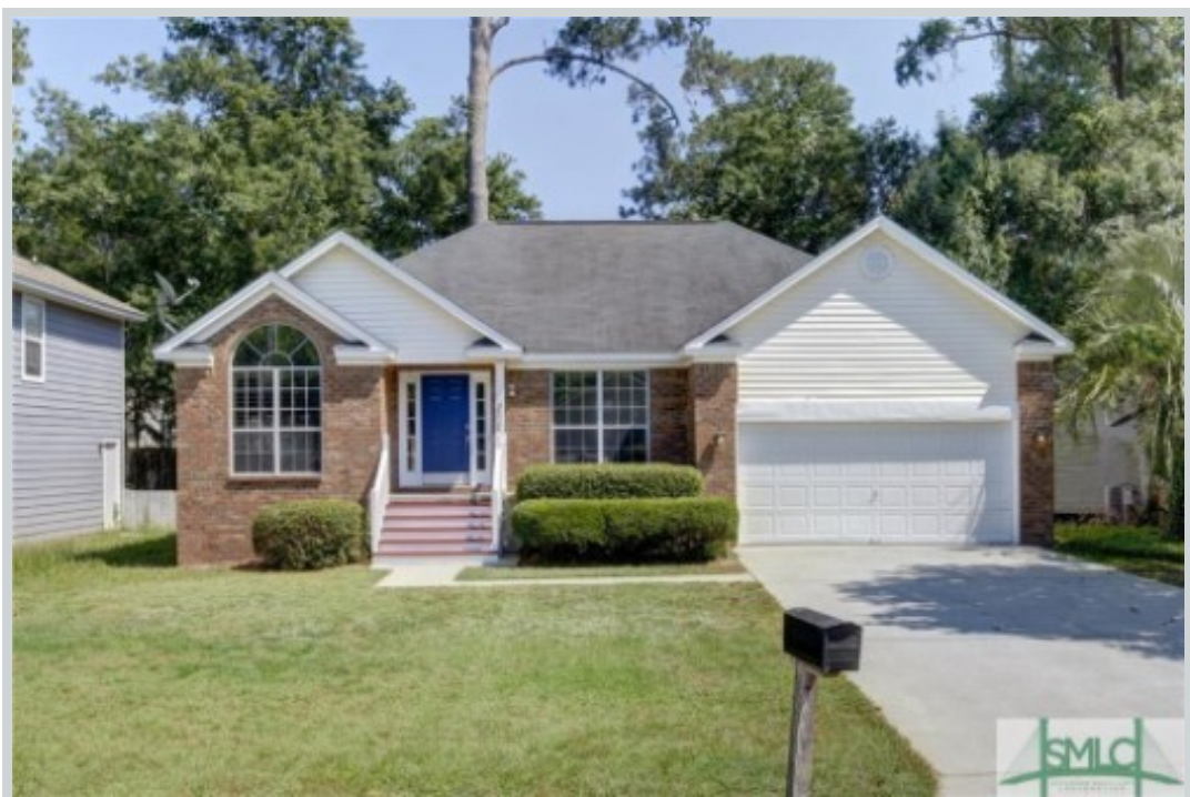
Sold Comp 2 535 Pointe South Dr View Front