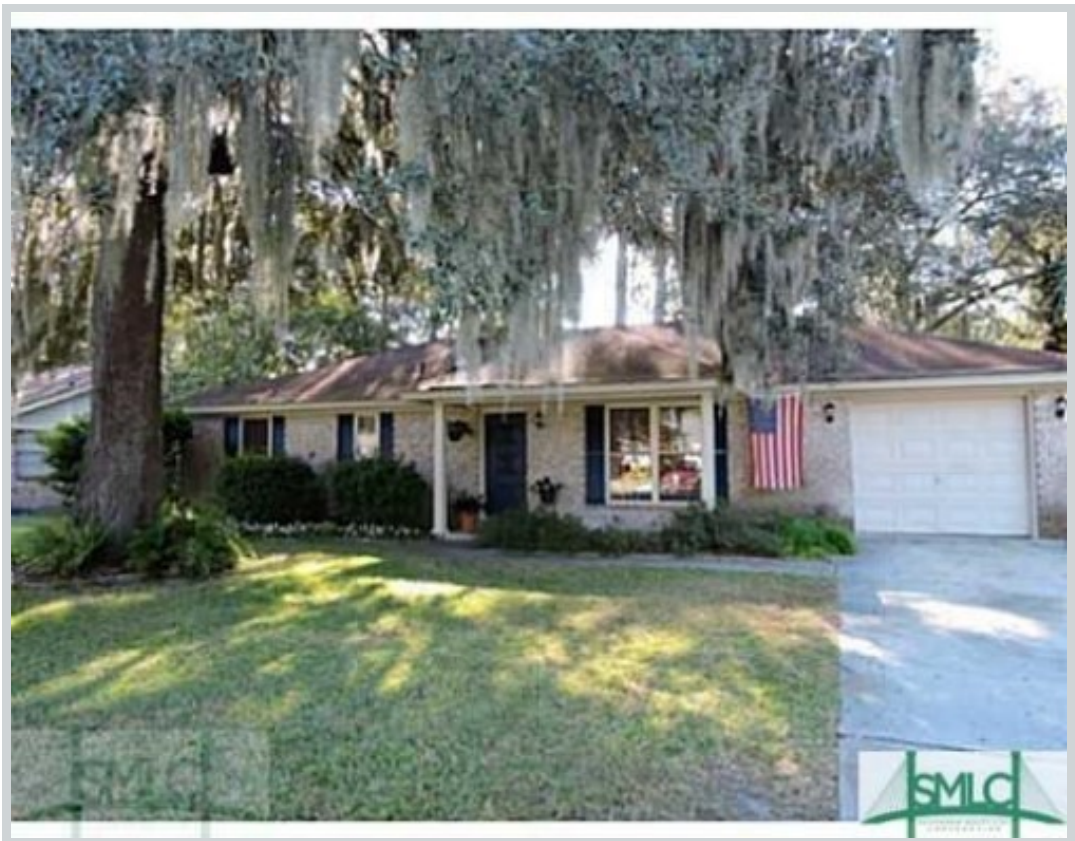
Listing Comp 3 1112 Cobb Rd