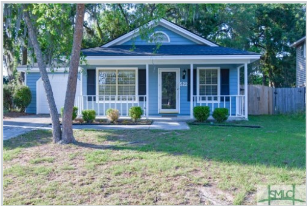
Sold Comp 1 522 Pointe South Dr View Front

Address 525 Pointe South Drive, Savannah, GA 31410 Loan Number 36496 Suggested List $207,900 Suggested Repaired $207,900 Sale $199,000