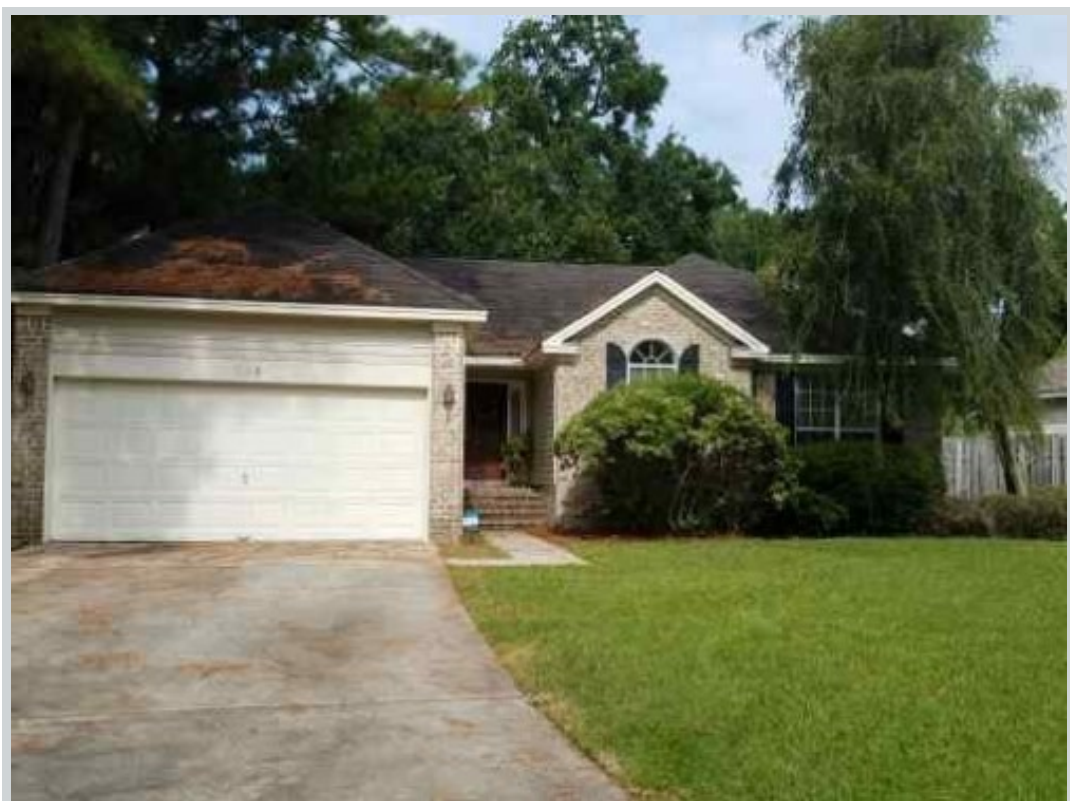
Sold Comp 3 554 Oemler Loop Ln