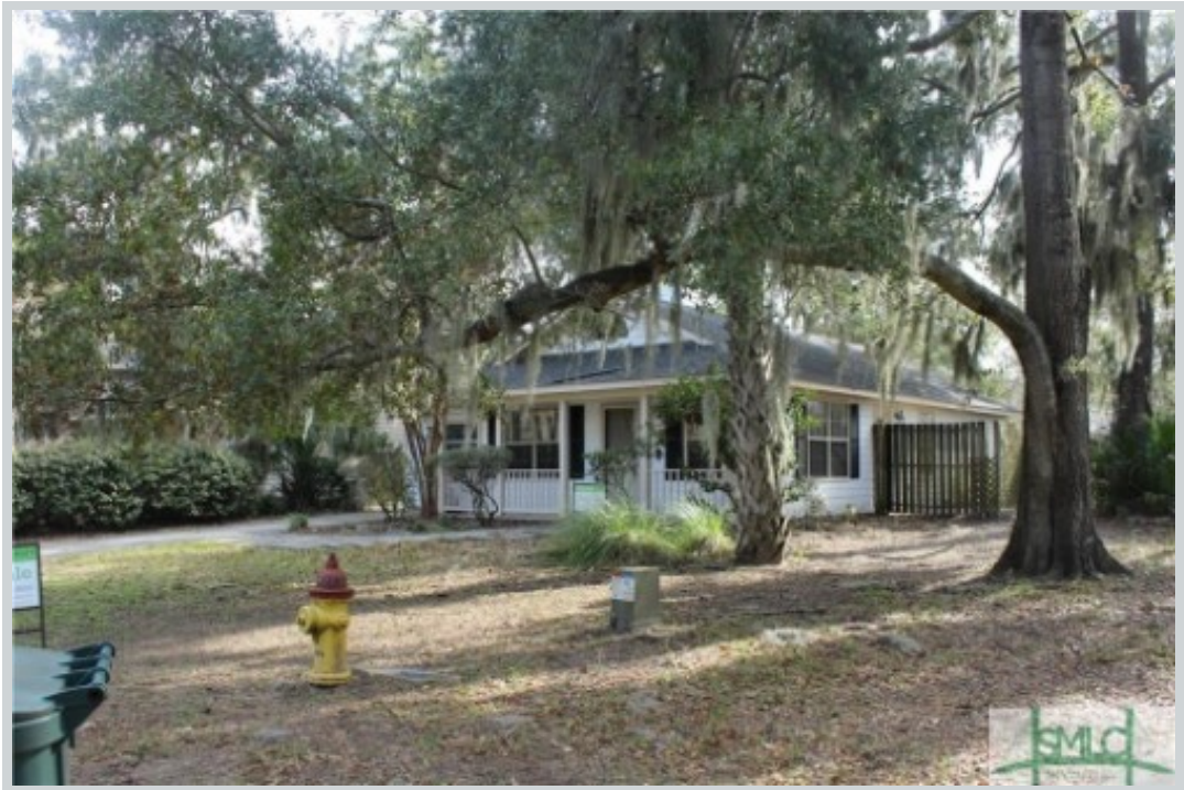
Listing Comp 2 507 Pointe South Dr