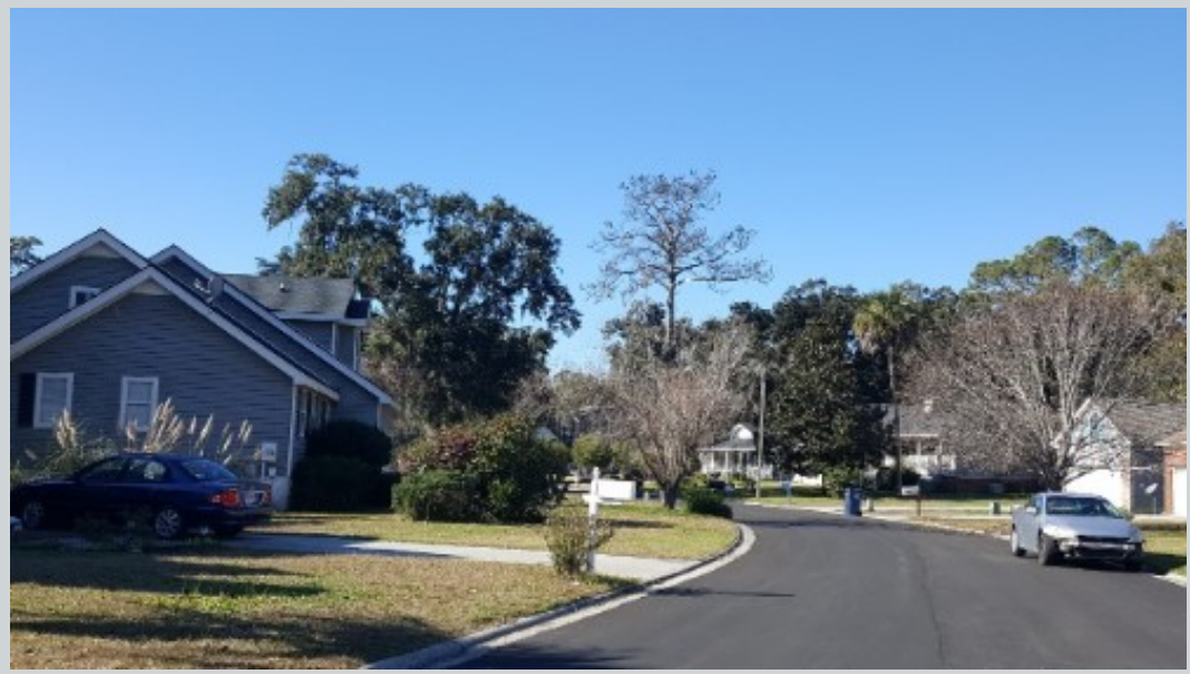
Subject 525 Pointe South Dr