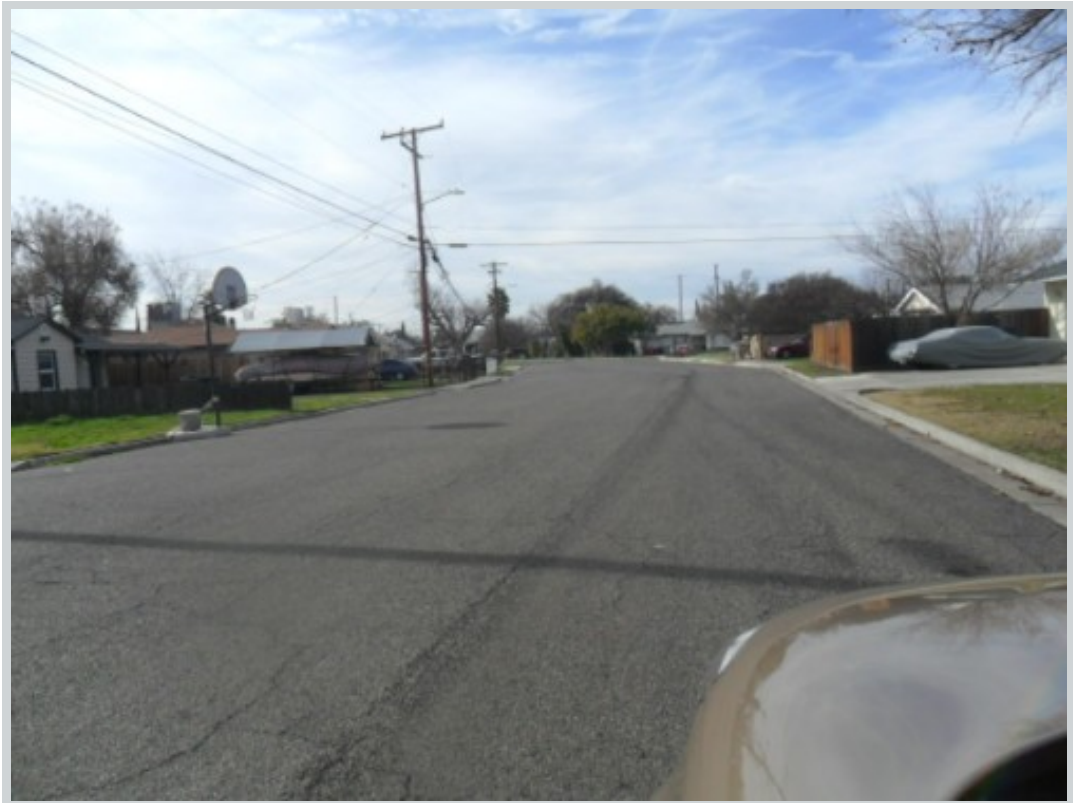
Subject 621 E Laurel Ave