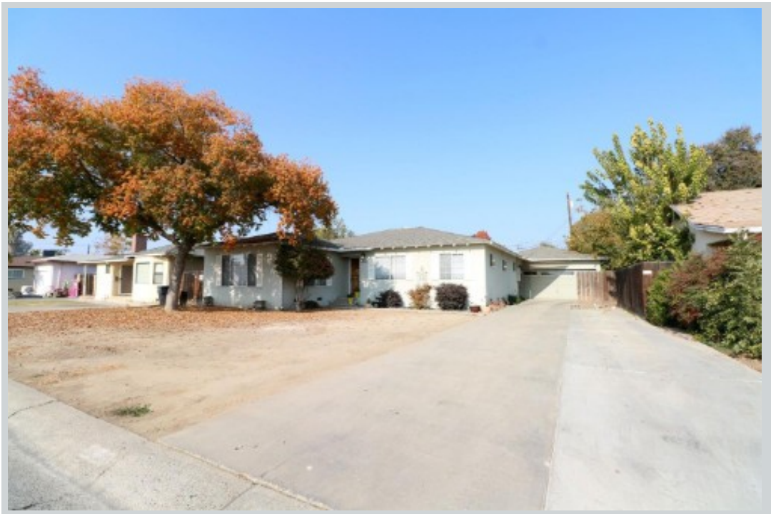
Listing Comp 3 1000 E Myrtle Ave