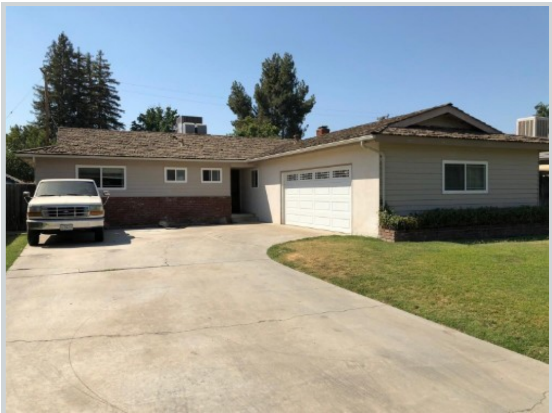
Listing Comp 1 921 W Princeton Ave