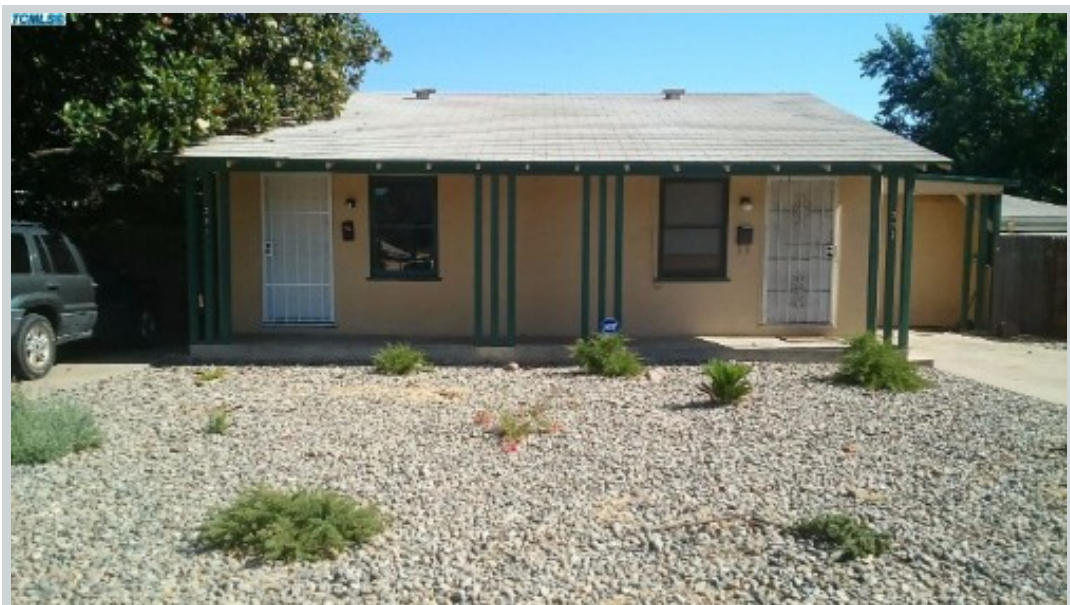
Sold Comp 2 301 W Feemster