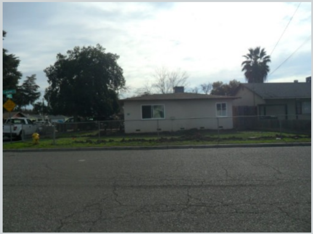
Subject 621 E Laurel Ave