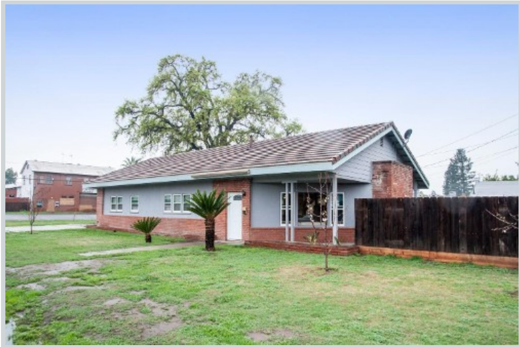
Sold Comp 1 1515 S Watson St