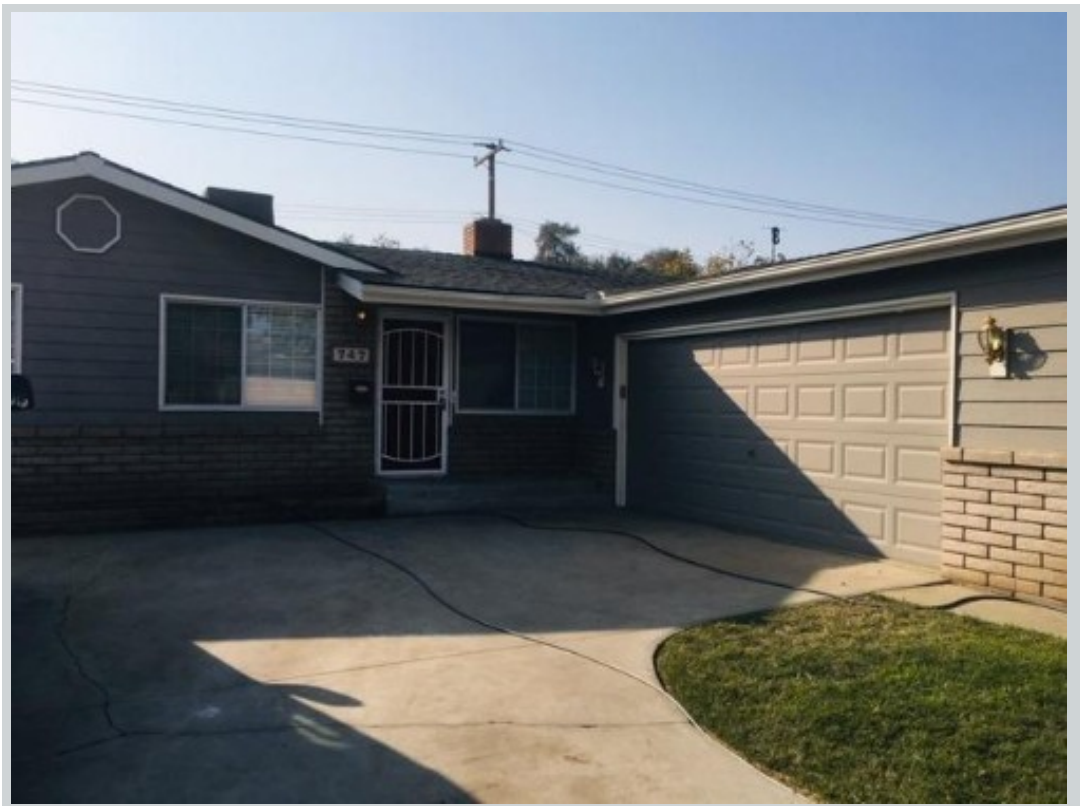
Listing Comp 2 747 E Myrtle Ave

Address 621 E Laurel Avenue, Visalia, CA 93292 Loan Number 36502 Suggested List $195,000 Suggested Repaired $195,000 Sale $195,000