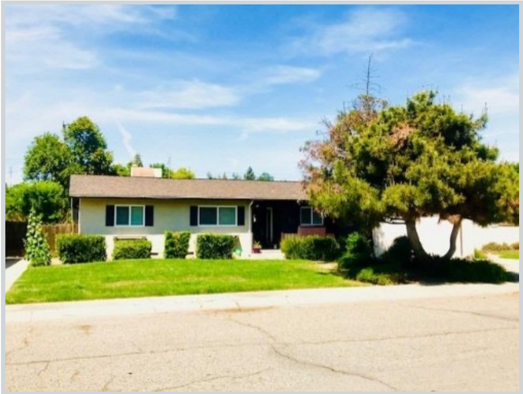
Sold Comp 3 532 W Paradise Ave