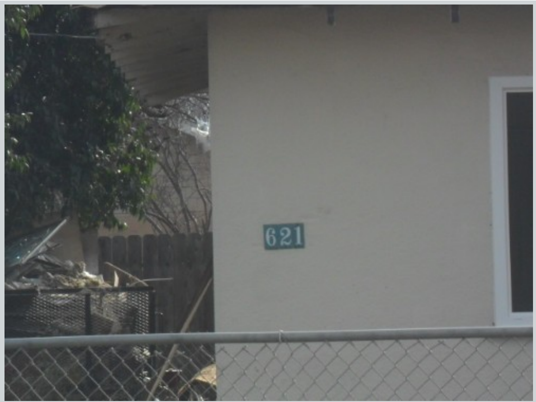
Subject 621 E Laurel Ave