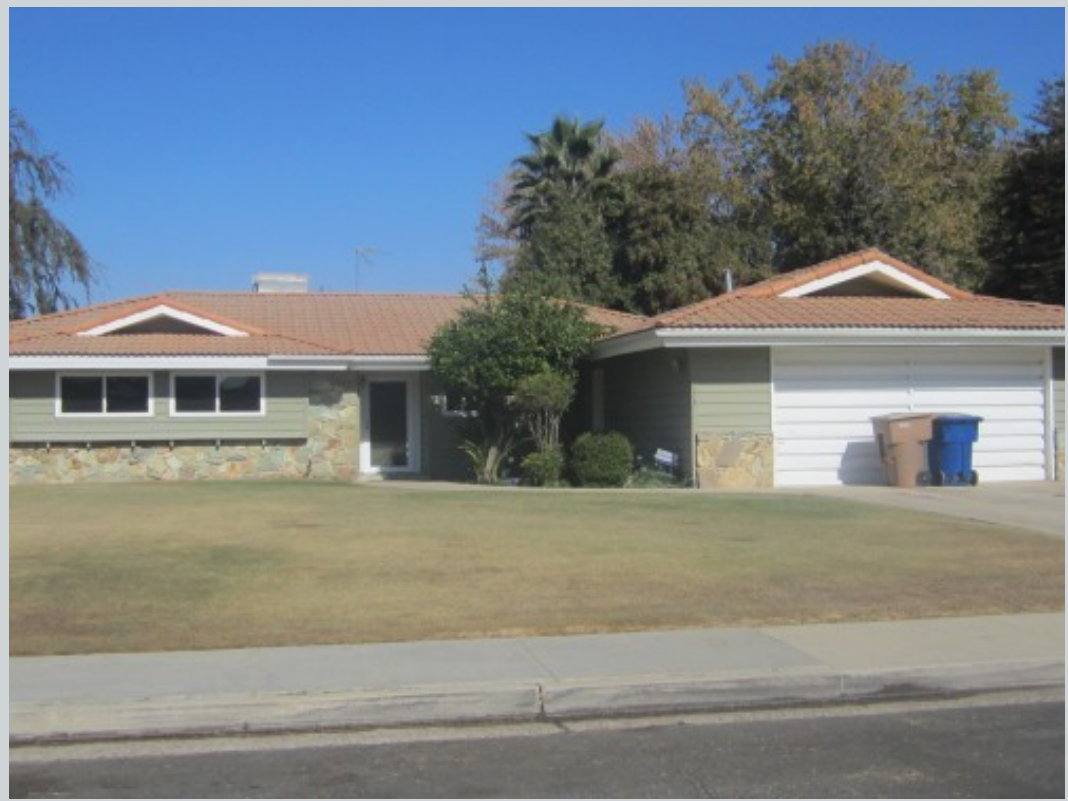
Subject 6000 Sally Ave