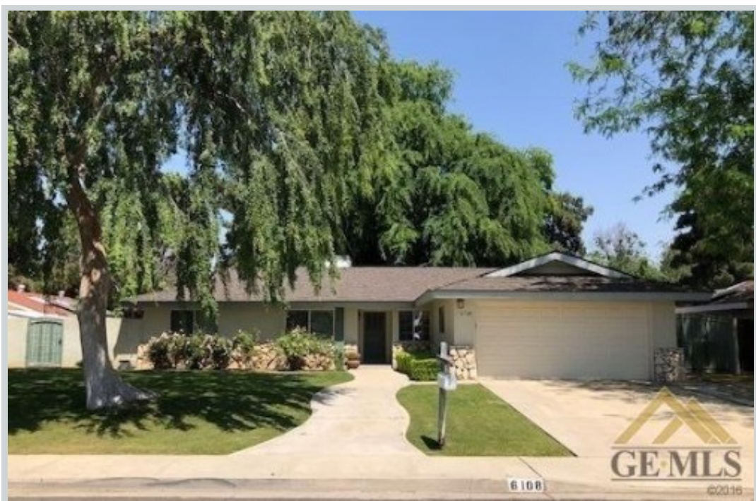
Sold Comp 1 6108 Lupine Avenue

Address 6000 Sally Avenue, Bakersfield, CA 93308 Loan Number 36511 Suggested List $249,000 Suggested Repaired $249,000 Sale $245,000