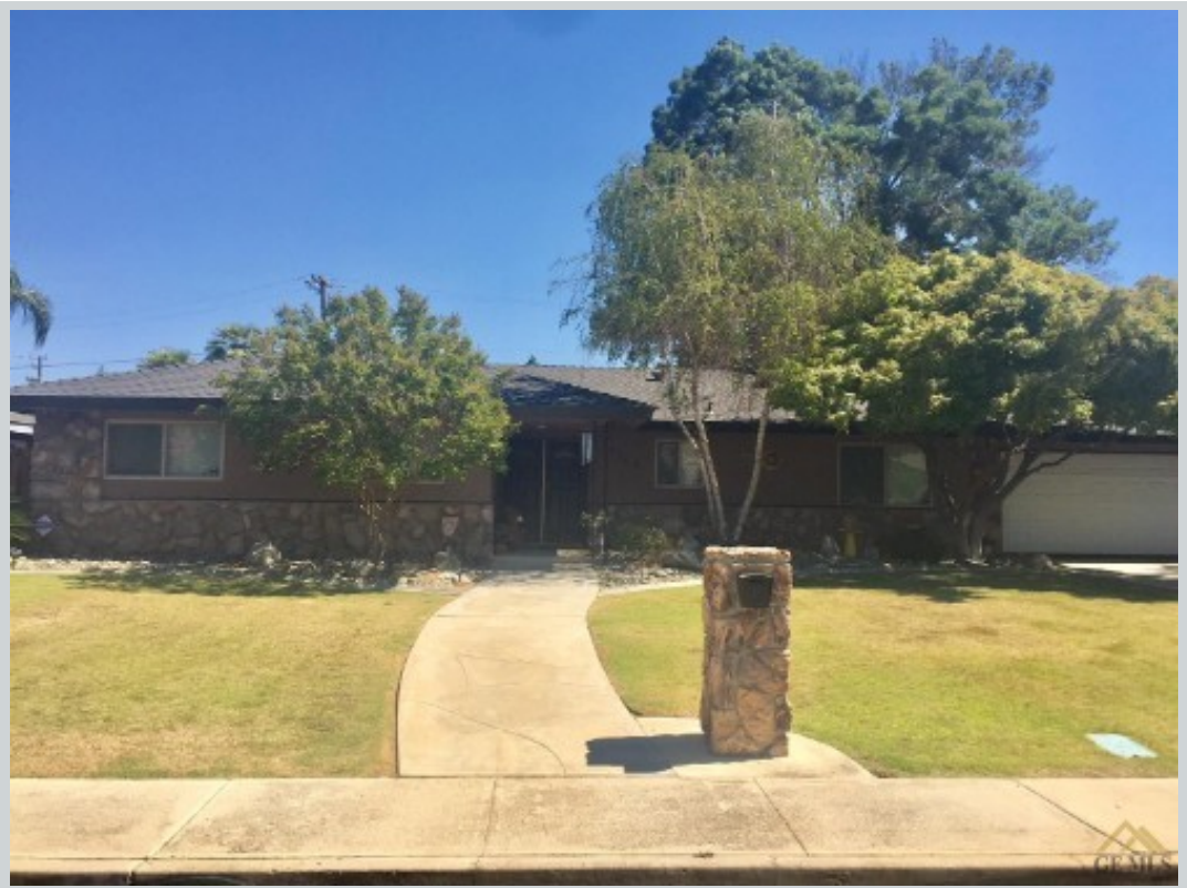
Listing Comp 1 5907 Pembroke Avenue