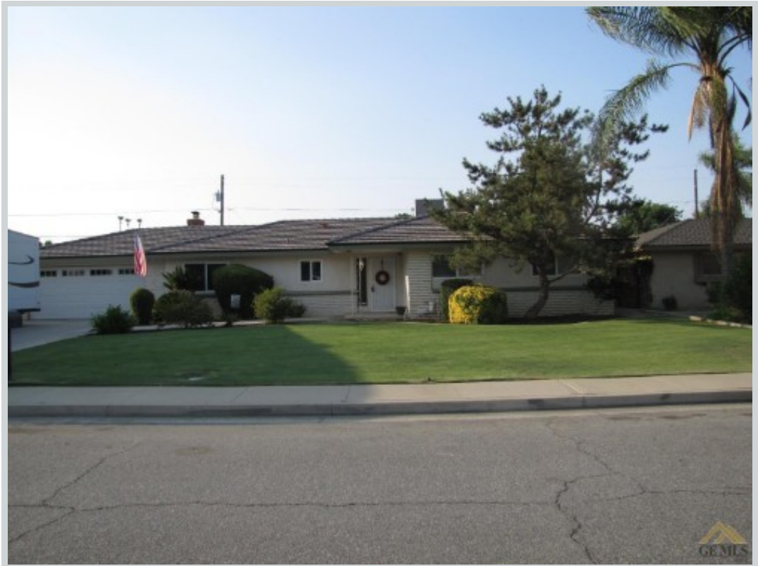
Sold Comp 3 6100 Pembroke Avenue