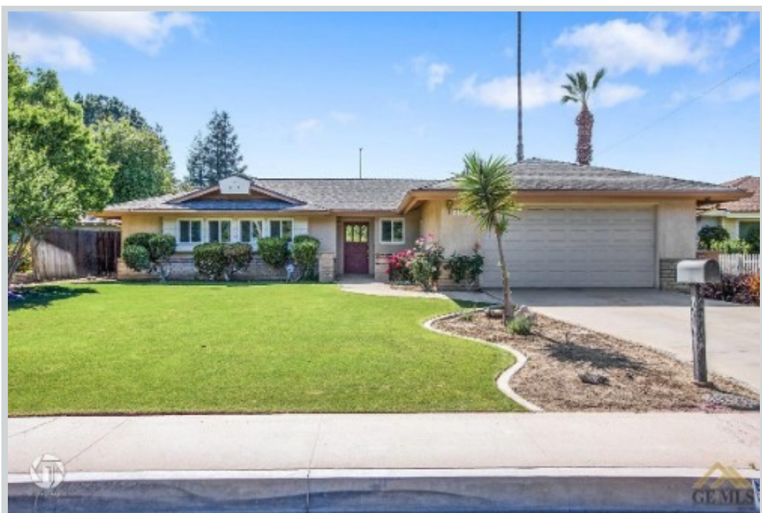
Sold Comp 2 6013 Mohawk Street