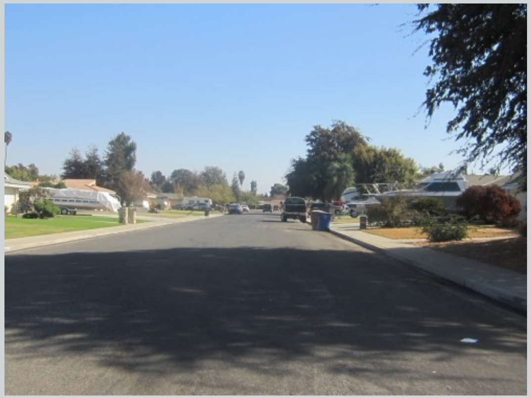
Subject 6000 Sally Ave