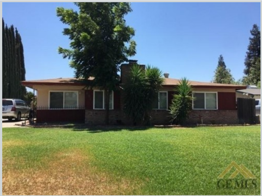
Listing Comp 3 6617 Cherrywood Avenue