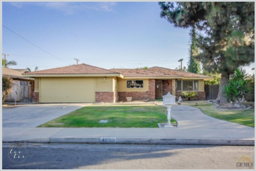
Listing Comp 2 7001 Arleta Avenue