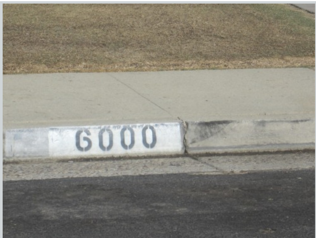
Subject 6000 Sally Ave