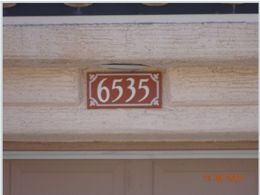
Subject 6535 Jordan River Dr