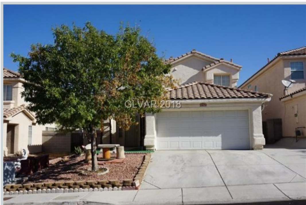
Listing Comp 1 6582 Jordan River Dr