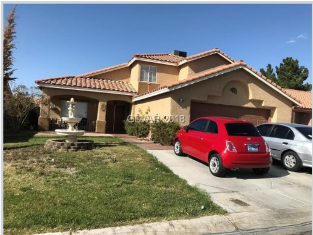
Sold Comp 2 6590 Rutgers Dr