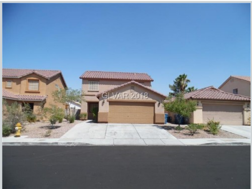
Listing Comp 3 3144 Emerald Creek Dr