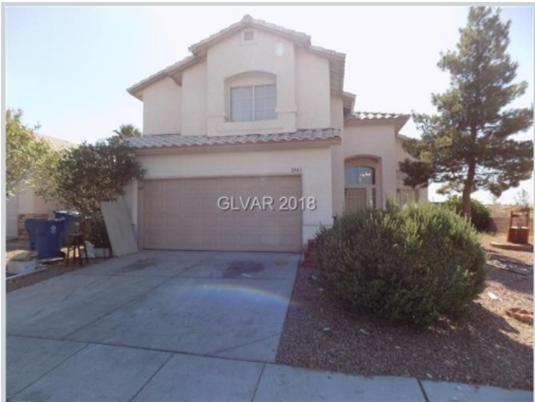
Sold Comp 1 2943 Heber Ct

Address 6535 Jordan River Drive, Las Vegas, NV 89156 Loan Number 36516 Suggested List $242,000 Suggested Repaired $242,000 Sale $237,000