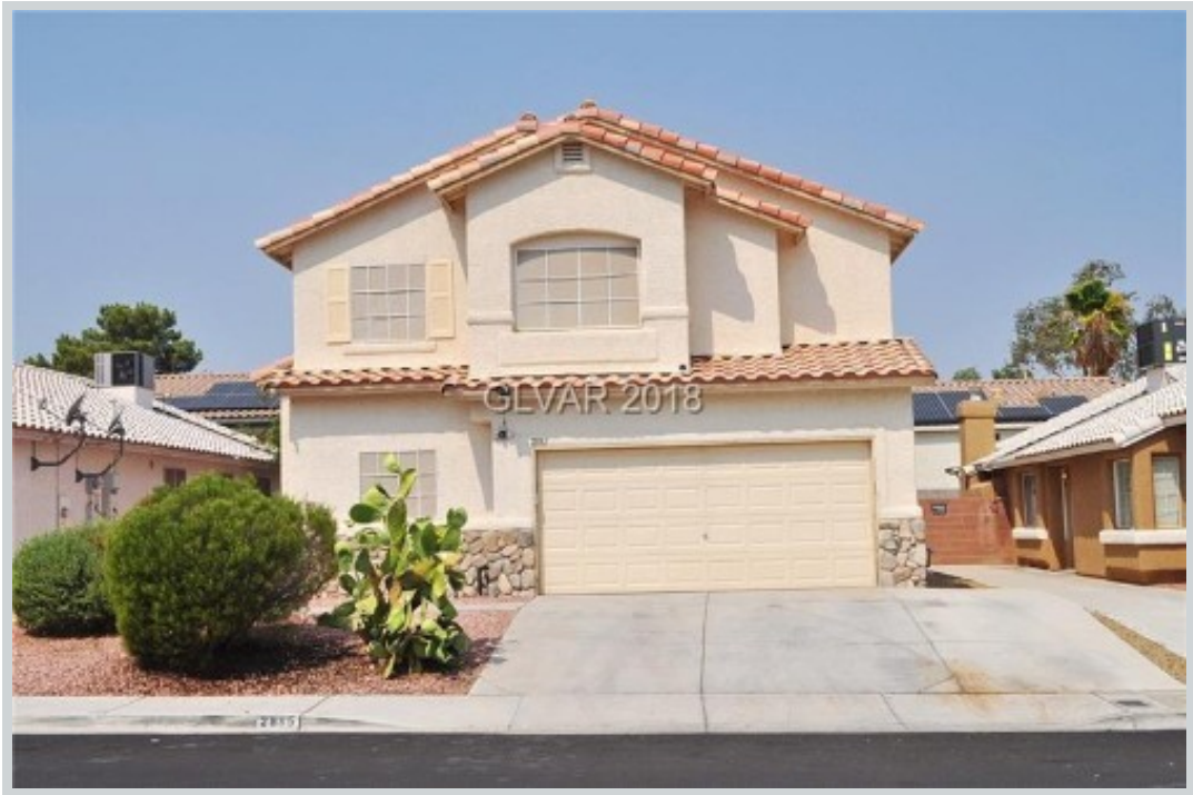
Sold Comp 3 2885 Galena Peak Ln