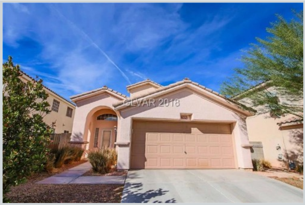
Listing Comp 2 3039 American Fork Pl