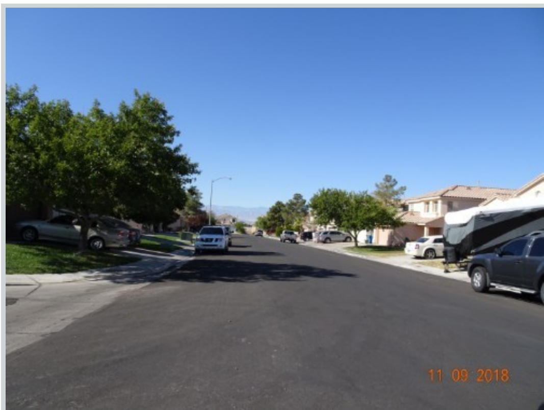
Subject 6535 Jordan River Dr

Address 6535 Jordan River Drive, Las Vegas, NV 89156 Loan Number 36516 Suggested List $242,000 Suggested Repaired $242,000 Sale $237,000