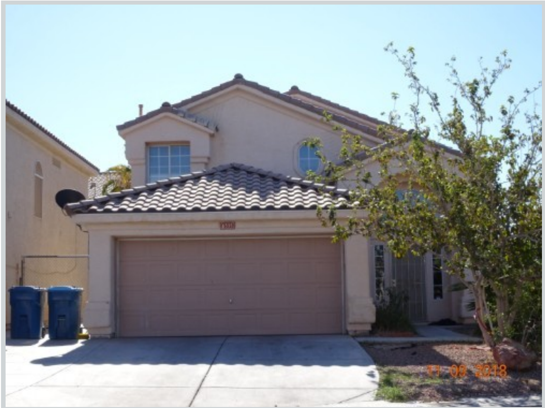
Subject 6535 Jordan River Dr