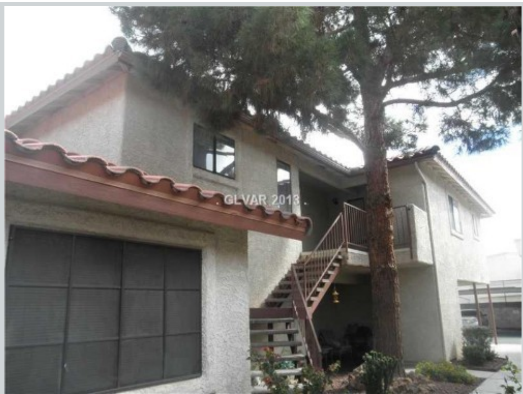
Sold Comp 1 2015175