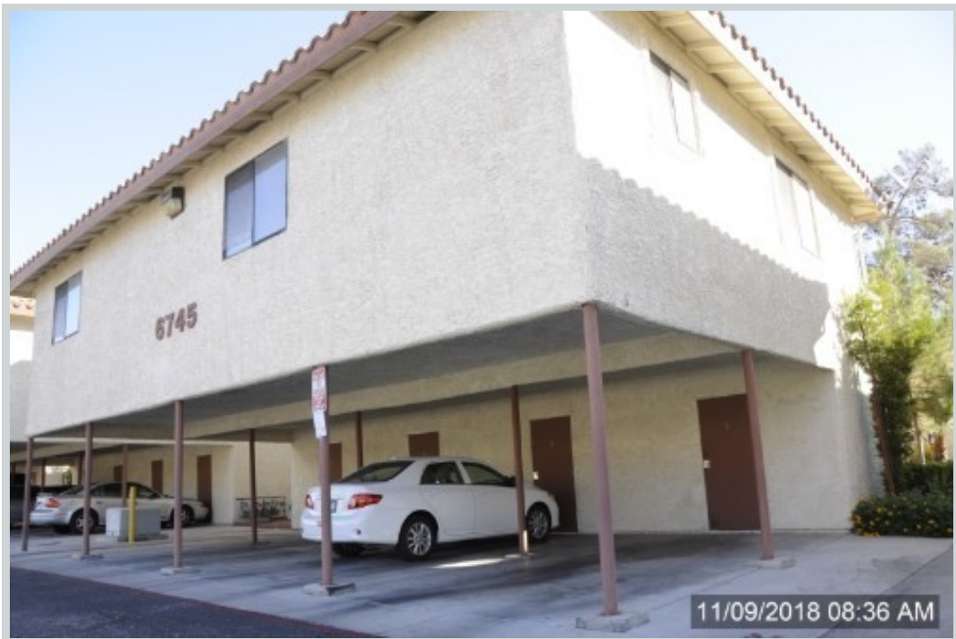
Subject 6745 W Charleston Blvd Apt 3 View Side Comment "View Two"

Address 6745 W Charleston Boulevard 3, Las Vegas, NV 89146 Loan Number 36518 Suggested List $129,000 Suggested Repaired $129,000 Sale $123,000