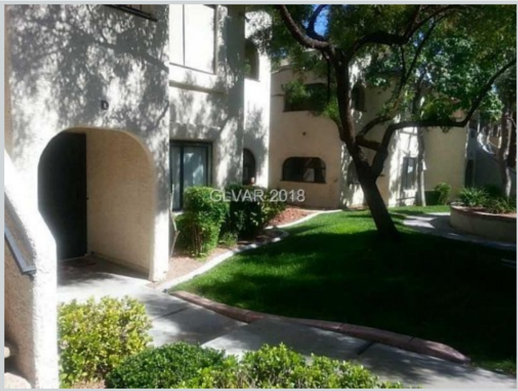
Listing Comp 3 1977843