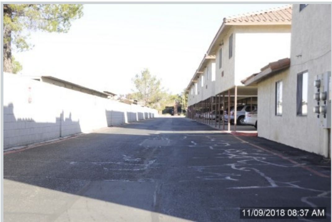
Subject 6745 W Charleston Blvd Apt 3 View Street