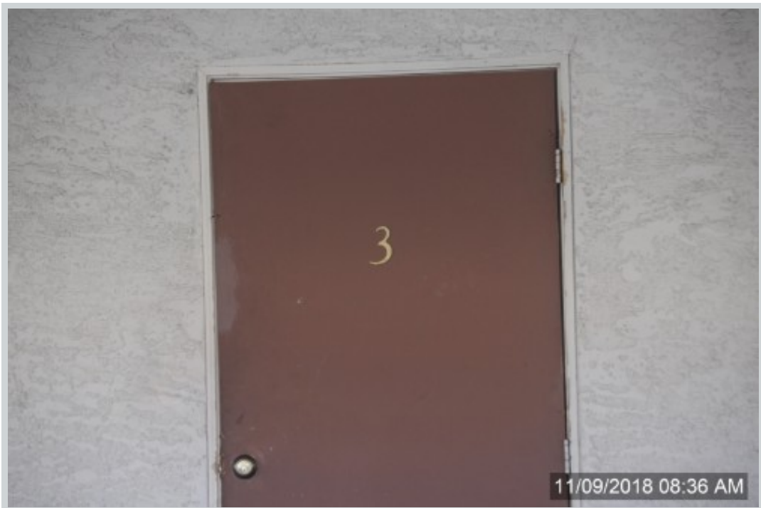
Subject 6745 W Charleston Blvd Apt 3 View Address Verification Comment "Unit Number"

Address 6745 W Charleston Boulevard 3, Las Vegas, NV 89146 Loan Number 36518 Suggested List $129,000 Suggested Repaired $129,000 Sale $123,000