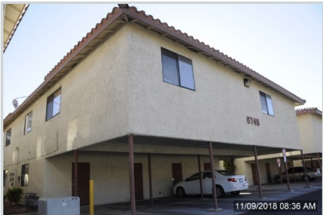
Subject 6745 W Charleston Blvd Apt 3 View Side Comment "View One"