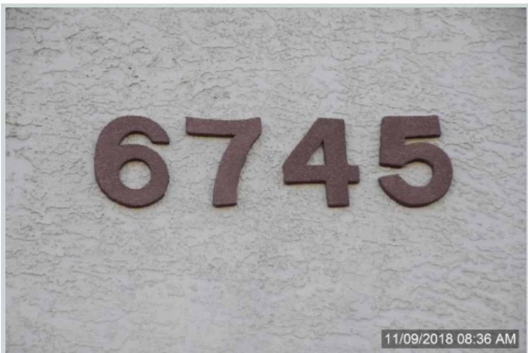
Subject 6745 W Charleston Blvd Apt 3 View Address Verification Comment "Main Address"