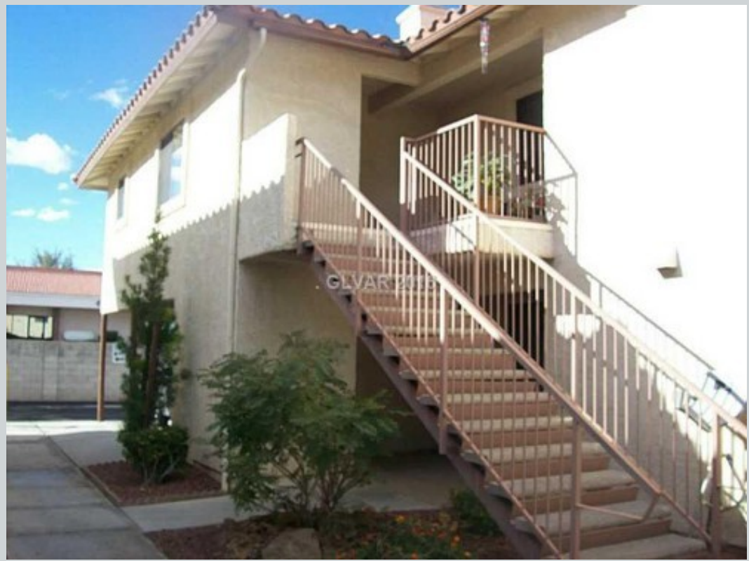
Listing Comp 1 2023626