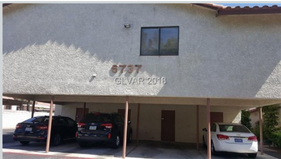
Sold Comp 3 2010089