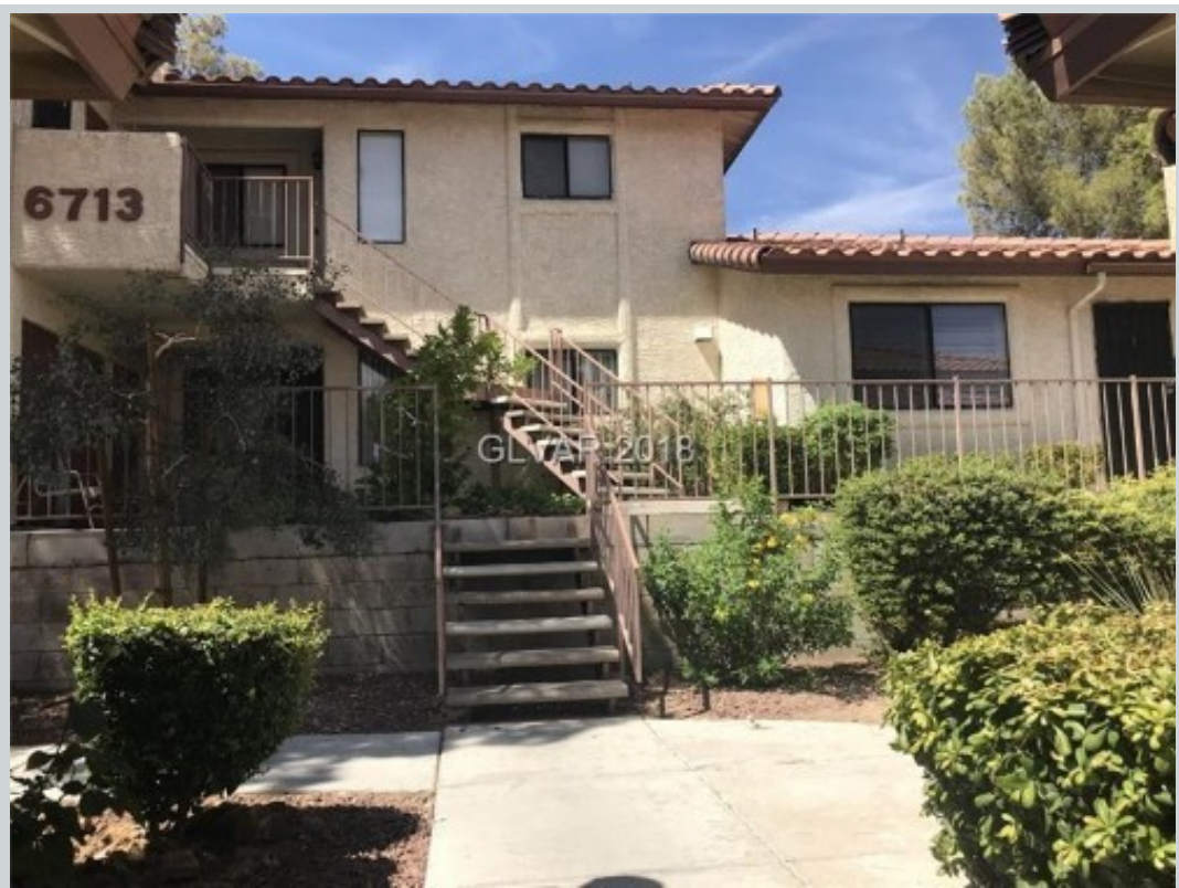
Listing Comp 2 2019780