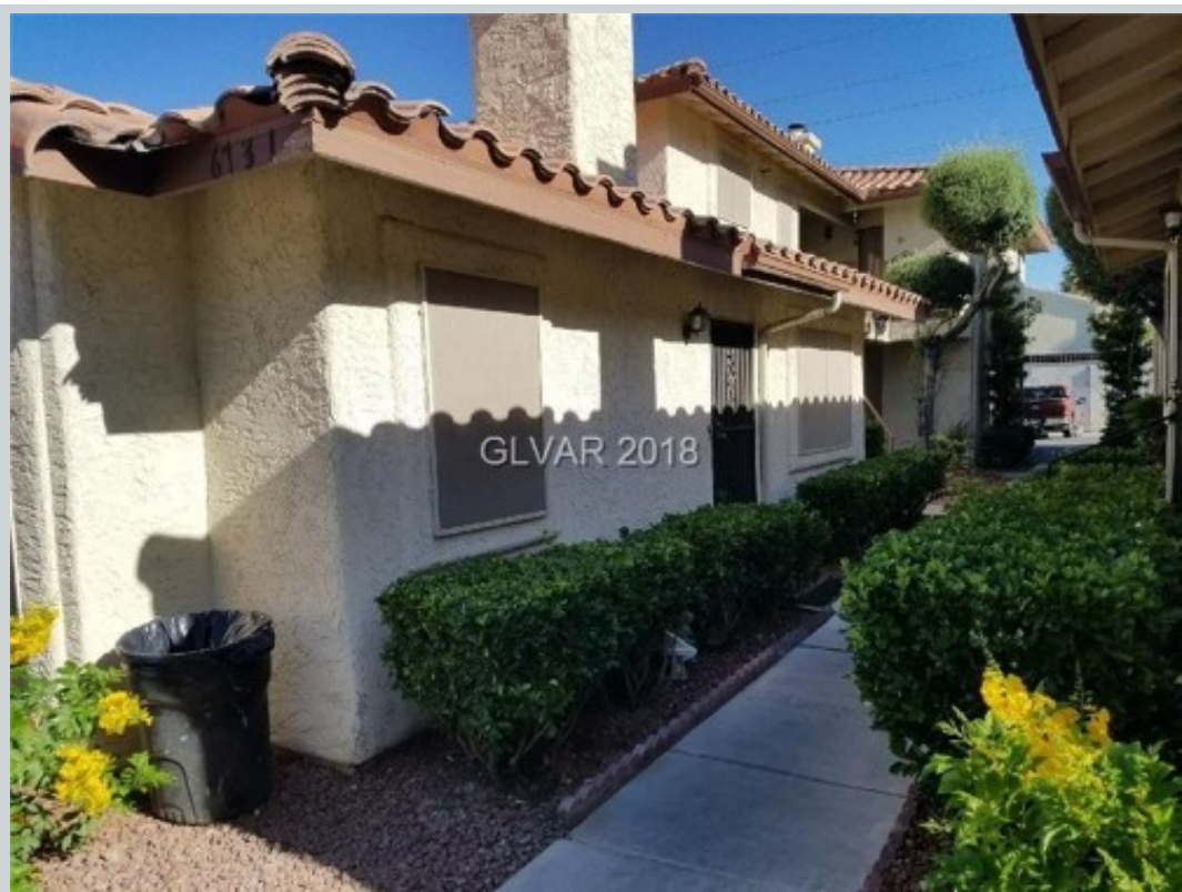
Sold Comp 2 2006577

Address 6745 W Charleston Boulevard 3, Las Vegas, NV 89146 Loan Number 36518 Suggested List $129,000 Suggested Repaired $129,000 Sale $123,000