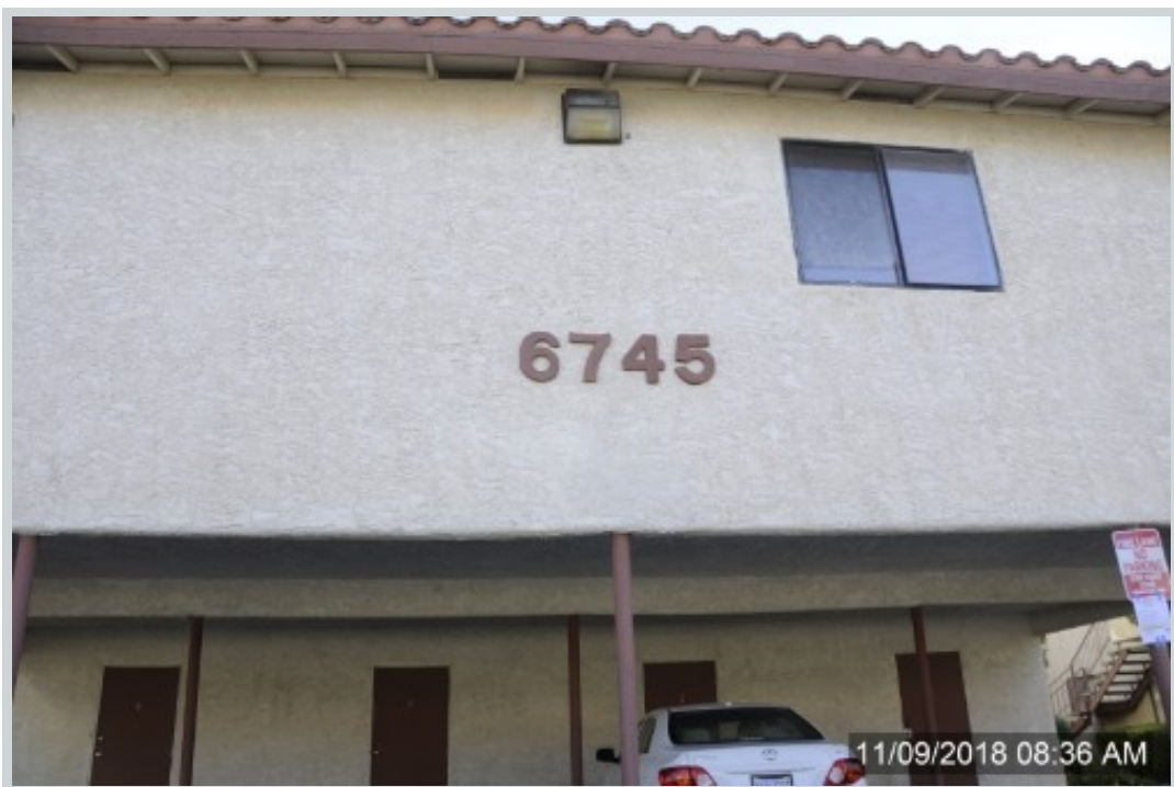
Subject 6745 W Charleston Blvd Apt 3 View Front

Address 6745 W Charleston Boulevard 3, Las Vegas, NV 89146 Loan Number 36518 Suggested List $129,000 Suggested Repaired $129,000 Sale $123,000