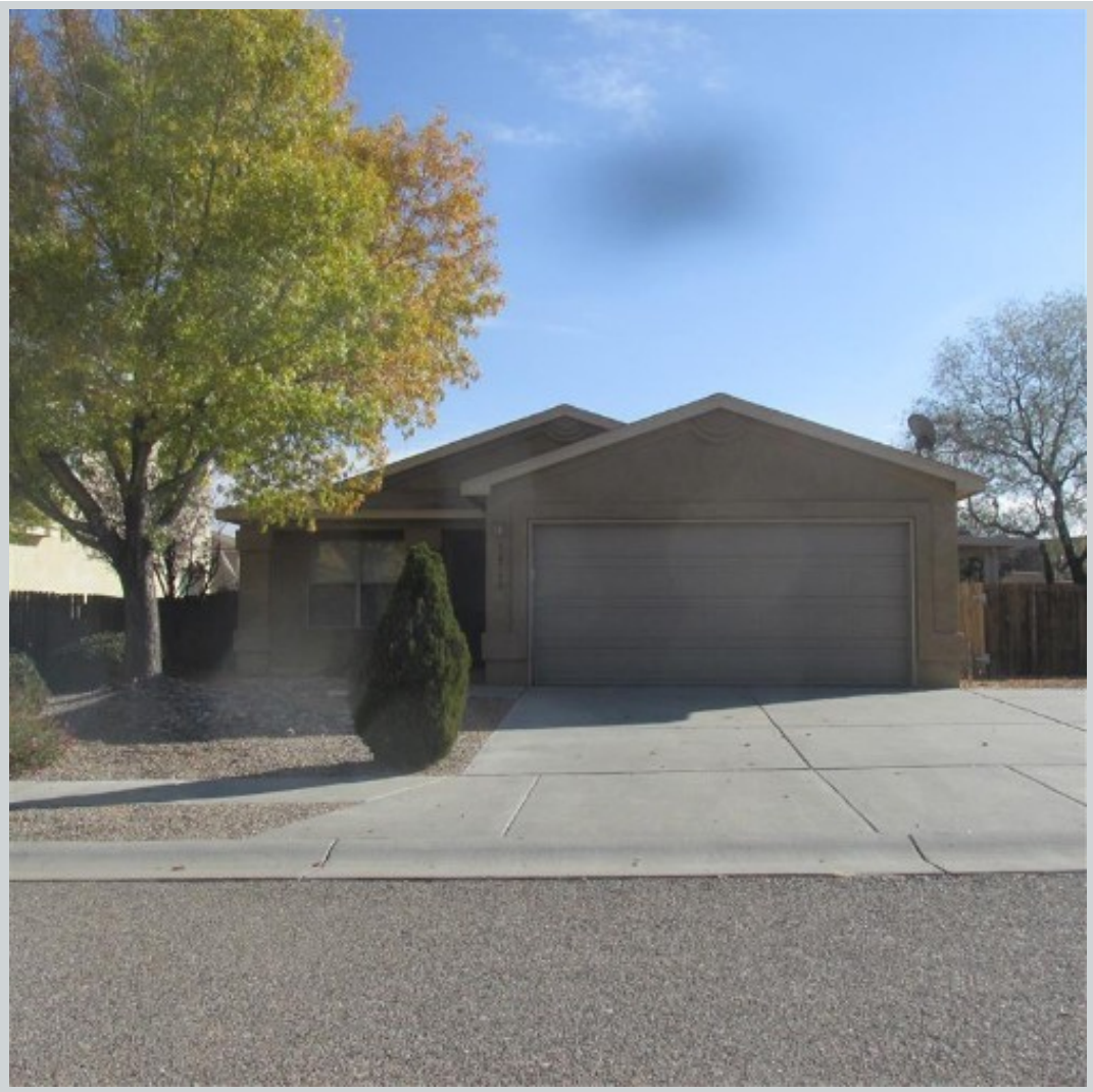
Subject 10730 Stone Hedge Ct Nw