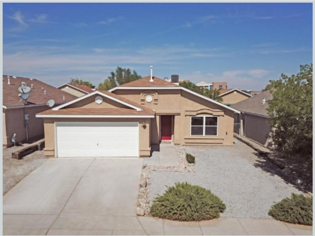
Listing Comp 3 5601 Summer Ridge Rd