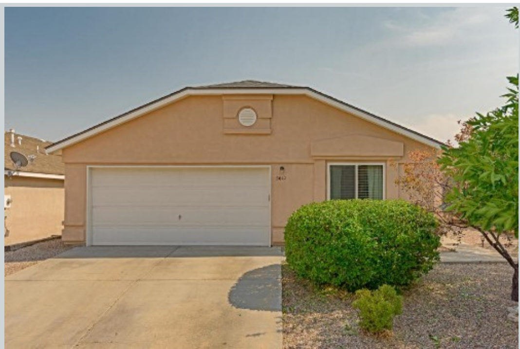
Sold Comp 2 5612 Mesa Ridge Rd