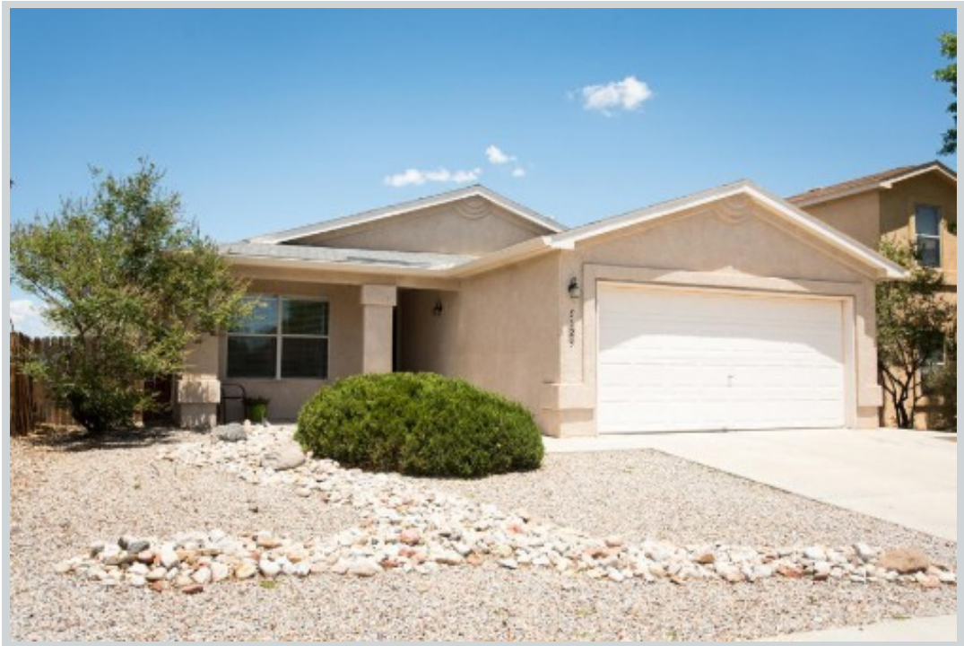
Sold Comp 3 5323 Fossil Ridge Pl