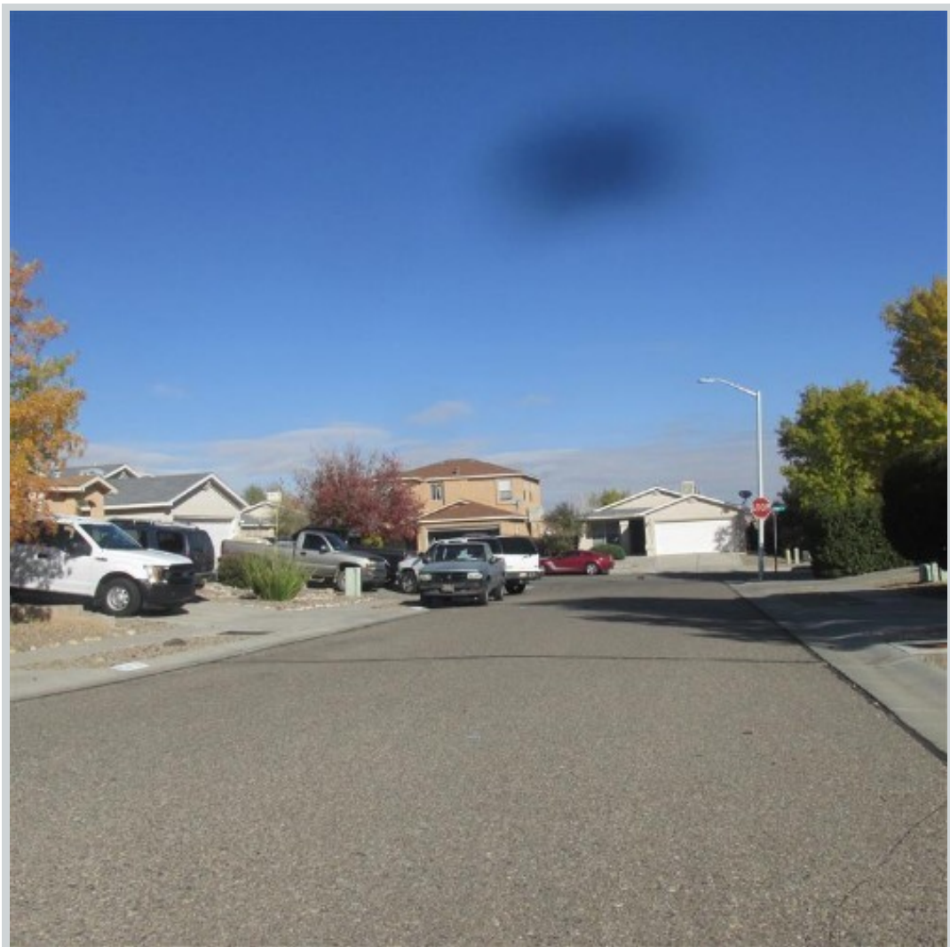
Subject 10730 Stone Hedge Ct Nw

Address 10730 Stone Hedge Court Nw, Albuquerque, NM 87114 Loan Number 36527 Suggested List $180,000 Suggested Repaired $180,000 Sale $177,000