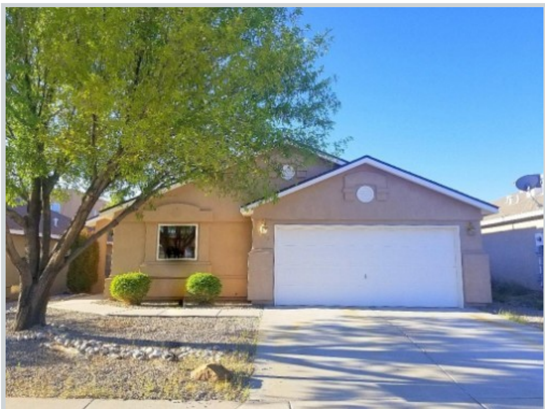
Listing Comp 1 5500 Summer Ridge Rd