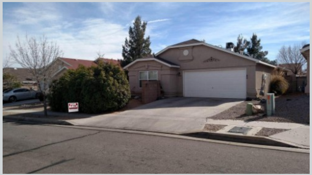
Listing Comp 2 5408 Crown Ridge Rd