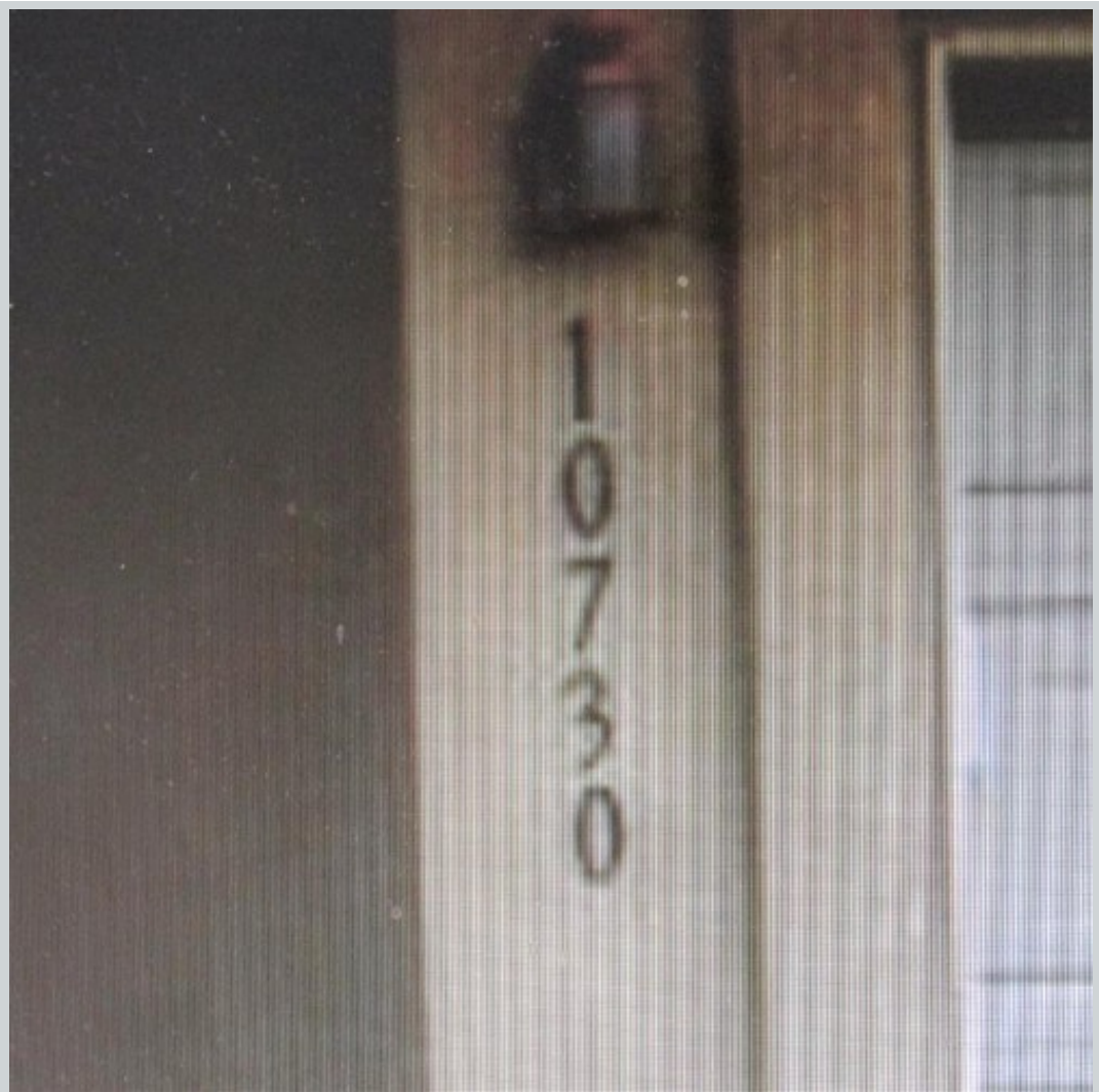
Subject 10730 Stone Hedge Ct Nw