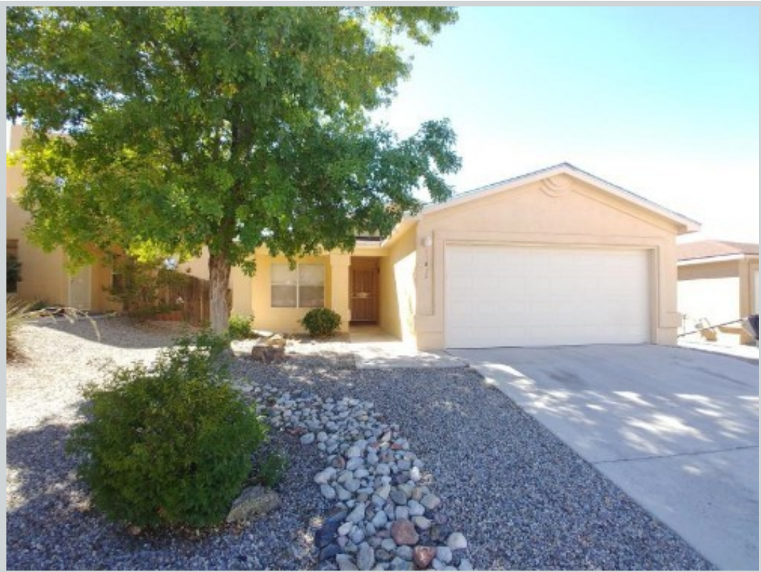
Sold Comp 1 11015 Stonebrook Pl